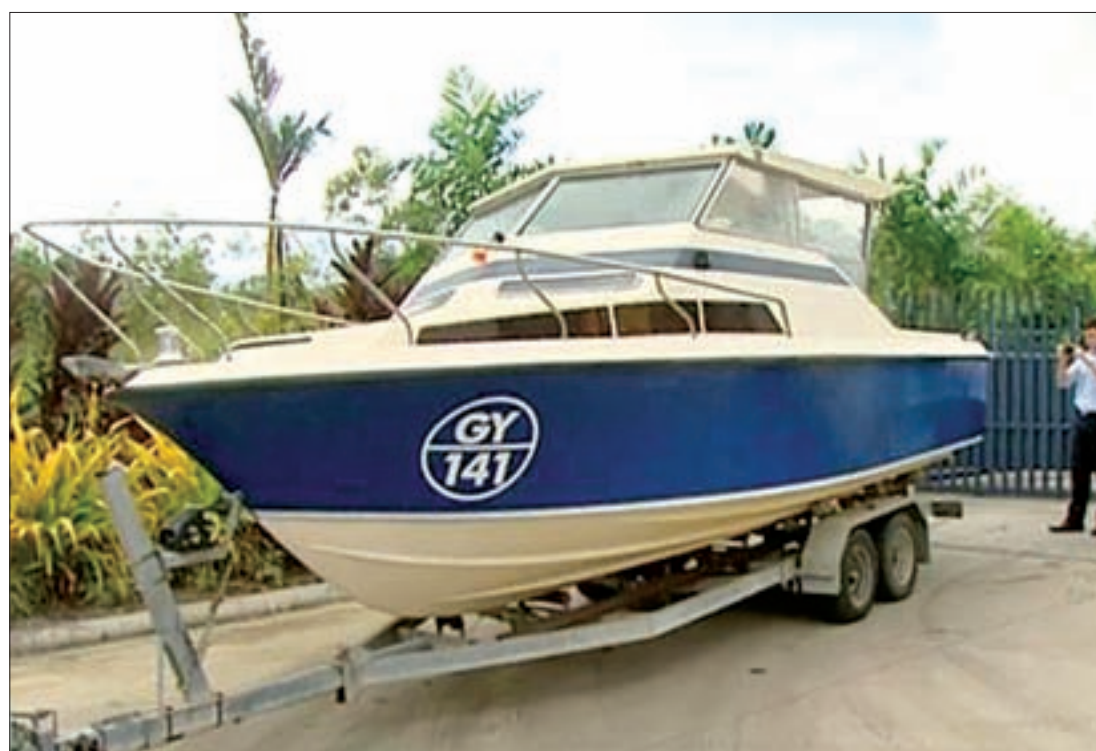
An officer takes pictures of a boat, which Australian police have seized in Cairns, Queensland, Australia in this still image taken from video, on 11 May 2016.

SYDNEY — Australian police have detained five men suspected of planning to sail a small boat from the far north to Indonesia and the Philippines en route to joining Islamic State in Syria, officials said on Wednesday.