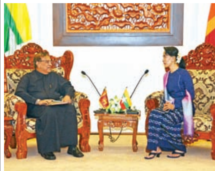
Union Minister Daw Aung San Suu Kyi holds talks with Mr Karu Jayasuriya, Speaker of the Parliament of the Democratic Socialist Republic of Sri Lanka in Nay Pyi Taw.

During the meeting, they discussed and shared the experiences of democratic transitional process as well as the enhancement of bilateral relations and cooperation between Myanmar and Sri Lanka in a cordial manner.— GNLM