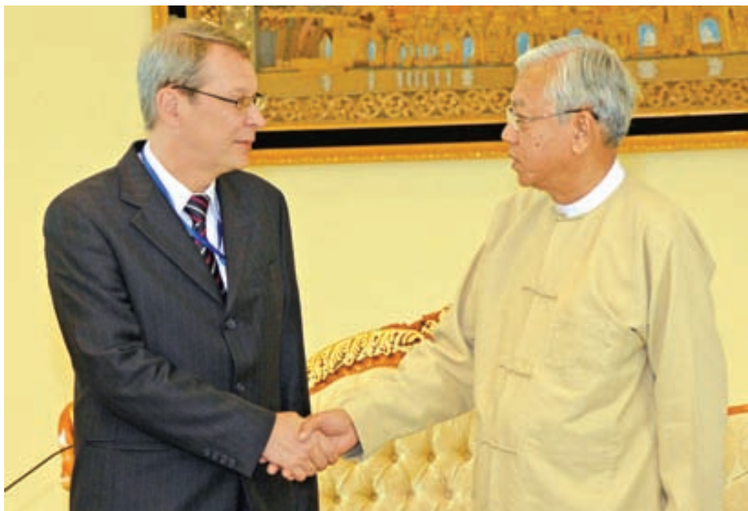
President U Htin Kyaw shakes hands with Mr. Vasily B. Pospelov.

PRESIDENT U Htin Kyaw received the Russian Ambassador to Myanmar Mr. Vasily B. Pospelov who had completed his tour of duty in Myanmar at Credentials Hall of the President House in Nay Pyi Taw yesterday.