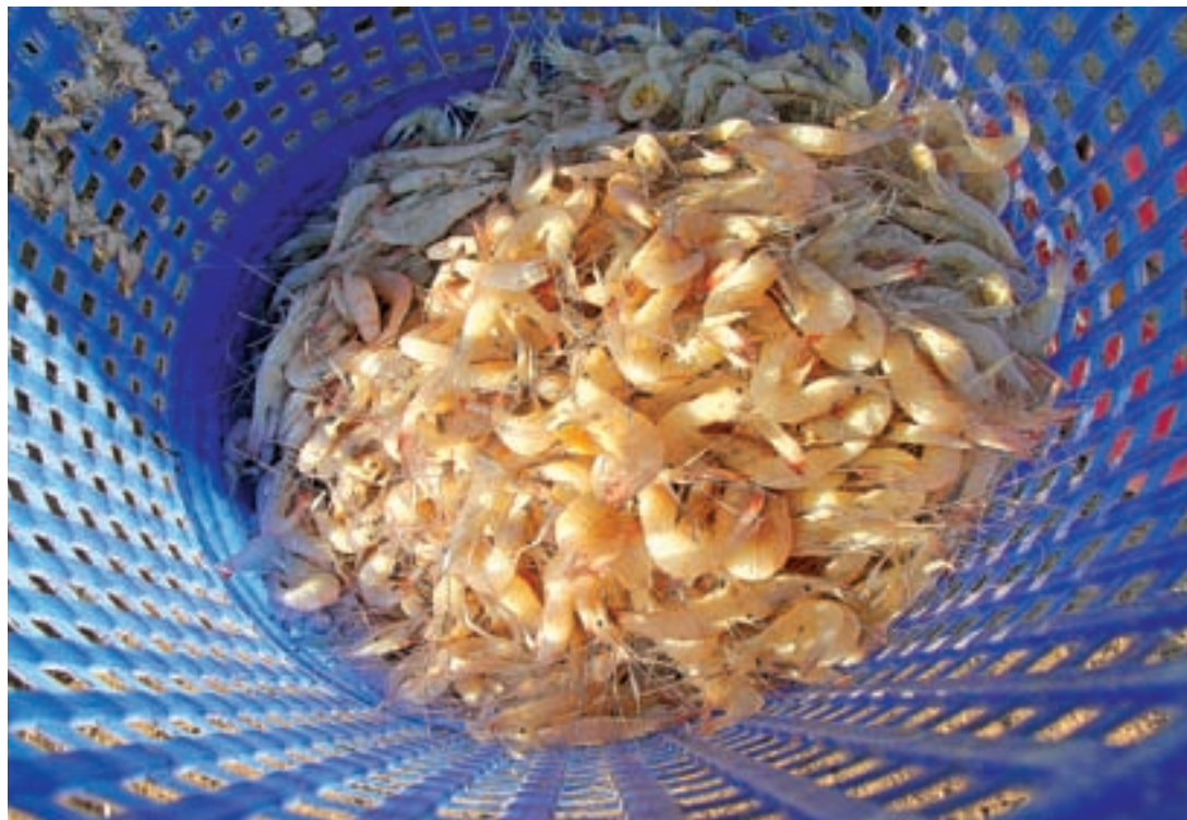
Shrimps are seen in a basket at a farm near Yangon.

“The government needs to intervene in shrimp breeding. We cannot extend our businesses without government subsidy. The freshwater prawn needs to be a priority”, said U Tun Aye, the