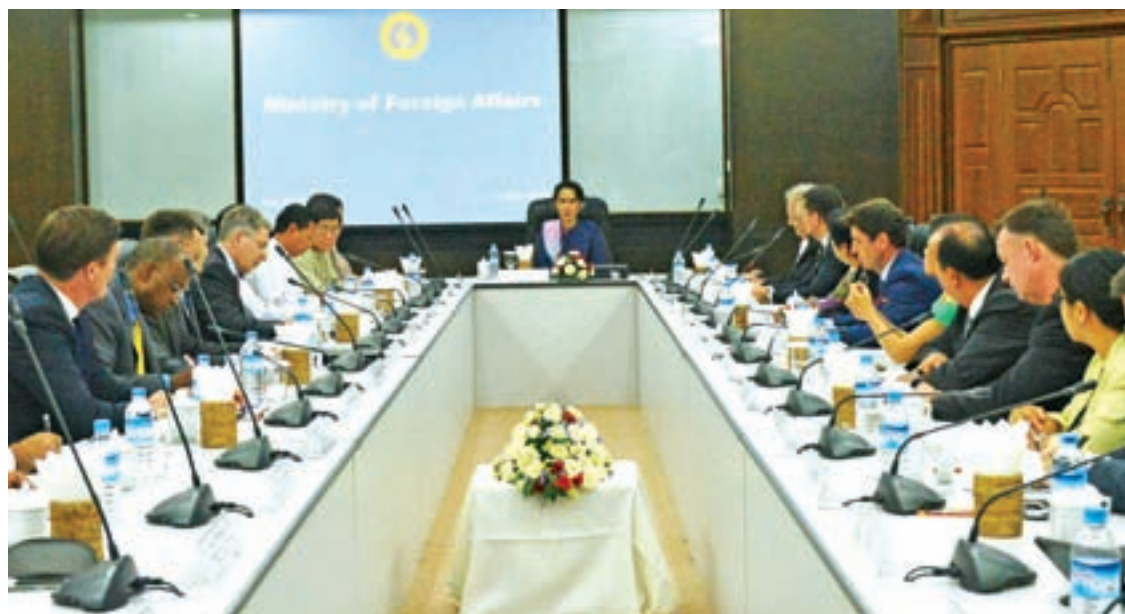
Union Minister Daw Aung San Suu Kyi holds a meeting with Heads of the United Nations agencies and other international organizations in Yangon.