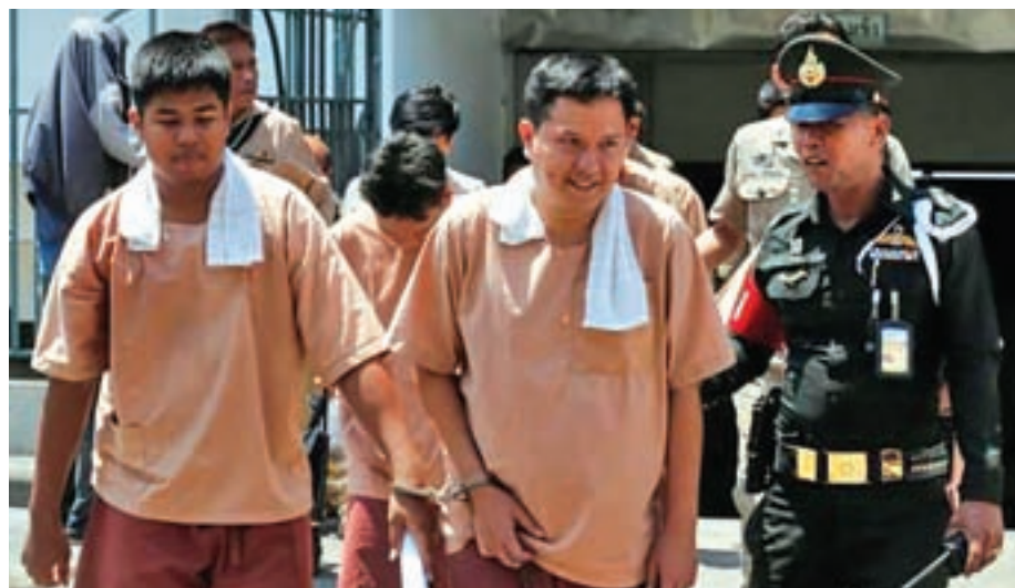
Activists who were detained after posting critical comments on Facebook of the ruling military junta, leave the military court in Bangkok, Thailand on 10 May.

More than a decade of political strife has seen at times violent street protests by both Thaksin's supporters and their opponents. —Reuters