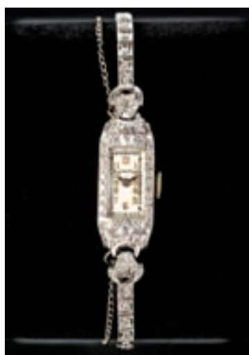
A platinum diamond Blancpain watch owned by actress Marilyn Monroe which is estimated to fetch between $80,000 and $120,000 is seen at an auction in Los Angeles, on 10 May 2016.