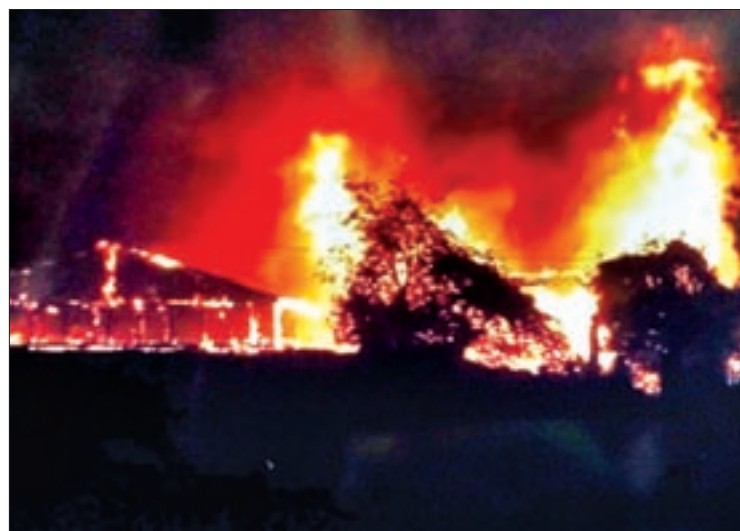
Fire devouring houses in Amarapura.

AN outbreak of fire caused by electric short circuiting destroyed a warehouse and four houses in Hmantan ward, Amarapura town, Mandalay region on Tuesday.