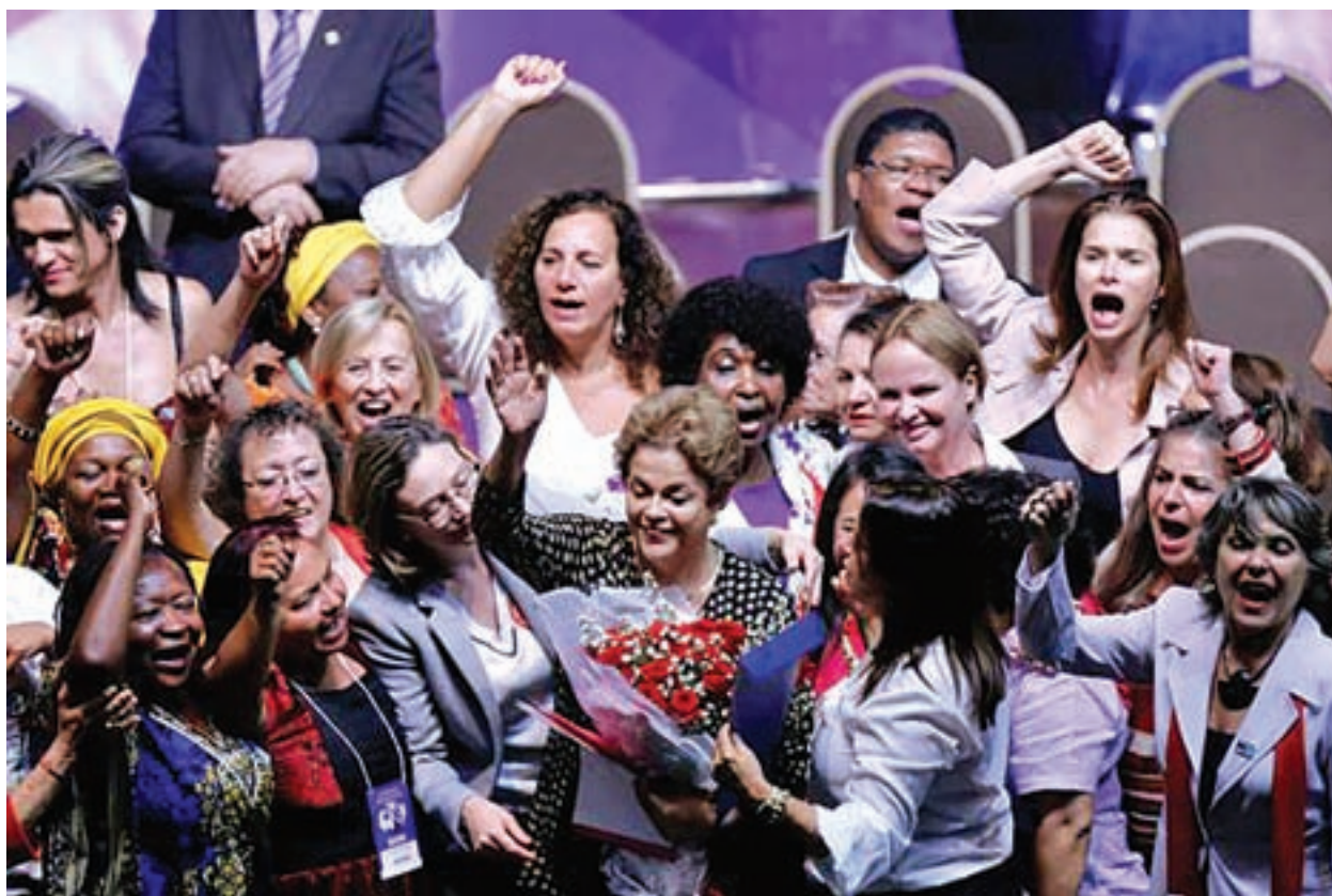
Brazil's President Dilma Rousseff (C) greets supporters during the opening ceremony of the National Policy Conference for Women in Brasilia, Brazil, on 10 May 2016.

Senators are due to start discussion of the motion at 9 am (1200 GMT) after each member of the upper house gets the chance to speak. The final vote is expected to take