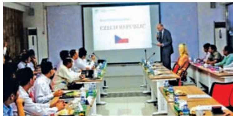
Czech Ambassador speaking at the meeting.

sagyo townships in Magwe Region, took part in rebuilding damaged houses hit by strong wind, hailstones and heavy rain, and they cleaned fallen trees that blocked roads in those areas.— Ye Zarni