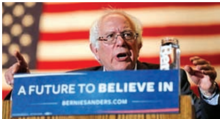
US Democratic presidential candidate Bernie Sanders holds a campaign rally in Sacramento, California United States on 9 May 2016.

WASHINGTON/NEW YORK — US Democratic presidential candidate Bernie Sanders defeated Hillary Clinton on Tuesday in West Virginia's primary, winning over voters deeply skeptical about the economy and signaling the difficulty Clinton may have in industrial states in the general election.