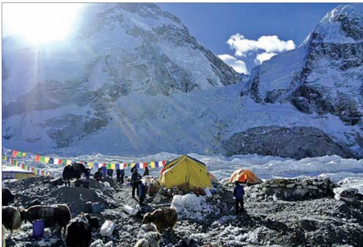
Sherpas spend time near their tents on Mount Everest in April 2014.

remains a challenge though this year's campaign has been free of incident.