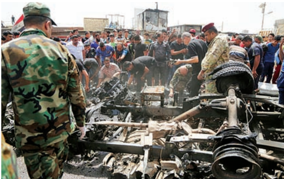
People gather at the scene of a car bomb attack in Baghdad's mainly Shi'ite district of Sadr City, Iraq, on 11 May 2016. PHOTO: REUTERS

Sectarian violence also threatens to undermine US-backed efforts to dislodge the militant group from vast areas of the north and west of Iraq that they seized in 2014.— Reuters