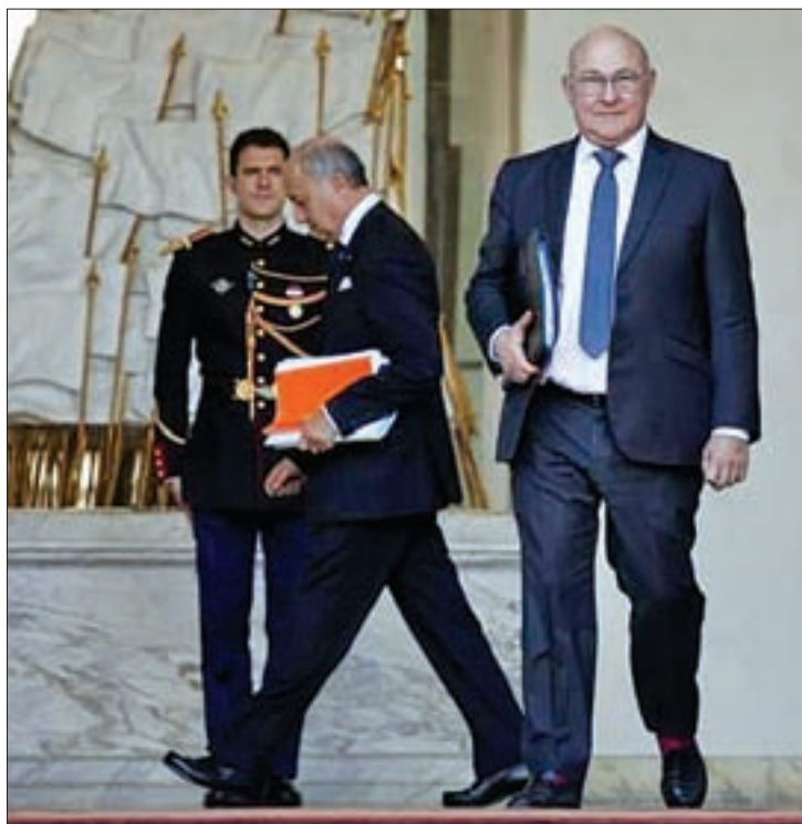
French Finance Minister Michel Sapin (R) and Foreign Affairs Minister Laurent Fabius leave the Elysee Palace following the weekly cabinet meeting in Paris, France, on 3 February 2016. PHOTO: REUTERS

Five years ago, when a sex scandal forced Frenchman Dominique Strauss-Kahn to resign from his post of IMF chief, the case unleashed a soul-searching debate within France about sexual abuse that goes undeclared or undetected in the upper echelons of power.—Reuters