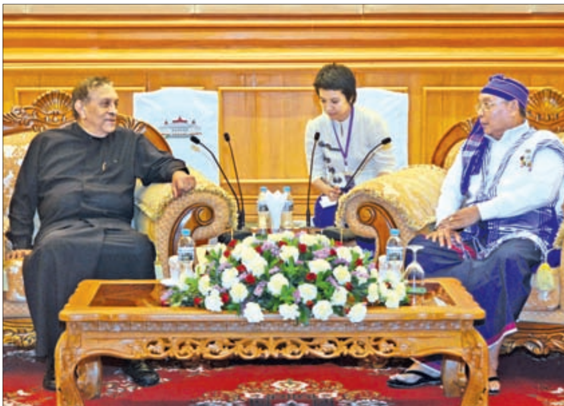
Speaker Mahn Win Khaing Than receives Mr Karu Jayasuriya, Speaker of the Parliament of the Democratic Socialist Republic of Sri Lanka.

Mr Karu Jayasuriya also spoke on the political reforms in Sri Lanka since 2015 and preparations for amending the country's constitution.