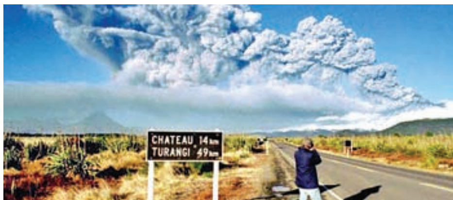
A tourist takes pictures of Mount Ruapehu as it erupts on June 18, 1996 in Tongariro National Park on the central North Island of New Zealand. PHOTO: REUTERS

The landscape formed the backdrop for Mordor's hissing wasteland in Peter Jackson's "The Lord of the Rings" trilogy.—Reuters