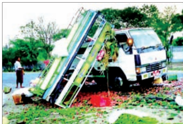
Damaged car being seen.

A 22-wheel vehicle collided with a second vehicle between mileposts 279/0 and 279/1 on the Yangon-Mandalay Highway in Tatkon town, Nay Pyi Taw on Tuesday, leaving one dead.