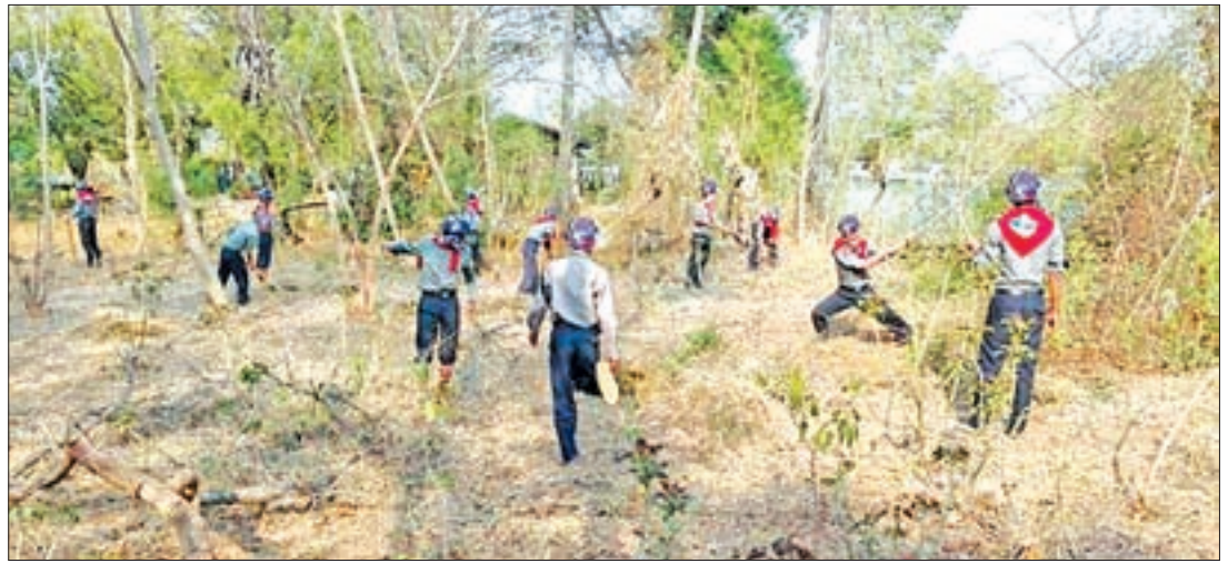
Policemen remove trees knocked down by heavy wind, rain and hail.

MANY parts of the country have been hit by natural disasters brought about by the El Niño front over the last few months.