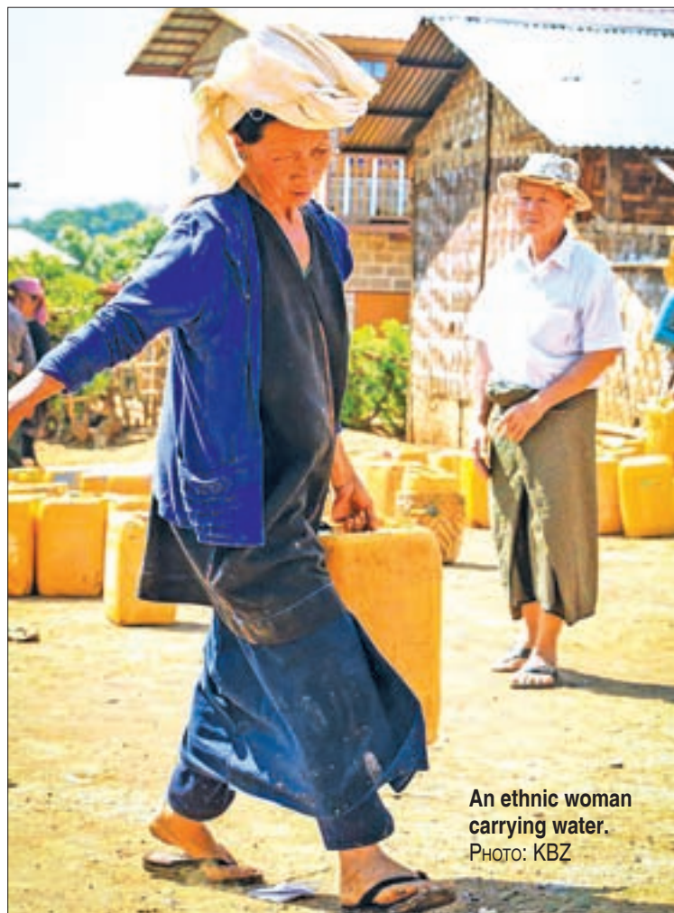
An ethnic woman carrying water.

TO supply fresh water to people facing a scarcity of drinking water due to drought induced by El Nino, KBZ's Brighter Future Myanmar Foundation is sending its fleet of water tankers to areas in southern Shan State, Sagaing and Twantay daily. On Monday the foundation's fleet moved 2800 to 3600 gallon water tankers which were sent out to several villagers around Taunggyi to supply water to the people there.