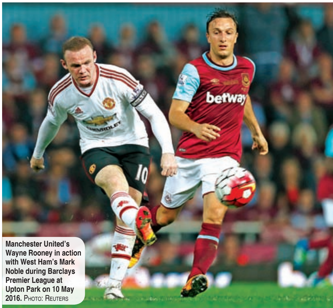
Manchester United's Wayne Rooney in action with West Ham's Mark Noble during Barclays Premier League at Upton Park on 10 May 2016.

"I think the police and officials have been kind, I would make them kick off at 7:45 if it was up to me. Manchester United know the score, they should have been here at four o'clock," he said. London's Metropolitan Police said in a statement that one officer and a member of the public sustained minor injuries, but no arrests had been made.