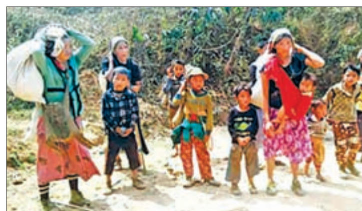
Displaced war victims in northern Shan State.

A FUNDRAISING show titled 'Stop the War' was held at the Myanmar Convention Centre in Yangon on Thursday, with a wide range of entertainment programmes performed by local celebrities and ethnic minority groups.