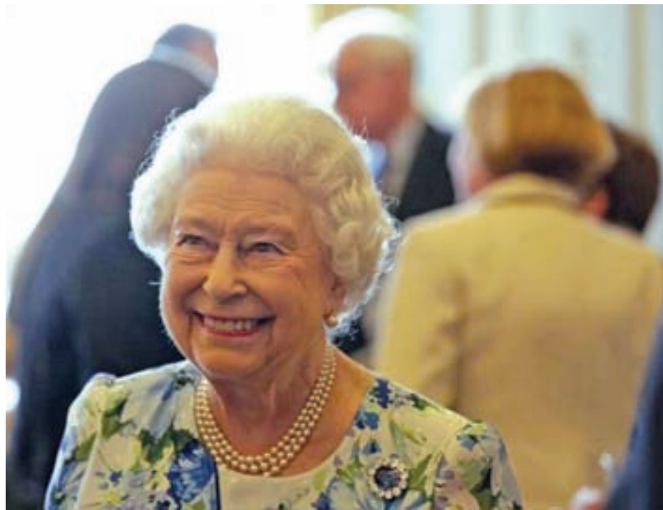
Britain's Queen Elizabeth smiles during a reception with parliamentarians to mark the Queen's 90th birthday at Buckingham Palace in London, Britain on 10 May.

The Chinese authorities often censor items they object to from foreign news