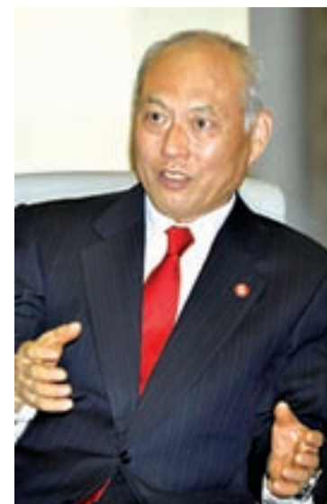
Tokyo Gov. Yoichi Masuzoe.

A week-long visit to Paris and London by a Masuzoe-led delegation last autumn as part of the preparations for the 2020 Tokyo Olympics cost some 50 million yen, enough to buy a new condominium in central Tokyo. —Kyodo News