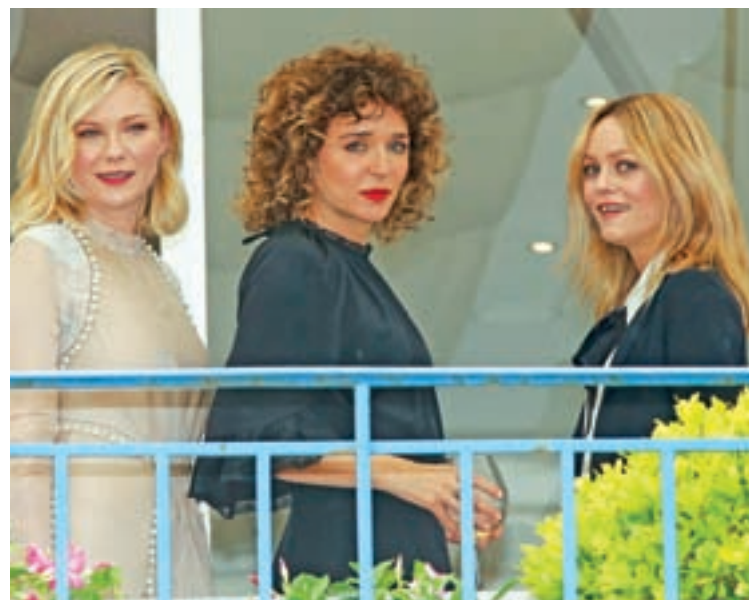
Jury members actress Kirsten Dunst (L), actress Valeria Golino (C) and actress and singer Vanessa Paradis stand on the terrace at the Grand Hyatt Cannes Hotel Martinez on the eve of the opening of the 69 th Cannes Film Festival in Cannes, France, on 10 May 2016.