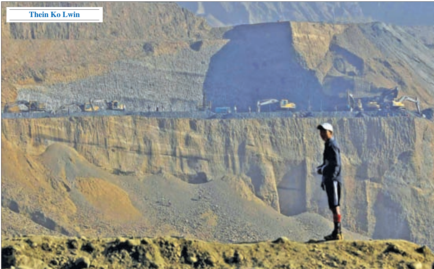
A miner searches for discarded jade stones at a mine dump in Hpakant, Kachin State.

NEW laws will soon be enacted to restrict jade production within the Lonekhin and Hpakant mining blocks in Kachin State, said Union Minister for Natural