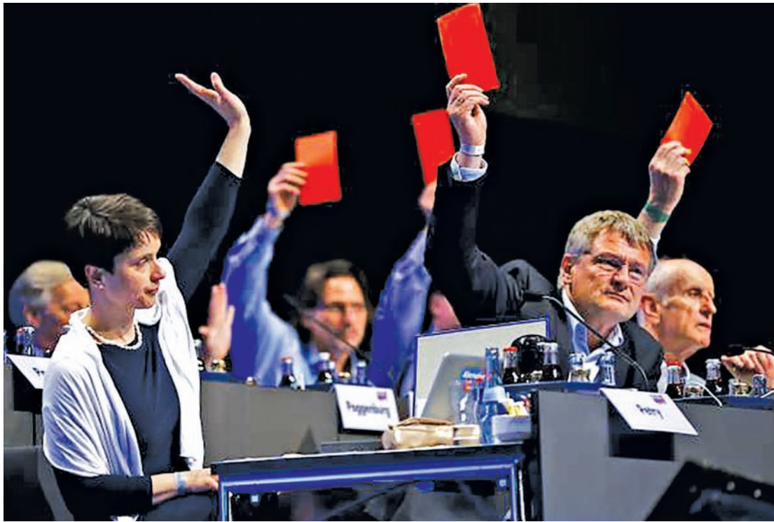
Frauke Petry (L), chairwoman of the anti-immigration party Alternative for Germany (AfD) votes during the second day of the AfD congress in Stuttgart, Germany, on 1 May.

STUTTGART, (Germany) — Members of the anti-immigration party Alternative for Germany (AfD) on Sunday backed an election manifesto that says Islam is not compatible with the constitution and calls for a ban on minarets and the burqa.