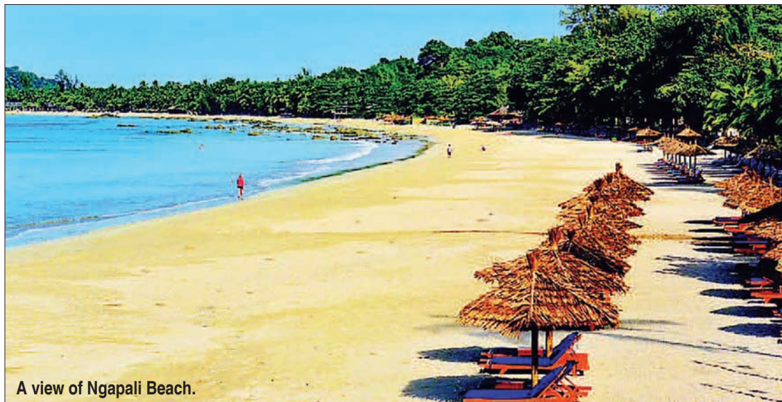
A view of Ngapali Beach.

"ALTHOUGH Ngapali beach has received an increase in domestic visitors, the growth is slower than in Chaungtha and Ngwe Saung beaches," a businessman said.