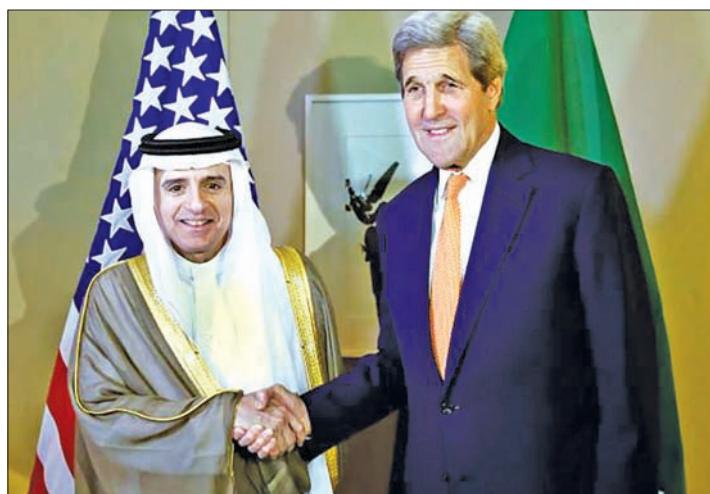
Saudi Foreign Minister Adel al-Jubeir shakes hand with US Secretary of State John Kerry during a meeting on Syria in Geneva, Switzerland, on 2 May.

"We're getting closer to a place of understanding, but we