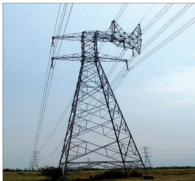
About 100 service personnel are repairing the damaged towers.

The ministry added that efforts are being made to resume power supply through the damaged towers as soon as possible with a force of about 100 service personnel from the ministry.— Myanmar News Agency