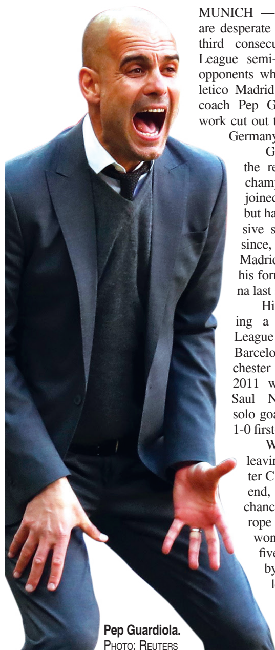
Pep Guardiola.

MUNICH — Bayern Munich are desperate to avoid losing a third consecutive Champions League semi-final to Spanish opponents when they host Atletico Madrid on Tuesday but coach Pep Guardiola has his work cut out to end his time in Germany on a high.