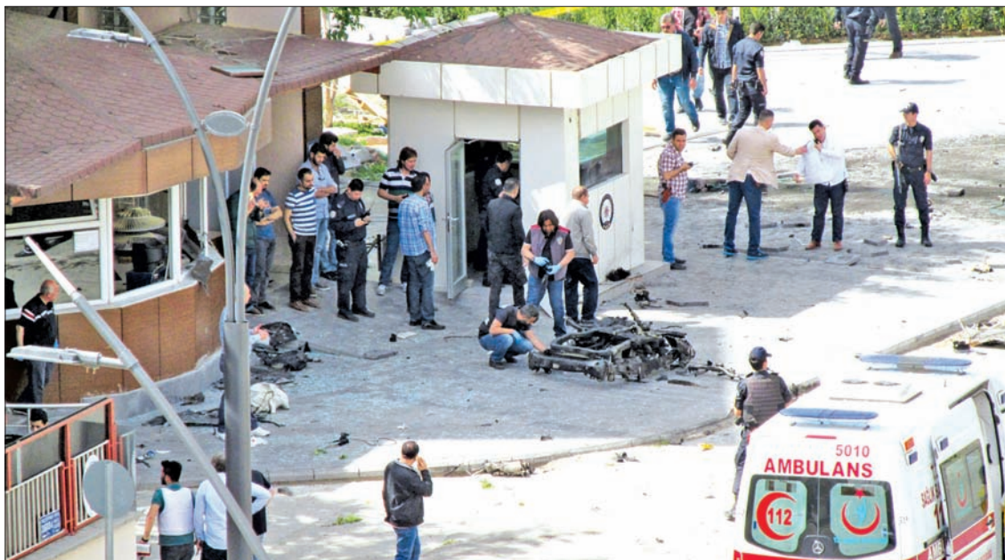
Police forensic experts inspect the scene after an explosion in front of the city's police headquarters in Gaziantep, Turkey, on 1 May.

"The father of a suspect who is believed to have carried out the attack has been detained. We have records of the suspect's links with Islamic State," a security source said.