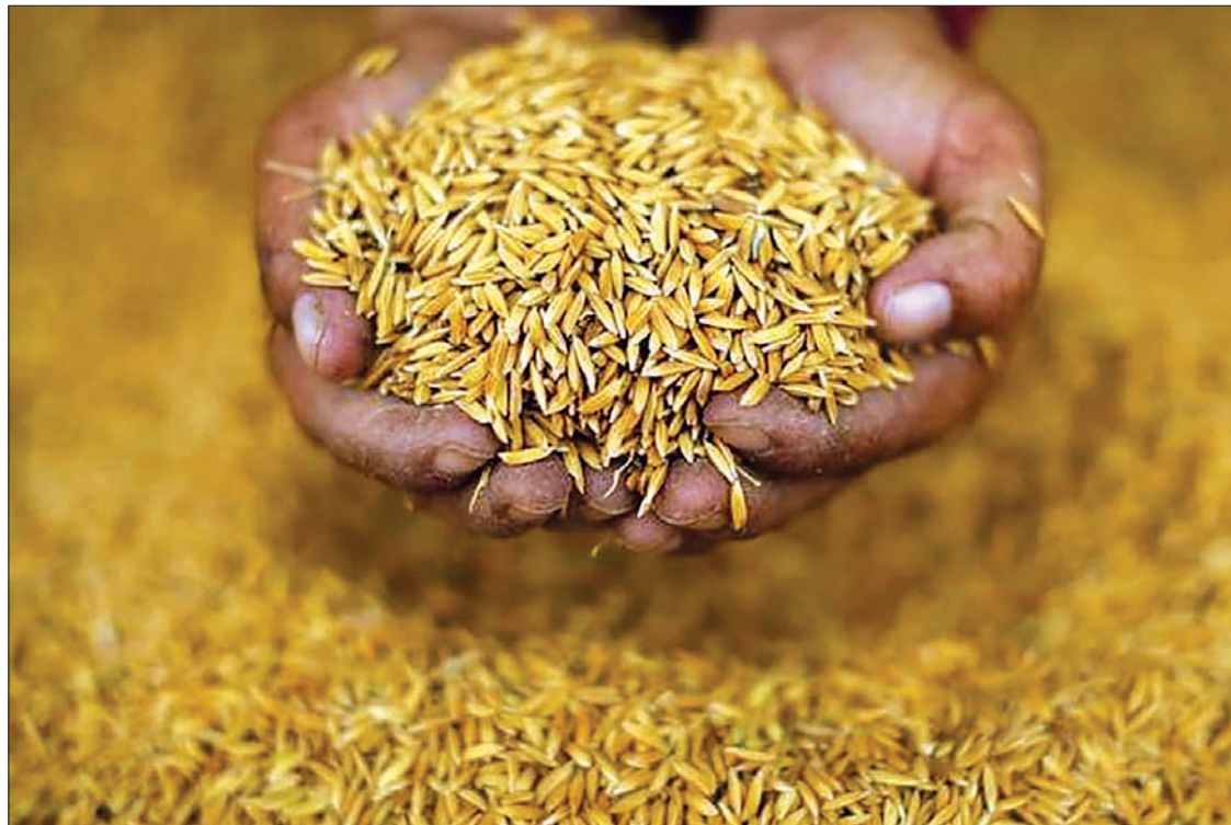
A rice mill worker holds rice fallen onto the ground in Udon Thani, Thailand, in 2015.

Rice inventories in the three top exporters are set to fall by about a third at the end of 2016