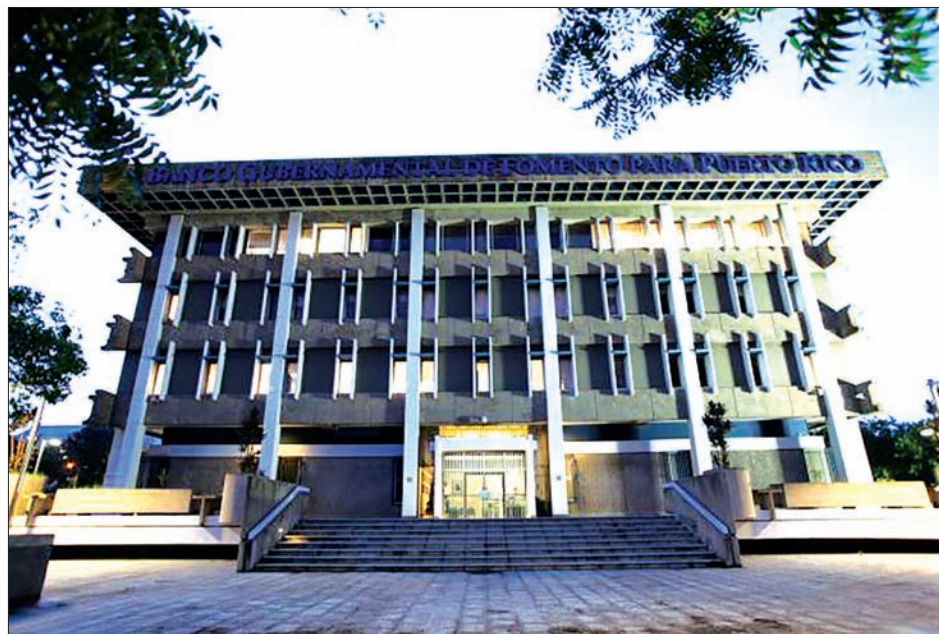
The Government Development Bank (GDB) is seen in San Juan, in 2015.

Puerto Rico, a tropical paradise in economic purgatory, faces a $70 billion debt bill it knows it cannot pay, a staggering 45 per cent poverty rate and a shrinking population as citizens flee to the mainland.