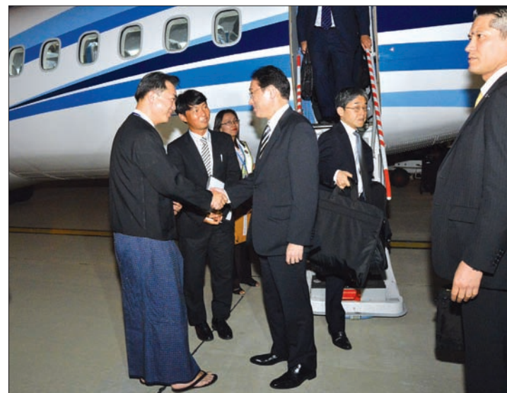
Foreign Minister Mr Fumio Kishida is welcomed by U Kyaw Zeya, Director-General of the Political Affairs Department.

port by U Kyaw Zeya, Director-General of the Political Affairs Department of the Ministry of Foreign Affairs and officials of Japanese Embassy in Yangon.— Myanmar News Agency