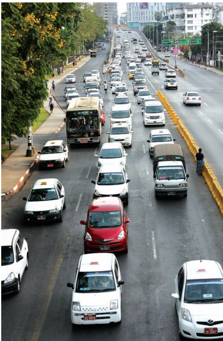
Cars are crawling on a road in Yangon.

There were a total of 772,788 cars, 4,536,570 motorcycles and 73,611 three-wheel motorcycles legally registered as of January 2016. The vehicles are allowed to drive only after registering with the Road Transportation Administration Department.