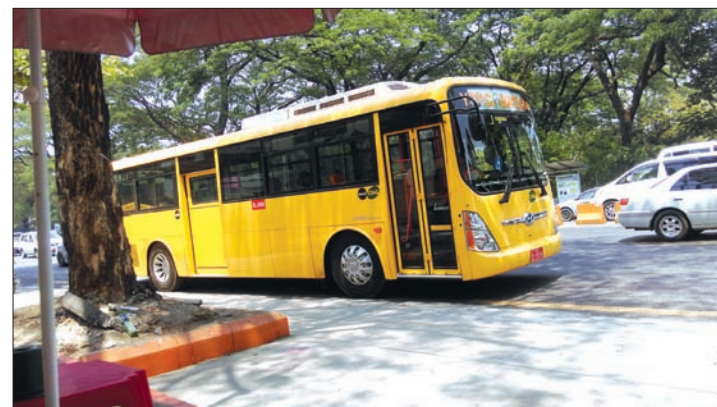
A BRT bus pauses at a bus stop near Bahan Third Street.

With a fleet of 18 buses imported from China, the company launched services along its first Bus Rapid Transfer (BRT) route on 7 February. The route has 23 stops and runs from Htaunkyant to Pyay Road and Bogyoke Aung San Road to 8 th Mile Junction via Kaba-Aye Pagoda Road. The second route has 26 stops and runs from Pyay Road to Kaba-Aye Pagoda Road, Bogyoke Aung San Road, Botahtaung Pagoda Road and Strand Road.—200