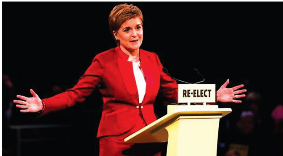
Scotland's First Minister Nicola Sturgeon launches the Scottish National Party's (SNP) manifesto for the Holyrood election, at the Edinburgh International Conference Centre, Scotland, Britain, on 20 April.

Pressed on whether a vote would come while she was first minister, she said: “I would like to think that’s the case.” “If I can’t persuade more people than we persuaded in 2014 of the case for independence then there won’t be. But if we can