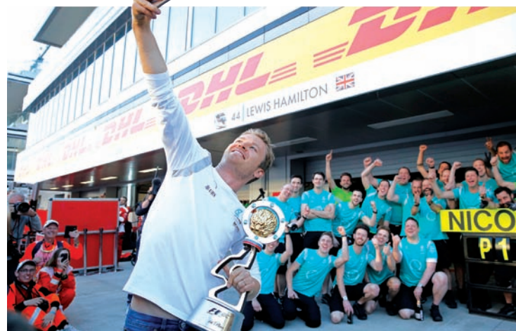
Mercedes F1 driver Nico Rosberg of Germany shoots a selfie with the trophy and the Mercedes team.

Kimi Raikkonen, who took Ferrari's 700th grand prix podium, finished third but 31 seconds behind Rosberg who had already turned down his power unit and had no need to push.—Reuters