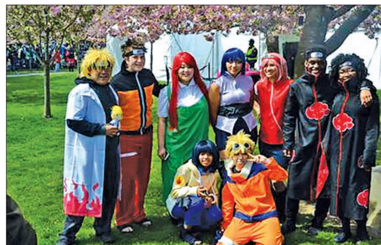
Cosplayers pose as they enjoy the annual Sakura Matsuri cherry blossom festival at the Brooklyn Botanic Garden, on 30 April.