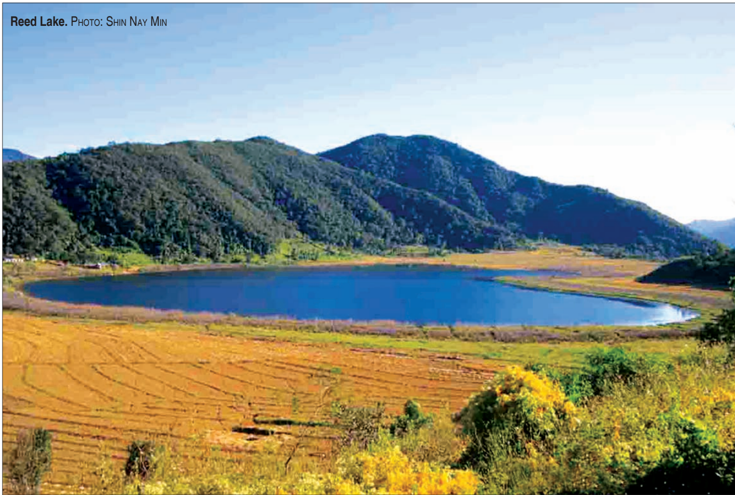
Reed Lake.