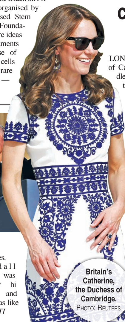
Britain's Catherine, the Duchess of Cambridge.

Kendall said, “He was like, ‘Say hi to Kim and Kanye. I was like ‘OK’.” — PTI