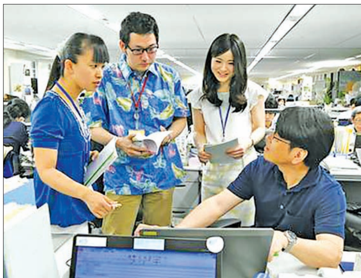
Personnel at the Environment Ministry's Global Environment Bureau work in light-casual clothing in Tokyo on May 2, 2016, as the "Cool Biz" season started on the day in Japan.

More than 200 department stores will promote the initiative by setting more moderate temperatures for air conditioners, switching off some lighting and installing light-emitting diode lights.— Kyodo News