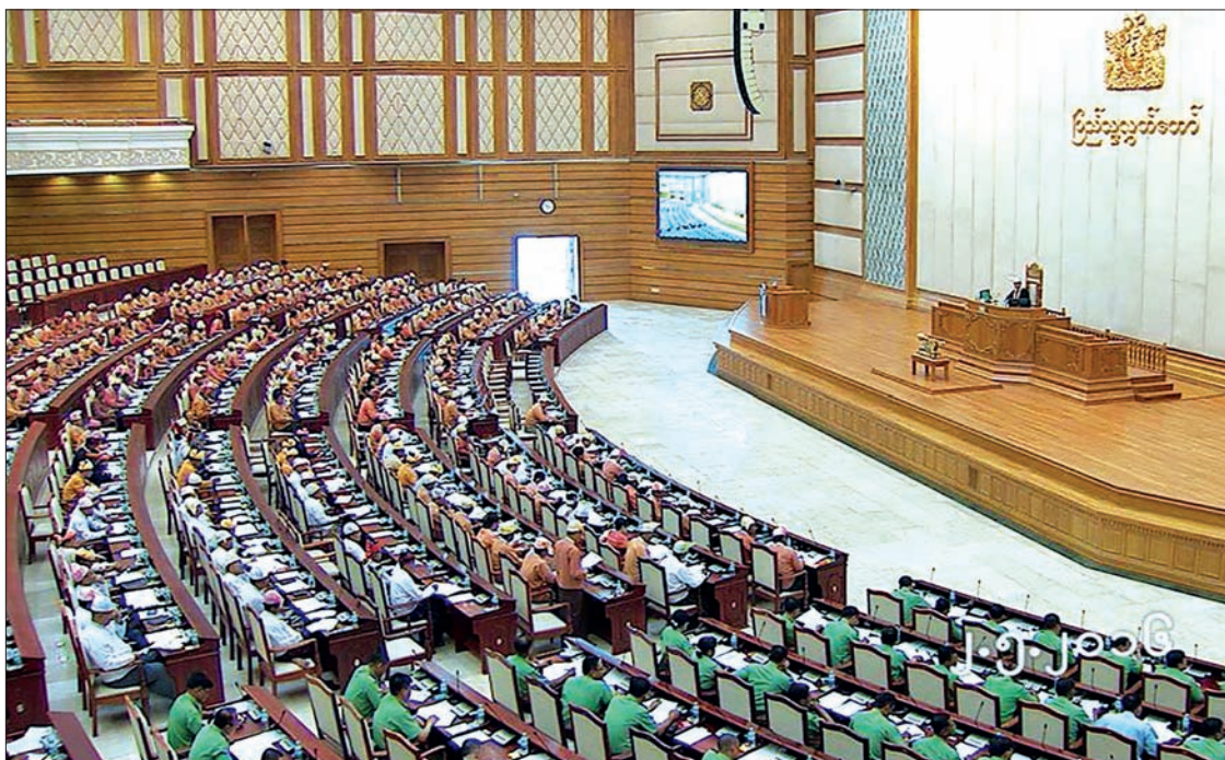
Pyithu Hluttaw is convened in Nay Pyi Taw.