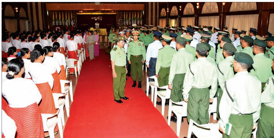
Senior General Min Aung Hlaing greets members of the Tatmadaw at the Yangon Region Command.