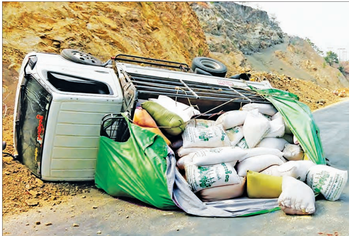
Bags of rice spill from an overturned truck in Nay Pyi Taw.

Police are still investigating the case.— Tin Maung Lwin