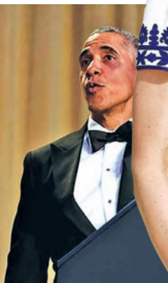
Kendall Jenner and Barack Obama.

Asked if she gets starstruck, she said, “Never. That was like my first time, ever.”