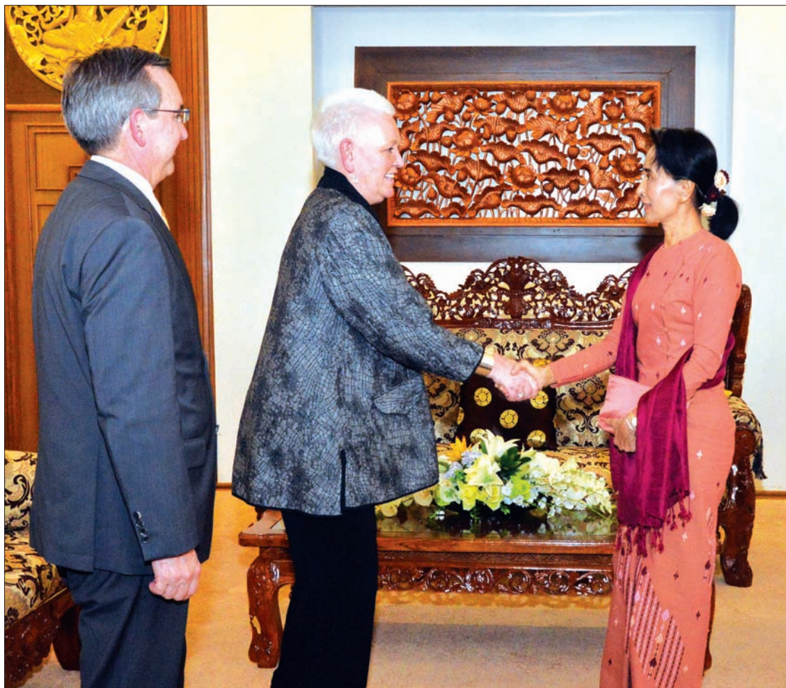
Foreign Minister Daw Aung San Suu Kyi welcomes Ms Gayle Smith, administrator of the US Agency for International Development.

the two countries in the areas of implementation of Food Security Strategy, greater private sector participation and health-care.— Myanmar News Agency