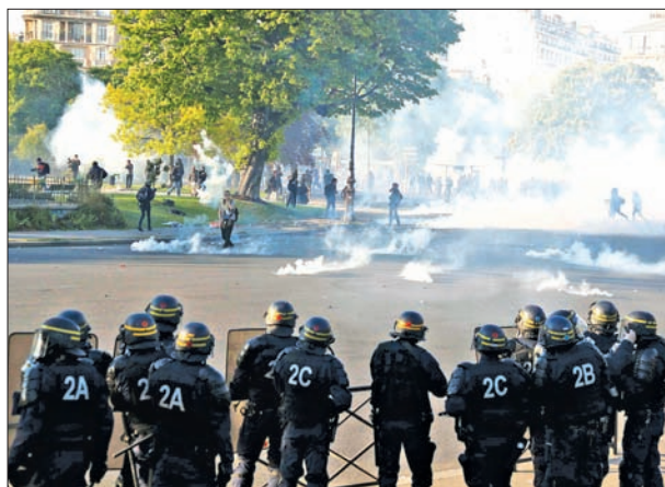
French CRS riot police secure a position as clouds of tear gas fill the Place de la Nation during clashes with youths who protest against the French labour law proposal during the May Day labour union march in Paris, France, on 1 May.