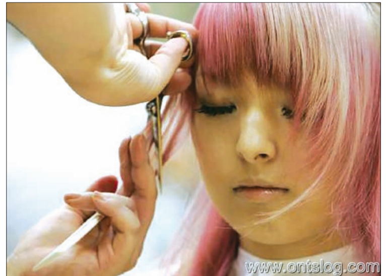
A stylist cuts a model's hair.

heat-related straightening of the hair, such as the use of flat irons and blow drying the hair — while not by itself significantly associated with traction alopecia — can weaken shafts, leading to ‘significant’ hair loss when traction is applied, researchers said.