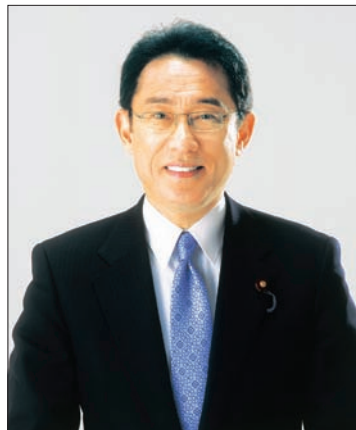
Mr Fumio Kishida

A good example of Japanese assistance is the opening of the