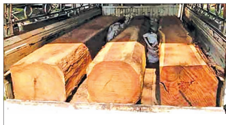
Indaw Township police seized nearly one tonne of Tamalan wood from three smugglers.

Local police are searching for the poachers and will charge them under the Wildlife Protection Law.—200