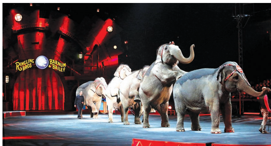
Elephants perform during Ringling Bros and Barnum & Bailey Circus’ “Circus Extreme” show at the Mohegan Sun Arena at Casey Plaza in Wilkes-Barre, Pennsylvania, US, on 29 April 2016.

Facilities providing meals, nursing care or health management service to elderly residents are obliged to report to local government under the Act on Social Welfare for the Elderly. —Kyodo News