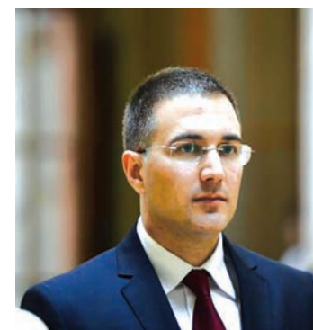
Vice-President of the Serbian Progressive Party (SNS) Nebojsa Stefanovic.

"We have made it possible in this country for anyone to gather together in peace and