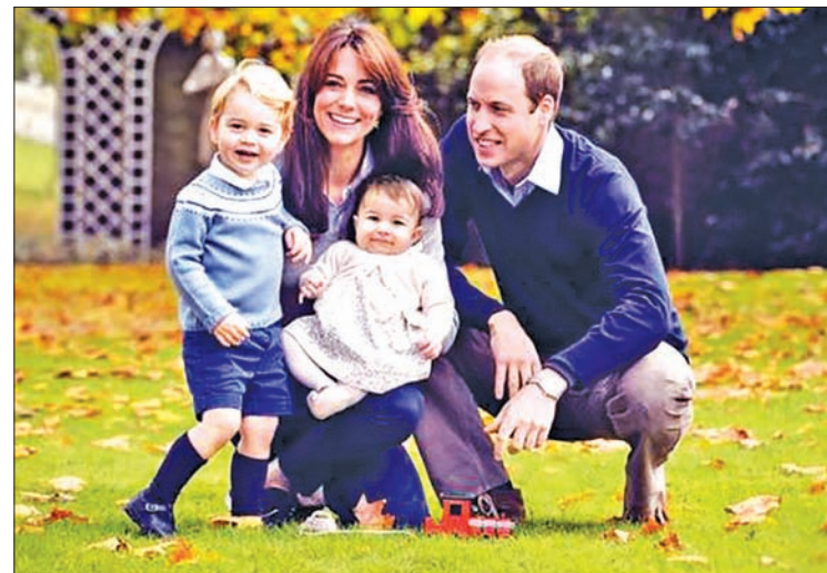
Britain’s Prince William, his wife Kate, and their children George (L) and Charlotte pose in a photo taken in late October 2015, and handed out by Kensington Palace in 2015.

LONDON — Britain’s Duke and Duchess of Cambridge, Prince William and his wife Catherine, celebrate their fifth wedding anniversary on 29 April.