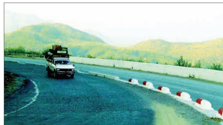
Road signs to erect at dangerous bends.

AS part of the new government's 100-day project, 40 bridges will be renovated across Pyin Oo Lwin District in Mandalay Region.