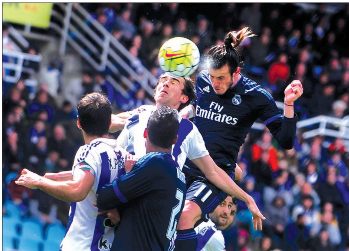
Real Madrid's Gareth Bale heads the ball during match against Real Sociedad during Spanish Liga BBVA at Anoeta, San Sebastian, Spain on 30 April 2016.

Barcelona struggled to break down Betis even after Westermann was dismissed but a misunderstanding between defender German Pezzella and goalkeeper Antonio Adan al-