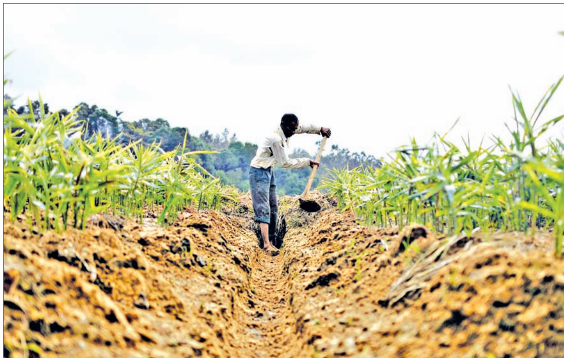
A farmer cultivating ginger uses a hoe to dig a ditch in his field in Nagarally village in the southern state of Karnataka, India.

LONDON — Scientists have for the first time found that a gene known for producing red hair and pale skin may explain why some people appear more youthful than others.