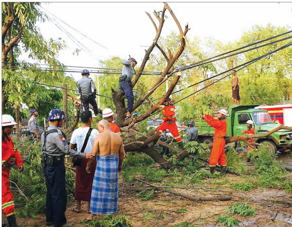
Police, fire fighters and volunteers clear havoc in Wundwin.