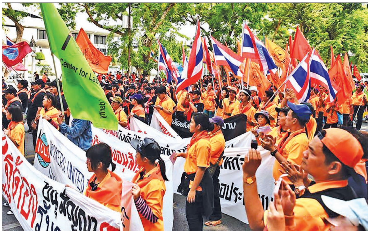
BANGKOK — Workers attend a Workers' Day rally jointly held by the Thai Labour Solidarity Committee and the State Enterprises Workers' Relations Confederation at the Dusit Palace Plaza in Bangkok, Thailand, on 1 May 2016. Workers in Thailand made requests over wages and benefits during two rallies held Sunday in Bangkok by the Thai Labour Ministry and independent labour groups respectively.

Television reports said the smoke has affected visibility in the area. Locals said columns of smoke emanate from the stretches that are under fire and small flames were visible from a distance. Officials said since February, 922 incidents of forest fire incidents were recorded in the state. Though exact reason behind the fire was unknown, officials however suspect the continued dry spell and hand of timber mafia.—Xinhua