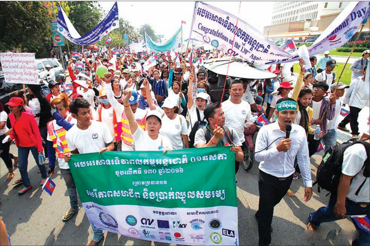
Workers march on the International Labour Day in Phnom Penh, Cambodia, on 1 May 2016.

PHNOM PENH — Approximately 1,000 Cambodian workers came to streets here on Sunday to mark the 130 th International Labour Day, calling for pay rise and better working conditions, a union representative said. Marchers, mostly from garment and footwear indus-