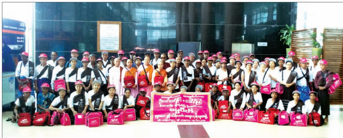
Lucky senior citizens posing for a group photo.

SENIOR citizens over the age of 60 went on a free pilgrimage to Bodh Gaya, India, yesterday under the joint sponsorship of the Myanmar-India International Business Association and the Myanmar-India Association.