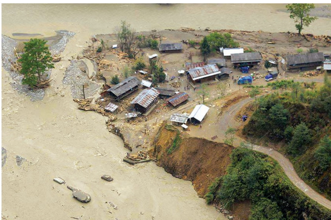
The aerial view of areas in Chibwe Township, Kachin State, which was hit by floods caused by heavy rains. (News on Page 1)