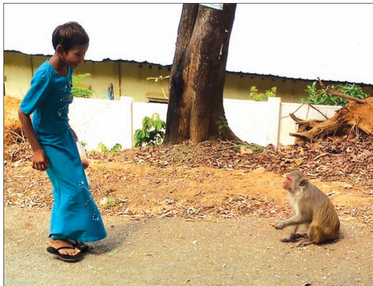
A boy feeds a monkey.

Various species of monkey living in the area live on bananas and other snack fed to them by visitors to the pagoda.—Myitmakha News Agency