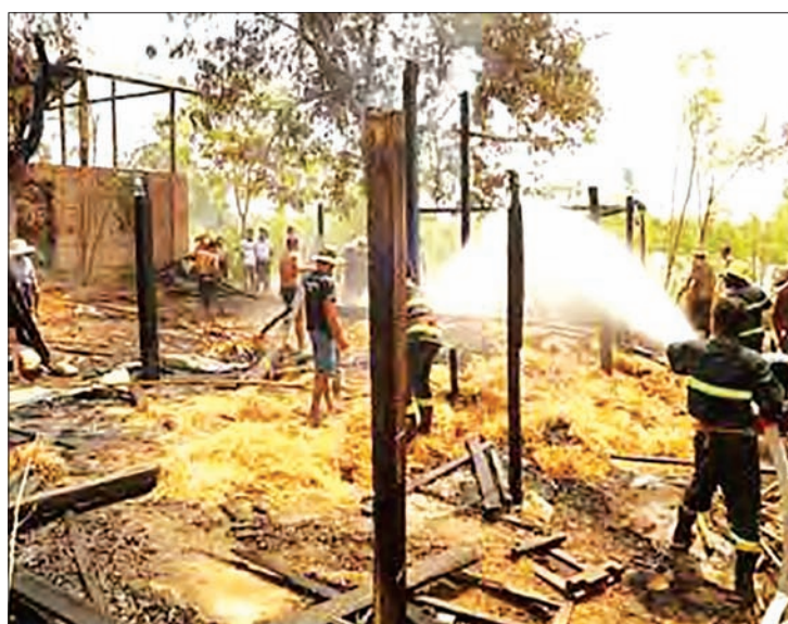
Firefighters bringing under control a warehouse in Mandalay within five minutes.

The farm owner has been charged by local police under the law.