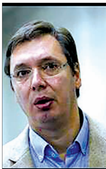
Serbian Prime Minister and leader of the Serbian Progressive Party (SNS) Aleksandar Vucic.

It is they who gave their votes to us politicians," the prime minister said.—Tanjug