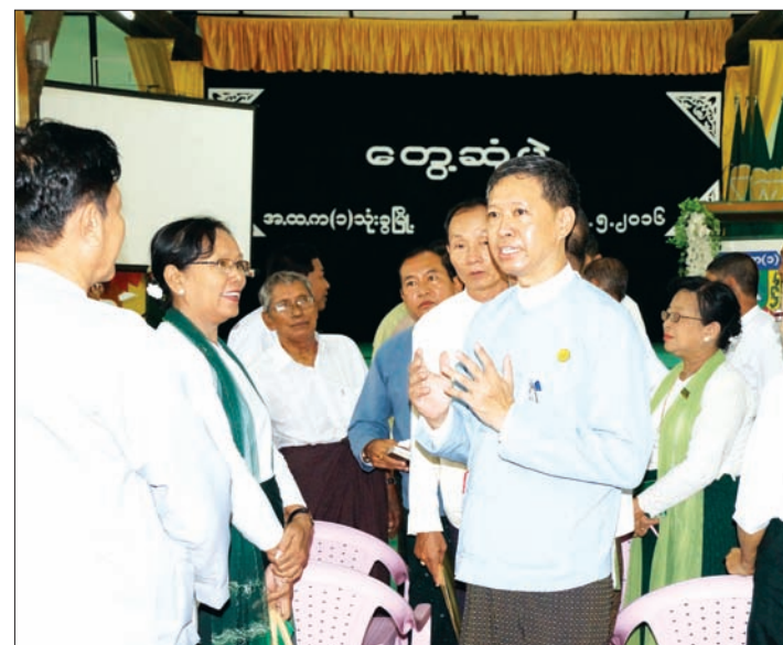
Union Minister for Education Dr Myo Thein Gyi talks to education officials at a seminar on education policy in southern Yangon.