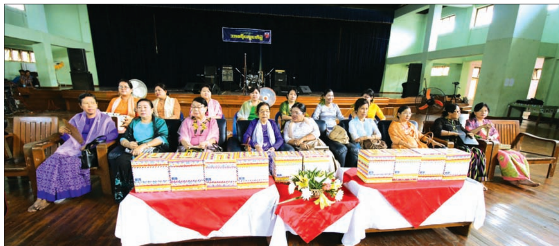
Respect paying ceremony of English Department in Dagon University.