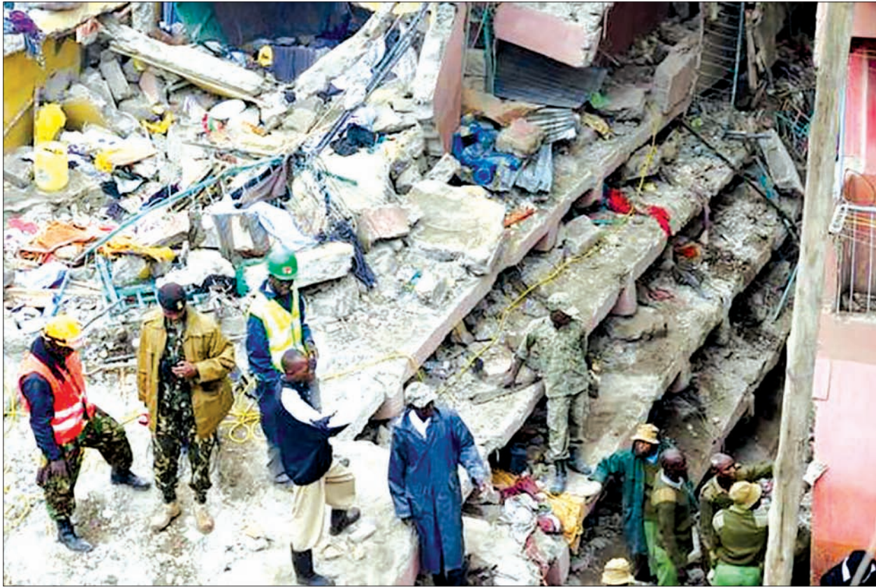
Rescue workers search for residents feared trapped in the rubble of a six-storey building that collapsed after days of heavy rain, in Nairobi, Kenya on 30 April 2016.