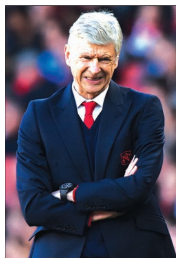
Arsenal manager Arsene Wenger.

LONDON — Arsene Wenger dismissed protests against him as more "disappointed love" than "real aggression" after disenchanted supporters held up banners calling for his resignation in the 1-0 victory over Norwich in the Premier League on Saturday.