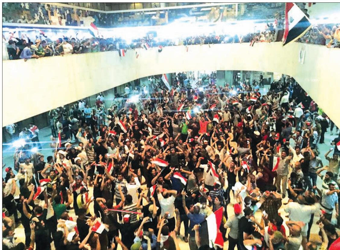
Followers of Iraq's Shi'ite cleric Moqtada al-Sadr are seen in the parliament building as they storm Baghdad's Green Zone after lawmakers failed to convene for a vote on overhauling the government, in Iraq on 30 April 2016.

He called on protesters to return to areas set aside for demon-