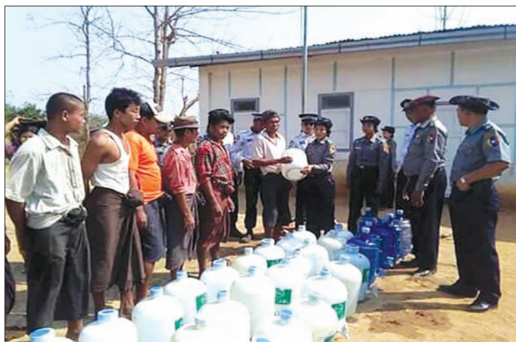
Police distributing water bottles.

Some of the areas in the country are facing scarcity of water as the effect of El Niño.