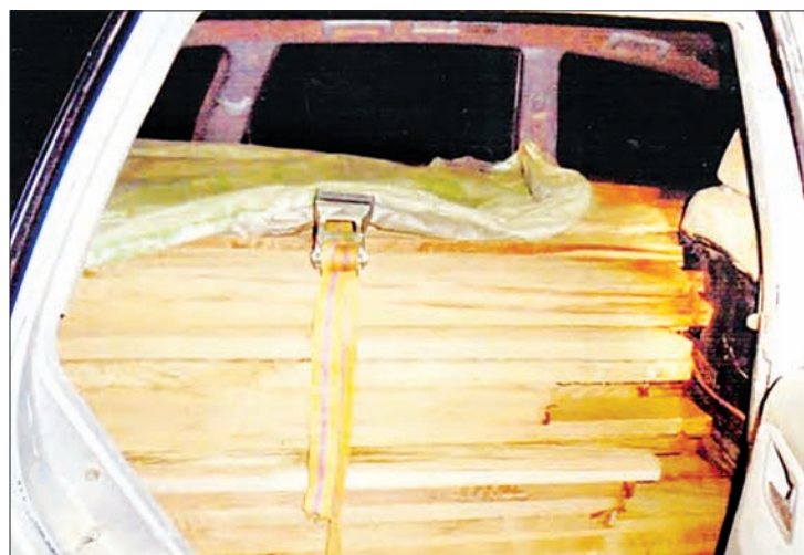
Forest department officials found nearly one tonne of logs in an abandoned vehicle in Bago Region.

A CACHE of illegal timber weighing nearly one tonne was confiscated by local authorities from an abandoned vehicle in Nyaunglaybin Township, Bago Region, on Saturday.