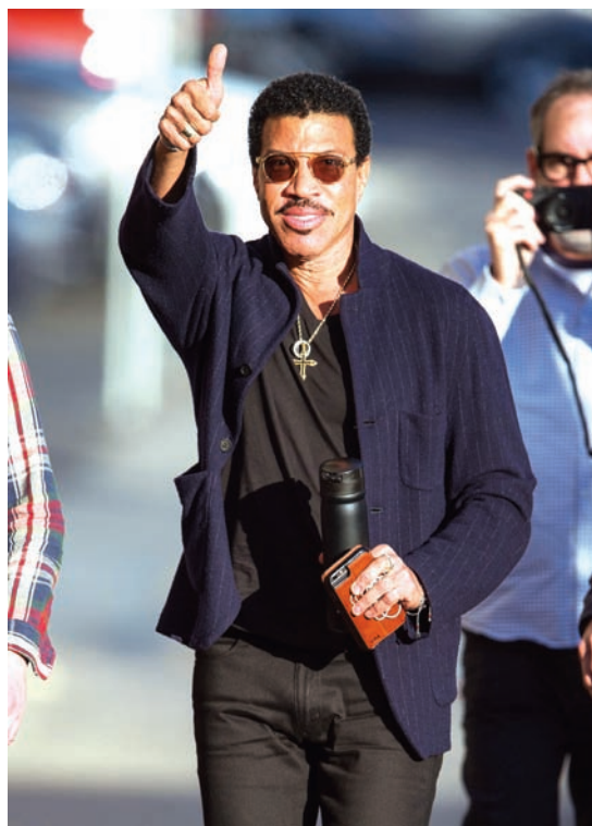
Singer Lionel Richie.

However, there's a separate trademark for products like candles and candle accessories.—PTI