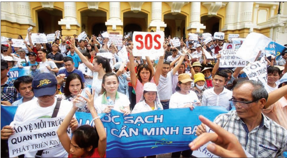
Demonstrators, holding signs to protest against Taiwanese enterprise Formosa Plastic and environmental-friendly messages, say they are demanding cleaner waters in the central regions after mass fish deaths in recent weeks, in Hanoi, Viet Nam on 1 May 2016.

HANOI — Hundreds of people demonstrated in Viet Nam on Sunday against a Taiwanese firm they accuse of causing mass fish deaths along the country’s central coast, with some also blaming the government for a sluggish response to a major environmental disaster. Though an official investigation has found no links between the fish deaths and a $10.6 billion coastal steel plant run by a unit of Taiwan’s Formosa Plastics (1301.TW), public anger against the company has not abated. Hundreds gathered in Hanoi holding banners that said: “Formosa destroying the environment is a crime” and “Who poisoned the central region’s waters?” Others said: “Formosa out of Viet Nam!” and took aim at the government for being aloof in what it now