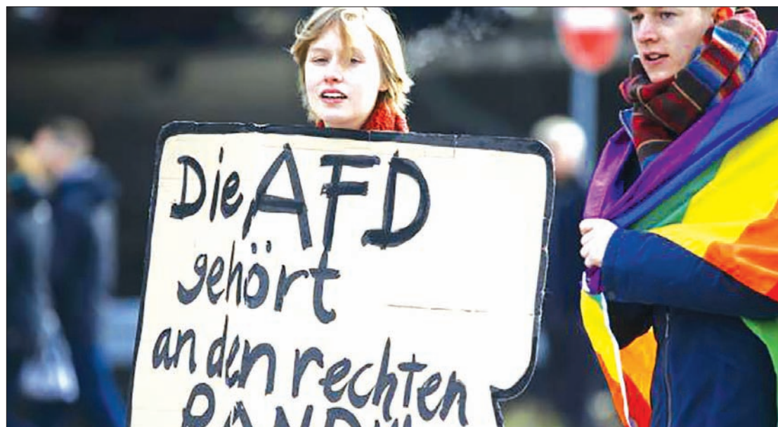
Anti-AfD protestor holds a banner reading 'AfD belongs to the right border' during the AfD party congress in Stuttgart, Germany, on 30 April 2016.

STUTTGART (Germany) — German left-wing demonstrators clashed with police on Saturday as they tried to break up the first full conference of the anti-immigration party Alternative for Germany where Chancellor Angela Merkel's policies came under attack.