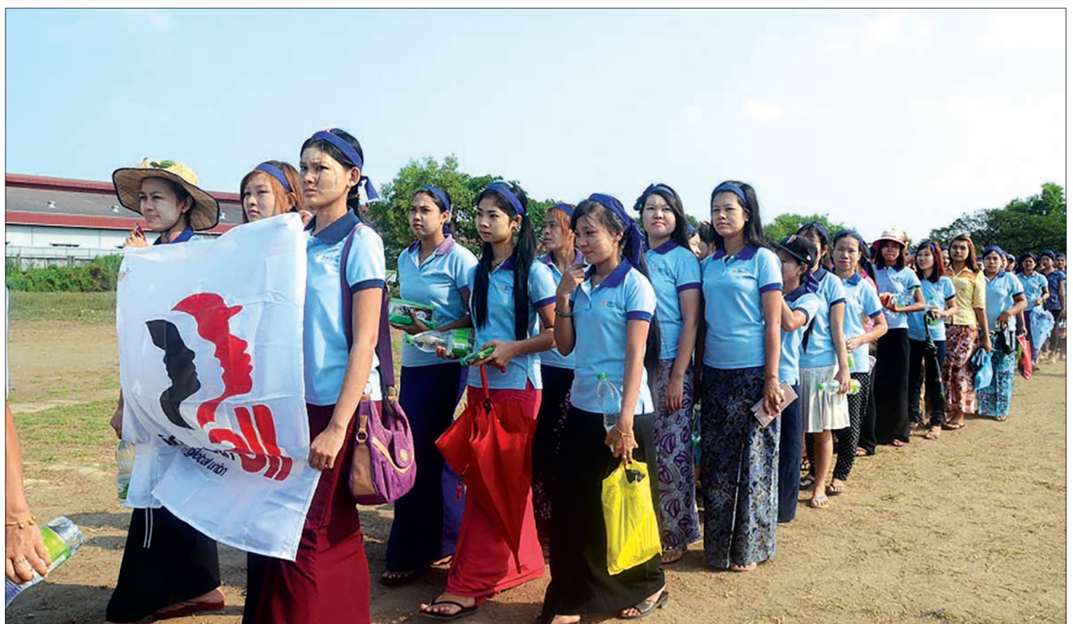
More than 1,500 workers march in honour of International Workers' Day in the Hlaingthaya Industrial Zone.

The Union minister also called on the labour organizations which are being involved in labour issues in the country for helping