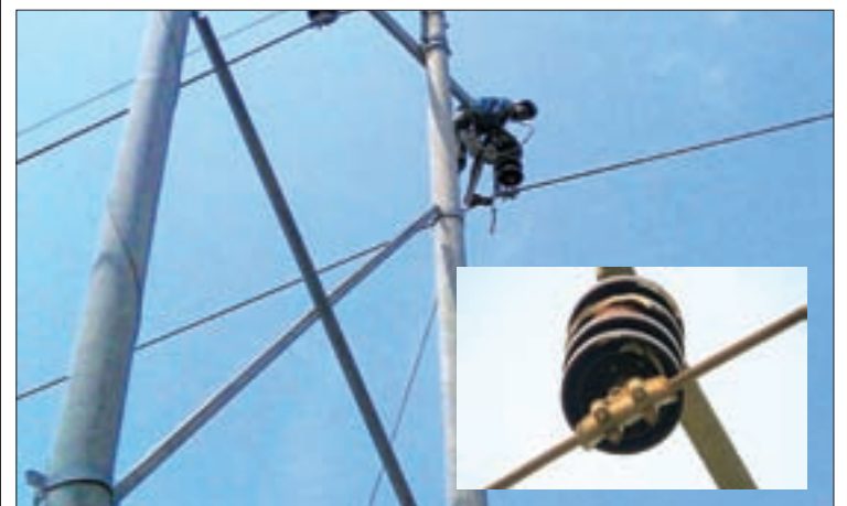
A worker seen repairing ceramic devices on lamp posts damaged by cow boys.

Local authorities took measures to educate the public that such acts would leave the persons responsible at risk of being arrested for causing damage to public property.— Myanmar News Agency