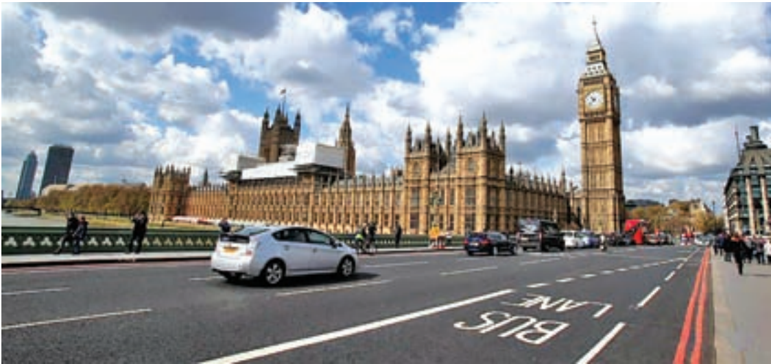
A general view of the Big Ben in central London, Britain on 27 April 2016. London’s famous Big Ben is to be given a 43-million-US-dollar facelift, the British Parliament announced Tuesday. A three-year programme of work will begin early in 2017. It will mean the clock being switched off and the bell silenced for a period of time while the work is carried out.

LONDON — The famous chimes of Big Ben will fall silent next year as the 160-year-old parliamentary clock tower undergoes essential repairs as part of a 29 million-pound ($42 million) project. The tower will be partially covered in scaffolding for three years, although engineers plan to keep at least one of the four clock faces always visible. The bells will fall silent for several months, chiming only for important events, a House of Commons statement said. The last significant repair work on Big Ben was in 1983-85 and both the clock and its 96-metre (315 ft) tower urgently need attention. Work is expected to start early in 2017. The project also aims to re-store the clock face surrounds to their original colours as designed in 1856 by architects Charles Barry and Augustus Welby Pugin. “Parliament’s team of conservation architects is currently analysing the original paint used to decorate the surrounding areas to each clock dial,” the statement said. “Once a clear picture of the early colour schemes has been built up, the stonework will be repainted to reflect, as far as possible, Pugin’s original design.” The current black and gold surrounds were painted during the 1980s refurbishment. Big Ben was last silenced in 2013 as a sign of respect during the funeral of former Prime Minister Margaret Thatcher.—Reuters