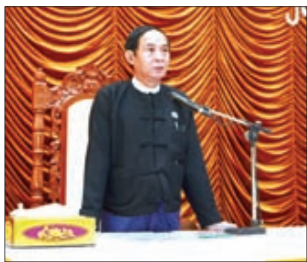
Pyithu Hluttaw Speaker U Win Myint talking to representatives in Bago.