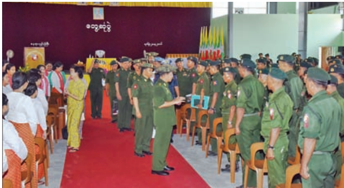
Commander-in-Chief Senior General Min Aung Hlaing and wife meet service personnel of Pyinpongyi Station.