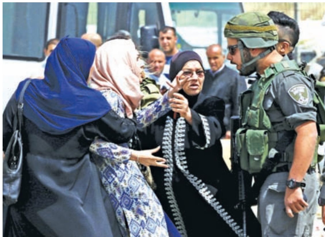
A Palestinian woman argues with an Israeli border policeman near the scene where a Palestinian woman and a man, who the Israeli military said tried to stab security forces, were shot dead by Israeli police near Qalandia checkpoint near the West Bank city of Ramallah, on 27 April.

JERUSALEM — Israeli police shot dead a Palestinian woman and her teenage brother on Wednesday, saying they were armed with knives and tried to carry out an attack at a checkpoint in the occupied West Bank.