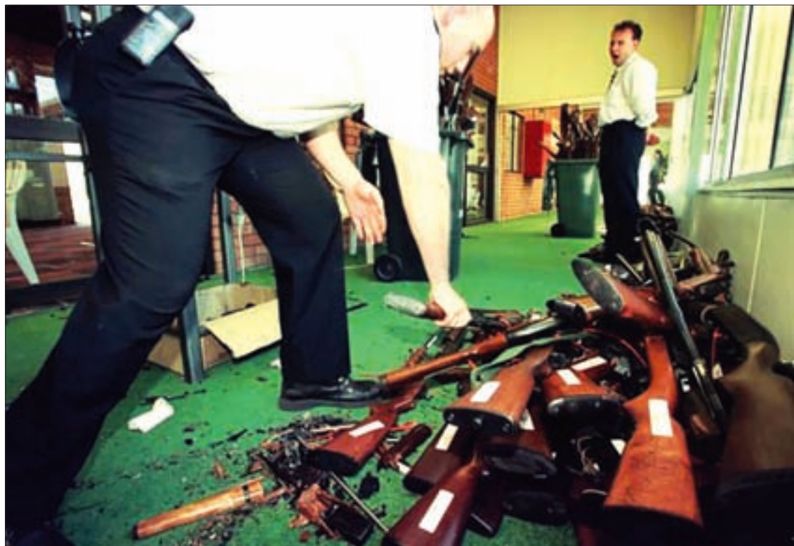
File photo shows guns that have just had their barrels crushed in Sydney are stacked after they were handed over on the last day of the Australian gun buy-back scheme.

Democrat front runner Hillary Clinton has meanwhile ruled out an Australian-style gun buyback, while Democrat hopeful Bernie Sanders has rejected the need for tougher gun controls despite a gun murder