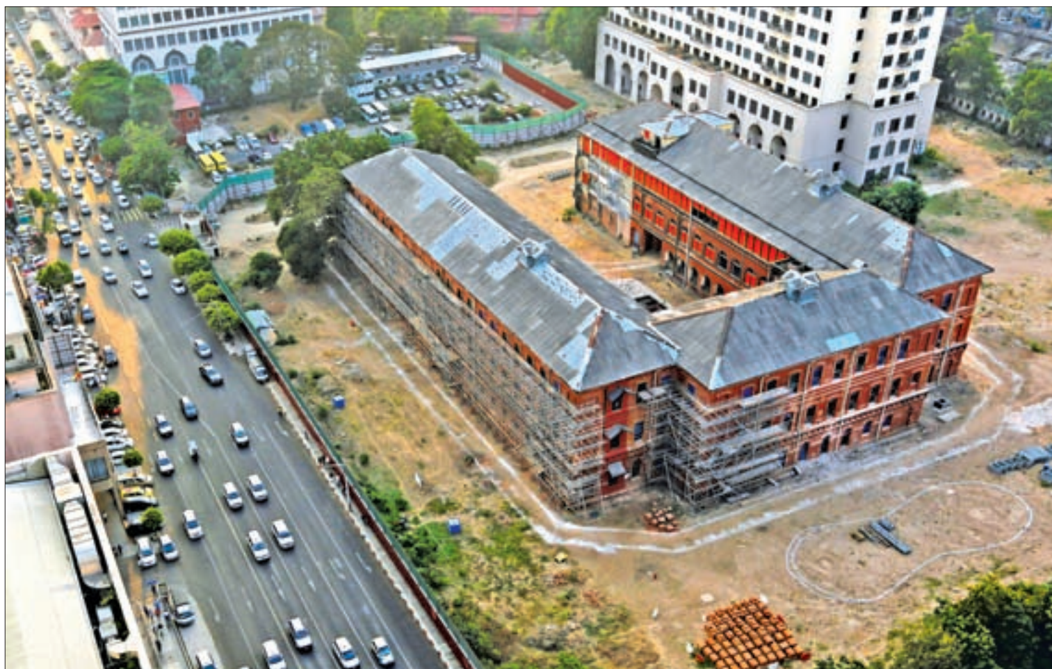
The old Myanma Railways Headquarters building is seen in Yangon on 27 April 2016.