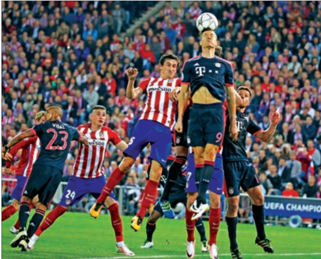
Bayern Munich's Robert Lewandowski in action during UEFA Champions League Semi Final First Leg at Vicente Calderon Stadium, on 27 April.

with a sensational run from the right, snaking inside and beating three players before fending off two more and bending the ball in off the far post with a flick of his left boot. Bayern nearly equalised moments later when Arturo Vidal's looping header beat Atletico keeper Jan Oblak, but Jose Gimenez rose to head the ball off the line.