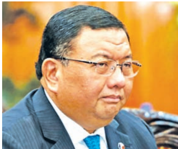
Philippines' Foreign Secretary Jose Rene Almendras.

MANILA — The Philippines has been discussing coordinated naval patrols on its southern maritime borders with Indonesia and Malaysia to protect shipping after attacks and kidnappings by Islamist militants, its foreign minister said on Thursday.