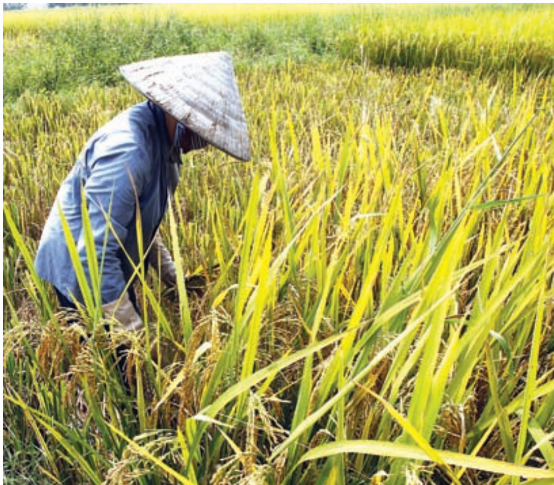
A farmer seen working on a rice field near Thilawa economic zone outside Yangon.

The price ranges from Y145 to Y153 (Chinese Yuan) per bag depending on the rice variety at the Muse Border area. The price is dependent on demand from China.— ML/Union Daily