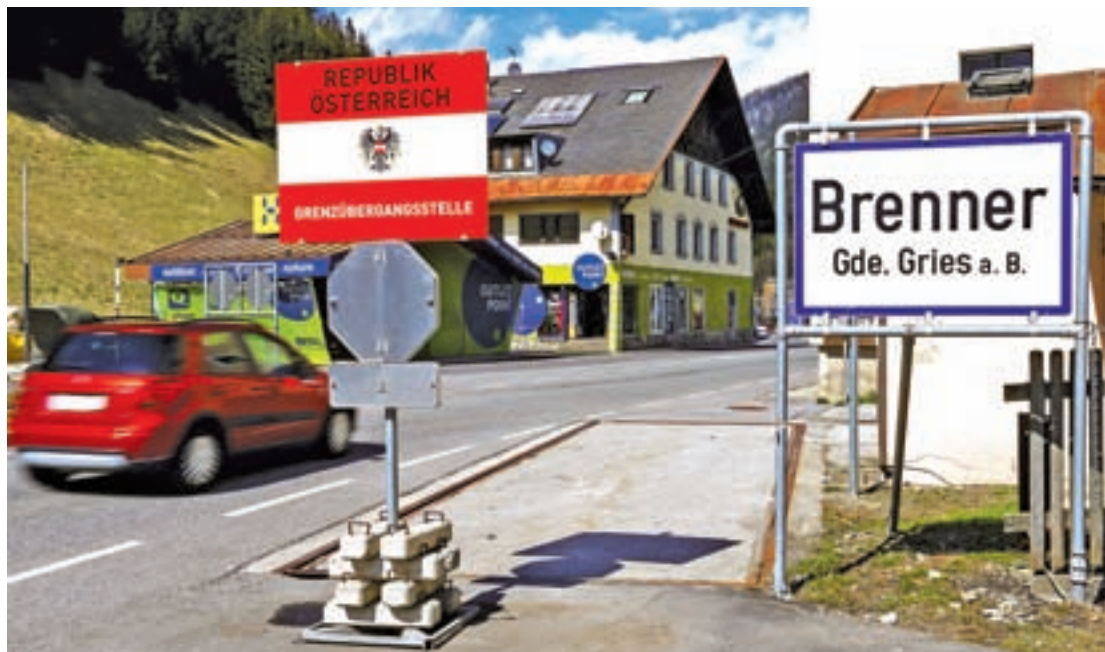
A sign reading "Brenner — Brennero" is pictured at Brenner on the Italian-Austrian border, Austria, on 12 April.

VIENNA — Austria outlined plans on Wednesday to erect a fence at a border crossing with Italy that is a vital link between northern and southern Europe, escalating a stand-off between the two states over how to handle a migration crisis.