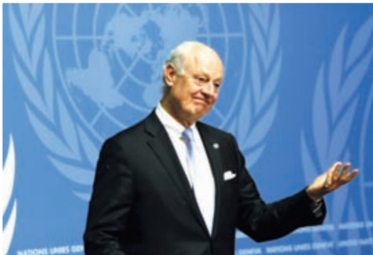
UN mediator Staffan de Mistura attends a news conference after the conclusion of a round of meetings during the Syria Peace talks at the United Nations in Geneva, Switzerland, on 28 April.

The United States and Russia must convene a ministerial meeting of major and regional powers who compose the Inter-