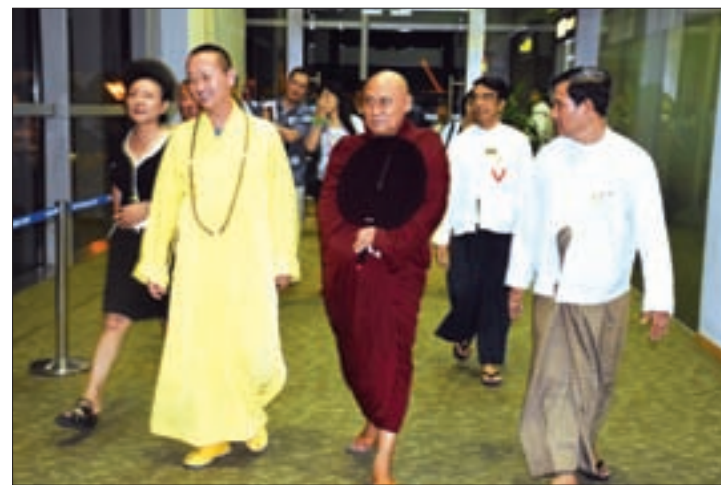
Venerable Chong Hua (Left) arrives Yangon International Airport.