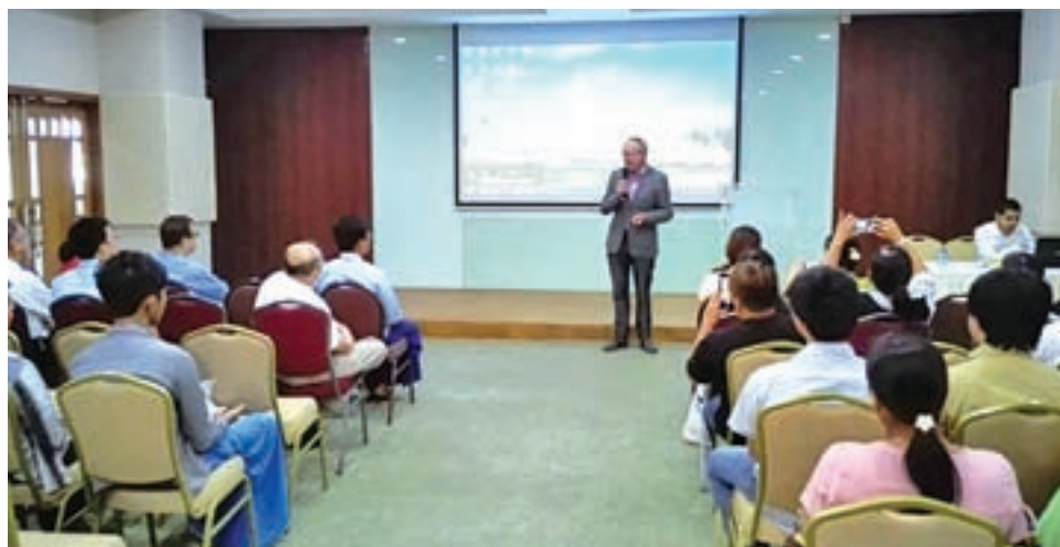
An expert speaks at the SMEs Knowledge Awareness Workshop in Mandalay.