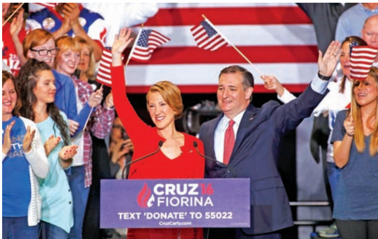
Republican US presidential candidate Ted Cruz holds a campaign rally to announce Carly Fiorina as his running mate in Indianapolis, Indiana, United States on 27 April 2016.