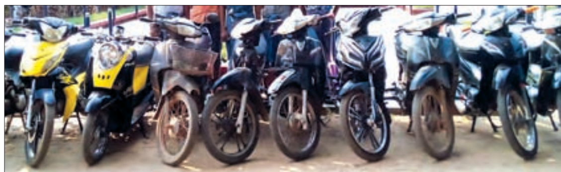
The confiscated motorcycles being seen.

Further investigation led to the discovery of the theft of eleven motorcycles, all cases have been attributed to the suspects. Charges have been filed against them by local police.— Tun Hlaing (Myaing)