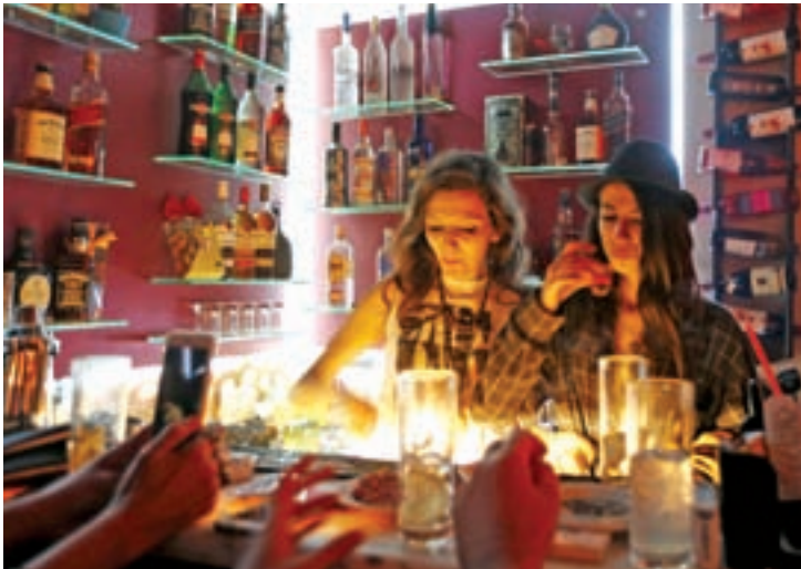
Bartenders work at 80s Bar in Damascus, Syria, on 11 March.