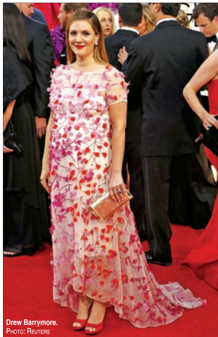
Drew Barrymore.

"It's funny, because there are times in my life that I am so loosey-goosey, so hedonistic, and it is so just 'hippy-dippy,' but right now I feel this great backbone is, 'One foot in front of the other,' which is sort of my attitude right now. That is anything but loosey-goosey — that if you don't stay in a straight line, you are going to get into trouble.—PTI