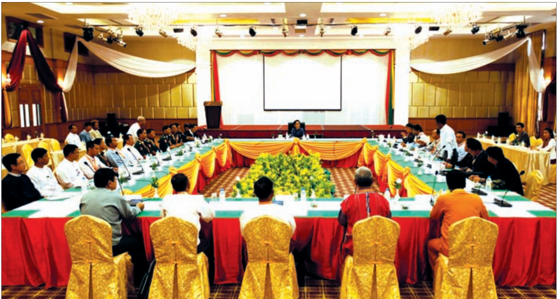
Joint Monitoring Committee for ceasefire holding a meeting with State Counsellor Daw Aung San Suu Kyi on 27 April, 2016.