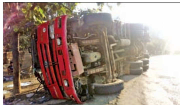
A 22-wheel truck seen overturned in Penwagon.