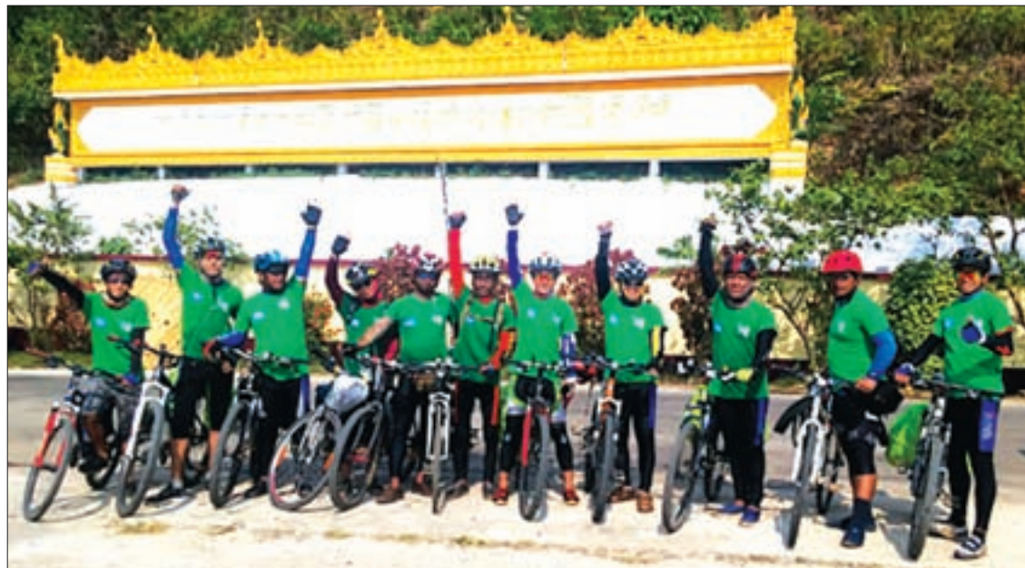
Bike lovers being seen before starting a journey.

"WE have a big plan to raise public awareness on cycling by conducting several educative programmes in the future," said a member of Bicycle Network Myanmar, a local team established by bike lovers.