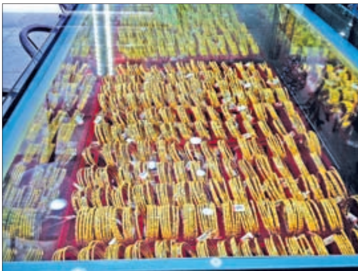
Gold jewelry are on display at a shop in Yangon.