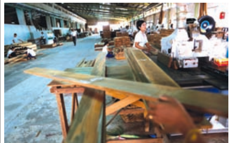
A wood parquet factory in Yangon being seen.

The two groups of companies have been applying for permission to operate their production businesses in the country over the last few years. Currently, the investors are looking for suitable areas in selected regions to establish those factories, with plan to mainly distribute their finished wood products within European's wood-based furniture market. — 200