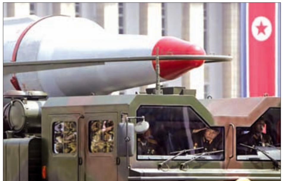
File photo of North Korean soldiers as they salute in a military vehicle carrying a missile during a parade to commemorate the 60 th anniversary of the signing of a truce in the 1950-1953 Korean War, at Kim Il-sung Square in Pyongyang.

The first of the two launches was carried out on the birthday of North Korea's late founder