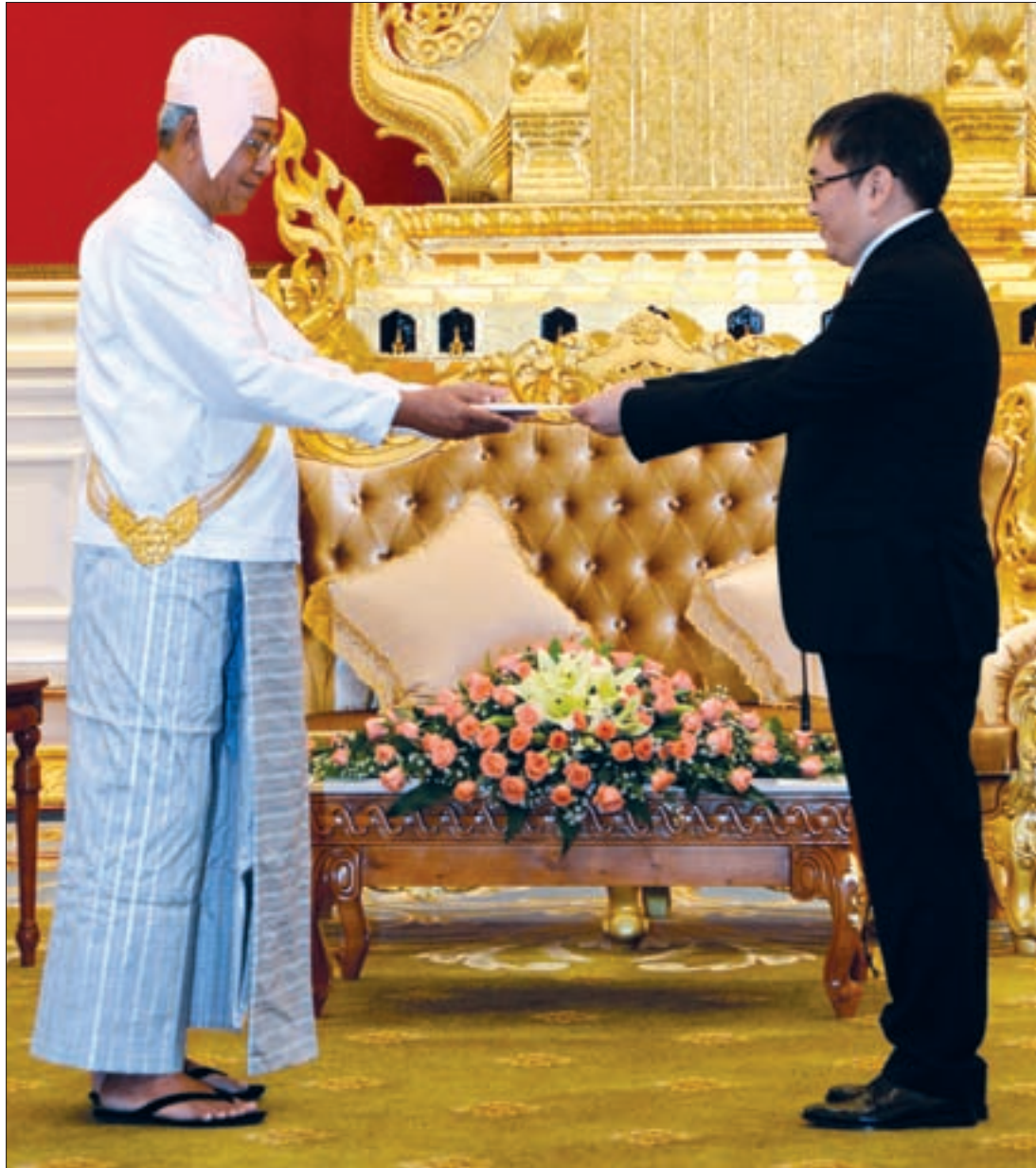
President U Htin Kyaw accepts credentials presented by H E Mr Tugsbilguun Tumurkhuleg, the newly accredited Ambassador of Mongolia to Myanmar in Nay Pyi Taw.