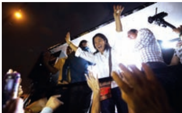
Peruvian presidential candidate Keiko Fujimori (C) of the Fuerza Popular (Popular Force) party greets supporters during a campaign rally in San Juan de Lurigancho district of Lima, on 25 April 2016.

"Fujimori and her brother are fighting about who will get the piñata in 2021!" Fujimori's rival Pedro Pablo Kuczynski, a centrist econo-