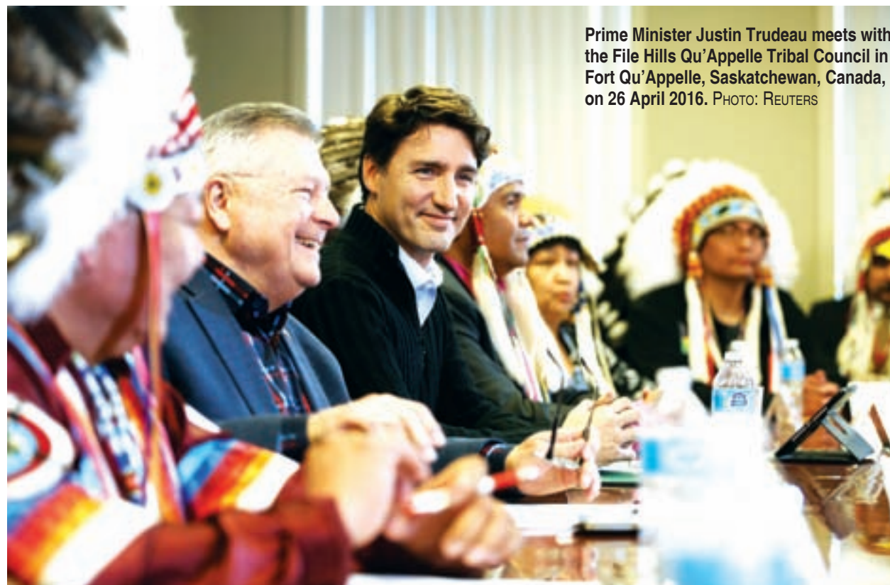
Prime Minister Justin Trudeau meets with the File Hills Qu'Appelle Tribal Council in Fort Qu'Appelle, Saskatchewan, Canada, on 26 April 2016.

Increased militancy and unhappiness among the aboriginal population has prompted protests against a