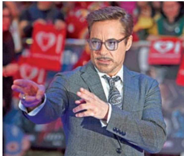
Actor Robert Downey Jr. arrives at the European premiere of "Captain America, Civil War" at a shopping centre in east London.