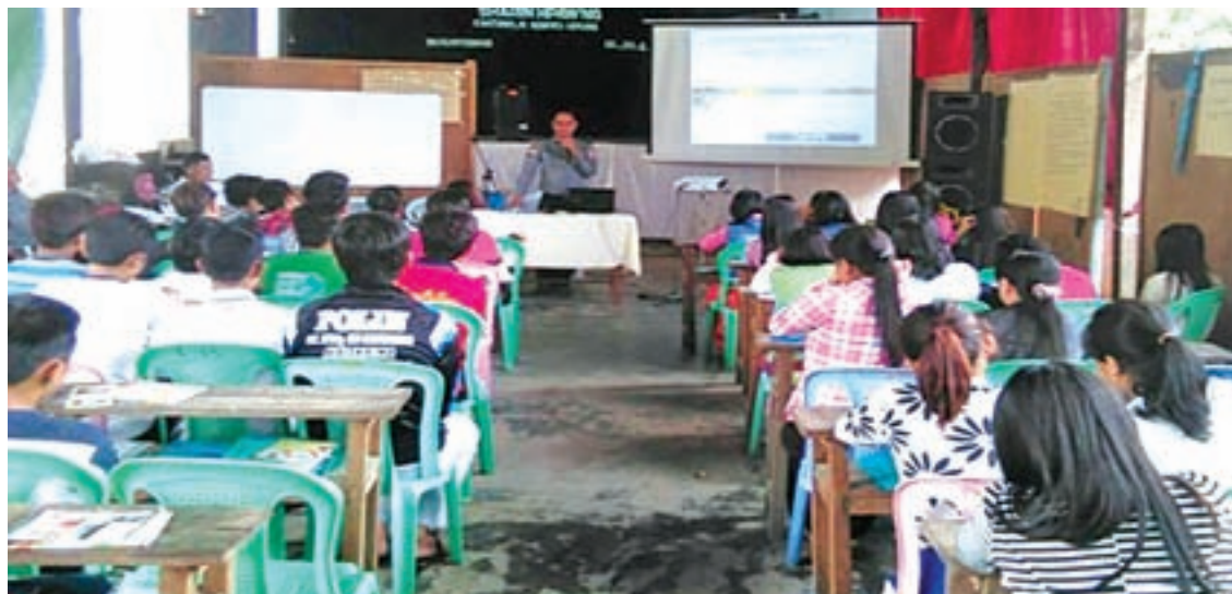
An education talk on human trafficking in progress.

ANTI-TRAFFICKING in person Police Force under the Myanmar Police force are aiming to reduce human trafficking in Myanmar by taking preventative measures in the form of a public awareness campaign.