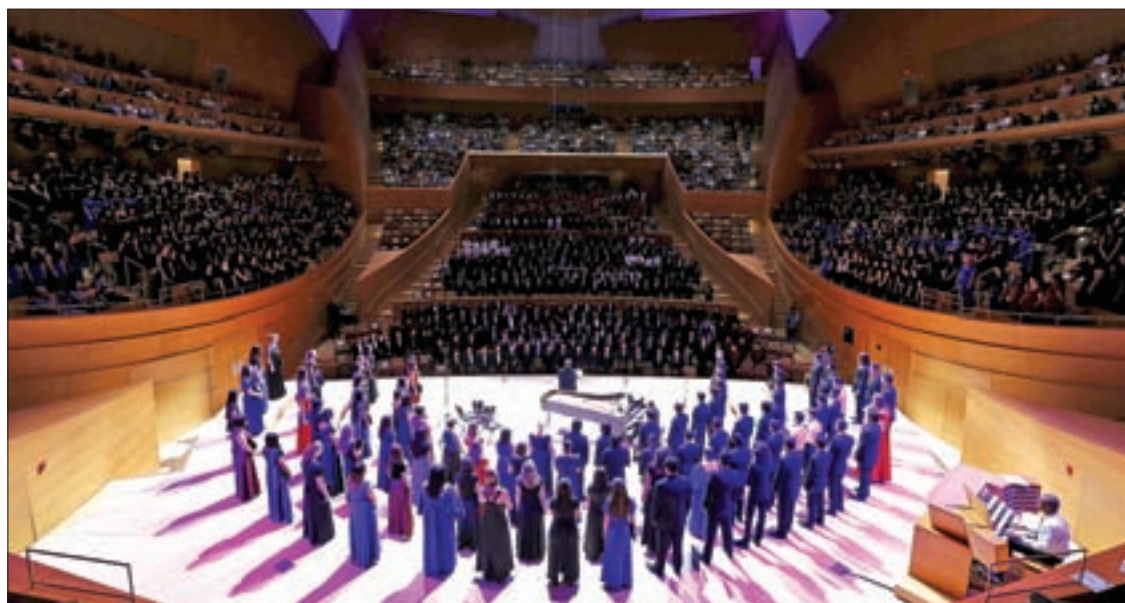
About 1000 high school students sing 'Purple Rain' to honour the late singer Prince at Walt Disney Concert Hall which is illuminated purple in Downtown Los Angeles, US, on 22 April.

LOS ANGELES — The music of Prince was brought to life a day after his death, as 1,000 Los Angeles high school students sang a tribute to the late singer.