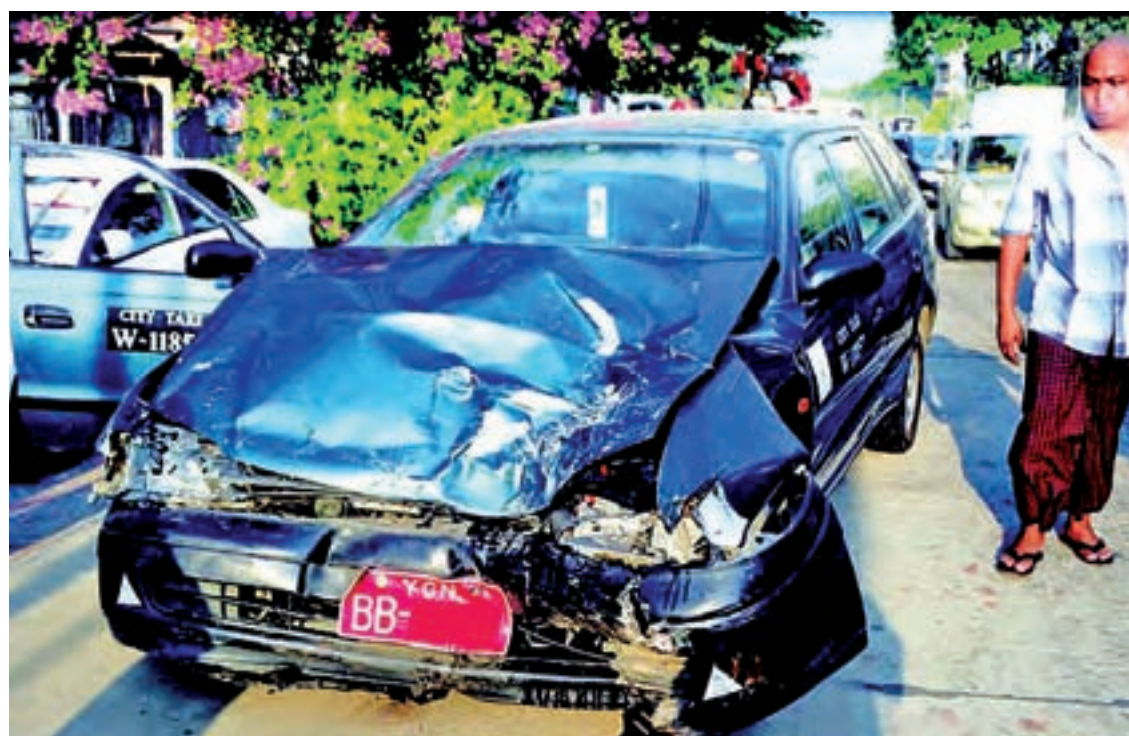
The damaged taxi being seen.

A small truck collided head on with a taxi on Thamaing station road, Mayangon township, Yangon region on 22 April, injuring nine passengers.