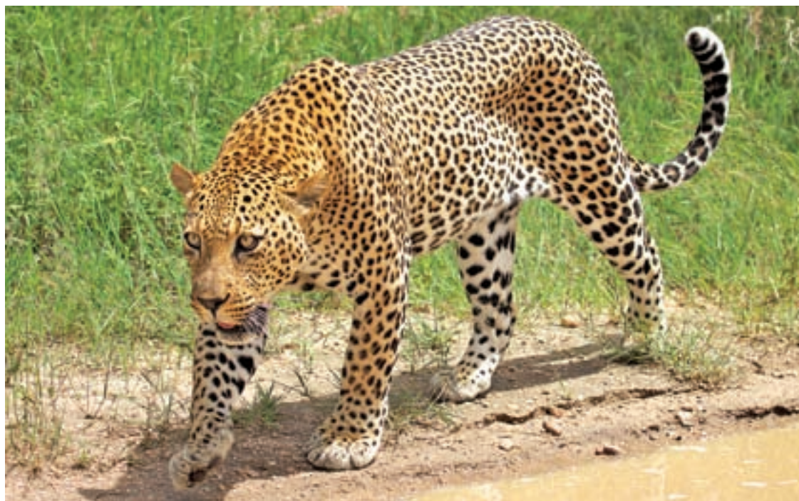
African leopard Panthera pardus pardus near Lake Panic Kruger National Park South Africa.

Several other mammalian species belonging to different orders across several continents show a wide range of variation resulting them being classified into different sub species. Has there been any detailed molecular or genetic studies been ever conducted on comparable isolated, sub populations of African leopards with appreciable sample size? If not this grouping of African leopards into one sub species may be a superficial one. A list of species representing different orders with