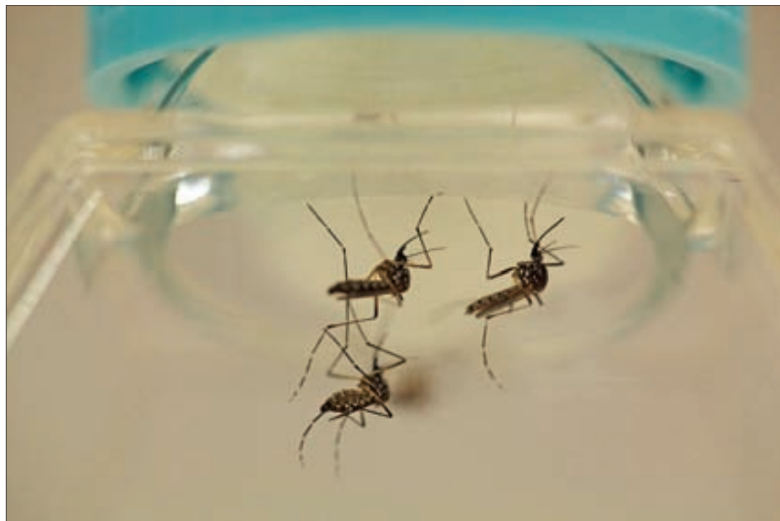
Aedes aegypti mosquitoes are seen at the Laboratory of Entomology and Ecology of the Dengue Branch of the US Centres for Disease Control and Prevention in San Juan, on 6 March 2016.

The research group's next step will be to test drugs using the mini-brains to see whether one might provide some protection against Zika.—Xinhua