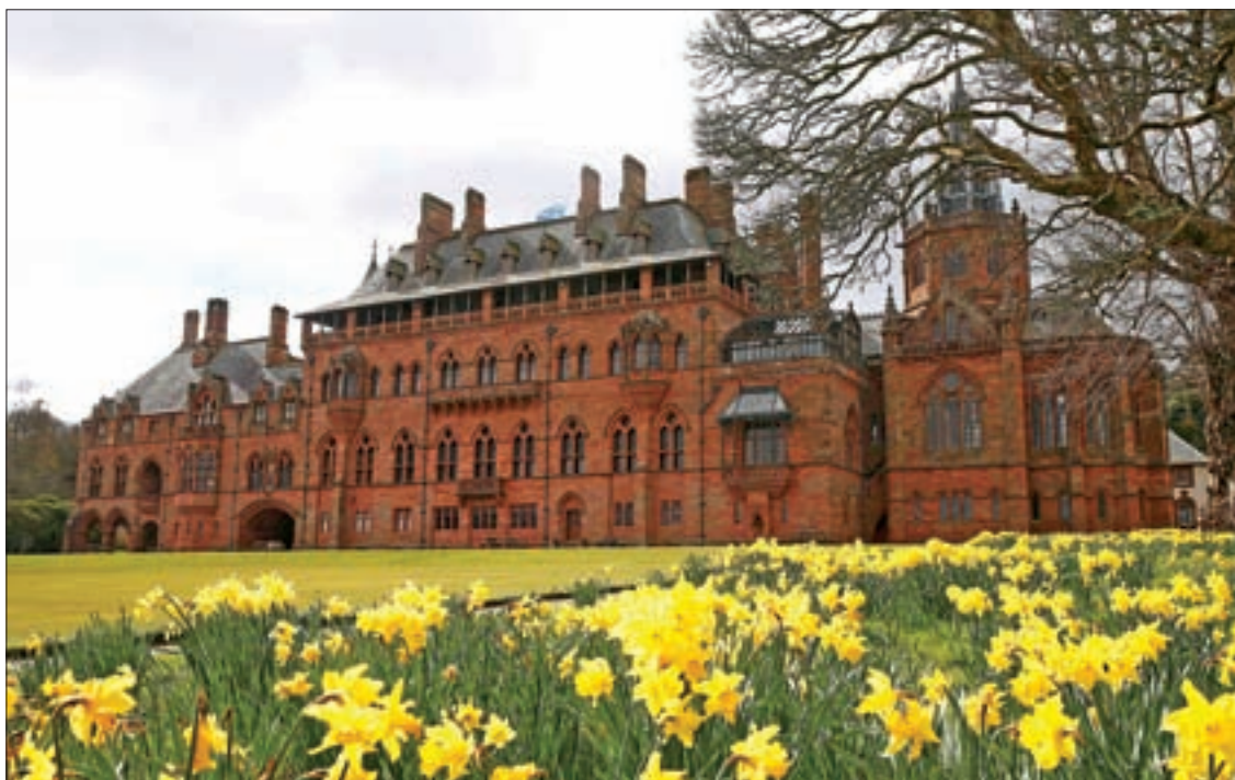
Daffodils are in bloom at Mount Stuart where a Shakespeare First Folio has been discovered nearly 400 years after his death on the Isle of Bute, Scotland, Britain on 7 April 2016.

Shakespeare's birth place Stratford-upon-Avon will also host celebrations and a parade on Saturday and Sunday.—Reuters