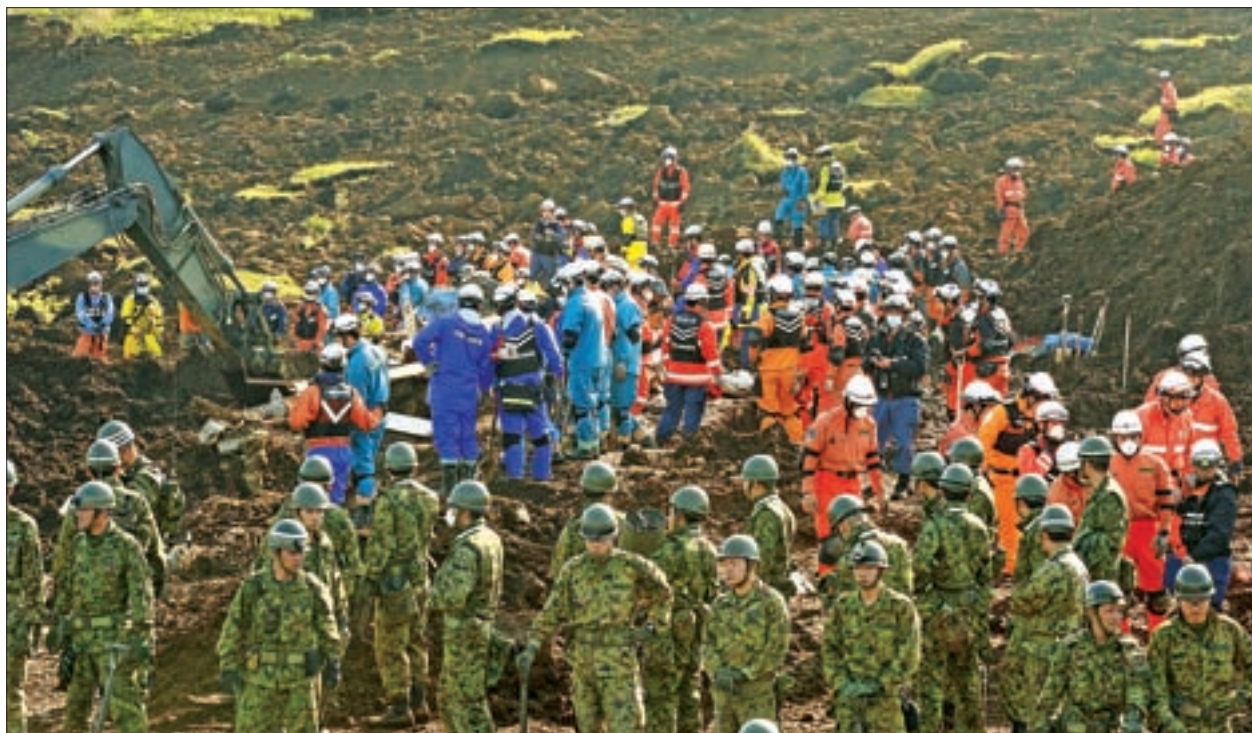
Rescue workers and Japan Ground Self-Defence Force soldiers conduct search and rescue operations at site where collapsed houses by a landslide caused by an earthquake in Minamiaso town, Kumamoto prefecture, Japan, on 20 April.