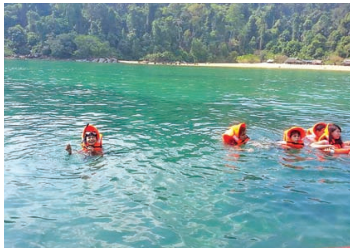
The invaders seen reveling.

The Tanintharyi regional government reiterated on 22 March 2015 that travel to Bote island was forbidden, as it constituted military owned land, after the Dawei district Department of Hotels and Tourism made a submission the previous January as to whether private travel was permitted to the island or not. As such, the aforementioned department issued an official statement on 4 April 2016 announcing travel to the island was forbidden,