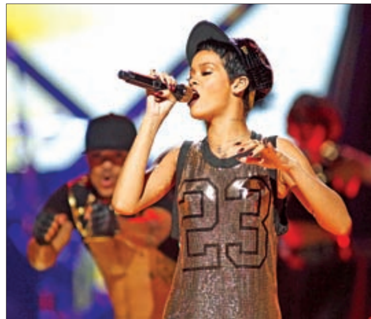
R&B star Rihanna.

LONDON — R&B star Rihanna honoured music icon Prince, who died on Thursday, with a performance of her hit track "Diamonds" during the Canada leg of her Anti World Tour.