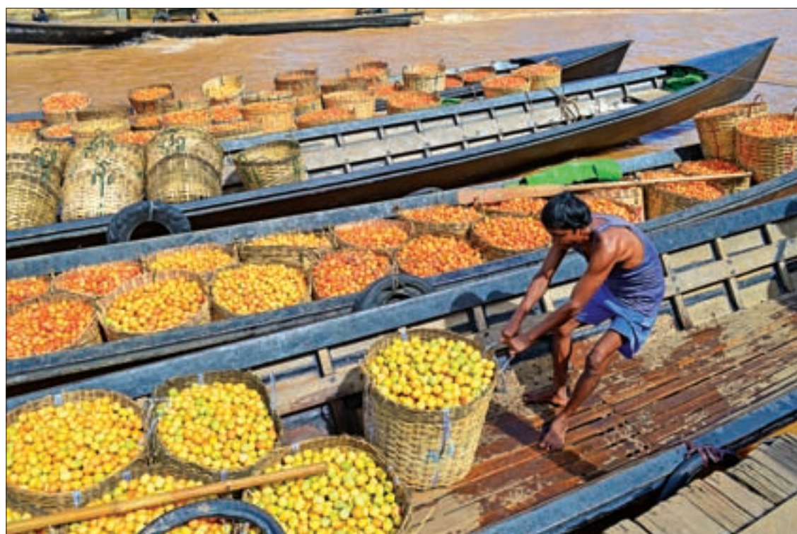
Farmers in Inle Lake have been urged to reduce chemicals in growing crops on their floating island.

countries, mostly to China. The total of border trade value in the fiscal year 2015-2016 reached $7.04 billion.— Ko Moe