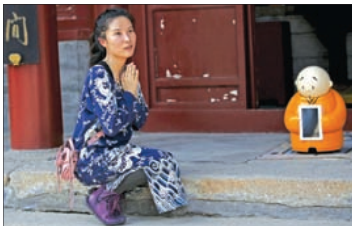
A visitor asks a temple staff to give her chance to take picture with robot Xian'er which is placed in the main building of Longquan Buddhist temple for photograph, on the outskirts of Beijing, on 20 April.

BEIJING — A Buddhist temple on the outskirts of Beijing has decided to ditch traditional ways and use technology to attract followers.