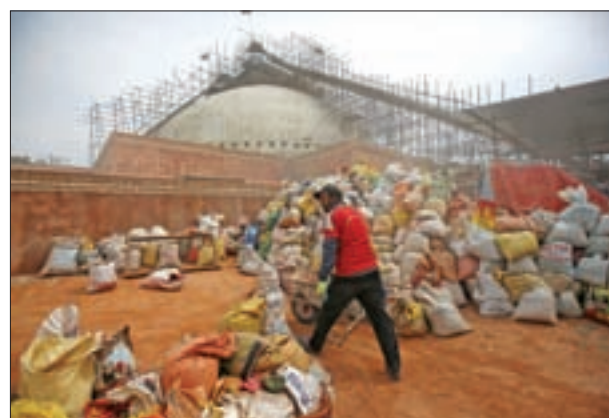
A worker renovates the Boudhanath Stupa, damaged during the April 2015 earthquake, in Kathmandu, Nepal, on 17 March.

"There was no question of not coming back,"