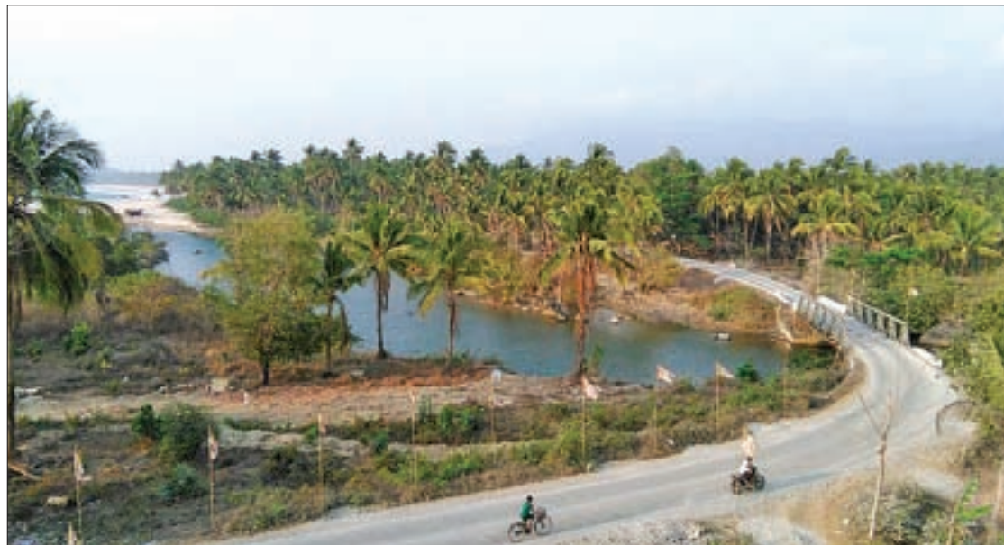
A scenic beauty of coconut plantations.

Coconut plantations located within Kanthaya and Kwel Gyine villages, approximately 15-25 miles outside the centre of Gwa, sell for approximately K400 million per acre because of their proximity to scenic coastlines, whereas coconut plantations in other, less scenic locations are valued at just K200 million per acre, according to local residents.— Myitmakha News Agency