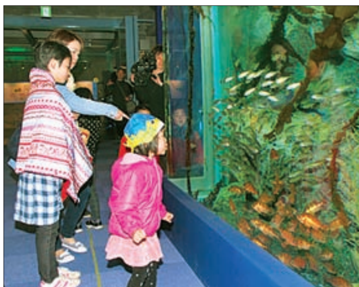
An aquarium destroyed by the earthquake-triggered tsunami of March 2011 reopens for the first time since the disaster in Kuji, Iwate Prefecture, on 23 April 2016. The city government hopes the Moguranpia aquarium will serve as a symbol of the coastal city's reconstruction and draw tourists from around the country.

MORIOKA, (Japan) — An aquarium destroyed by the earthquake-triggered tsunami of March 2011 reopened on Saturday for the first time since the disaster in Kuji, Iwate Prefecture, in northeastern Japan.