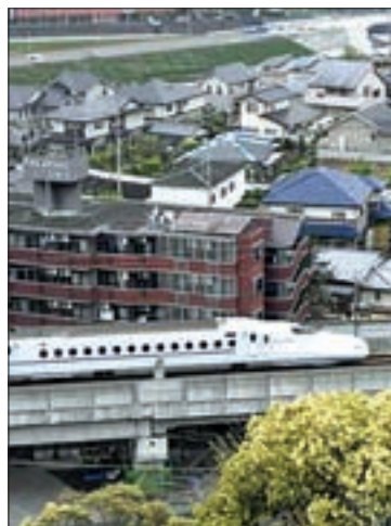
Bullet-train service on the Kyushu Shinkansen Line resumes at a key section linking Fukuoka and Kumamoto prefectures on 23 April 2016, reviving the transport artery blocked by powerful earthquakes that hit the southwestern island of Kyushu a week earlier.

The entire bullet-train line was halted when a 6.5 magnitude