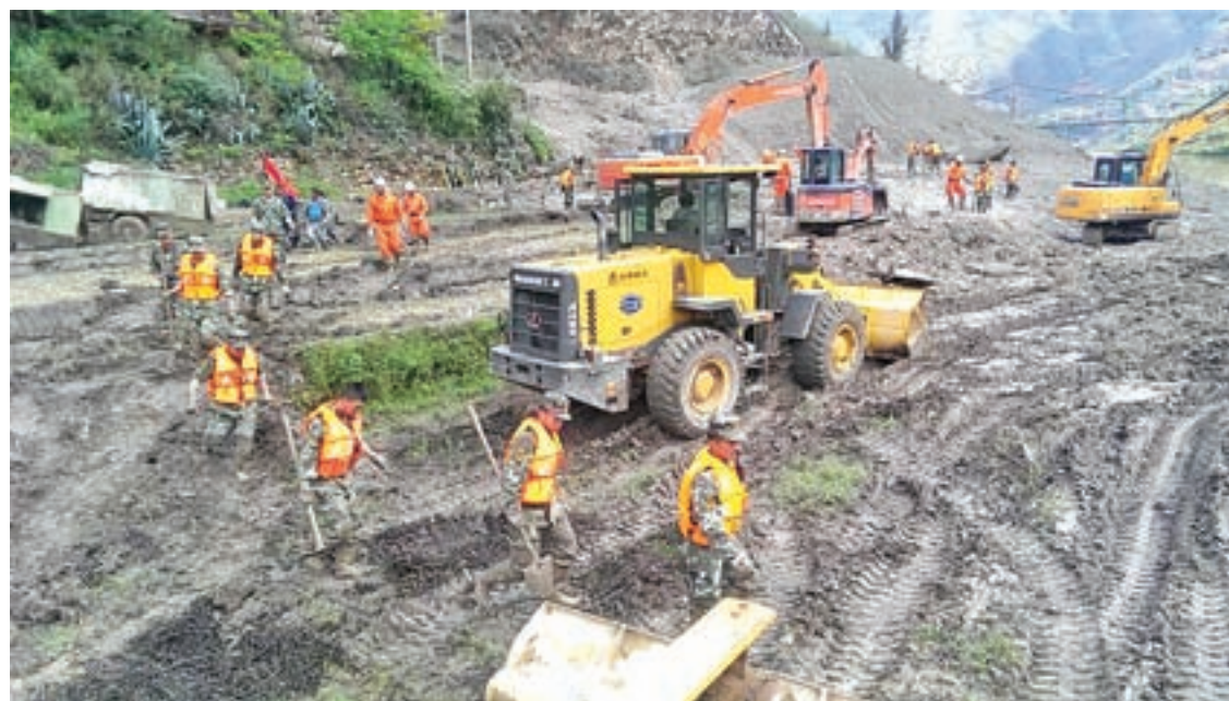
Rescuers work at the site of landslide in Guoli Village of Lanping County in Nuijiang Lisu Autonomous Prefecture, southwest China's Yunnan Province, on 23 April.

KUNMING — Six people are missing after a landslide buried a work shed in southwest China's Yunnan Province Friday, local authorities said.