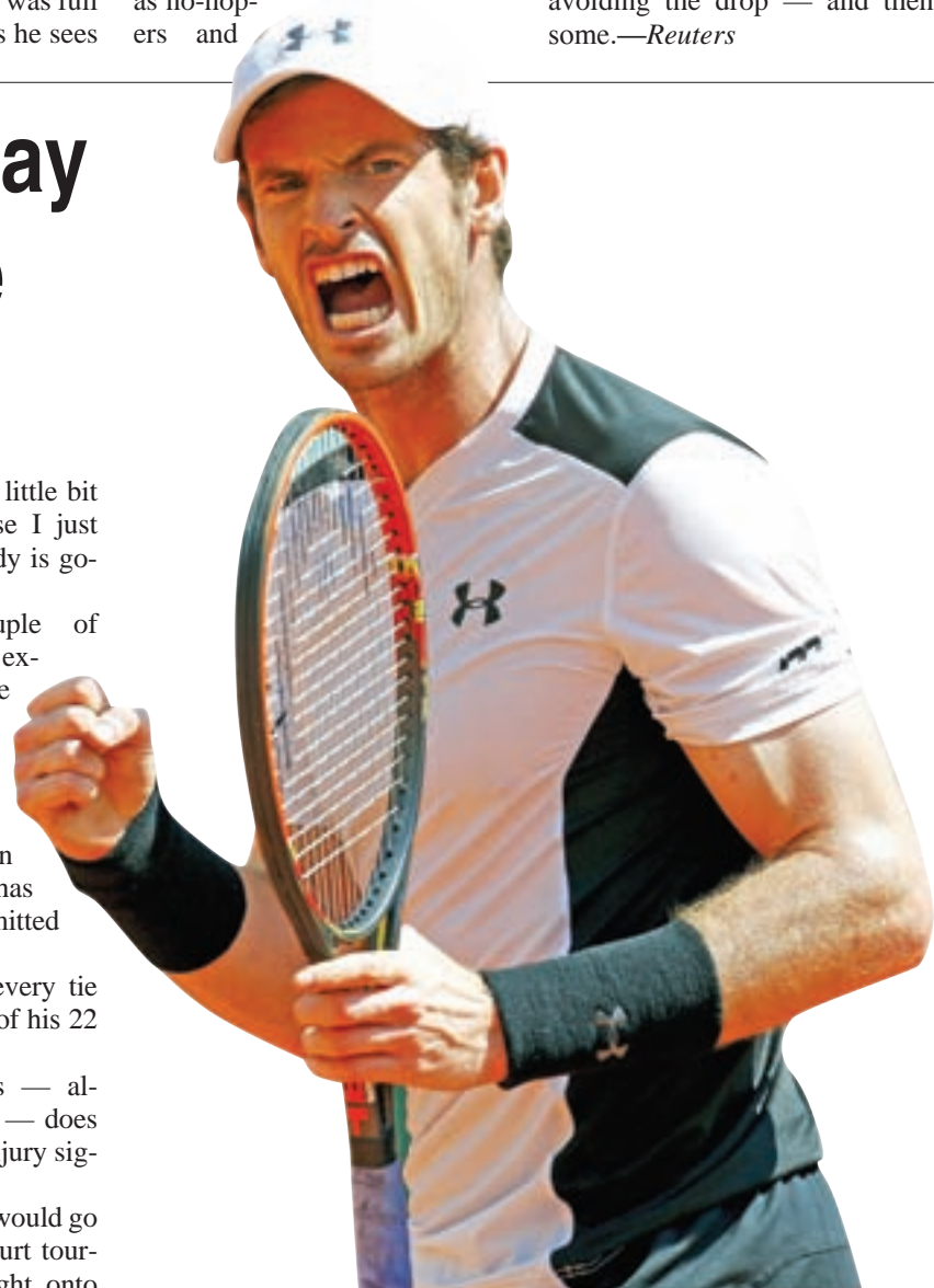
Andy Murray of Britain reacts during Monte Carlo Masters at Monaco on 16 April 2016.

“Not many players would go from playing a grass court tournament one week straight onto the clay the following week with only a couple of days preparation time,” he said.—Reuters