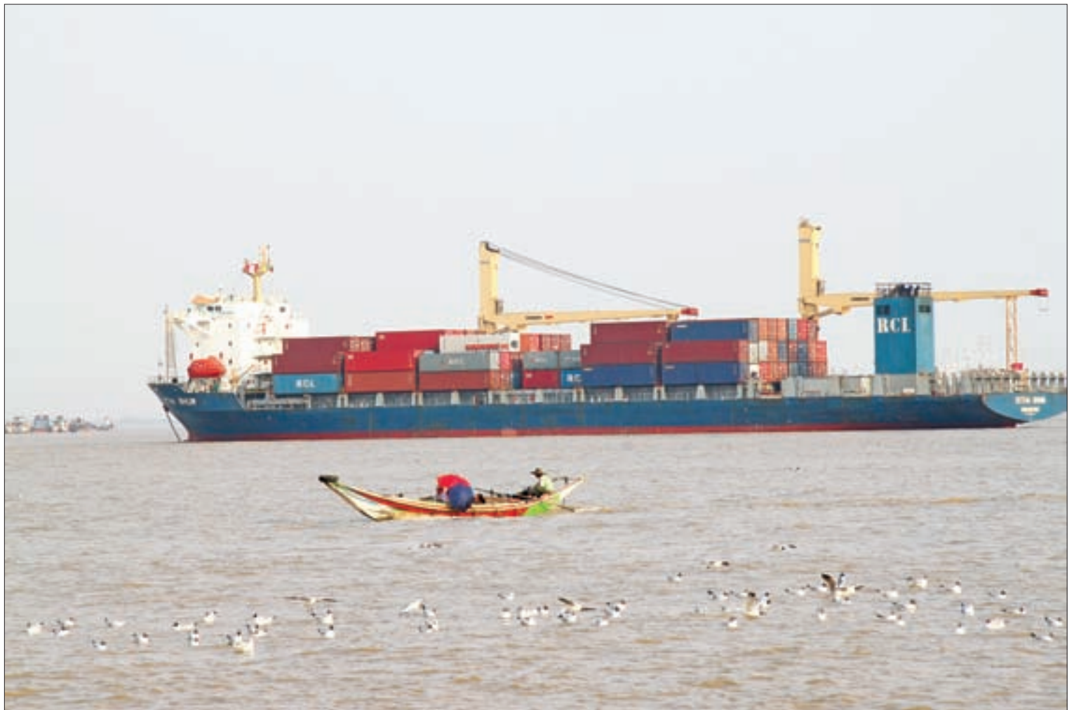
An ocean liner carrying containers is seen in the Yangon River.

"There isn't much mutual co-operation among local businesses," said U Aye Lwin, joint general sec-