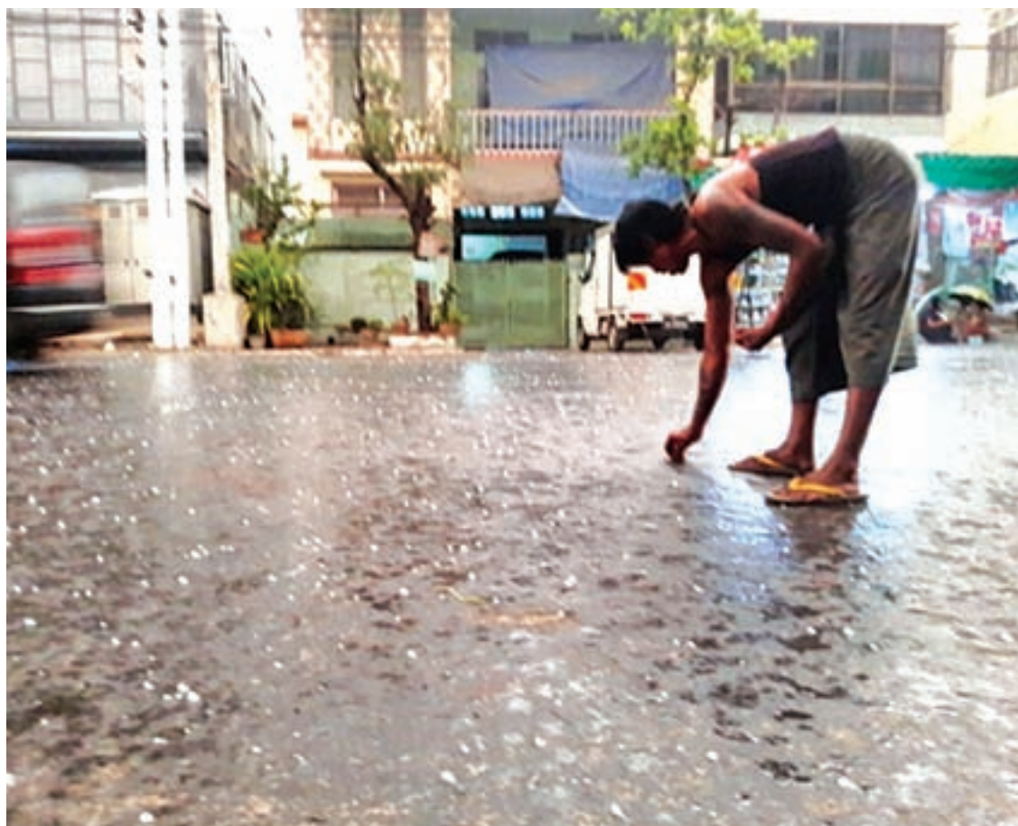
A man seen collecting the hailstones.

BECAUSE of the strong wind swirling from the southwest, the rising temperature of heat and the instability of wind occurred with heavy rain and hailstones falling, the strong wind blowing, thunder striking Mandalay District yesterday evening.