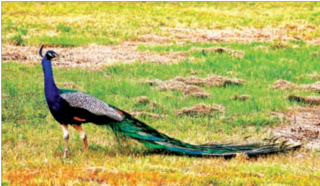
A rare peacock species seen.