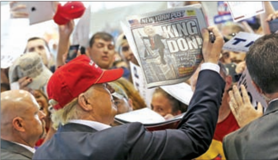
US Republican presidential candidate Donald Trump holds up the front page of the New York Post as he signs autographs at a rally with supporters in Harrington, Delaware, on 22 April.

The comments undercut what his aides had said would be an attempt by the notoriously blunt-speaking Trump to project a more serious image after his win in New York’s nominating contest this week, including by rolling out more policy details. “I can tell you that if I go too presidential, people are going to be very bored,” the New York real estate baron told Fox News in an interview that will air on Saturday. He added that