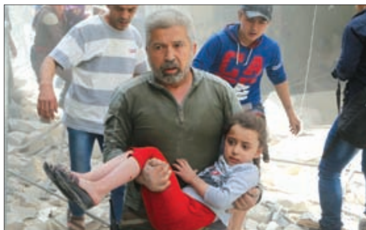
A man carries an injured girl after an airstrike in the rebel held area of old Aleppo, Syria, on 22 April.

But UN envoy Staffan de Mistura said he had no plans to call off the negotiations, the first in five years of conflict to include some rebel factions. He said a ministerial meeting of world powers was urgently needed to get the talks back on track. “Bottom line, I plan to continue the proximity talks, but at the formal level and at the technical level until next week, probably Wednesday as originally planned,” he said. A fragile ceasefire in place