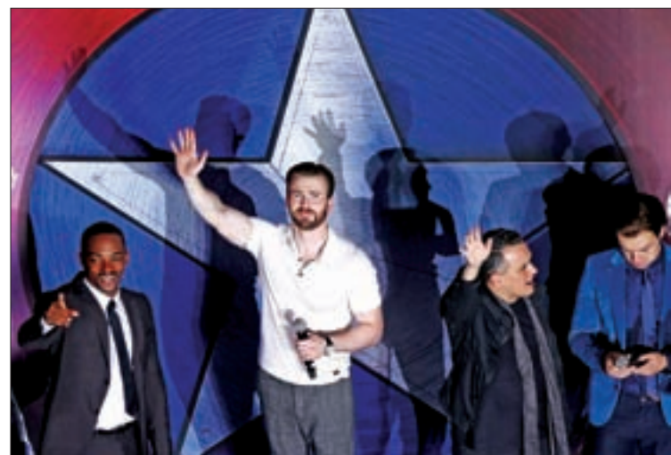
Actors Anthony Mackie, Chris Evans, director Joe Russo and actor Sebastian Stan (L-R) wave to fans.

"It's very tragic, it's heartbreaking," he said. "Prince was such an influence in my life musically ... my eyes teared up when I read about it."—Reuters