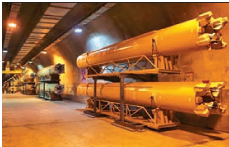
A view of an underground depot where missiles are launched, in an undisclosed location, Iran, in this handout photo released by the official website of Islamic Revolutionary Guard Corps (IRGC) on 8 March.

The DOE expects to resell the purchased heavy water to domestic commercial and research buyers, including a national lab.— Reuters