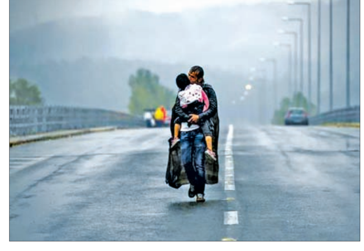
Syrian refugee kisses his daughter as he walks through a rainstorm towards Greece's border with Macedonia, near the Greek village of Idomeni, on 10 September 2015.

The quake has injured at least 2,600 people, damaged over 1,500 buildings, and left 18,000 people spending the night in shelters, according to the leftist government.-Reuters