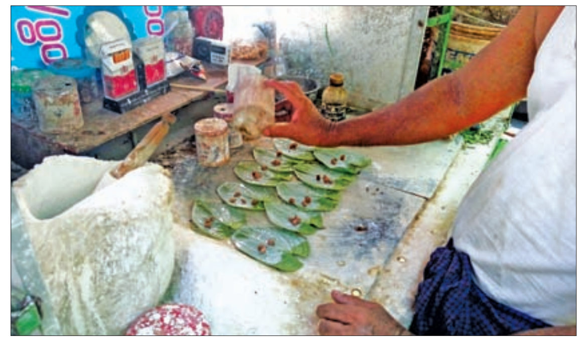
A vendor makes betel for chewing.

During the second step, efforts will be made to stop imports of goods related to betel quid and prescribed periods will be set to educate and take action against betel chewers.