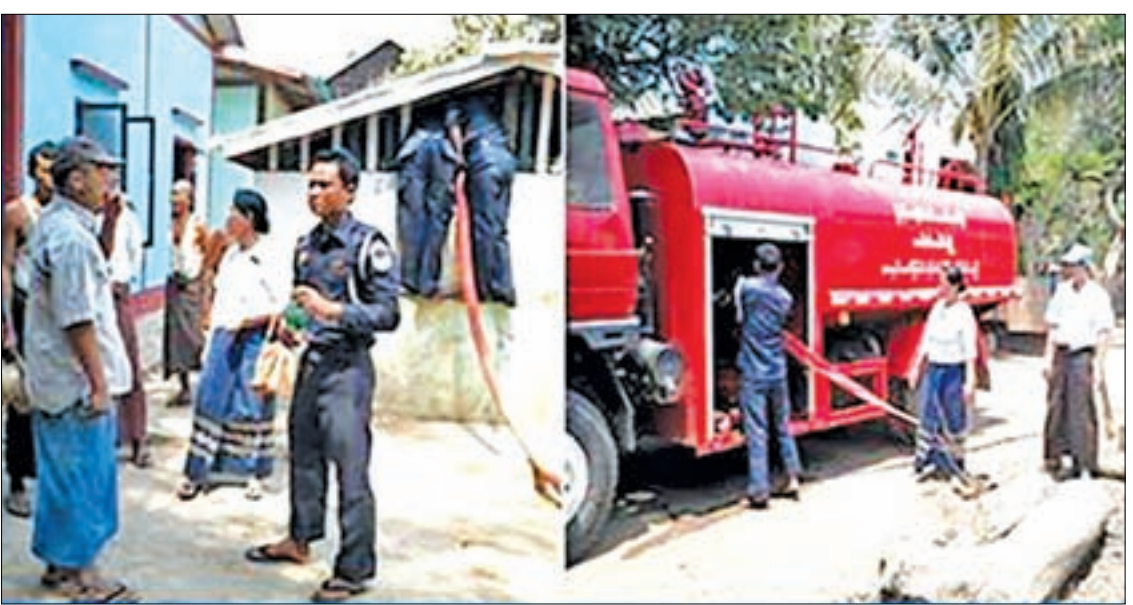
Relief and Resettlement Department of Pyay District distributing water to the villagers of Kaungse and Pyarhtokyun villages.

ter to the residents of Kaungse village on 18 April. On the same day, RRD of Pyay District with the assistance of Paukkhaung Township Fire Brigade Department distributed the water for drinking, bathing and washing to the villagers of Pyarhtokyun village.— District Re lief and Resettlement Depart ment