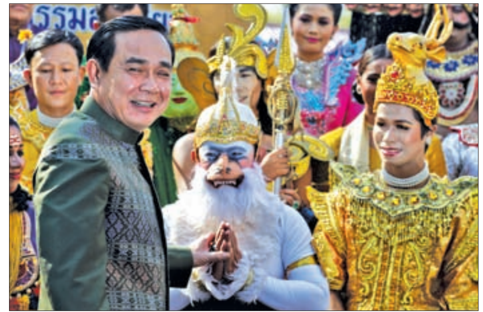
Thailand's Prime Minister Prayuth Chan-ocha greets traditional dancers as he arrives for a weekly cabinet meeting at Government House in Bangkok, Thailand, on 19 April.

Myanmar Daily under Printing Permit No. 00510 and