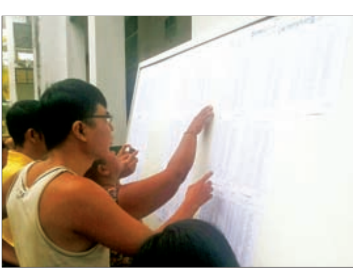
Parents check examination results for their children.

The construction of the library, which measures 34x24 feet, took three months starting on January 10 and was completed on April 10, 2016.-Ye Thura