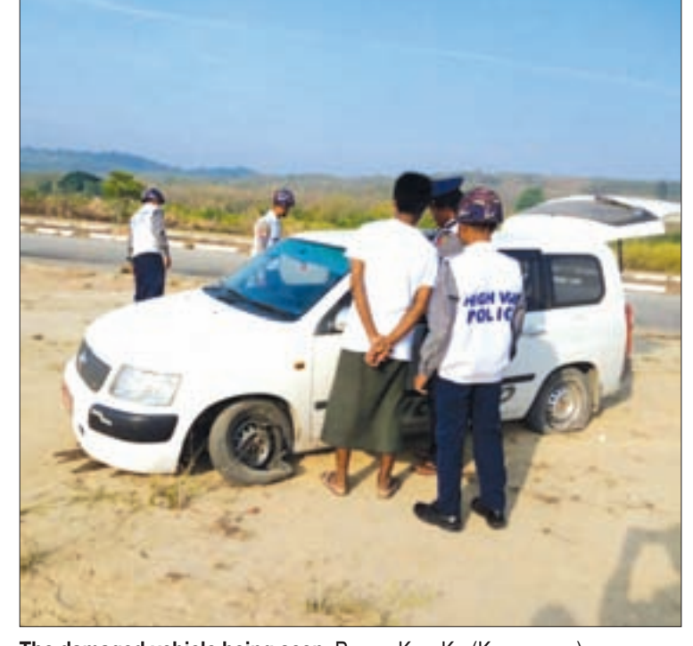
The damaged vehicle being seen.

The accident damaged the vehicle badly. No one was injured in the accident. The driver was deemed guilty of careless driving by the police station.— Khin Ko (Kyauktaka)