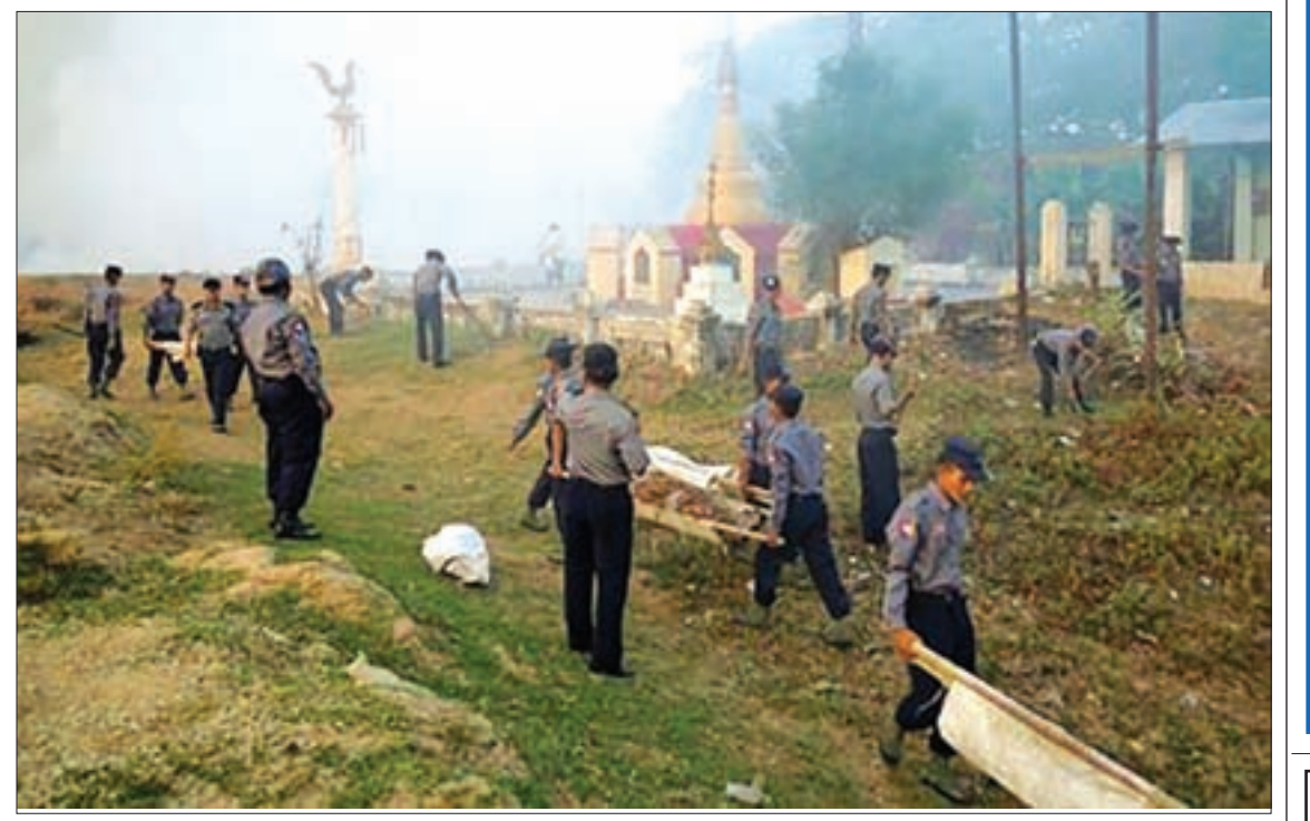
Members of the Wethtigan No 2 Police Training Corps clearing weeds on the precinct of the Yan Aung Myay Pagoda.

A TOTAL of 150 people, including 50 officers from the No 2 Police Training Corps in Wethtigan, Pyay Township, Bago Re-