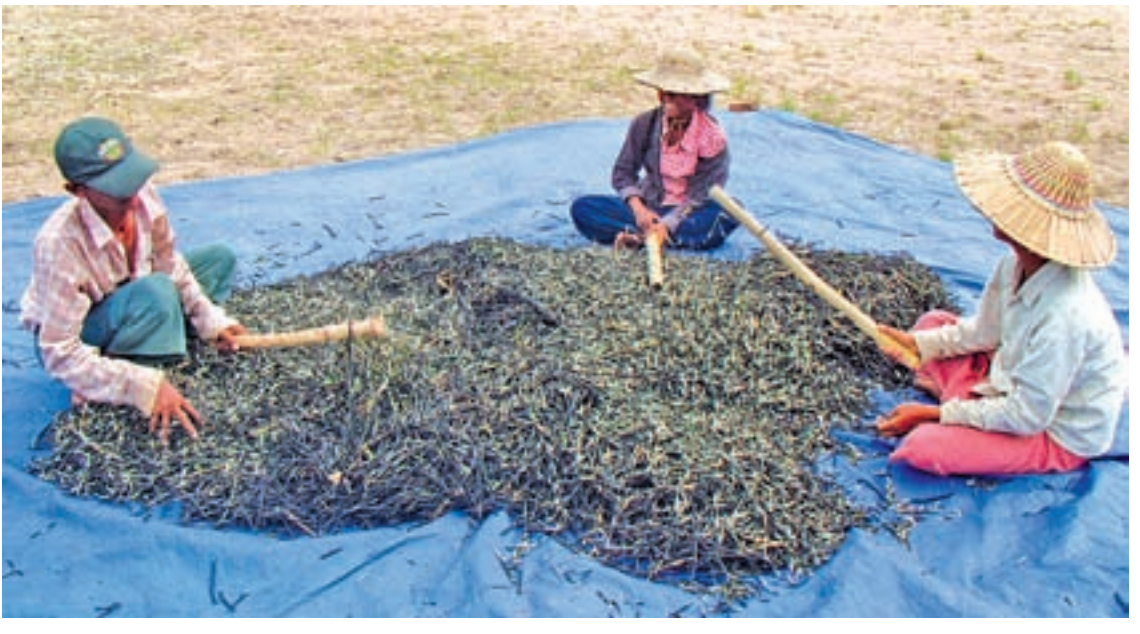
Farmers work on a farm as they harvest beans at a village near Nay Pyi Taw.

According to market sources, most of bean stocks are in the hands of traders as harvest time is over. Myanmar bean varieties are in good demand for export as they are grown without the use of chemicals.—Aung Thant Khaing