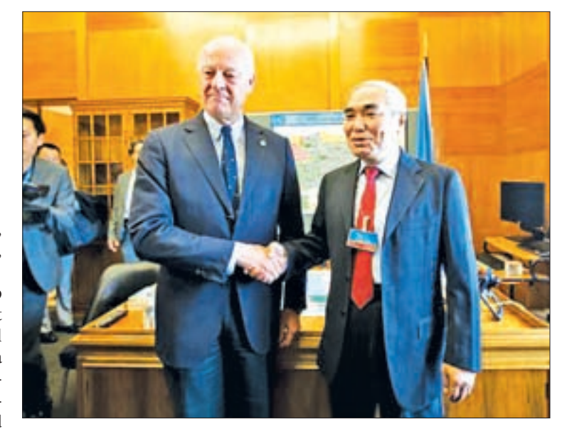
UN Special Envoy for Syria Staffan de Mistura (L) shakes hands with China's Special Envoy for Syria Xie Xiaoyan on the sidelines of Syrian peace talks at the United Nations in Geneva, Switzerland, on 18 April.