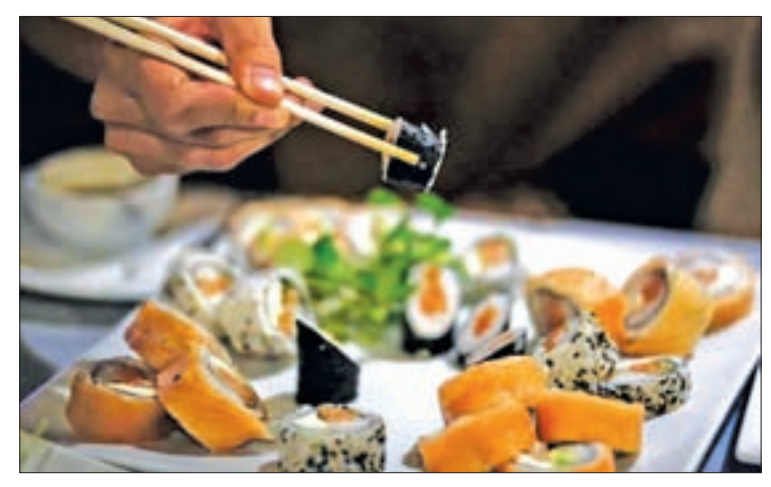
A woman uses chopsticks to eat sushi at a restaurant in La Serena, Chile, in 2015.

NEW YORK — This year, the Passover menus of many American Jews may feature rice and beans or sushi for the first time, thanks to new rules taking them off the list of foods forbidden during the elaborate meals prepared for the long holiday, which begins on Friday.