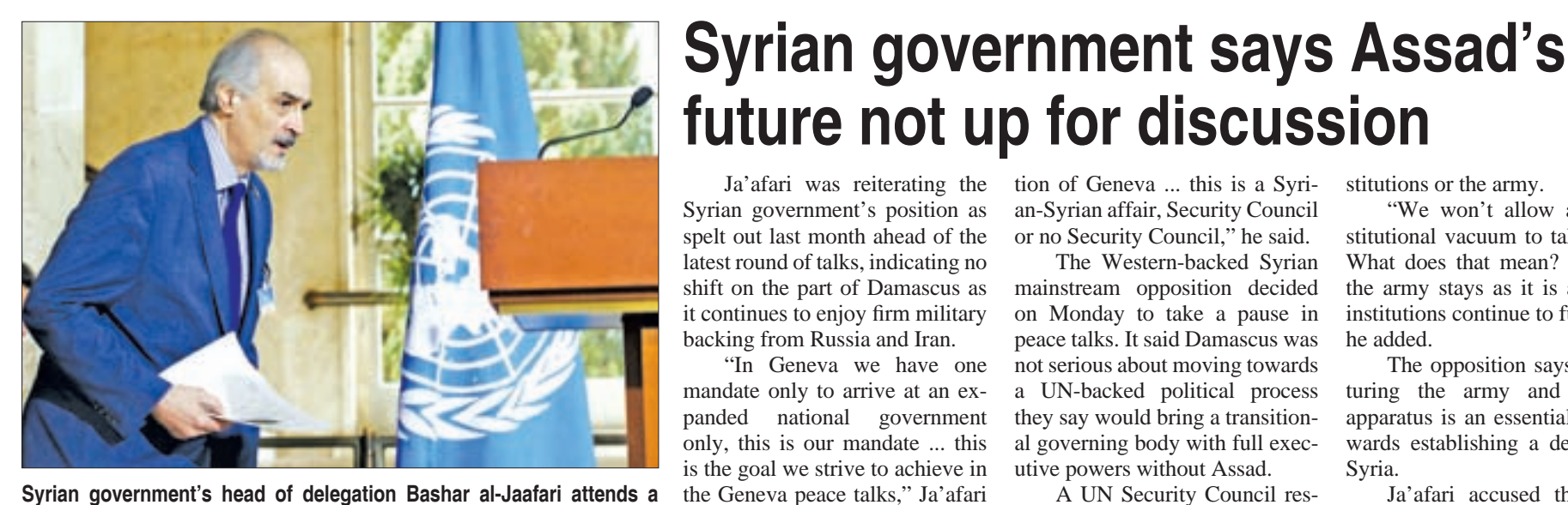
Syrian government's head of delegation Bashar al-Jaafari attends a news conference after a meeting on Syria at the European headquarters of the United Nations in Geneva, Switzerland, on 18 April.

BEIRUT — The Syrian government's chief negotiator said President Bashar al-Assad's future was not up for discussion at peace talks, underlining the bleak prospects for reviving UNled negotiations postponed by the opposition.