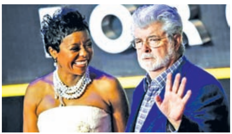
George Lucas and his wife Mellody Hobson arrive at the European Premiere of Star Wars, The Force Awakens in Leicester Square, London, in December 2015.

The mayor offered the Mc-Cormick Place site for the museum after a parks protection group filed a lawsuit over the original lakefront site near Soldier Field, the home of the Chicago Bears football team, stalling the project.— Reuters