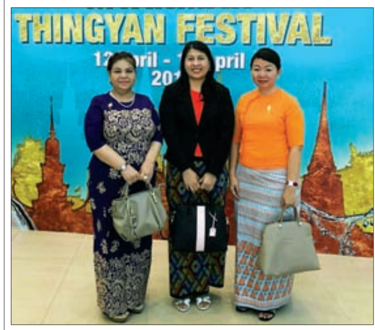
Adelegate of Myanmar Women Entrepreneurs' Association seen off at Yangon International Airport before leaving for Hanoi.

She was seen off at Yangon International Airport by responsible persons of the association.-MWEA