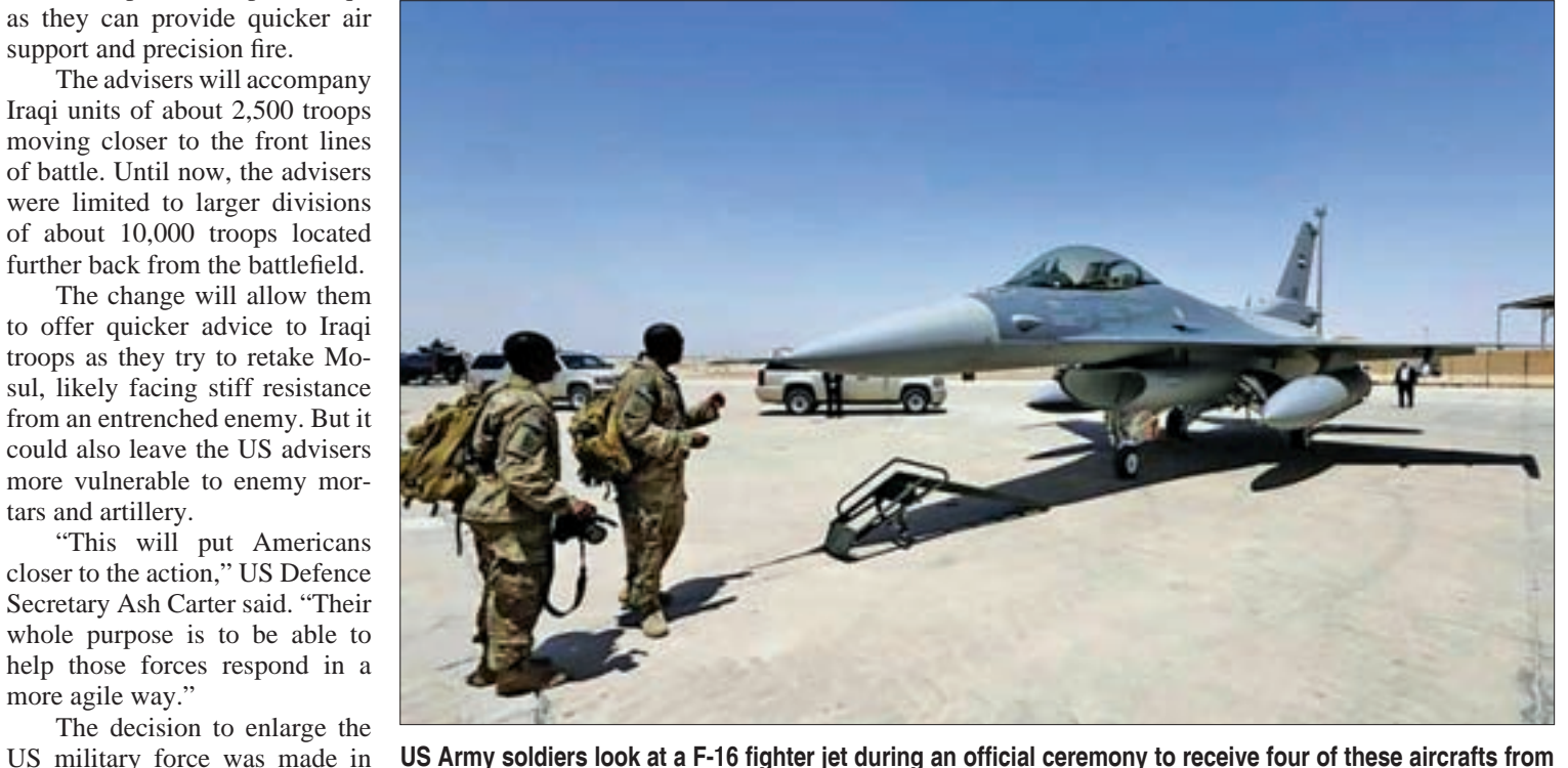
US Army soldiers look at a F-16 fighter jet during an official ceremony to receive four of these aircrafts from the US, at a military base in Balad, Iraq, in 2015.

"If it doesn't take us all the way, we'll come back and have another discussion and ask for more if we need to," McFarland said.-Reuters