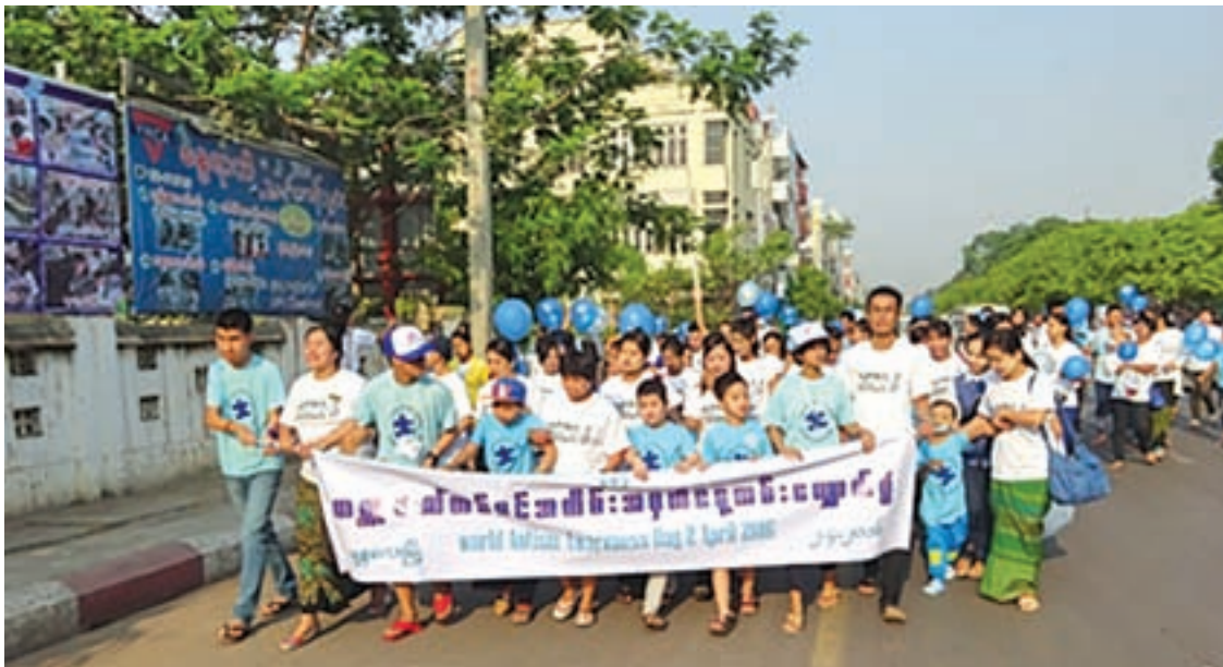
Children with autism and participants celebrate Autism Awareness Day.

WITH the aim of encouraging people to take measures to raise public awareness and understanding of children with autism the Myanmar Autism Association (Mandalay) held a mass walk and education talk to mark Autism Awareness Day at the Young Men's Christian Association (YMCA) in Mandalay yesterday.