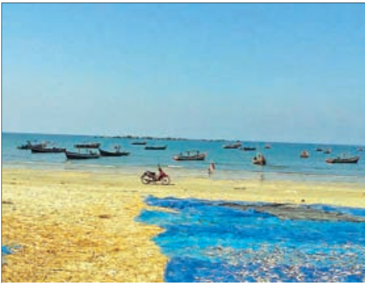
Fishing boats are seen in Sittway.

According to the district level Department of Fisheries, until the end of last year, there were 208 licensed motorized near-shore fishing vessels and 482 non-motorised vessels, while unlicensed non-motorised fishing boats numbered approximately 1,000.—Myitmakha News Agency