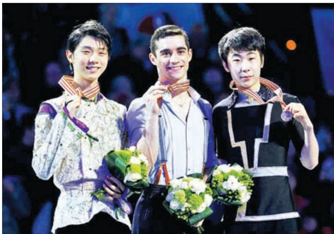
Silver medalist Yuzuru Hanyu (L) of Japan, gold medalist Javier Fernandez (C) of Spain, and bronze medalist Jin Boyang of China pose for photographs on the awards podium during ISU World Figure Skating Championships, Mens Free Skate Programme at Boston, Massachusetts, United States on 1 April.

Canadian Olympic silver medalist and Four Continents champion Patrick Chan settled for fifth place.