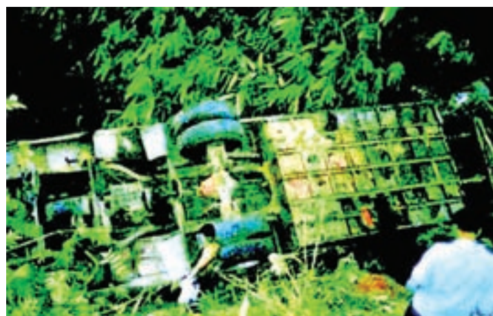
A passenger bus seen being turned over in Karathure town.