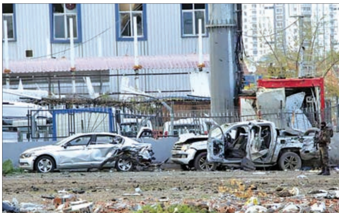
A member of the police special forces stands next to vehicles, which were damaged by a car bomb attack that targeted a minibus (not pictured) carrying members of the police special forces, occurred in the Kurdish-dominated southeastern city of Diyarbakir, Turkey on 31 March 2016.

Opposition parties estimate that between 500 and 1,000 civilians have also been killed in the fighting, largely focused in densely populated urban centres.—Reuters