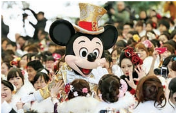
A Coming-of-Age ceremony held at Tokyo Disneyland near Tokyo. Around 1,400 young adults attended the event organized by the municipal government of Urayasu.

The parks drew a total of 30.19 million visitors in fiscal 2015, the third highest on record but down 3.8 per cent from the year before, which saw a record high, their operator Oriental Land Co. said Friday. The Disney parks marked a record number of visitors in fiscal 2014 thanks to popular events featuring the hit Disney movie "Frozen," and the second-highest number in fiscal 2013 when a series of events commemorating Tokyo Disneyland's 30th anniversary were held. — Kyodo News