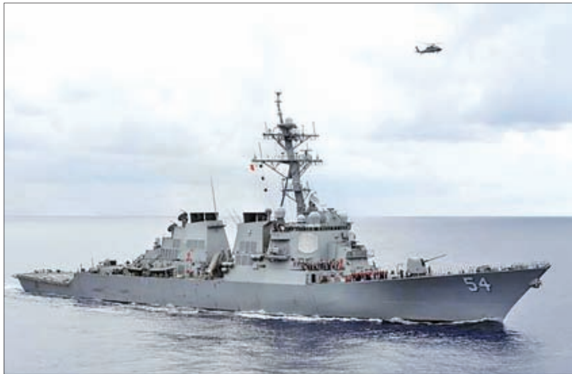
The US Navy guided-missile destroyer USS Curtis Wilbur patrols in the Philippine in 2013.

WASHINGTON — The US Navy plans to conduct another passage near disputed islands in the South China Sea in early April, a source familiar with the plan said on Friday, the third in series of challenges that have drawn sharp rebukes from China.