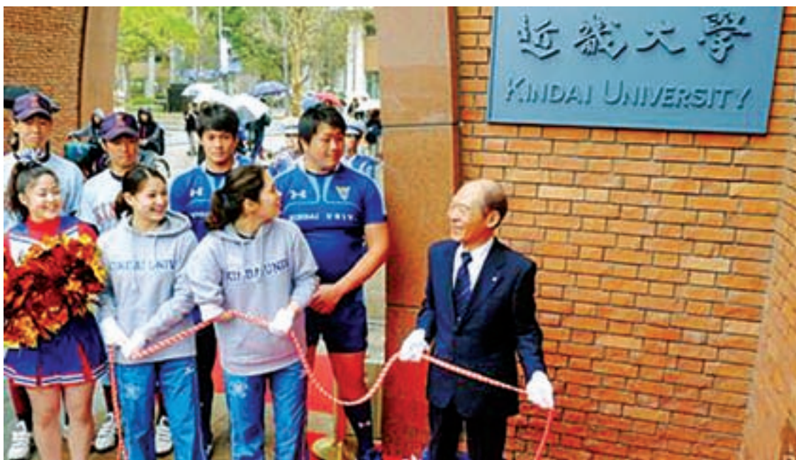
A ceremony is held 1 April 2016, to unveil a new nameplate of Kindai University in Osaka Prefecture, western Japan. In a move aimed at sparing its students and faculty embarrassment, the private university ditched its former English name, "Kinki University" — with "Kinki" pronounced identically to "kinky" — for a more benign moniker.

According to the university, "Kinki" derives from "Kinai," which referred to a large administrative district in western Japan dating back to the 7th century, roughly corresponding to parts of the current Nara, Kyoto, Osaka and Hyogo prefectures. "Kinki" means "the capital and surrounding areas." — Kyodo News