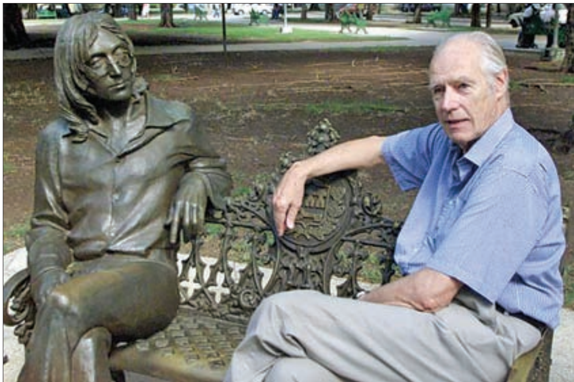
Former Beatles producer Sir George Martin visits a sculpture of John Lennon in a Havana park named after the musician in 2002.

The show is dedicated to music producer George Martin, who died last month at the age of 90 and an actor portraying the