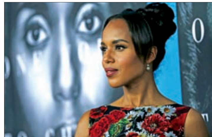
Cast member Kerry Washington poses at the premiere for the television movie 'Confirmation' in Los Angeles, California on 31 March 2016.

LOS ANGELES — Kerry Washington may be best known as political fixer Olivia Pope in ABC's hit drama "Scandal," but for her latest role, the actress explored the murky undertones of sexual harassment in US politics in HBO film "Confirmation."