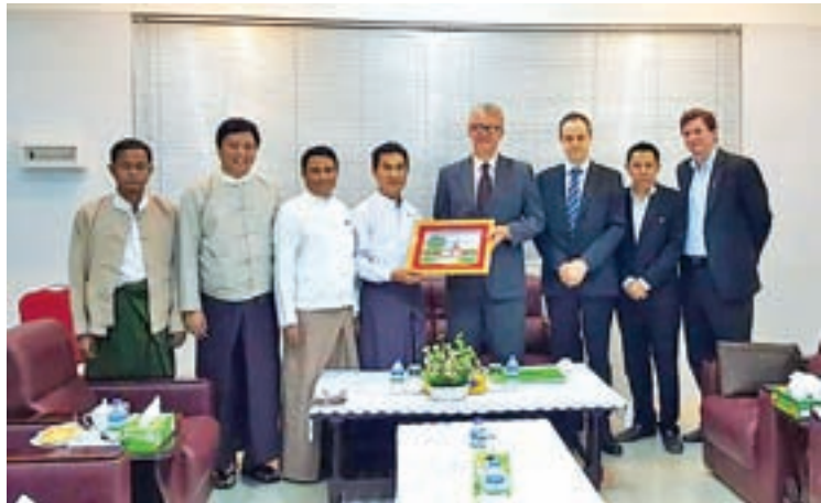
MRCCI officials present gifts to the Finnish delegation.