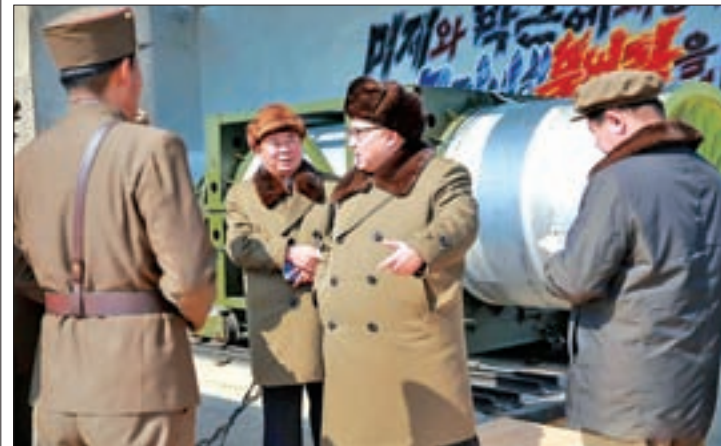
Photo provided by Korean Central News Agency (KCNA) on 24 March 2016 shows the top leader of the Democratic People’s Republic of Korea (DPRK) Kim Jong Un guiding a ground test for heavy-lift, solid-fuel rocket engine and its separation. PHOTO: XINHUA

Pyongyang has repeatedly denounced the US-South Korea military exercises as a dress rehearsal for northward invasion. — Xinhua