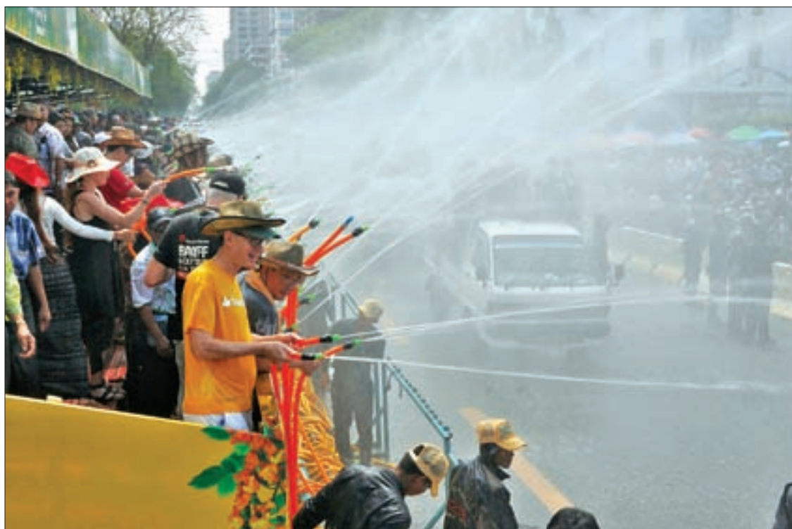
People participate in the Thingyan Festival in Yangon last year.