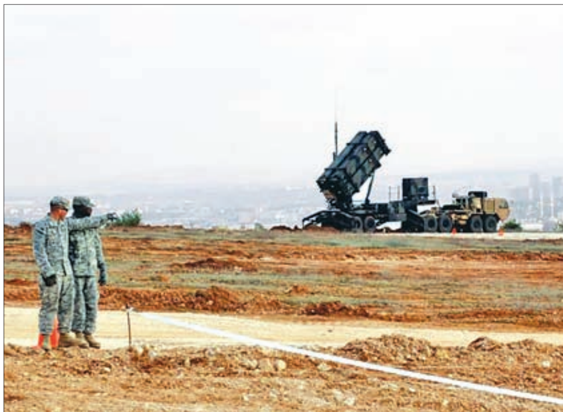
US soldiers stand guard beside a US Patriot missile system at a Turkish military base in Gaziantep in 2013.

US officials say the group is losing a battle to forces arrayed against it from many sides in the vast region it controls. In Iraq, the group has been pulling back since December when it lost Ramadi, the capital of the western province of Anbar. In Syria, the jihadist fighters have been pushed out