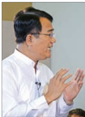
Dr Yan Myo Thein.

"The NLD administration looks worried. In fact, the