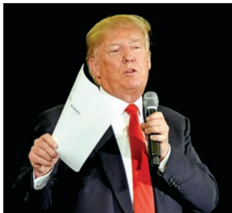
Republican US presidential candidate Donald Trump speaks at a town hall event in Appleton, Wisconsin, on 30 March.

Asked what he would do if he didn't get the Republican nomination, Trump replied: "We're going to have to see how I was treated." —Reuters