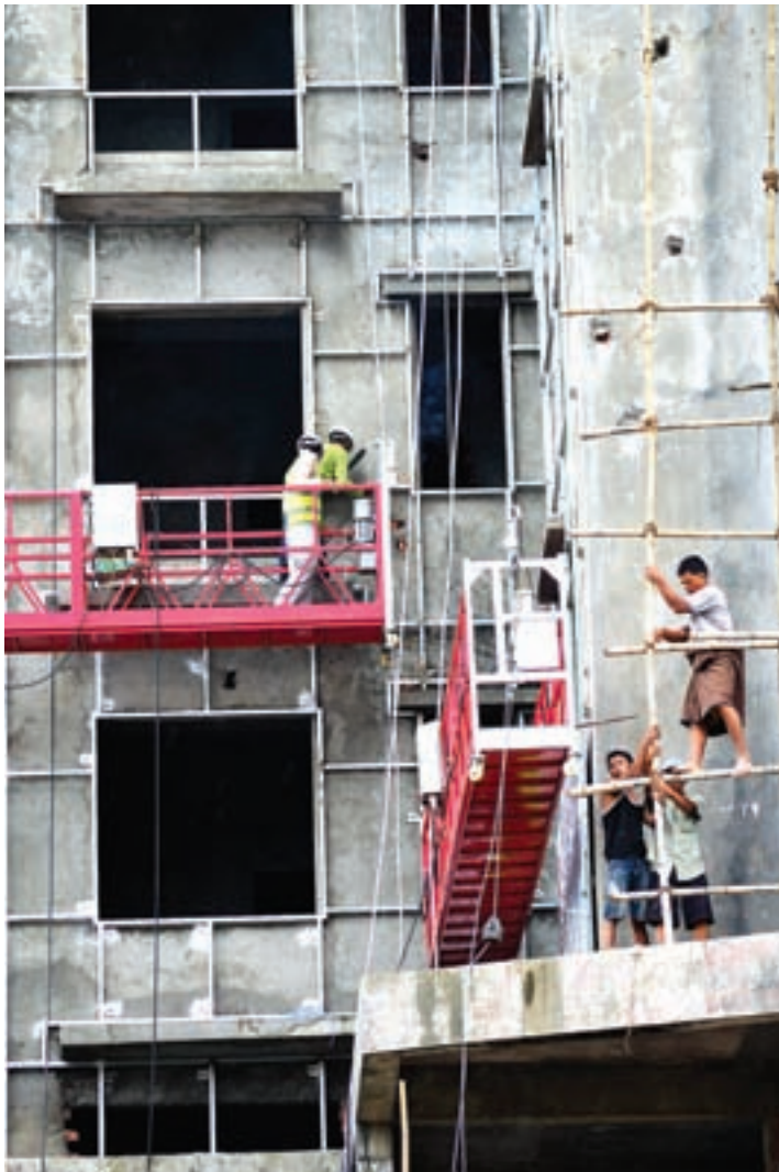
Workers are seen at a construction site in Yangon.