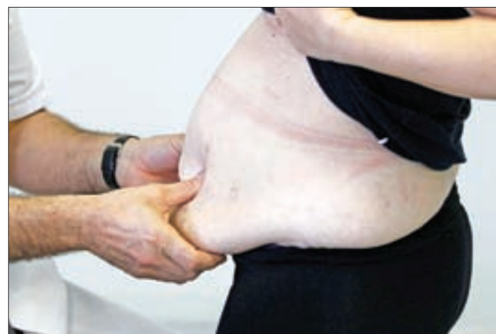
A surgeon examines an obese patient in his office as she prepares for surgery at a hospital, in Saint Jean d'Angely, southwestern France.

The three additional studies examined math performance, math identification and interest in STEM when thinking about romantic goals.—PTI