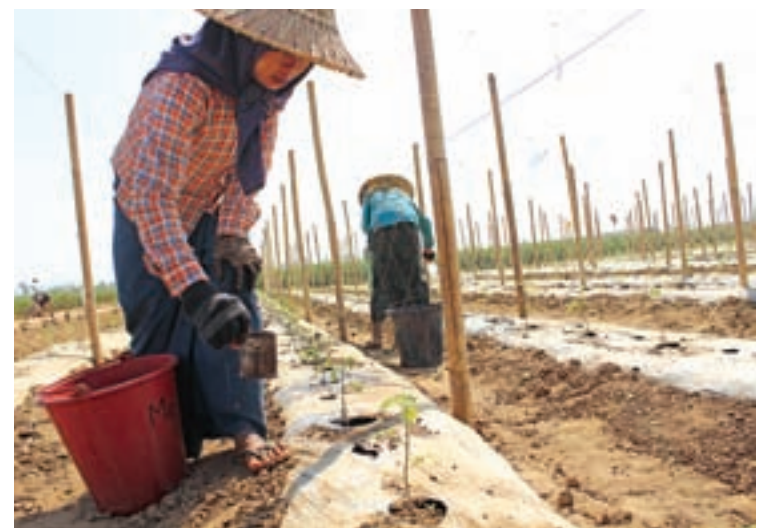
Workers water plants at the organic farm in Nay Pyi Taw.