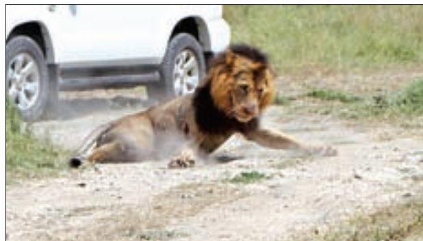
A stray male lion falls after it was shot by a Kenya Wildlife Services (KWS) ranger in the Isinya area of Kajiado county after it attacked and injured a local resident on outskirts of the capital Nairobi, Kenya on 30 March 2016.