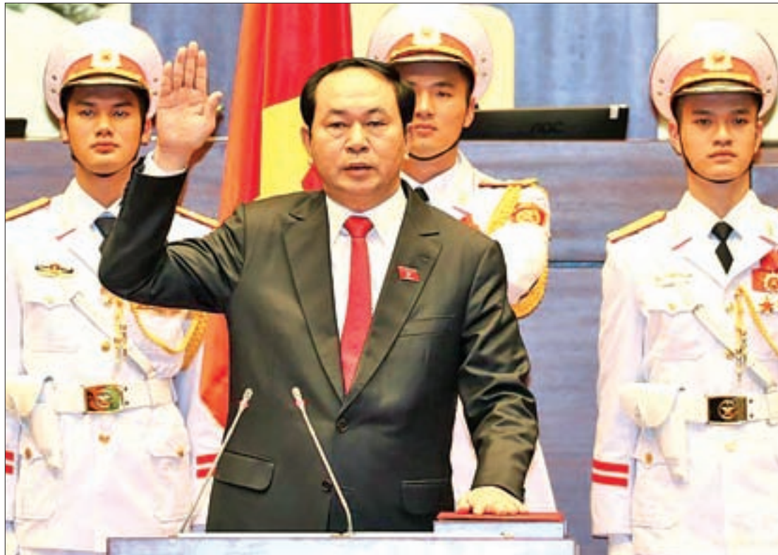
Viet Nam's new President Tran Dai Quang (front) delivers the sworn-in statement after being elected as the country's president in Hanoi, capital of Viet Nam, on 2 April. The National Assembly (NA) of Viet Nam on Saturday elected Tran Dai Quang as the country's president in capital Hanoi.

After the election, in his sworn-in statement, Quang said "In front of the sacred national flag, the National Assembly and voters nationwide, I, Tran Dai Quang, president of the Socialist Republic of Vietnam, swear: To be absolutely loyal to