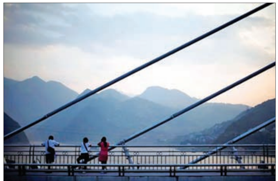
People look at the Yangtze River as they stand on a bridge in Badong city, 100km (62 miles) from the Three Gorges dam in Hubei Province on 7 August 2012.

Most of the global production of these four crops comes from a small number of countries such as China, the United States and India. —Reuters