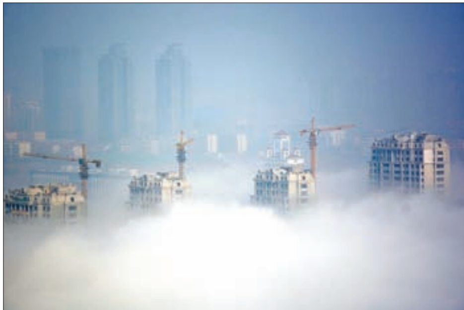
Buildings under construction are seen during a hazy day in Rizhao, Shandong Province, China, on 15 March.

When the initiative was announced last year, it pointed