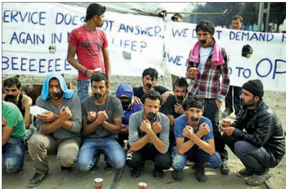
Migrants and refugees with their mouths taped stage a protest at a makeshift camp at the Greek-Macedonian border near the village of Idomeni, Greece, on 1 April.

the possibility of resistance when the EU-Turkey plan to send back all migrants and refugees who have reached the Greek islands since 20 March goes into effect from Monday.