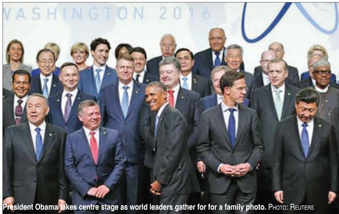
President Obama takes centre stage as world leaders gather for for a family photo.