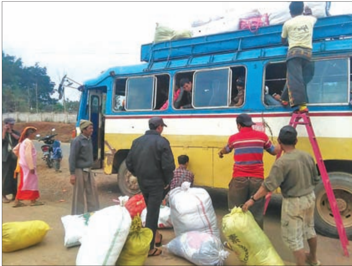
Displaced persons leave IDP camps in Kyaukme for home in mid-March.

All remaining aid food left at the camps will be distributed to people in conflict-afflicted villages, it has been learned.