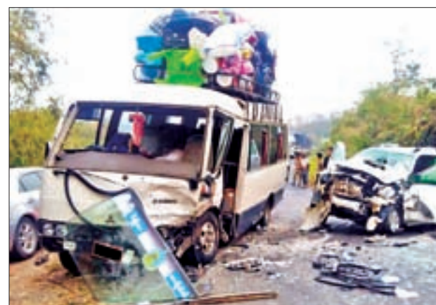
Damaged cars seen at the scene for the accident.

Heho town and seized 3 grams of heroin and 170 yaba pills. Police have filed charges against all suspects under the Anti-Narcotic Drugs and Psychotropic Substances Laws. — Myanmar Police Force