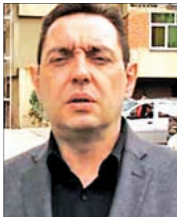
Serbian Minister of Labour, Employment, Veteran and Social Policy Aleksandar Vulin.

"Serbia will respect its own Constitution, Kosovo-Metohija will never be recognised as an independent state and Serbia has not the least intention to change the policy," Vulin told reporters, replying to a question of how Serbia would react if recognition of KiM was put before Serbia as a precondition for joining the Eu-