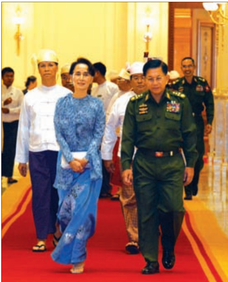
Daw Aung San Suu Kyi and Commander-in-Chief Senior General Min Aung Hlaing are seen on the way to the parliament.

MYANMAR'S new government formed a new 11-member National Defense and Security Council yesterday with President U Htin Kyaw as its chairman, according to an announcement from the President's Office. The National Defence and Security Council also includes Daw Aung San Suu Kyi, chairperson of the National League for Democracy, and Commander-in-Chief of Defence Services Senior General Min Aung Hlaing, along with the two vice presidents, the speakers of the two houses of parliament, the deputy commander-in-chief of defence services and the ministers of defence, home affairs and border affairs. Daw Aung San Suu Kyi joins the council as the Union Minister for Foreign Affairs.— GNLM