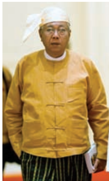
President U Htin Kyaw.

“Japan is certain that democratization, rule of law, economic reform and national reconciliation will be further promoted under the leadership” of President Htin Kyaw and Foreign Minister Suu Kyi, the statement said.— Kyodo News