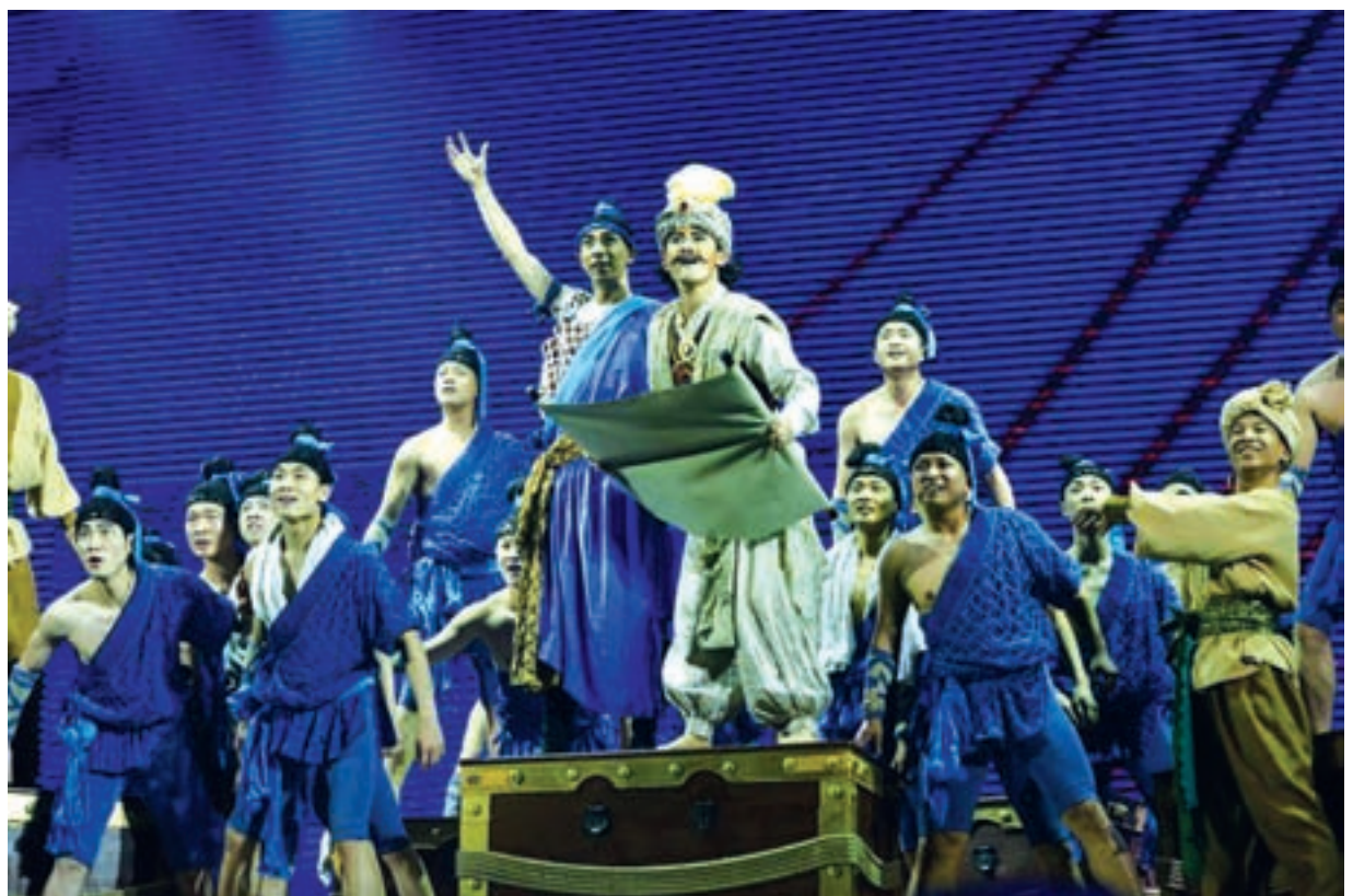
Dancers perform during the dance drama "Dream of the Maritime Silk Road" at a performance hall in Kuala Lumpur, capital of Malaysia, on 29 March, 2016. The dance drama featuring Chinese father and son who set sails on the ancient Maritime Silk Road centuries ago debuted in Southeast Asia on Tuesday.