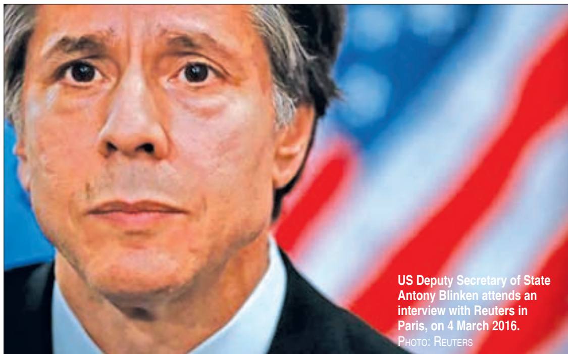
US Deputy Secretary of State Anthony Blinken attends an interview with Reuters in Paris, on 4 March 2016.