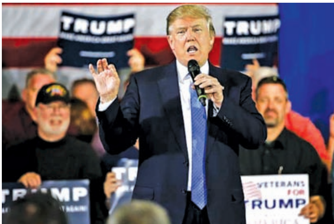
Republican US presidential candidate Donald Trump speaks during a Town Hall in Janesville, Wisconsin on 29 March 2016.

WASHINGTON — Republican front-runner Donald Trump on Tuesday abandoned a pledge to support a party presidential nominee other than himself, a sign of increasing friction with chief rival Ted Cruz.