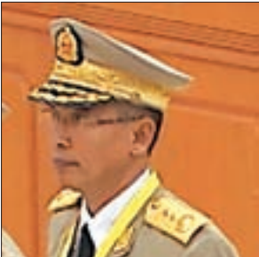
Lt-Gen Sein Win