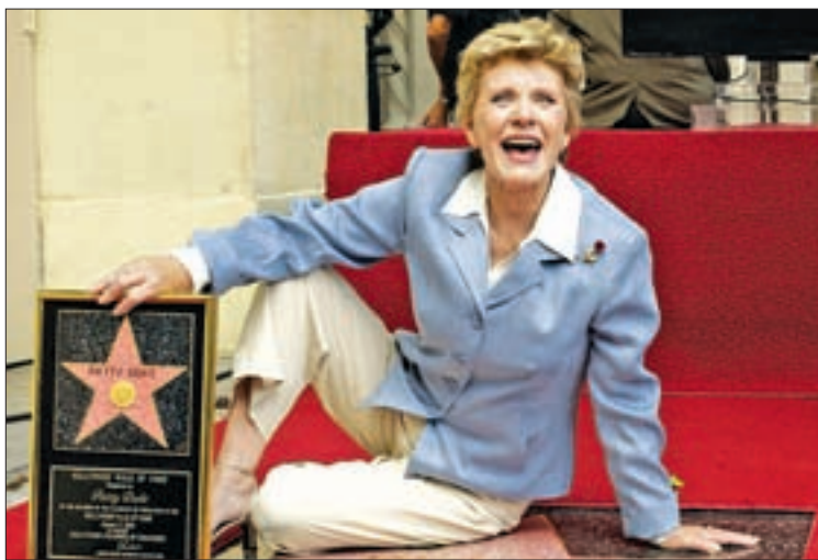
Actress Patty Duke.

She won a best supporting actress Oscar for playing deaf-blind author and activist Helen Keller in 1962's "The Miracle Worker" at age 16, and later won an Emmy for playing Keller's instructor Annie Sullivan in 1979's TV movie of the same