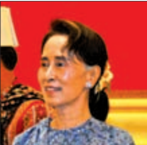
Daw Aung San Suu Kyi

Sd/ Htin Kyaw President Republic of the Union of Myanmar