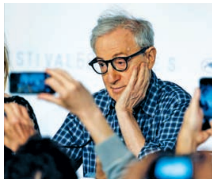
Journalists take pictures with their mobile phones as director Woody Allen attends a news conference during the 68 th Cannes Film Festival in Cannes, southern France, on 15 May 2015.

Along with elephants, the Leuser Ecosystem is the "last place on Earth" where orangutans, tigers and rhinos coexist.—PTI