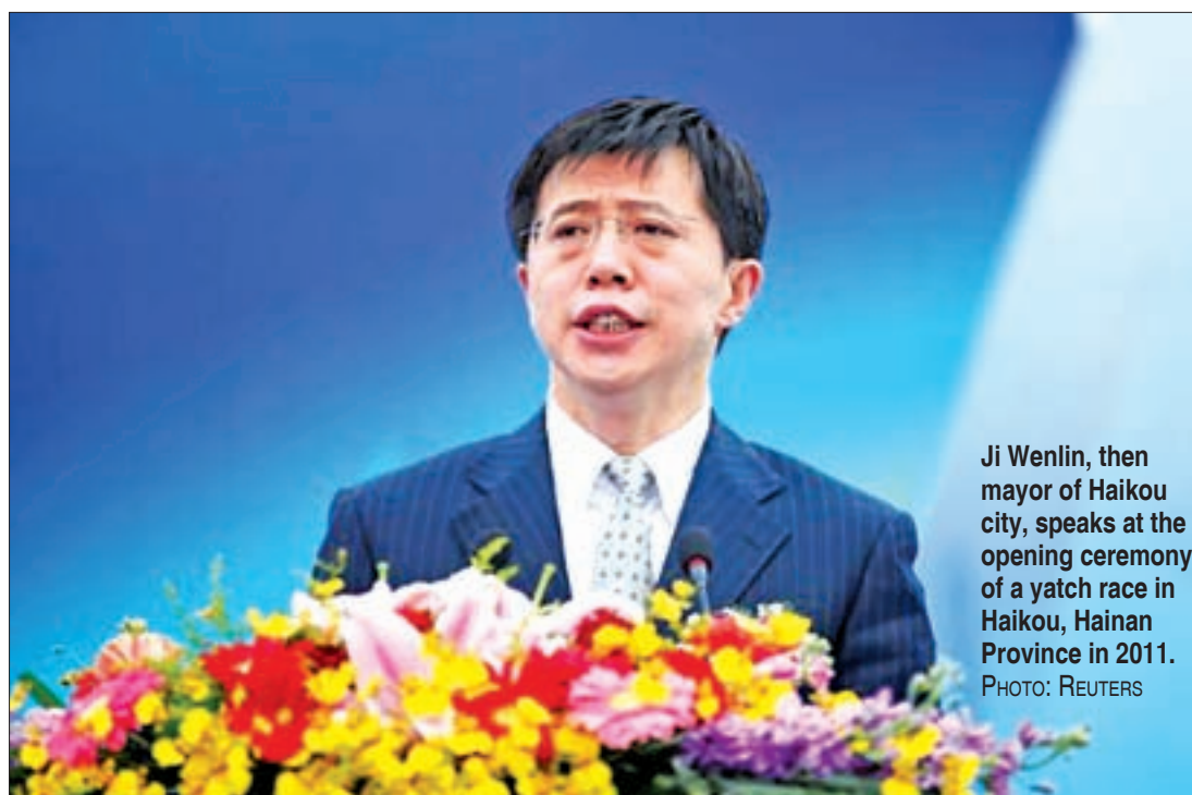
Ji Wenlin, then mayor of Haikou city, speaks at the opening ceremony of a yacht race in Haikou, Hainan Province in 2011.

"All those who think they can direct Serbia's domestic or external politics must know that this is impossible," said Vulin.— Tanjug