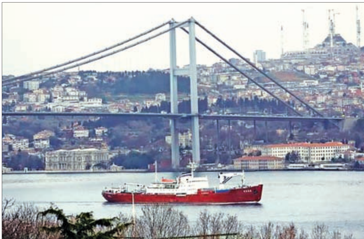
The Russian Navy's transport ship Yauza, with the Bosphorus bridge in the background, sets sail in the Bosphorus, on its way to the Mediterranean Sea, in Istanbul, Turkey on 20 February 2016.

the ships were carrying or how much equipment has been flown out in giant cargo planes accompanying returning war planes.