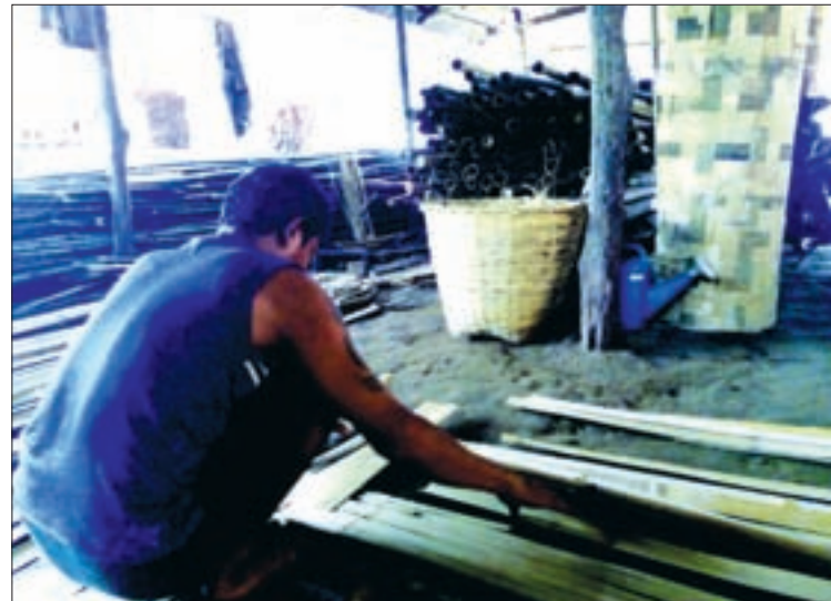
Labour shortages have caused bamboo matting to halt in Tatkon.

K4,500 a few days ago. "There are many sellers as they can make good profits," said local poultry farmers from Natmauk, Gwaykon and Yeynangyaung.—SS/Union Daily