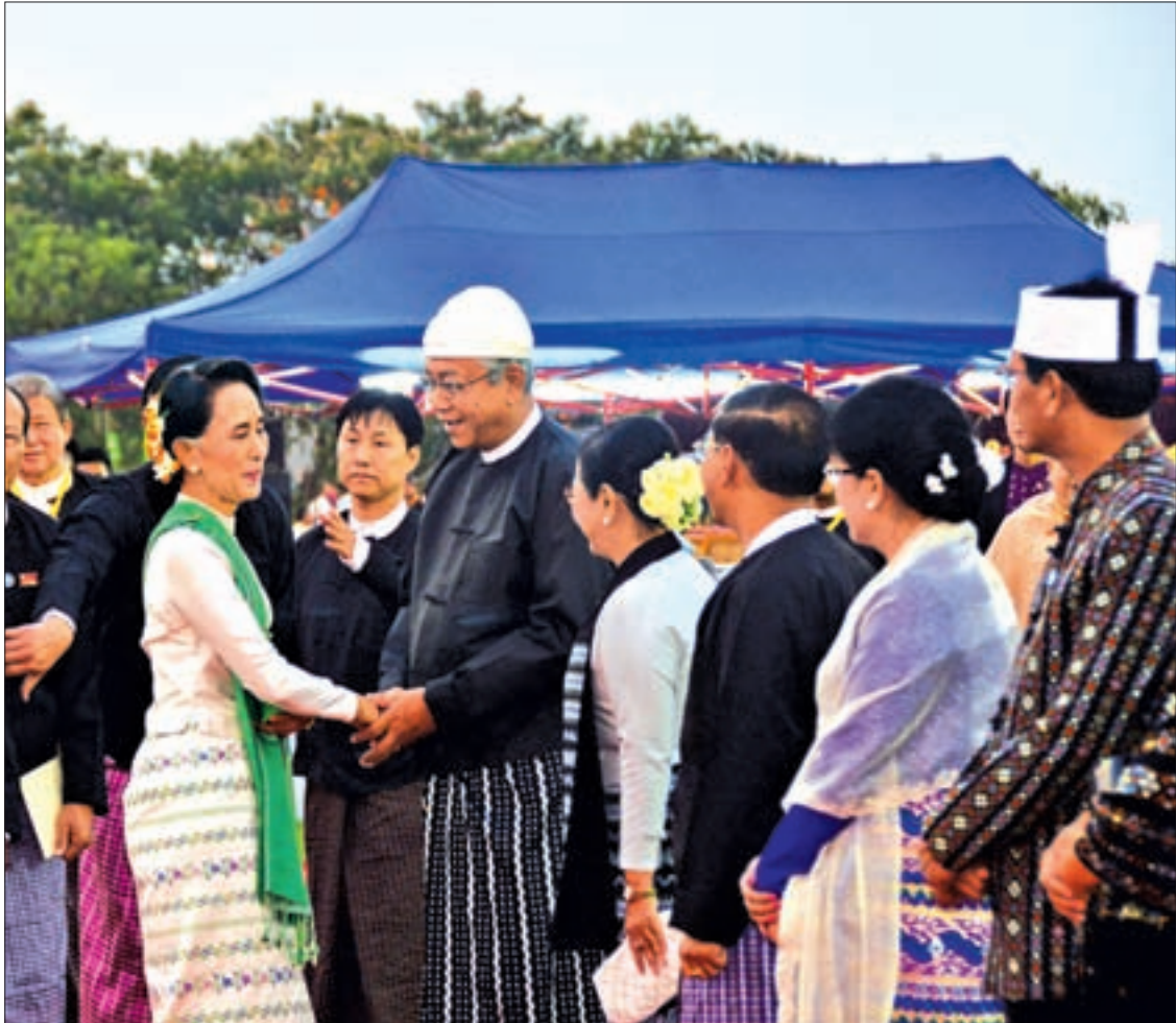
President U Htin Kyaw shakes hands with Daw Aung San Suu Kyi at the inaugural dinner.