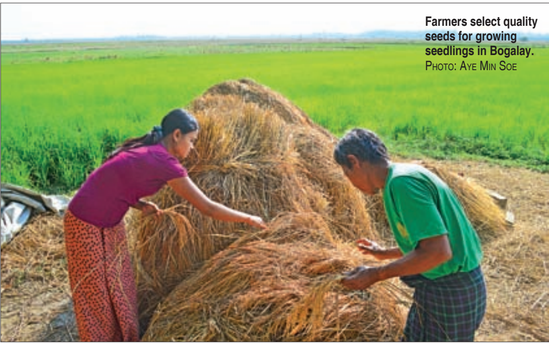
Farmers select quality seeds for growing seedlings in Bogalay.