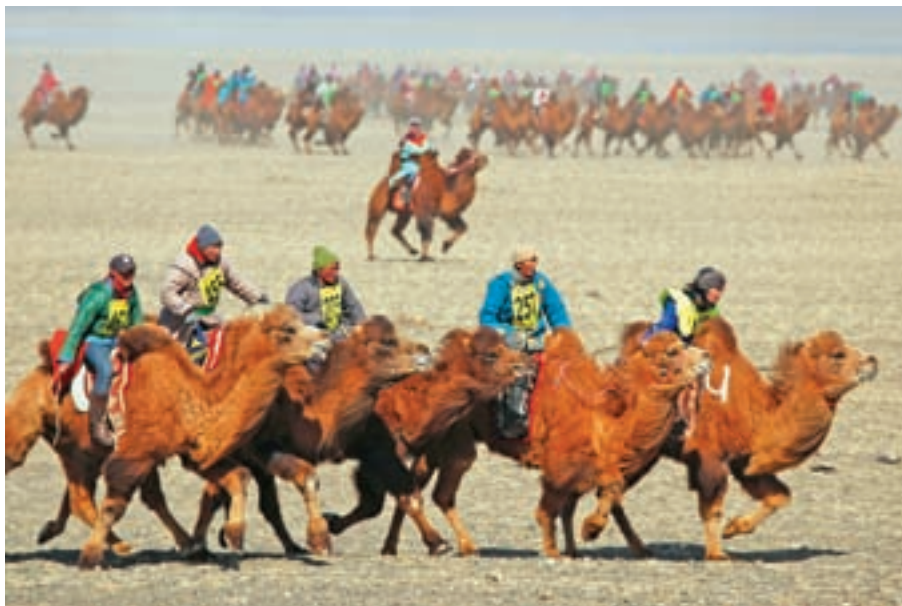
Contestants ride during a camel race at "Temeenii bayar", the Camel Festival, in Dalanzadgad, Umnugobi aimag, Mongolia, on 7 March 2016.

DALANZADGAD (Mongolia) — Out in the Gobi Desert, the crowd, many in colorful Mongolian traditional dress, admire the shaggy-haired, cud-chewing camels as they plod by in a beauty parade.