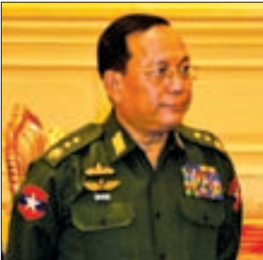
Lt-Gen Ye Aung