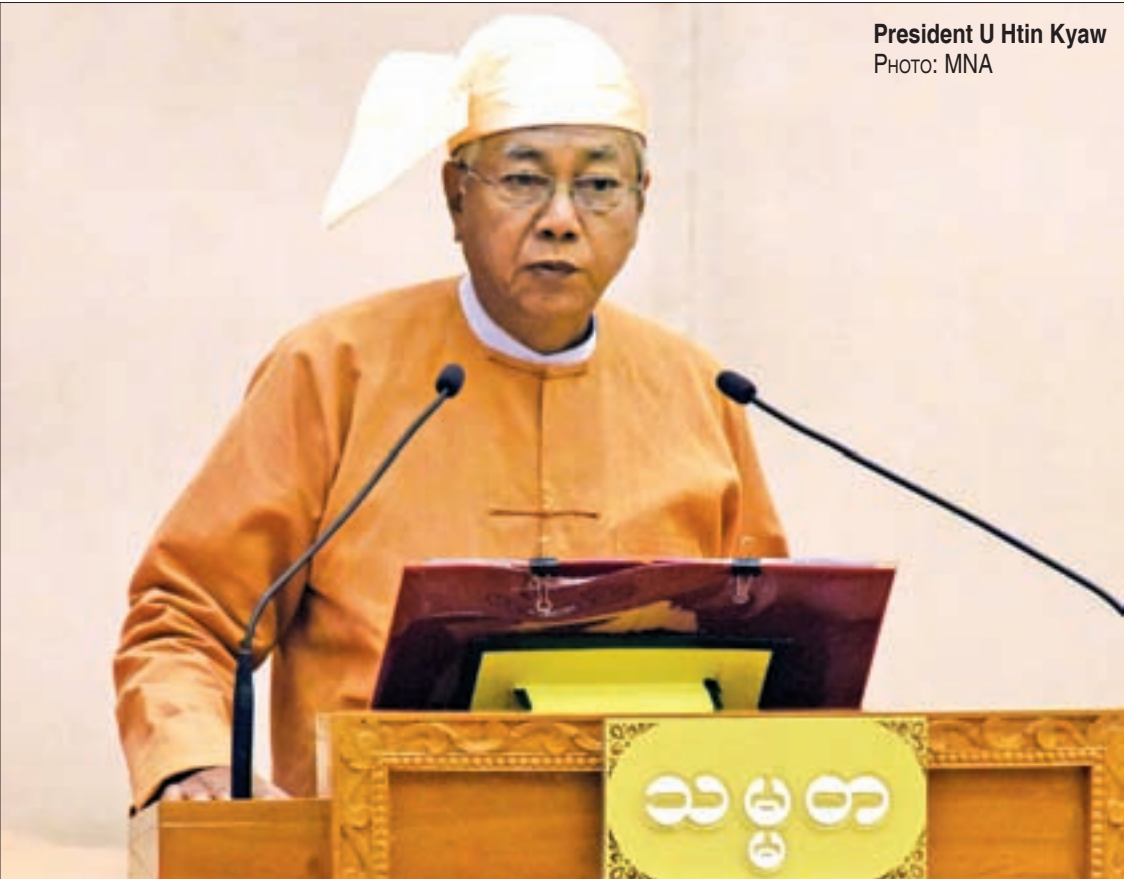
President U Htin Kyaw