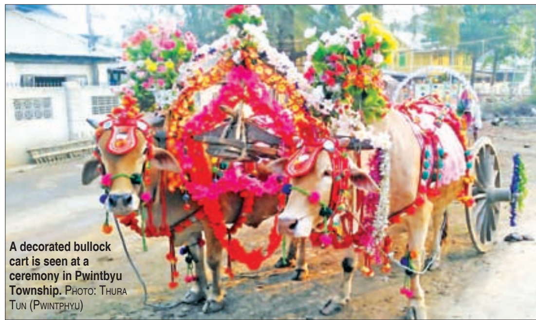
A decorated bullock cart is seen at a ceremony in Pwintbyu Township.

THE owners of decorated bullock carts and horses are enjoying healthy business in Pwintbyu Township as local people rent them to roam about during traditional ceremonies after harvesting season.