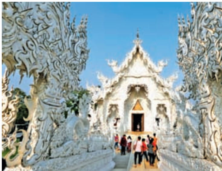
Tourists stroll at Wat Rong Khun also known as the White Temple designed by Thai visual artist Chalermchai Kositpipat in Chiang Rai Province, Thailand, on 4 March 2016.

Tourists wanting off-the-beaten-track travel need not look far, he said. “The industrial-strength tourism will push people away. They have started looking for remote beaches in Cambodia or Myanmar,” he said.— Reuters