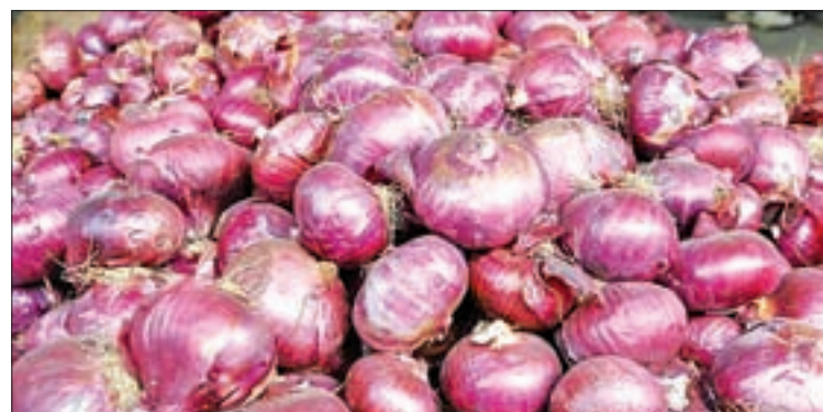
Onion farmers in upper Myanmar have earned high income from this year harvest as demand for the crop is high.

The price of onions peaked at K1,000 per viss last August as a direct consequence of high demand in foreign markets and low yields.—Union Daily