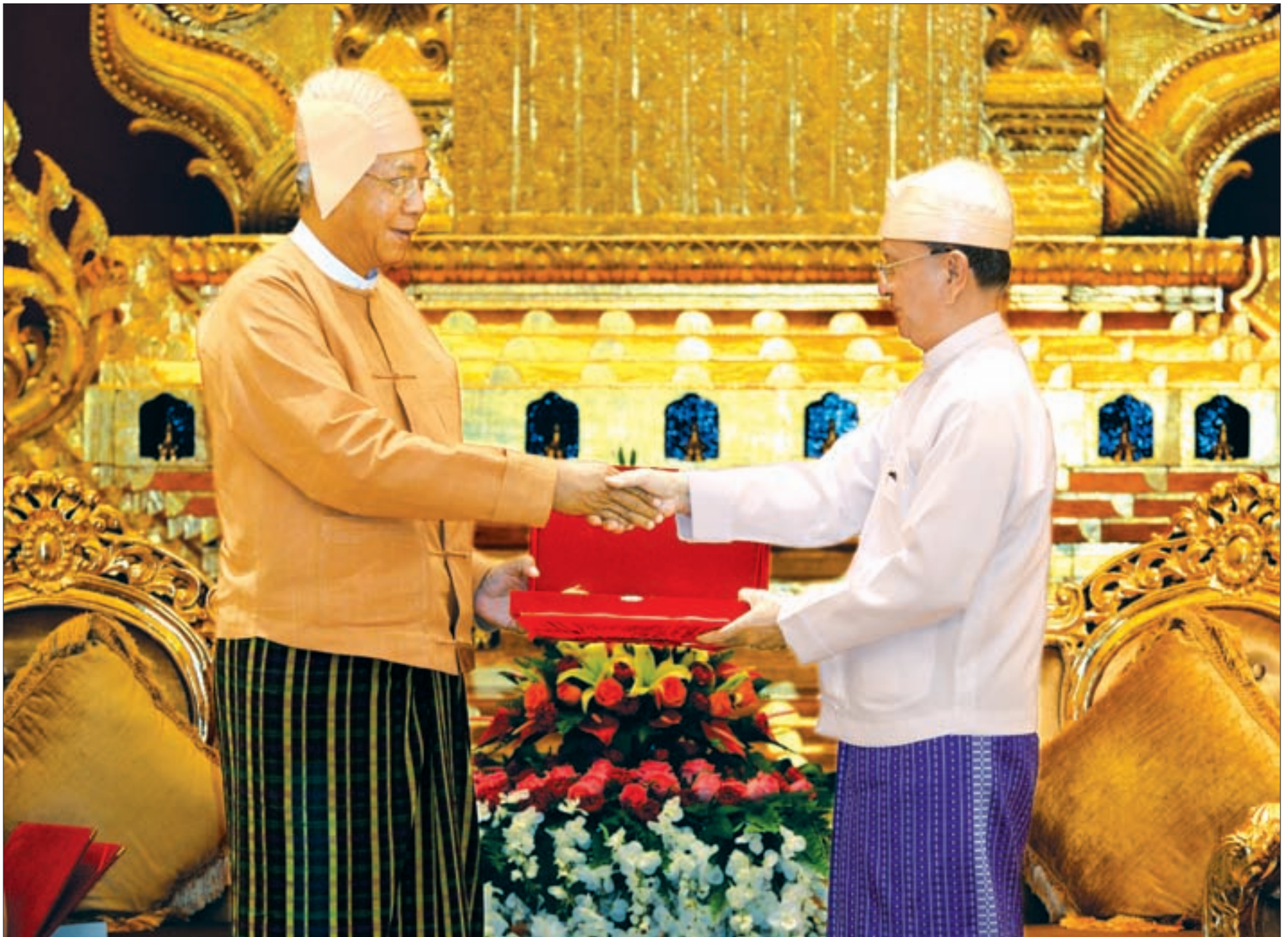
Outgoing President U Thein Sein hands over insignia of the presidency to incoming President U Htin Kyaw at the ceremony to hand over the duties of presidency.

PRESIDENT U Htin Kyaw took his oath of office at the Pyidaungsu Hluttaw yesterday. Afterward, he delivered the inaugural speech in which he said his government will strive to amend the current constitution, which was passed in the referendum in 2008.