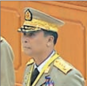
Lt-Gen Kyaw Swe