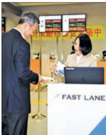
The fast lane immigration counter at the Kansai International Airport near Osaka on 30 March.

OSAKA — Japan launched priority immigration lanes yesterday at major international airports serving Tokyo and Osaka to speed up procedures for conference attendees and VIPs.