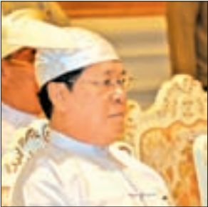
U Thein Swe