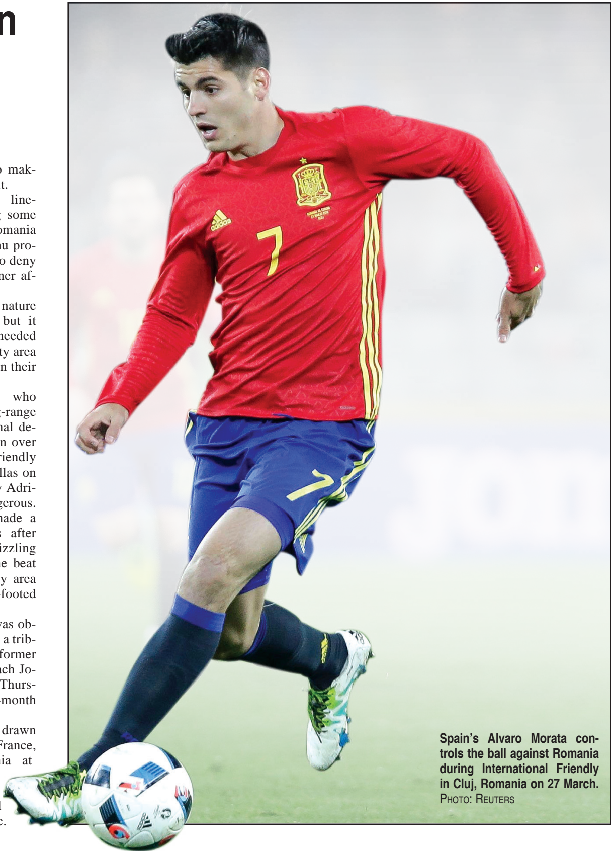
Spain's Alvaro Morata controls the ball against Romania during International Friendly in Cluj, Romania on 27 March.