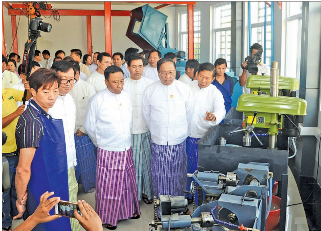
Union Minister Dr Myint Aung visits the newly opened Gems Training Centre.