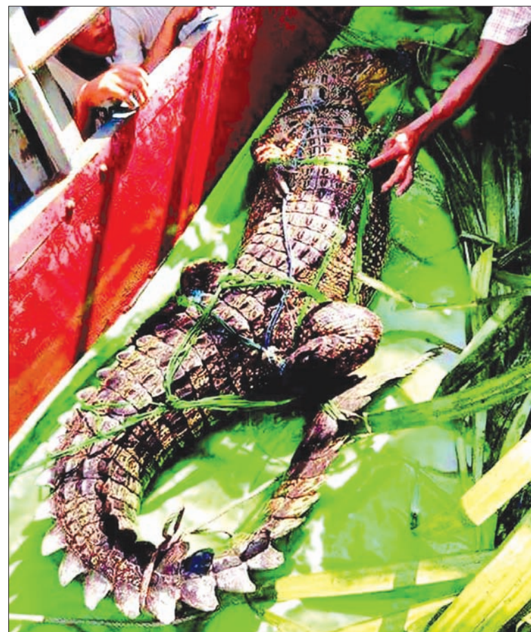
Rare crocodile is caught by villagers in Labutta.

Due to limitation of space we are only able to publish "Letter to the Editor" that do not exceed 500 words. Should you submit a text longer than 500 words please be aware that your letter will be edited.