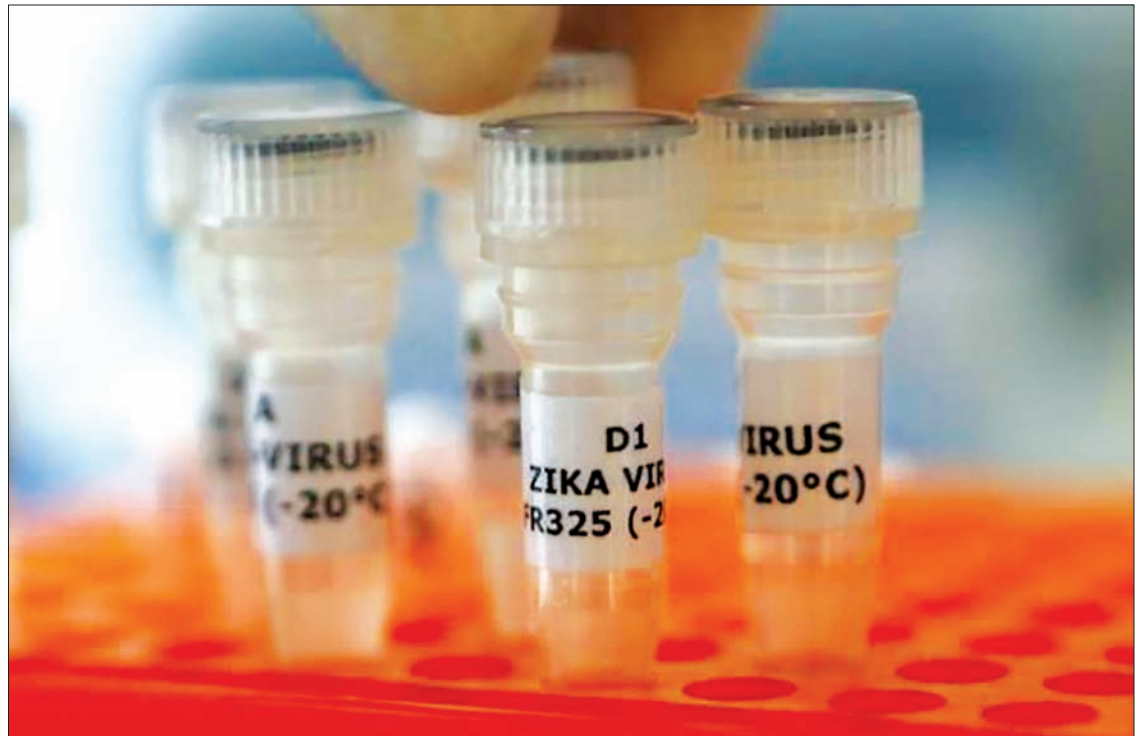
An employee examines tubes with the label 'Zika virus' at Genekam Biotechnology AG in Duisburg, Germany, on 2 February.

US health officials recommend that women wait at least two months, and men at least six, before attempting to conceive after infection with Zika. —Reuters