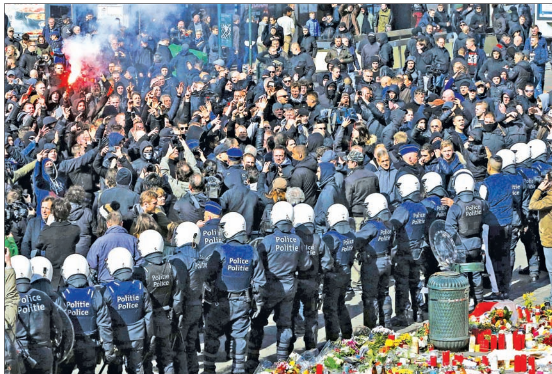
Right-wing demonstrators protest against the wave of terrorism in front of the old stock exchange in Brussels, Belgium, on 27 March. 2016.

BRUSSELS — Belgian police briefly used water cannon to control several hundred rowdy protesters in central Brussels on Sunday after they ignored an official call for marches to be postponed following Tuesday's bombings.