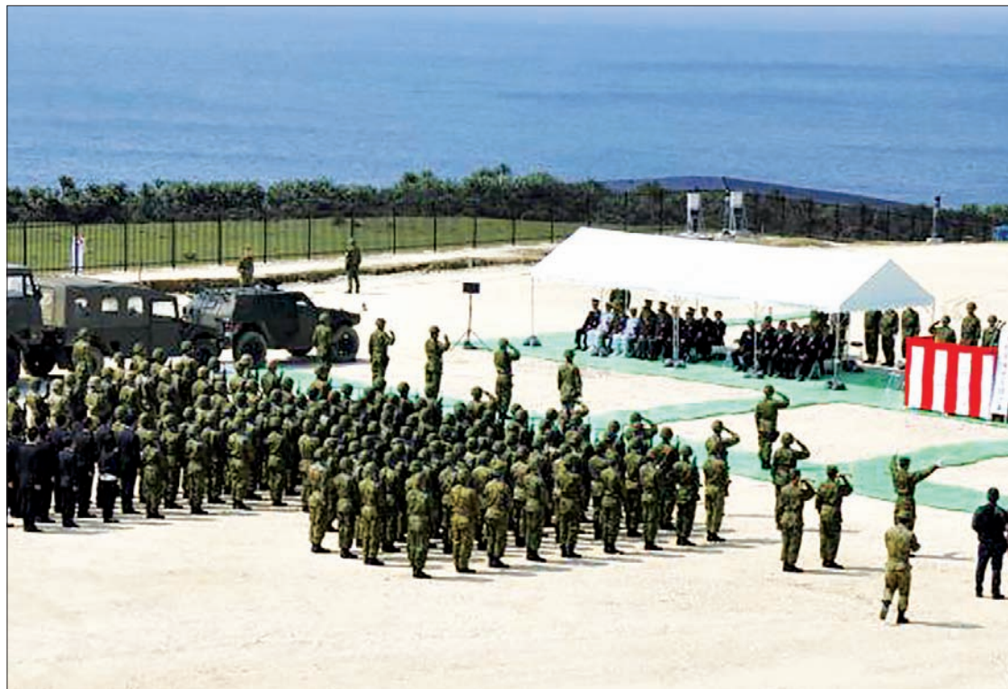
Members of Japan's Self Defence Force hold an opening ceremony of a new military base on the island of Yonaguni in the Okinawa prefecture, on 28 March.

The 30-sq-km (11-sq-mile) island is home to 1,500 people, who mostly raise cattle and grow