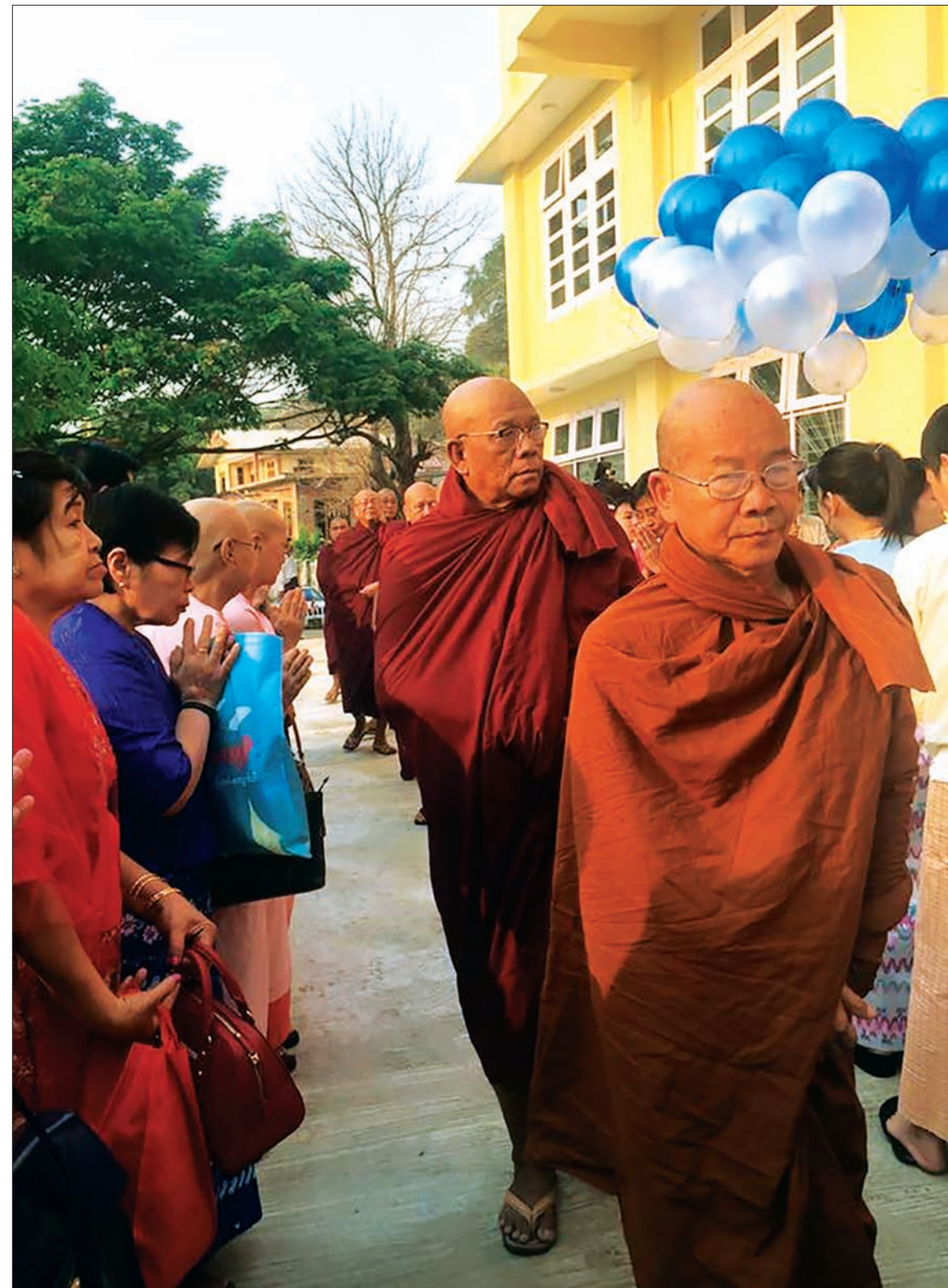
Attendees paying obeisance to sagaing.

The stage was set to begin as the master of ceremonies or MC clasped the microphone in both hands as