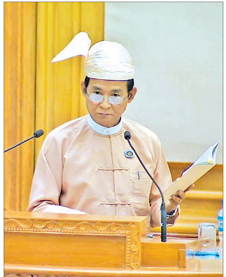
U Win Myint, Speaker of Pyithu Hluttaw.

voted against the objection to Daw Khin Htay Kywe, and 432 MPs voted against the objection to U Twar Kyin Paung. The two were both confirmed.