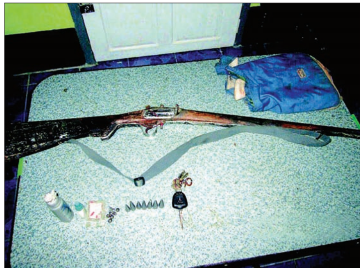
Sized illegal gun and accessories.