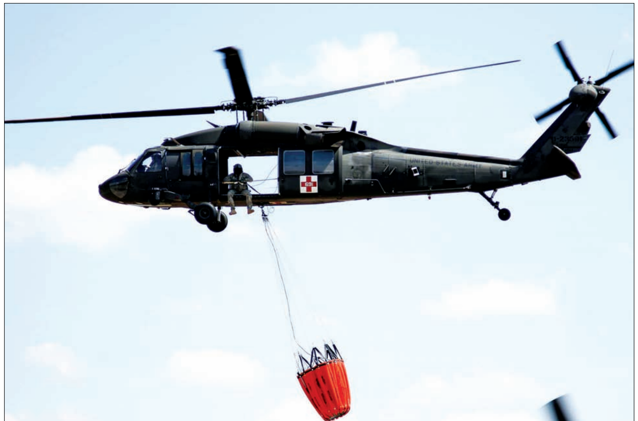
A UH-60 Black Hawk helicopter from the Kansas National Guard carries a water bucket as it prepares to help fight the Anderson Creek wildfire in southern Kansas, on 25 March.

Email: adv.gnlm@gmail.com , Phone: 09 250107962, 09 251022355