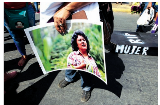
An activist holds a photos of slain environmental rights activist Berta Caceres during a march to mark International Women's Day in Managua, Nicaragua, on 8 March.