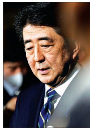
Japan's Prime Minister Shinzo Abe.

Constitutional revisions must be approved by a two-thirds majority in both houses of parliament and a majority of voters in a public referendum. The only two previous cases of dual-chamber elections resulted in landslides