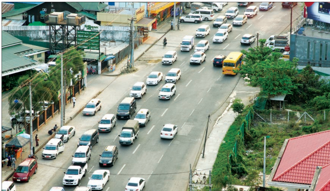
Yangon has seen an increase in number of cars since the country opened up in 2011.

The trading of cars dropped down at car market. But it gets back to the normal trading again. A Probox with cc 1300 engine sells from K 10.5 million to 11 million and a Honda Fit from K 12 million to 15 million at car market.—MLT/Union Daily