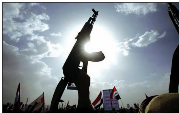
A Houthi follower rises a weapon as he attends a rally marking one year of Saudi-led air strikes, in Yemen’s capital Sanaa, on 26 March 2016.

DUBAI — A Saudi-led military coalition on Monday said it had completed a prisoner swap in Yemen, exchanging nine Saudi prisoners for 109 Yemeni nationals ahead of a planned truce and peace talks aimed at ending the year-long war with Houthi rebels.