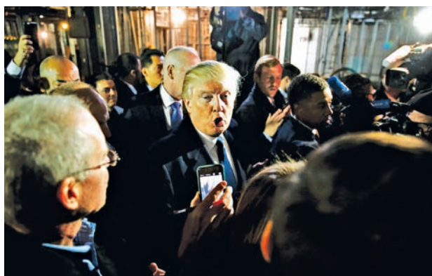
Republican US presidential candidate Donald Trump speaks to reporters as he leads the news media on a tour of the construction site of the Trump International Hotel at the Old Post Office Building in Washington, on 21 March.

The billionaire businessman, vying to win his