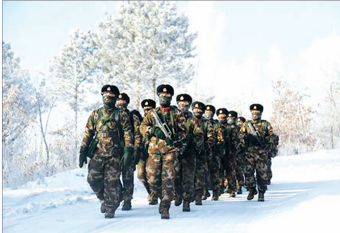
Soldiers of China's People's Liberation Army (PLA) take part in training in temperatures below minus 30 degrees Celsius (minus 22 degrees Fahrenheit) at China's border with Russia in Fuyuan, Heilongjiang province, on 14 January.

The reforms have proven controversial, and the military's newspaper has published commentaries warning of opposition to the changes and concern about jobs.—Reuters