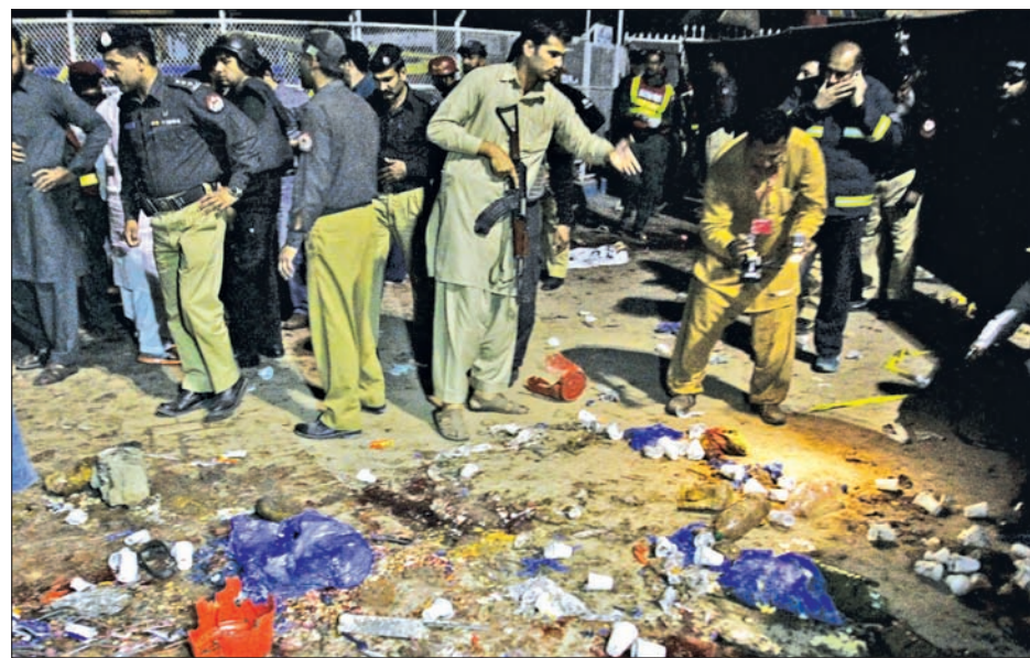
Security officials gather at the site of a blast outside a public park in Lahore, Pakistan, on 27 March.

While the army, police, government and Western interests have been the prime targets of the Pakistani Taliban and their allies, Christians and other religious minorities have also attacked. Nearly 80 people