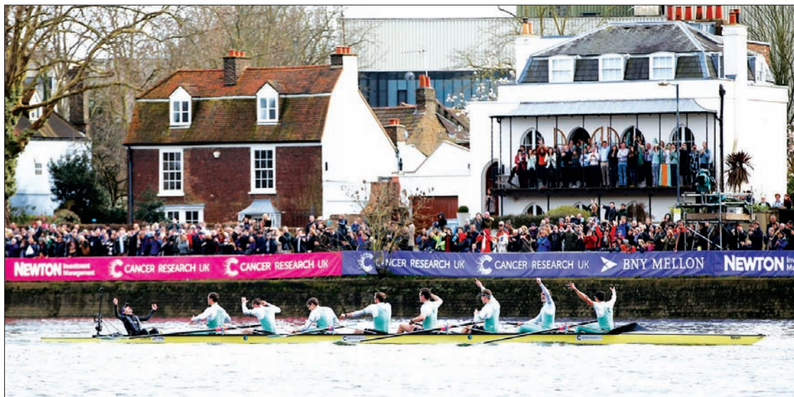
Cambridge celebrate after winning the Men's Race in BNY Mellon 2016 Oxford v Cambridge University Boat Race in River Thames in London on 27 March.

LONDON — Favourites Cambridge won the annual University Boat Race in choppy conditions on London's River Thames on Sunday, extending their lead over Oxford in the long-standing series to 82-79.