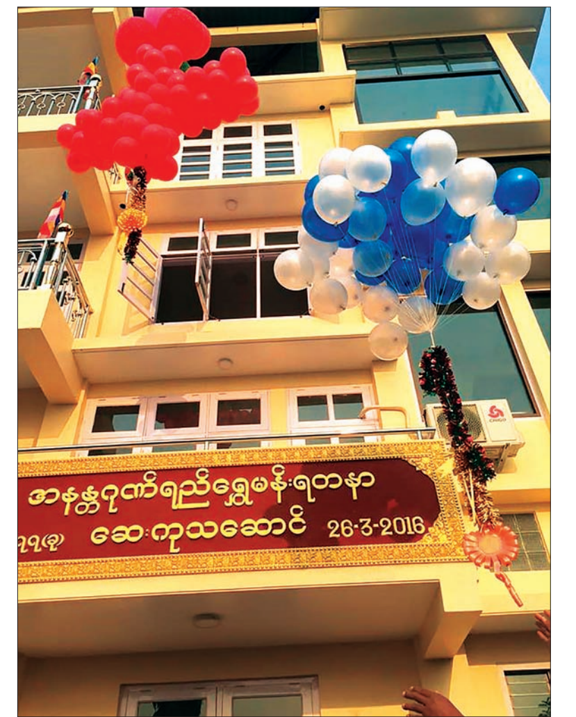
The balloons being released.

It is meant to accommodate and to put under the shade of the building all the patients, their assisting family members, the helpers, the foreign doctors, the local doctors, the trained nurses, and hospital basic workers. It is meant for OPD patients as well as overnight stay.