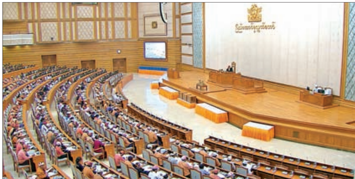
Pyidaungsu Hluttaw is convened in Nay Pyi Taw.

THE Second Pyidaungsu Hluttaw's first regular session entered its 13th day, announcing the names of the proposed chairman and members of the Union Election Commission and documenting the process of renaming, forming and re-delineating the boundaries of districts, towns, wards, village tracts and villages around the country. Pyidaungsu Hluttaw Speaker Mahn Win Khaing Than announced the