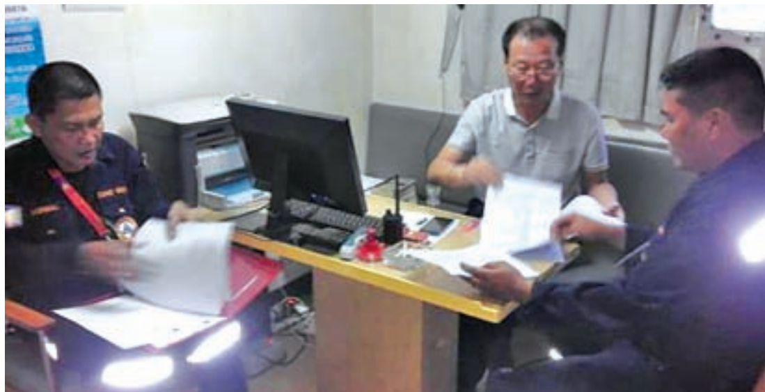
Philippines Coast Guard officials inspect North Korean freighter Jin Teng in Subic Bay in this handout photo from the coast guard on 3 March.

The four ships included the Jin Teng, detained by the Philippines days after the sanctions took effect. Jin Teng, flying a Sierra Leone flag, arrived in the Philippines on 27 February and was unloading palm kernels when it was seized. The Jin Teng has called at Palembang, Indonesia, and Kaohsiung, Taiwan, since the beginning of this year, ship tracking data available on the Reuters Eikon Terminal showed.— Reuters