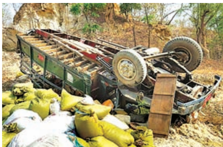
A view of the overturned vehicle.