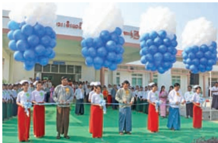
Obstetrics and Gynaecology Special Hospital put into service in Nay Pyi Taw.

ders speculate the building could fall into disrepair within the next three years.— Myitmakha News Agency