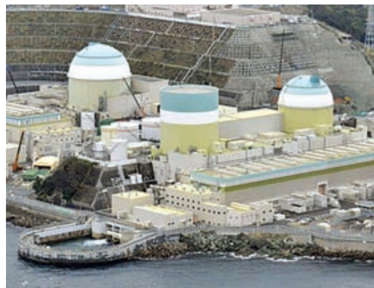
Shikoku Electric Power Co.’s Ikata nuclear plant in Ehime Prefecture, western Japan. The company plans to give up restarting the No. 1 reactor of the plant and scrap it because extending the aging unit’s lifespan would be hugely expensive, company sources said on 25 March.

OSAKA — Shikoku Electric Power Co said yesterday it will scrap the oldest of the three reactors at its Ikata nuclear complex in the western Japanese prefecture of Ehime starting on 10 May, as it would be too costly to continue running the nearly 40-year-old unit.