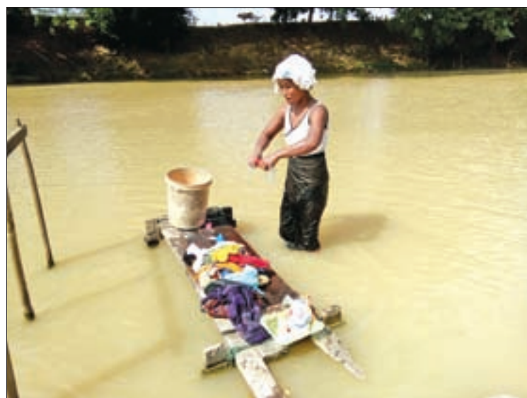
A woman washing clothes in the Mone River.

The stopping of gold panning activities along the river would allow river water to return to its pre-