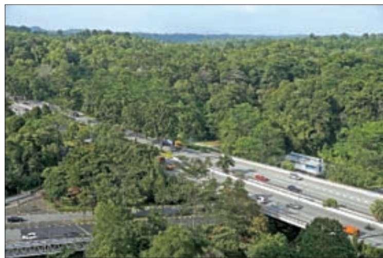
Cars drive along a stretch of highway on the perimeters of the central catchment area in Singapore, on 2 March 2016.

SINGAPORE — A proposal to build a subway tunnel near Singapore's largest patch of primary rainforest has renewed a debate over the pace of development and its impact on the environment in the Southeast Asian city-state.