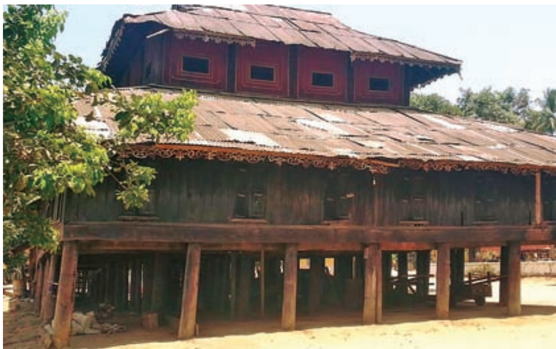
A century old Dawei monastery.