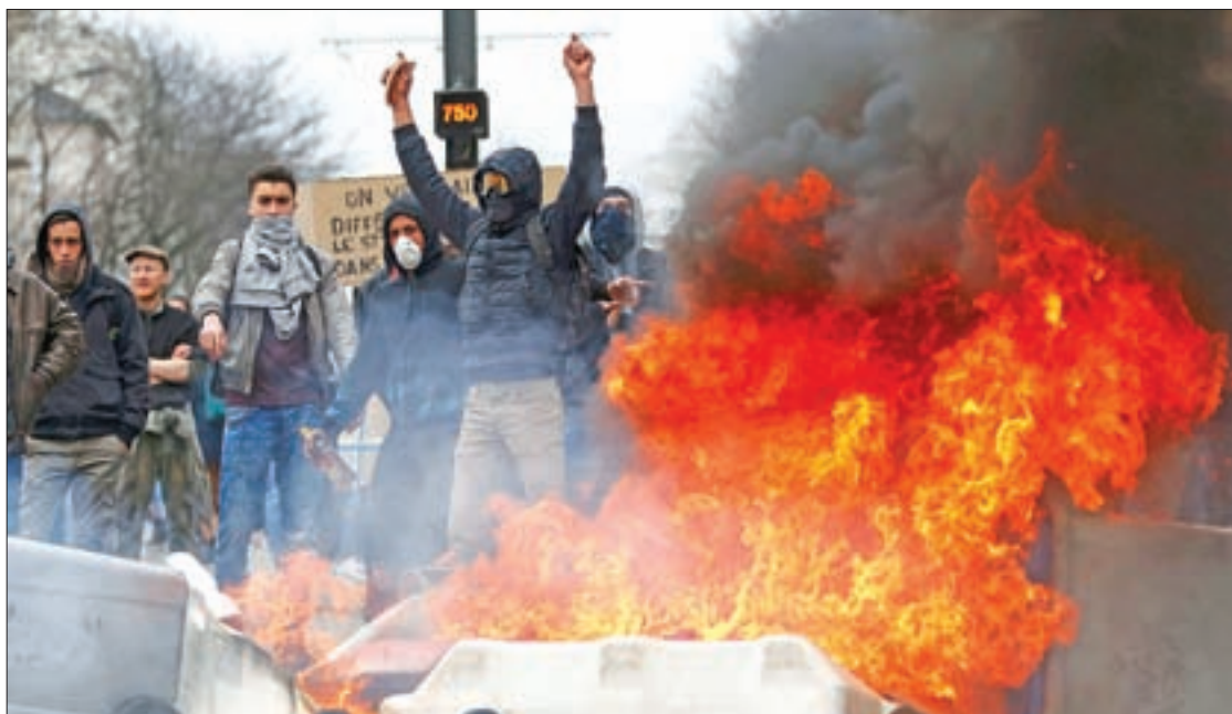
Demonstrators react near burning garbage bins as French high school and university students take part in a demonstration against the labour reform bill proposal in Nantes, France, on 24 March as part of a nationwide labour reform protest.