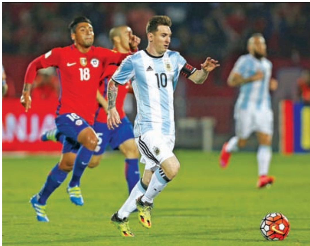
Lionel Messi (10) of Argentina and Gonzalo Jara (18) of Chile in action during World Cup 2018 Qualifier, at Nacional Stadium, Santiago, Chile, on 24 March.

ahead when Messi won a tussle for the ball inside the box and lifted it over to right back Gabriel Mercado, who hooked the ball home past Bravo.