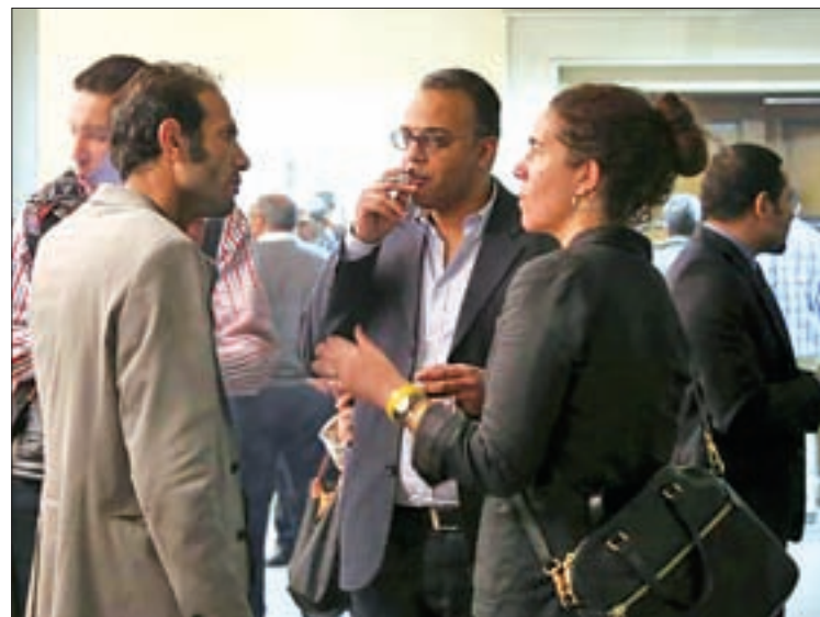
Prominent Egyptian journalist and human rights advocate Hossam Bahgat (C) is seen at a court in Cairo, on 24 March.

Sisi portrays himself as a bulwark of stability in a region that has slipped into chaos since the 2011 revolts, prioritising security over civil rights.—Reuters