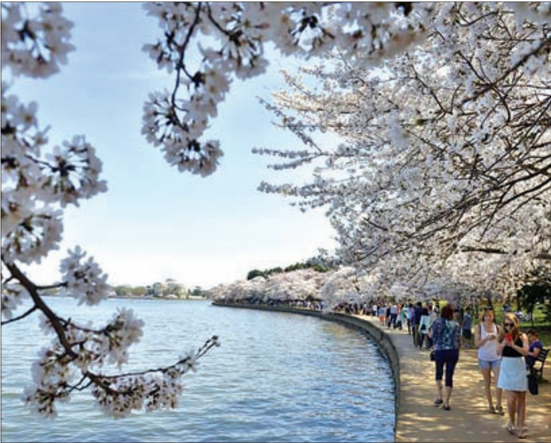
WASHINGTON — Cherry blossoms are seen around the Tidal Basin in Washington, capital of the United States, on 24 March 2016. The cherry blossoms in the US capital are in full bloom.