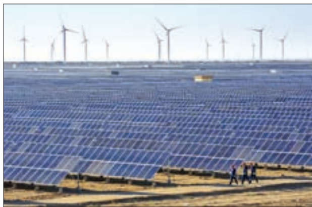
Workers walk past solar panels and wind turbines (rear) at a newly-built power plant in Hami, Xinjiang Uighur Autonomous Region, China, on 17 September 2015.