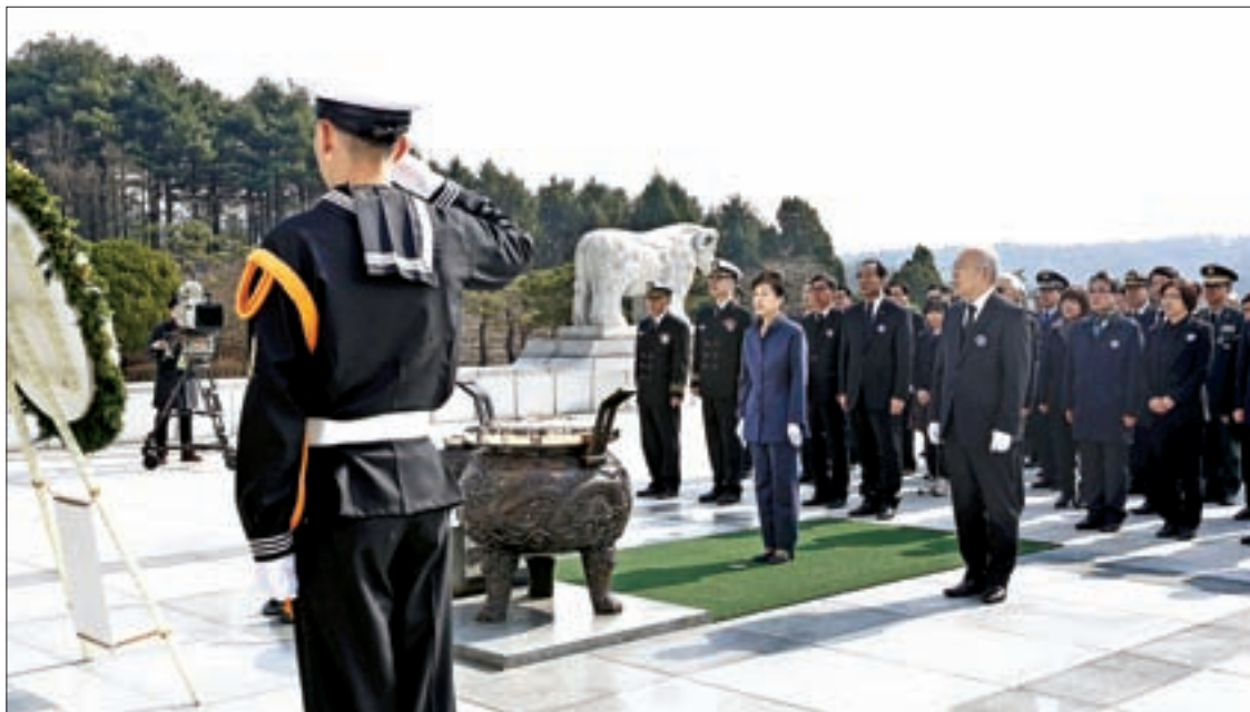
South Korean President Park Geun-Hye observes a moment of silence during a memorial ceremony on the first West Sea (Northern Limited Line) Defence Day at the Daejeon National Cemetery in Daejeon, South Korea, on 25 March.

ahead of a rare congress of the North's ruling Workers' Party in May. Some analysts expect Kim to claim a signature achievement, such as another nuclear test, in the run-up to the congress as he looks to bolster his stature at home.