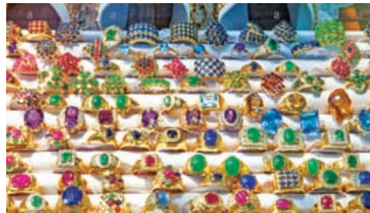
Gems and Jewellery are seen at Bogyoke Market, Yangon.

Currently, South Korea and China are ranked the biggest buyers of the country's jewels. Myanmar's gems are put on sales at both international and domestic exhibitions.— MPPS/ Union Daily