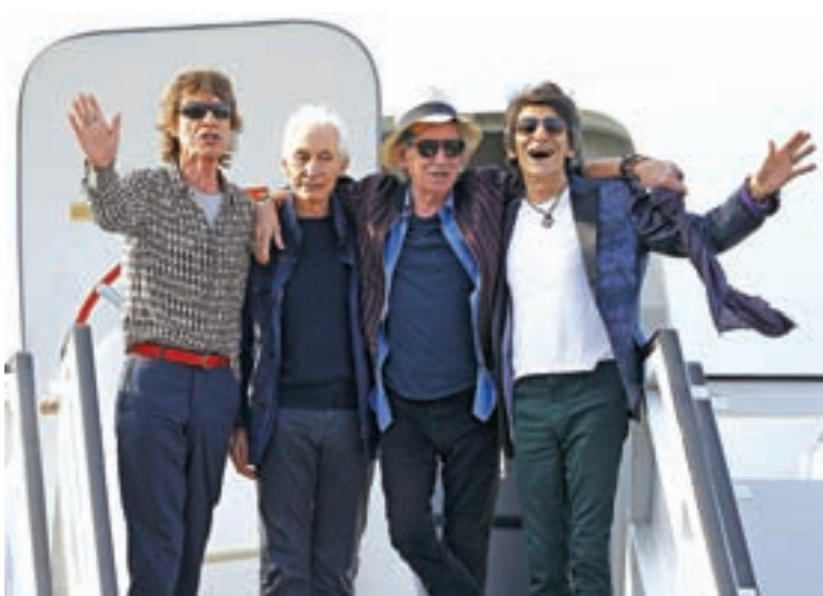
(L-R) Mick Jagger, Charlie Watts, Keith Richards and Ronnie Wood of the Rolling Stones stand together after landing in Havana, on 24 March.