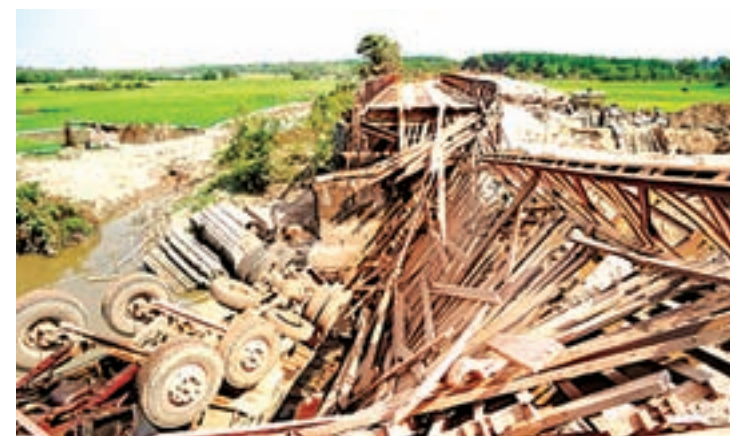
Bridge collapses due to an overloaded truck.

FCGC Company to provide a temporary diversion road for local vehicles to prevent delayed transportation and commercial losses. Local police have taken action against the driver U Sithu Aung and the conductor on board U Aung Win. —Naing Tun (IPRD)