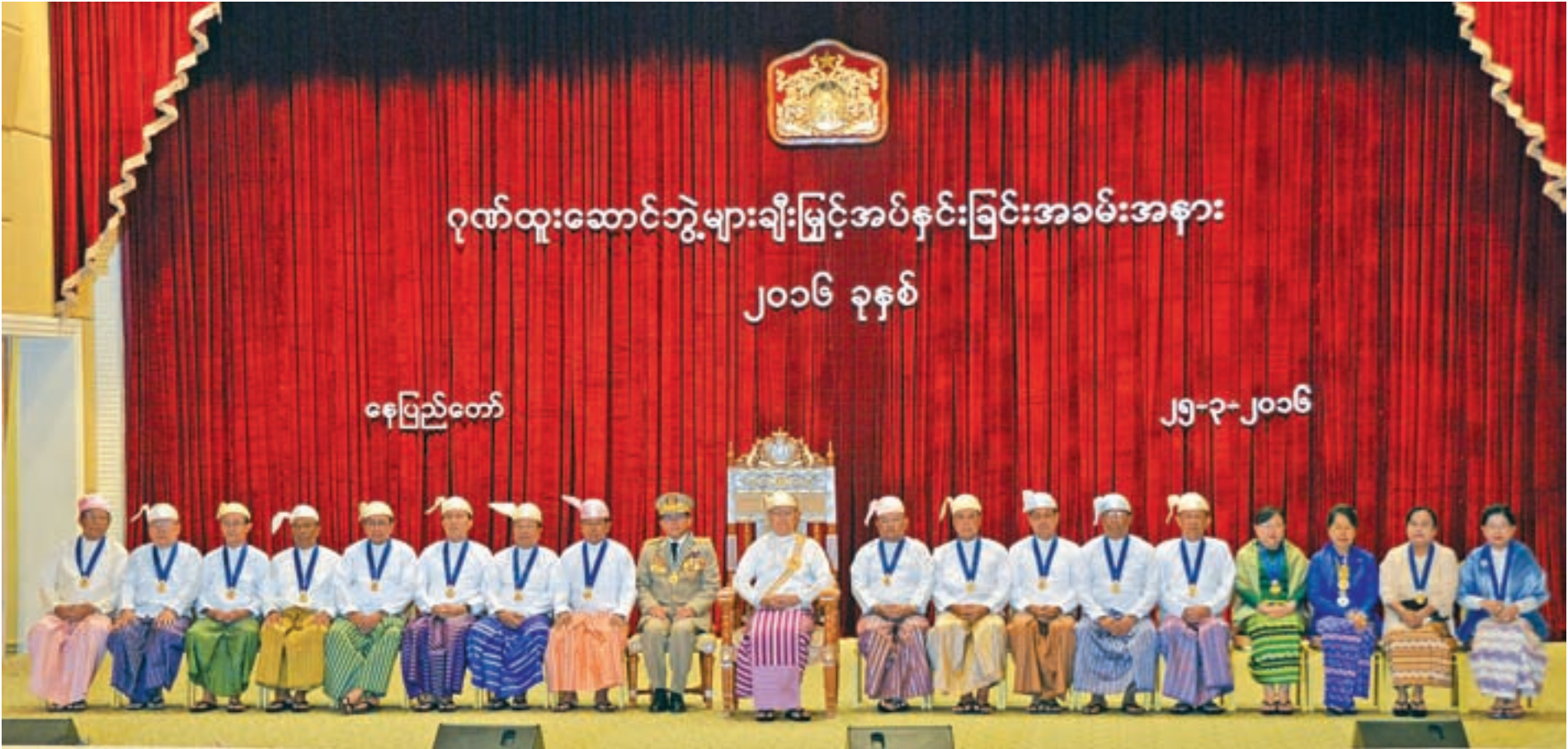
President U Thein Sein confers honorary titles on 14 Union ministers and Union-level officials, four chief ministers and 55 military officers.