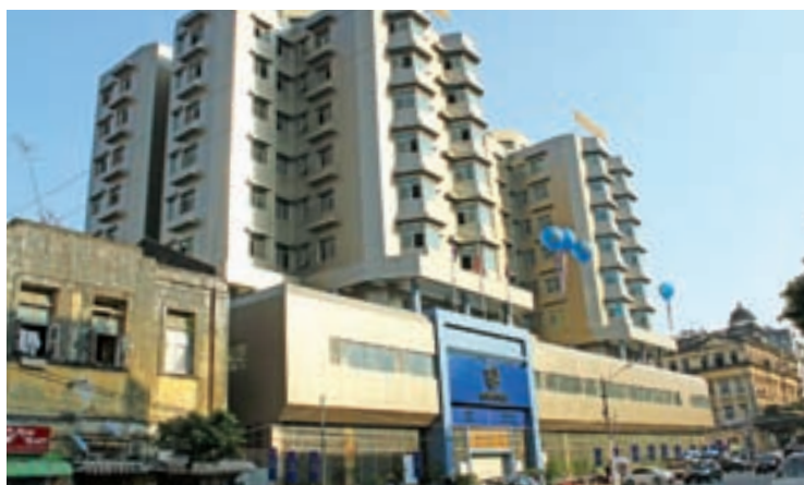
Private companies have been allowed to lease state-owned property since the country opened up in 2011.

The Yangon City Development Committee leased land plots in Myakyuntha Park, a state-owned property, to Max Myanmar (6.87 acres), Eden (4.72 acres), Inya Palace Co Ltd (1.83 acres), Magic Land (13.86 acres), Nay La Pwint (2.60 acres), Myanmar Golden Star