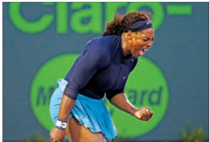
Serena Williams celebrates after winning match point against Christina McHale (not pictured) on day three of the Miami Open at Crandon Park Tennis Centre at Key Biscayne, FL, USA on 24 March 2016. Williams won 6-3, 5-7, 6-2.

MIAMI — Top seed Serena Williams dropped the second set before bouncing back to beat compatriot Christina McHale 6-3, 5-7, 6-2 in second-round action at the Miami