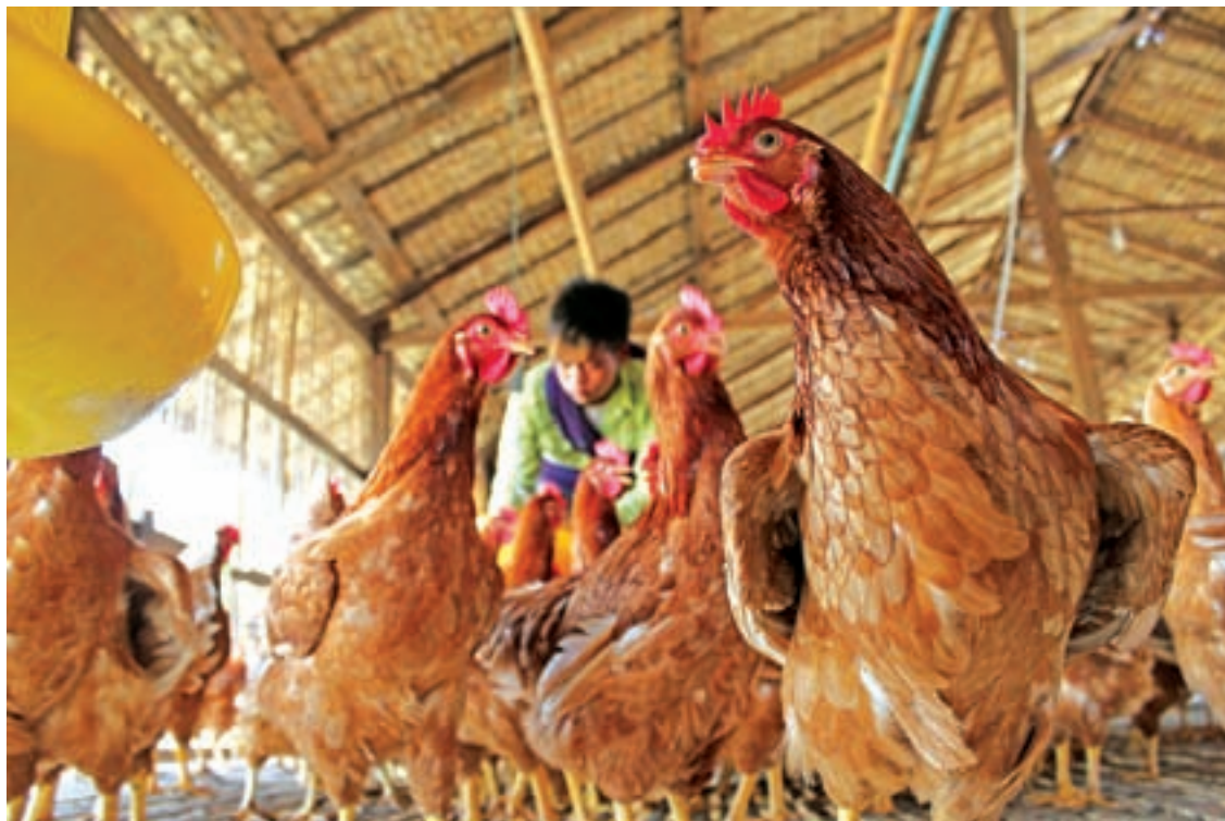
A worker feeds chicken at a farm in upper Myanmar.