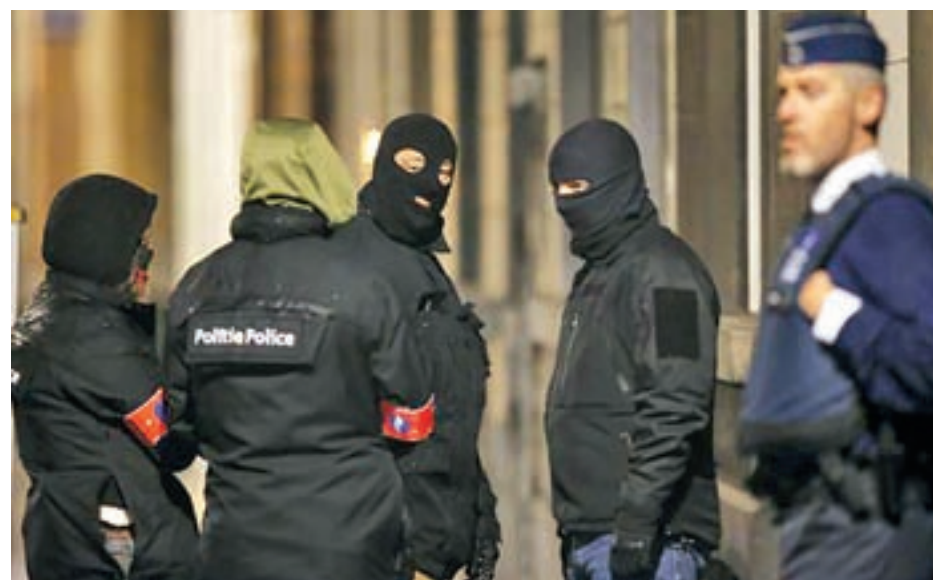
Masked Belgian police secure the entrance to a building in Schaerbeek during police operations following Tuesday’s bomb attacks in Brussels, Belgium, on 25 March.

filmed by security cameras in the airport terminal next to two bombers who blew themselves up there. Prosecutors did not confirm the arrest and it was not known if the man was among the seven detained overnight.—Reuters