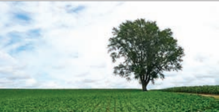
A poplar tree, nicknamed the “Philosophy Tree,” in Biei, Hokkaido was cut down in late February 2016.

To deal with the situation and protect tourism resources, the town government has decided to designate those poplar trees and buildings as visually significant properties and provide subsidies to the owners, starting in April. Still, the decision may not help prevent bad manners. “We cannot call the police each time a tourist steps into the fields,” said a town official in charge. —Kyodo News