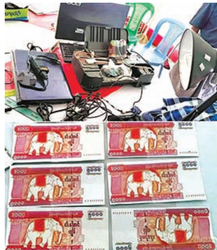
Counterfeit K5,000 notes.

POLICE have filed charges against a man on suspicion of using counterfeit notes in Myitkyina on 22 March, a police source said yesterday.