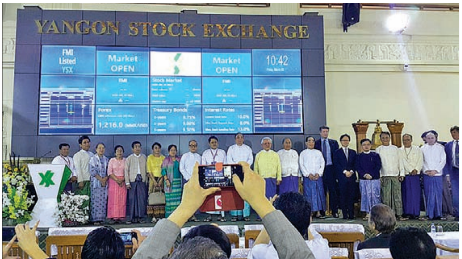
Government officials and business people pose for documentary photos at the opening of the Yangon Stock Exchange in Yangon.

The stock exchange is run by the Yangon Stock Exchange Joint-Venture Company, with a 51 per cent stake owned by the Myanmar Economic Bank under Myanmar's Finance Ministry and the remainder by Japanese partners.—GNLM