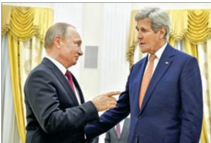
Russian President Vladimir Putin speaks with US Secretary of State John Kerry during a meeting at the Kremlin in Moscow, Russia, on 24 March.

"We understand that what we have been able to achieve on Syria has been possible only thanks to the position of the US top political leadership, Presi-