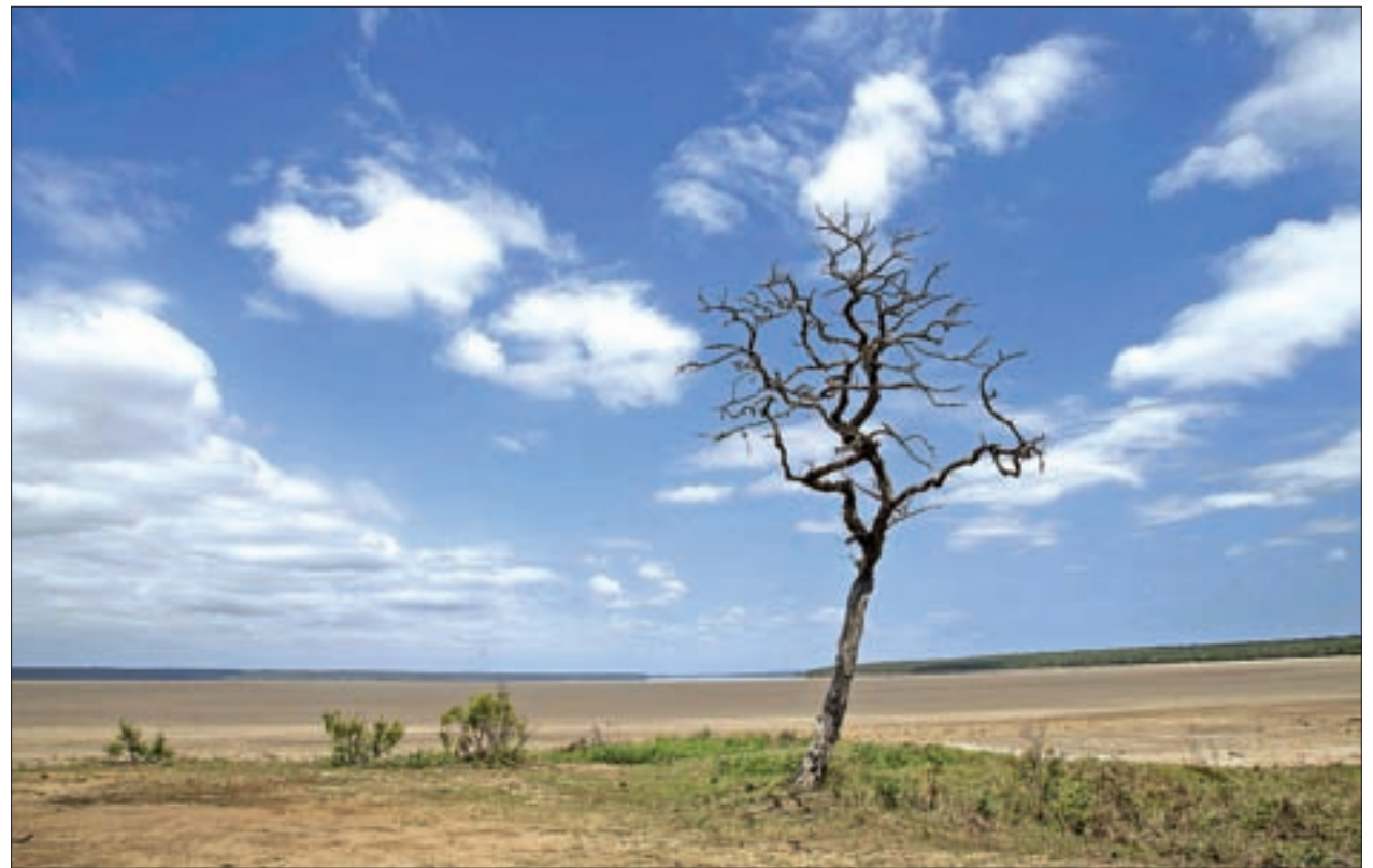
Lake St Lucia is almost completely dry due to drought conditions in the iSimangaliso Wetland Park, northeast of Durban, South Africa, on 25 February.

too little, too late for the summer maize crop and said prospects for winter wheat remain uncertain.