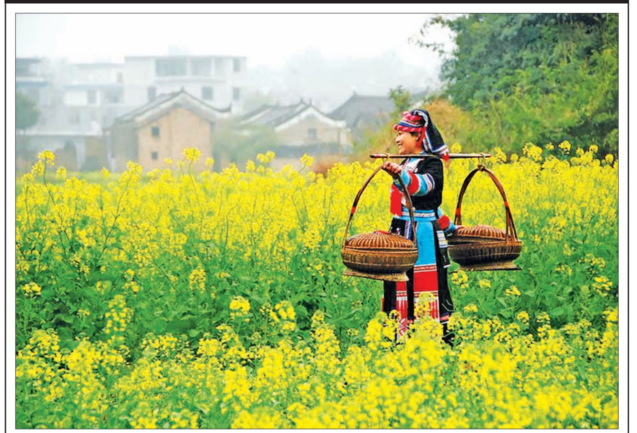
HEZHOU — A woman of Yao ethnic group walks in a field of rape flowers in Shenpo Village under Yao Autonomous County of Fuchuan, south China's Guangxi Zhuang Autonomous Region, on 12 March 2016. Rape flowers in south China were in full bloom in recent days.