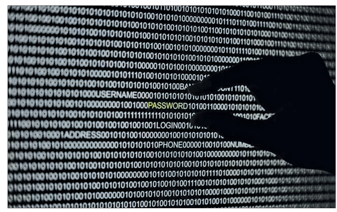
A hand is silhouetted in front of a computer screen.

Tensions are also heightened on the Korean peninsula as South Korea and the United States conduct annual joint military exercises that the South says are the largest ever and yesterday included the arrival in South Korea of the nuclear-powered aircraft carrier USSR John C Steins.