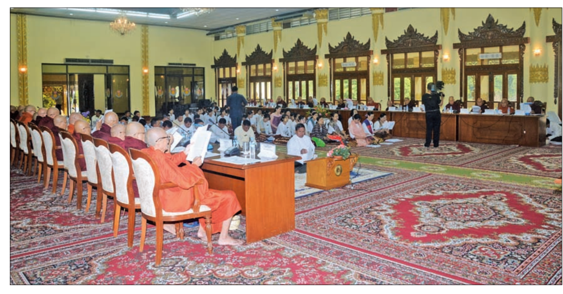
Union Minister for Religious Affairs U Soe Win briefs religious undertakings.

The Sangha Plenary of All Orders of Sangha was held The committee's chairman from 24 to 26 May 1980 for the first time in a bid to ensure the purification, perpetuation and propagation of the Sasana, or the teachings of the Buddha. —Myanmar News Agency