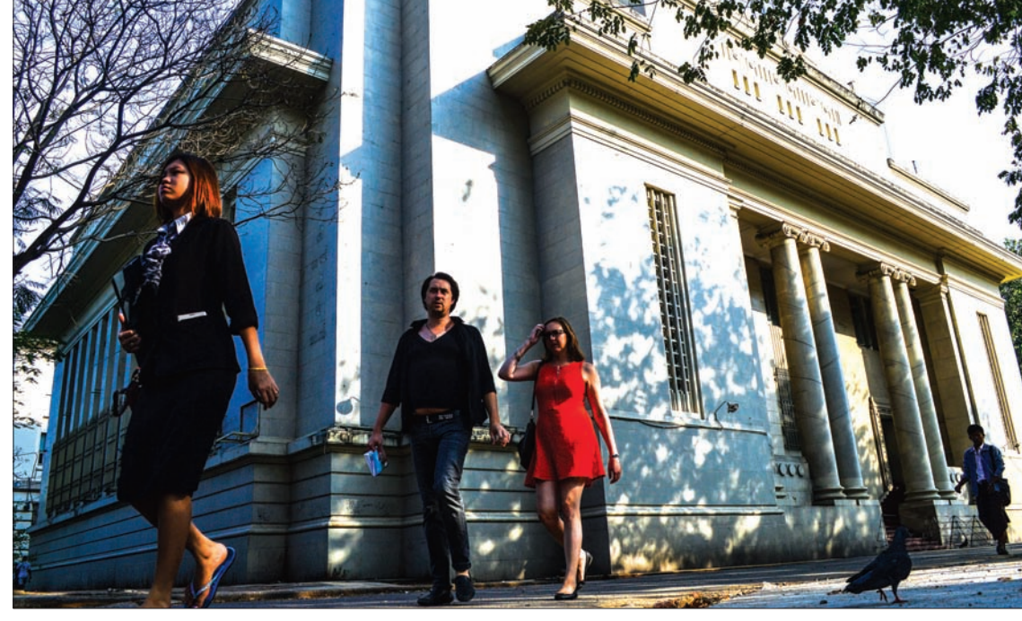
Pedestrians walk past a cultural heritage building where the Yangon Stock Exchange market is established.

have been discussed by officials of delays to the start of trading. as potential candidates for listing have issued a prospectus.