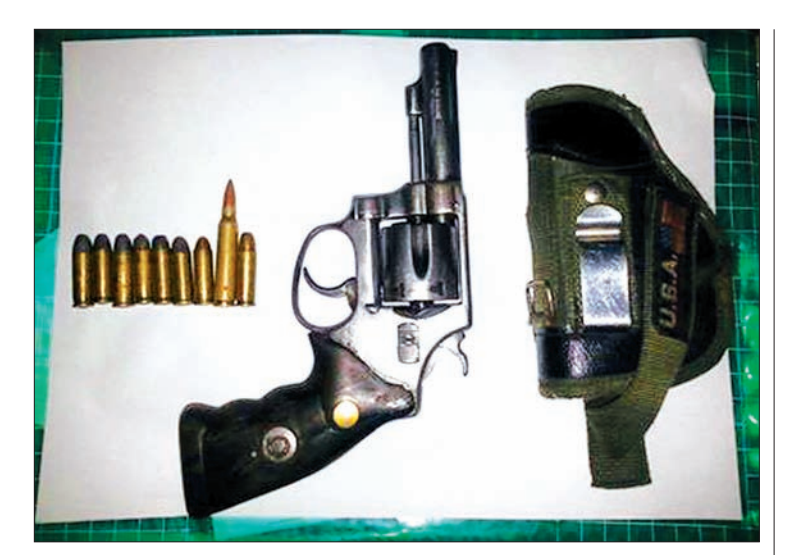
The revolver seen together with bullets.