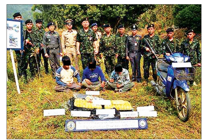
Thai border police seen together with suspects.

All the suspects involved in the case were taken into custody by the Maesai Police Station.—