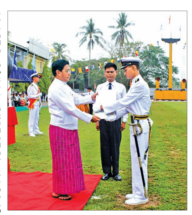
Union Minister U Nyan Tun Aung presents award to an outstanding cadet of Mercantile Marine Degree College.

A total of 133 students—64 in nautical and 69 in engineering—graduated this year from the Mercantile Marine Degree College. Established in 1963, the school has produced 2,540 marine officers and 2,485 nauengineers.—Myanmar News Agency