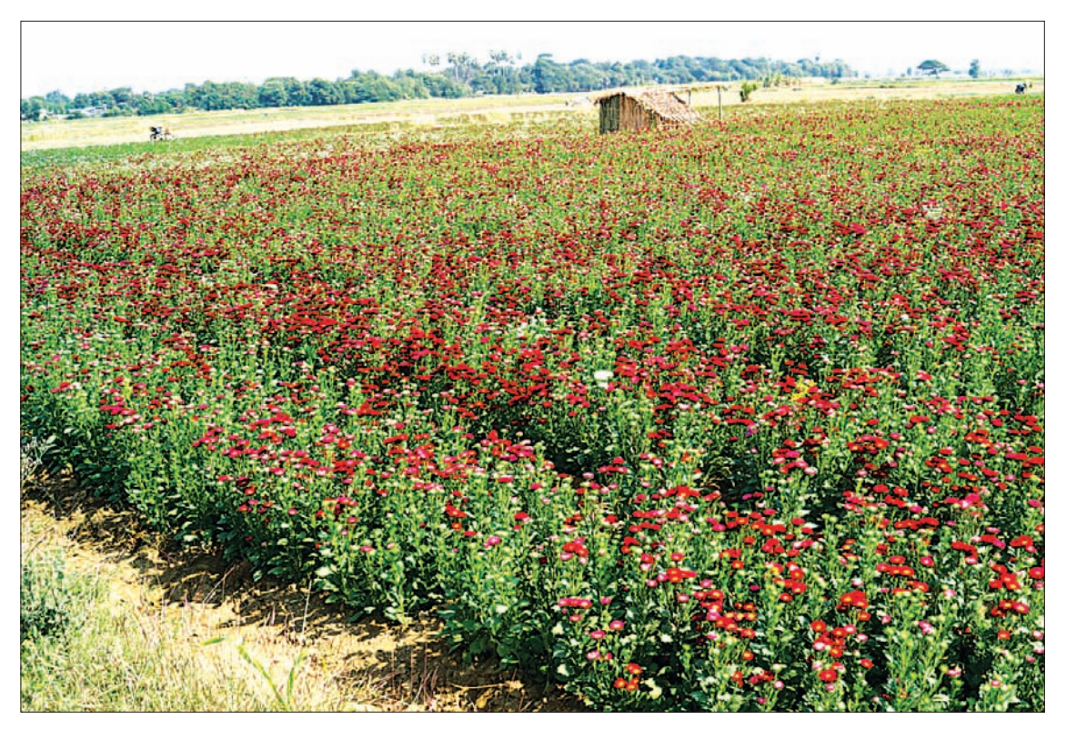
Maymyo flowers seen blossoming in a plantation in Tatkon.

Each farm employs three to five labourers to carry out irrigation and weed-clearing. A woman labourer is paid K2,000 per day, while a man makes K3,000. A bundle of seven flowers sells for between K200 and K220. The hawkers who buy the flowers at retail price gain a profit of up to K4,500 after selling their hauls, said a farmer from Chongyi Village.—Tin Seo Lwin