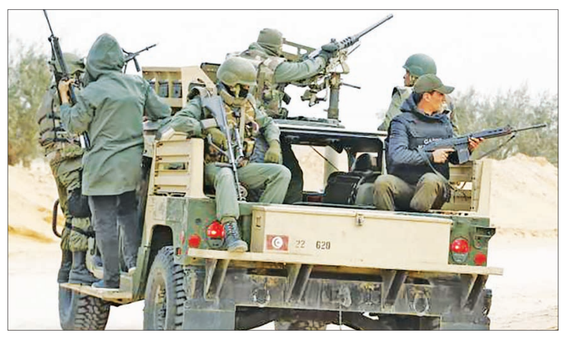
Policemen patrol during a military operation to eliminate militants in a village some 50 km (31 miles) from the town of Ben Guerdane, Tunisia, near the Libyan border on 10 March 2016.

TUNIS/ALGIERS — The signal to attack came from the mosque, sending dozens of Islamist fighters storming through the Tunisian town of Ben Guerdan to hit army and police posts in street battles that lit the dawn sky with tracer