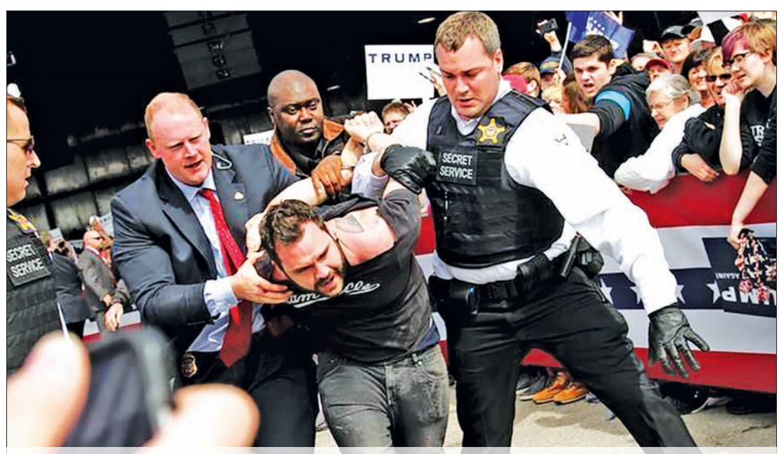
US Secret Service agents detain a man after a disturbance as US Republican presidential candidate Donald Trump spoke at Dayton International Airport in Dayton, Ohio on 12 March 2016.

DAYTON — Secret Service officers rushed on stage to protect US Republican presidential front-runner Donald Trump during a disturbance at a rally on Saturday, a day after rowdy protests shut down his event in Chicago.