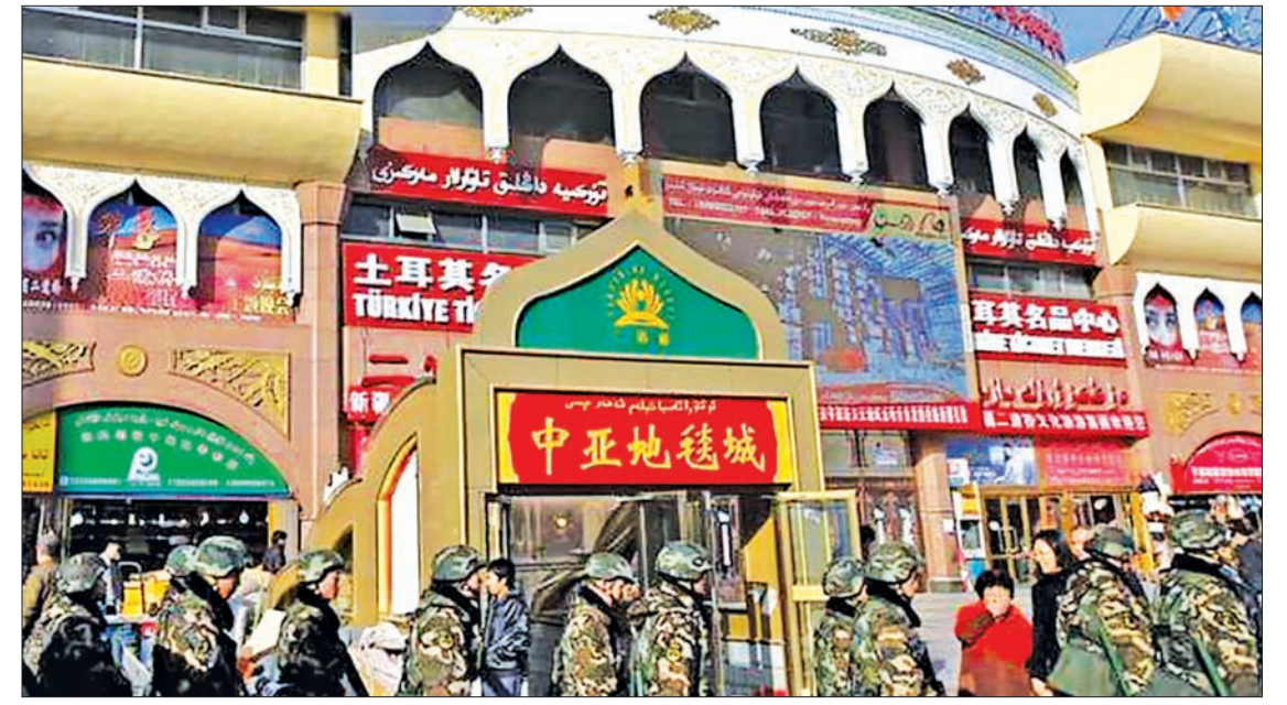
Paramilitary policemen walk past Erdaoqiao Grand Bazaar in Urumqi, Xinjiang Uighur autonomous region, in 2013.

in China's resource-rich Xinjiang Province, strategically located on the borders of central Asia, in violence between the Muslim Uighur people, who call the region home,