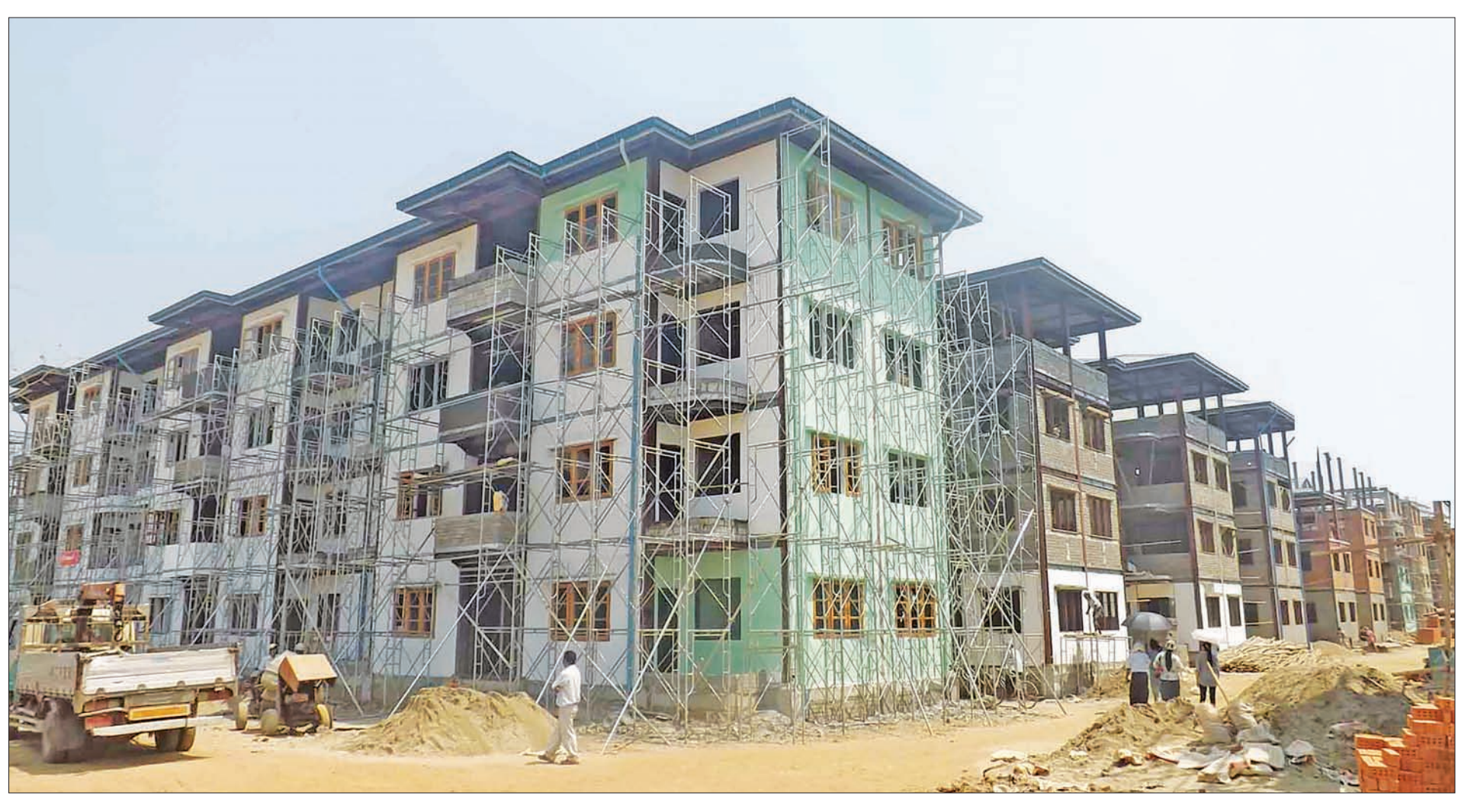
Buildings in Maha Bandoola Housing Complex are under construction.

HOMELESS people in Yangon drew lots to rent apartments at the new Maha Bandoola Housing Complex in South Dagon