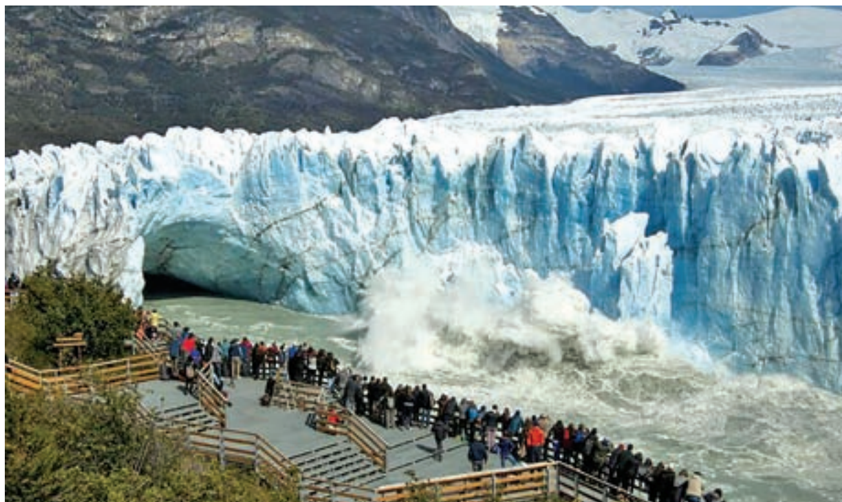
EL CALAFATE — Image taken with a mobile device on 9 March 2016 shows people watching the Perito Moreno Glacier located at Los Glaciares National Park in El Calafate Township, Santa Cruz Province, Argentina. Perito Moreno Glacier began its process of cyclical break on Wednesday. The glacier last ruptured in March 2012.