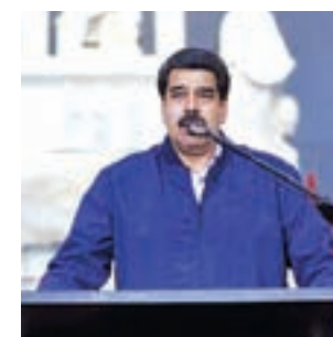
Venezuela's President Nicolas Maduro talks in front of the tomb of national hero Simon Bolivar during a ceremony at the National Pantheon in Caracas on 9 March 2016.

agreement with China,” he said, without giving any more details. Beijing has lent some $50 billion since 2007 to Venezuela, which repays with oil shipments.