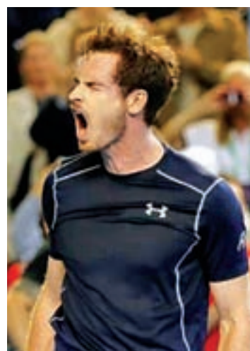
Great Britain's Andy Murray.

"If you're taking a prescription drug and you're not using it for what that drug was meant for, then you don't need it, so you're just using it for the performance enhancing benefits that drug is giving you. And I don't think that that's right."