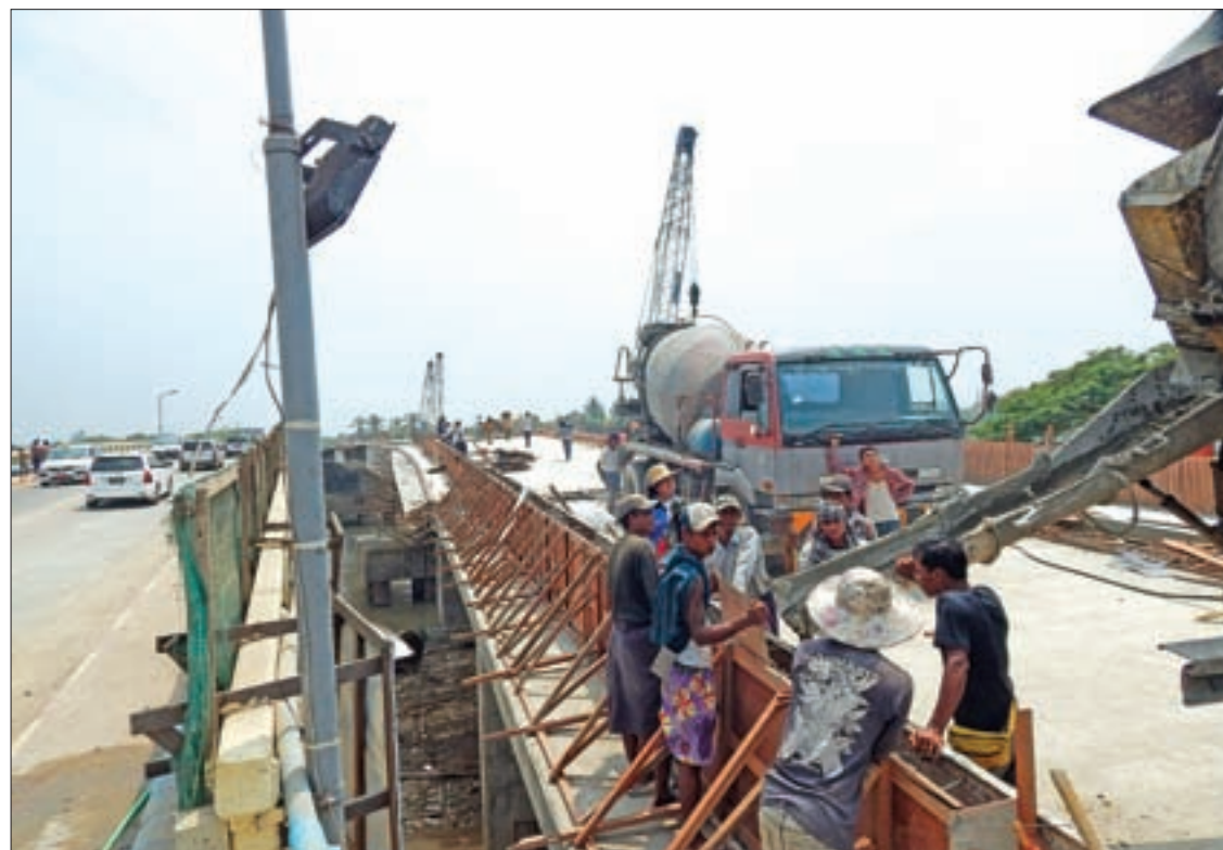
Construction workers are seen on Bohmu Bahtoo Bridge which is under construction. PHOTO: SOE WIN-MLA

Bridge construction began on 1 July 2015, with the manpower of more than 150 including engineers and workers.— Soe Win-MLA