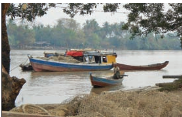
Fishermen preparing for catching fish in the Attaran River.