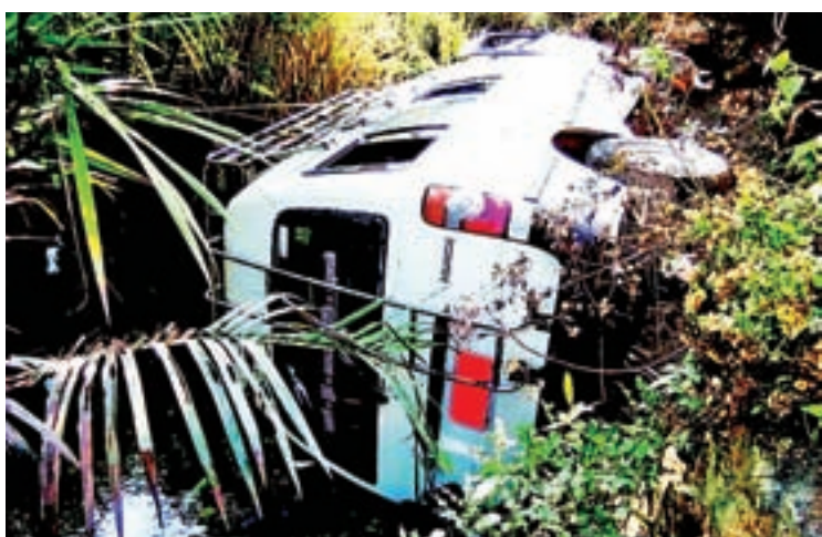
The mini bus seen overturned.

A MINIBUS leaving Kawthaung for Myeik being driven by one Shwe Tasoke, 36, plunged between mileposts 31 and 32, Kawthaung- Myeik road, Myeik township, Taninthayi region on Thursday when the driver lost control of the vehicle.