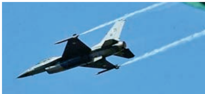
A Pakistani airforce F-16 plane flies over a Pakistani national flag during a full dress rehearsal for Pakistan Day parade in Islamabad in 2005.

China strongly denies any repression or human rights abuses in Xinjiang.—Reuters