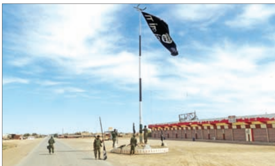
Iraqi security forces work on lowering the Islamic State flag, west of Ramadi, on 9 March.

“It’s not unreasonable to expect that as you break down the leadership of the organisation ... juniors will