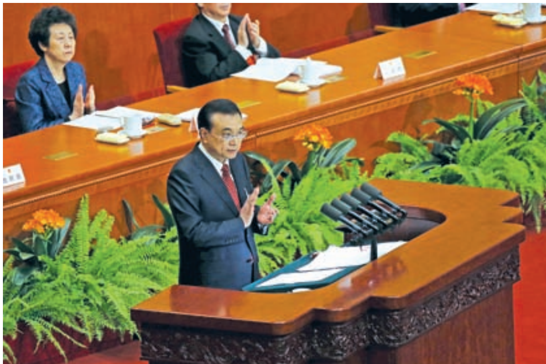
China's Premier Li Keqiang claps as he stands at a podium during the opening session of the National People's Congress (NPC) at the Great Hall of the People in Beijing, China, on 5 March 2016.

Speaking to Xinjiang delegates to China's annual meeting of parliament, including the region's Communist Party chief and governor, Li said Xinjiang occupied an "especially important strategic position", the official Xinjiang Daily said