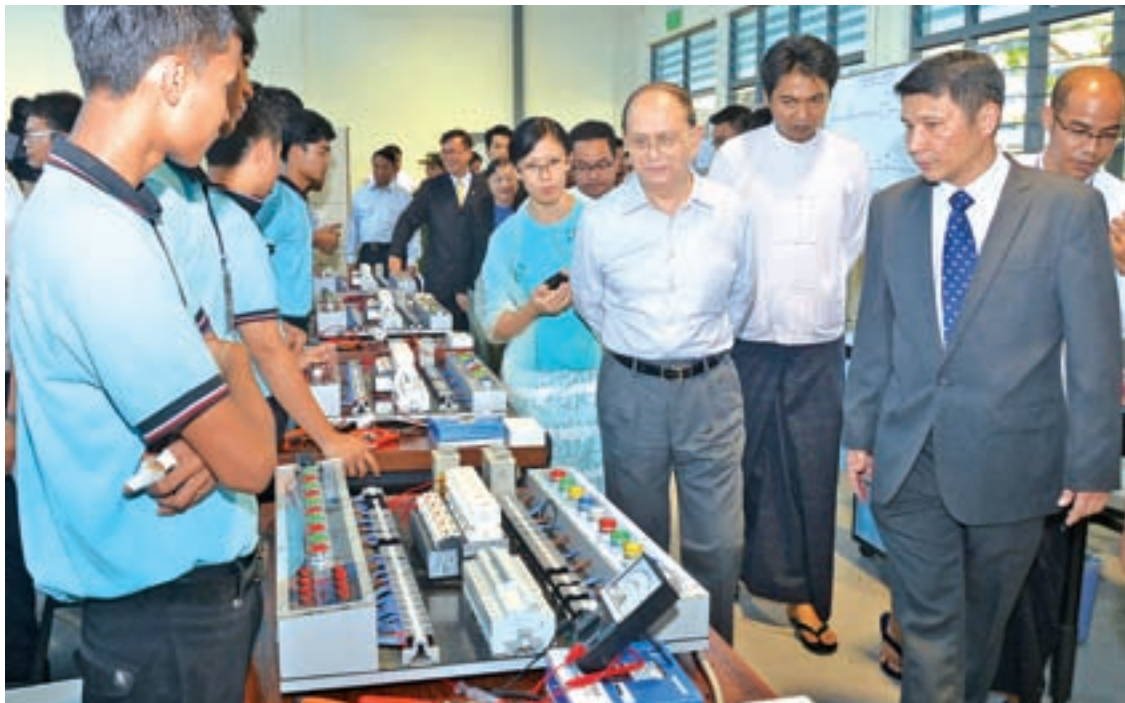
President U Thein Sein visits the Singapore-Myanmar Vocational Training Institute.

The SMVTI, established on 16 October, 2015 is offering six-month full-time training courses to Myanmar youth. The Institute can allow 800 trainees a year to take courses and is set to be officially opened in the middle of this year in commemoration of the 50th Anniversary of Myanmar-Singapore Diplomatic Ties.— Myanmar News Agency