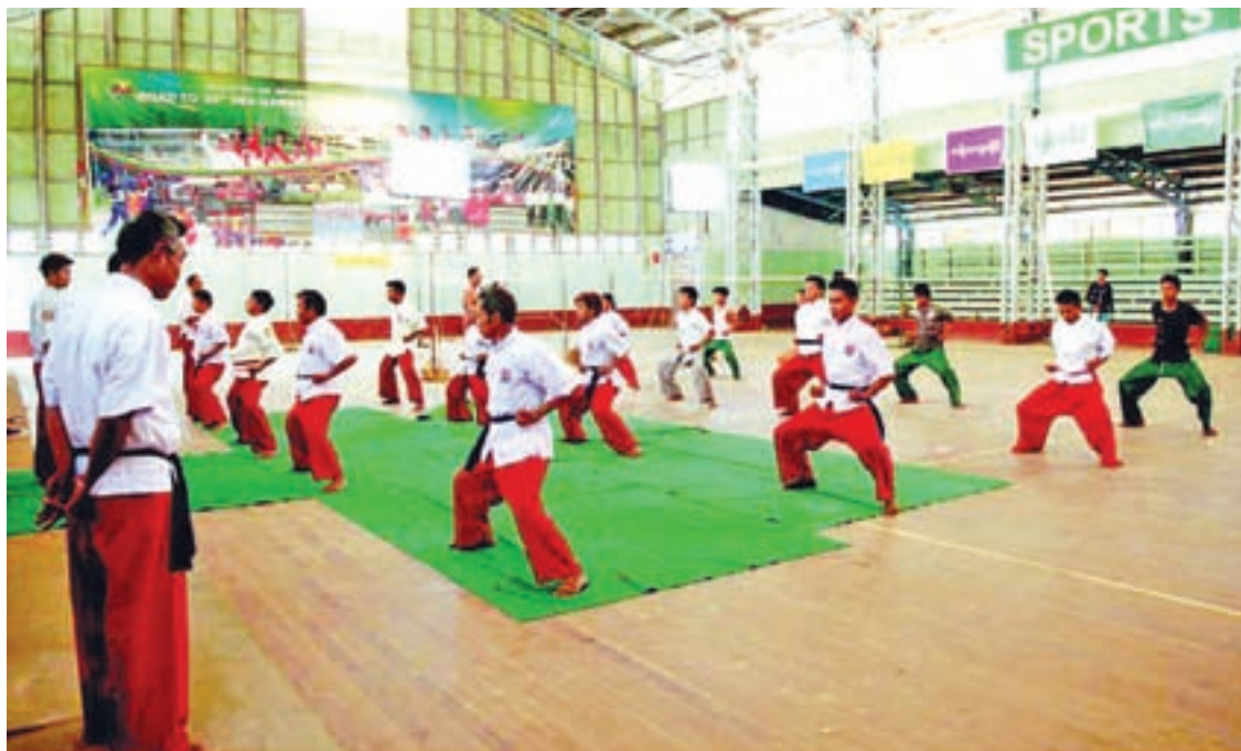
A bando refresher course for local trainers.

A MARTIAL arts refresher course for local trainers is being conducted in Monywa Township of Sagaing Region as of 3 March with the objective of promoting the role of Myanmar's traditional martial arts and enhancing fighting skills.