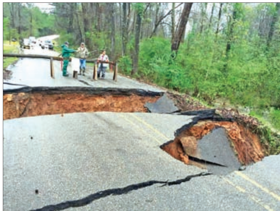
People view the washed-out Methodist Camp Road after flooding near Minden, Louisiana on 9 March 2016.

Arkansas Governor Asa Hutchinson declared 11 counties as disaster areas.