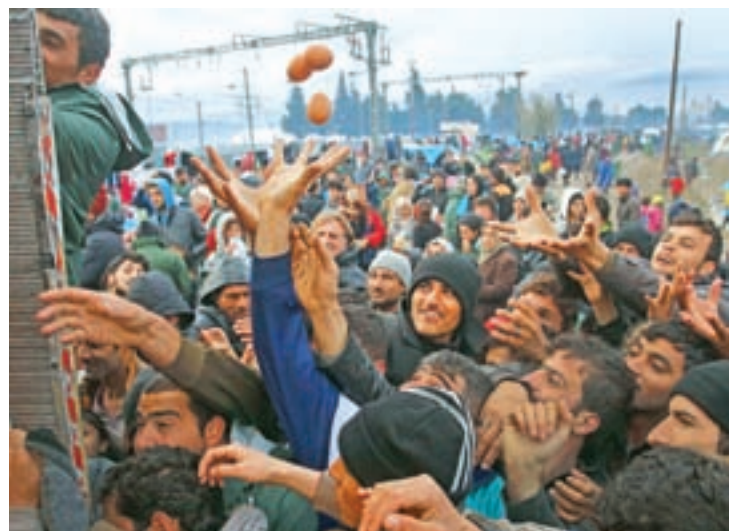
Migrants try to get products from a truck at a makeshift camp on the Greek-Macedonian border near the village of Idomeni, Greece on 10 March.

IDOMENI, (Greece) — Scores of migrants stranded on Greece's northern border scuffled for free food and water on Thursday, struggling to seize eggs and bread thrown from a truck at the muddy tent city which has become their temporary home.