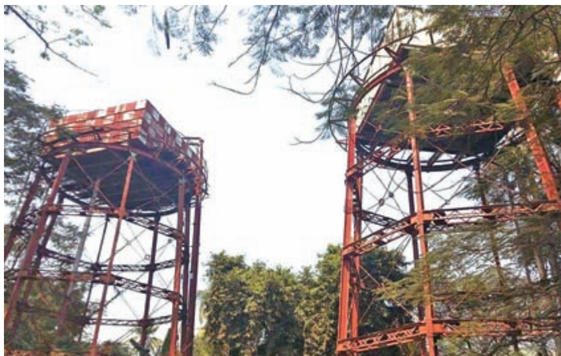
Water tanks are established in Monywa to supply water to local people.