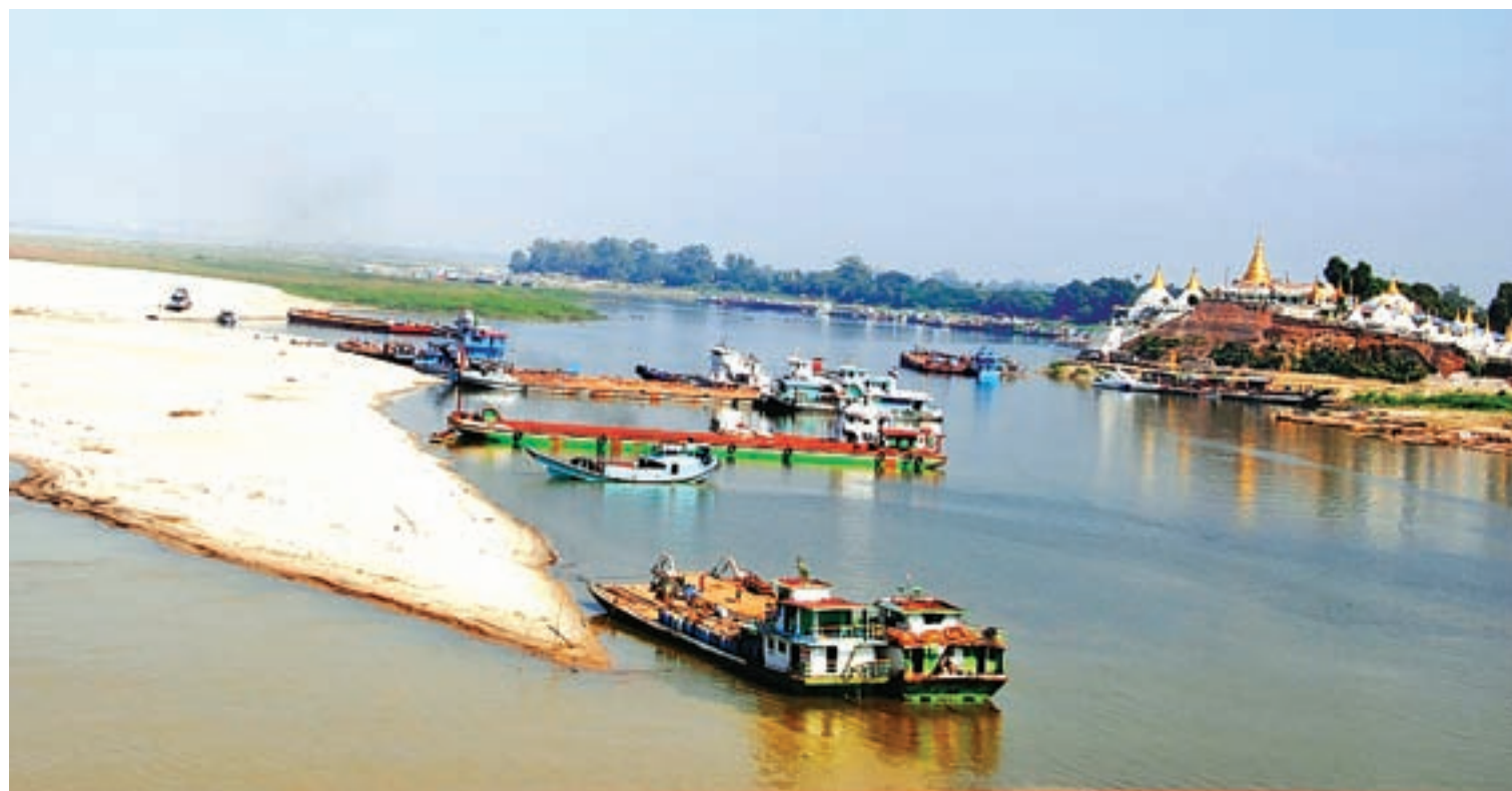
Water crafts are seen in the Ayeyawady River.