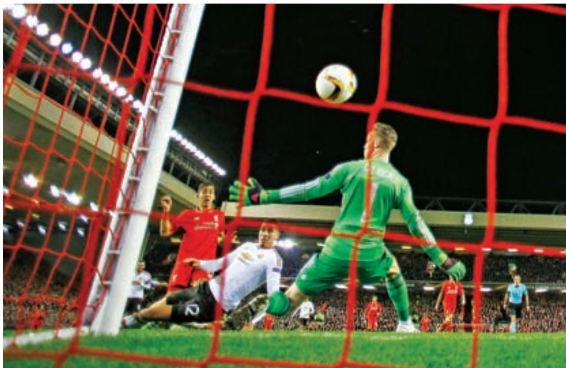
Roberto Firmino scores the second goal for Liverpool during UEFA Europa League Round of 16 First Leg at Anfield, Liverpool, England, on 10 March.

Sevilla's Steven N'Zonzi was sent off with three minutes to go as the holders, bidding for a third straight trophy, drew 0-0 at Basel while Athletic Bilbao beat Spanish rivals Valencia 1-0 with a 20 th -minute goal from Raul Garcia.