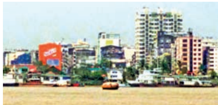
Yangon River where the sampan overturned.