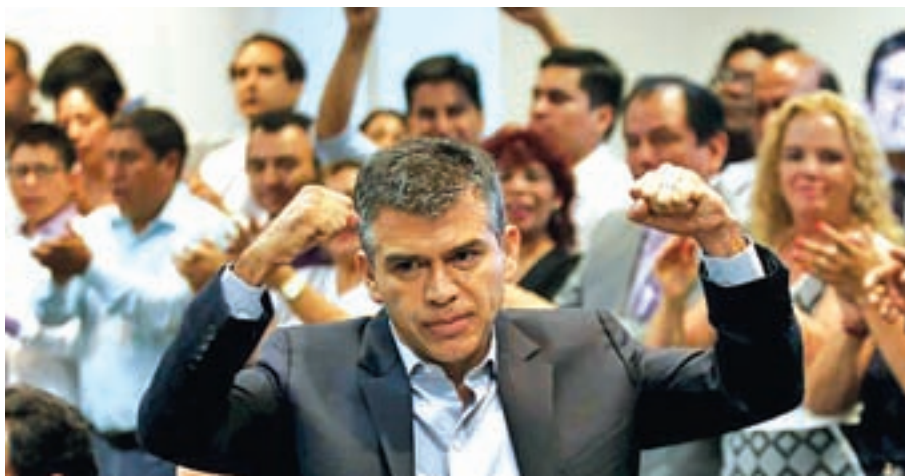
Peru's presidential candidate Julio Guzman gestures during a news conference after Peru's electoral board excluded him from the presidential elections, in Lima, on 10 March.