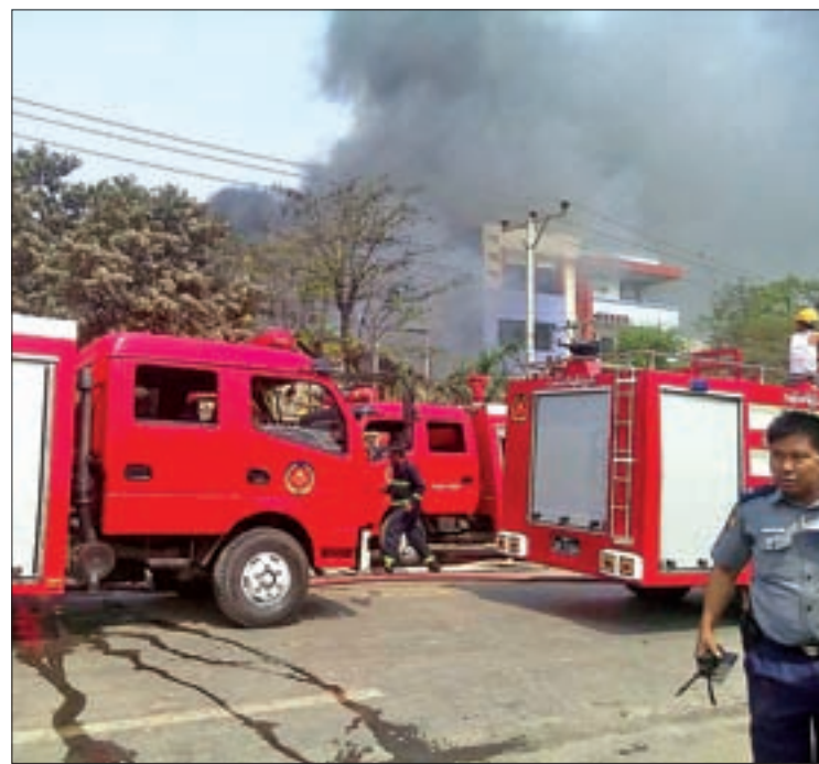
Some firemen got injuries as they tried to control the fire at cork factory in Mandalay on 11 March, 2016.