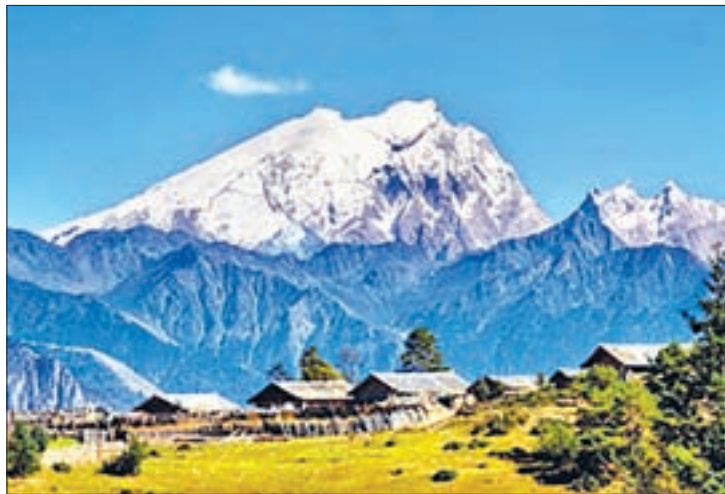
Mt. Khakaborazi in Putao, Kachin State.