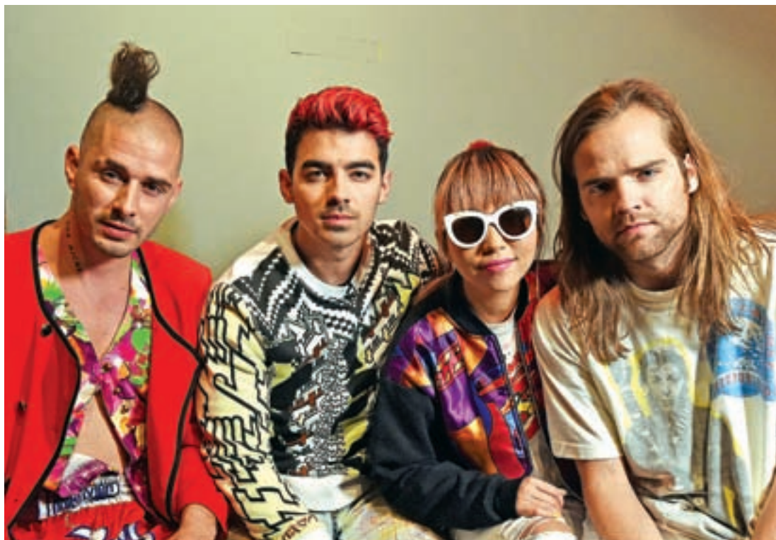
US musician Joe Jonas (2 nd L) poses for a photograph with his band DNCE during an interview with Reuters in London, Britain, on 8 March 2016.