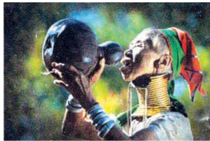
A photo highlighting the lifestyle of Padaungs. PHOTO: KYAN DAING AUNG

The Yangon Gallery is located within the compound of People's Park near Planetarium on Alone Road.— Kyan Daing Aung