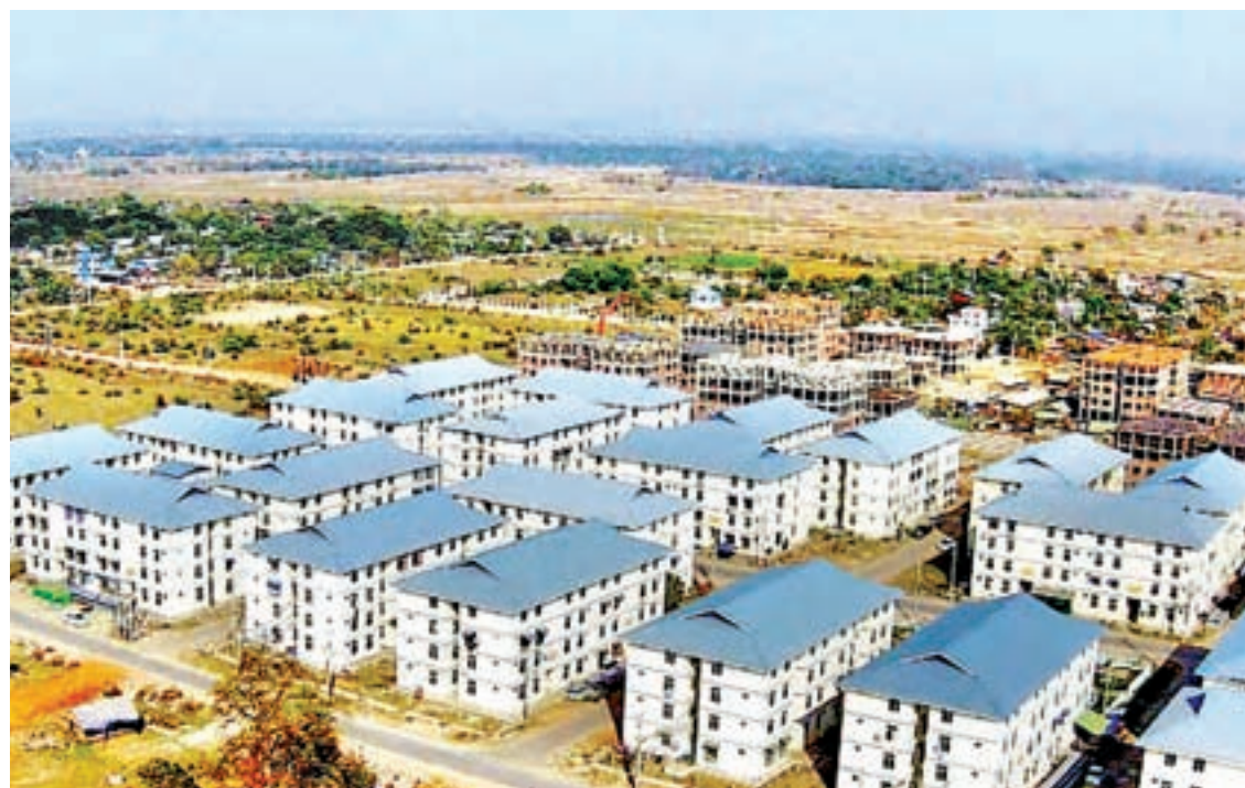
Photo shows the low-cost apartments in Mandalay.

OVER 9,000 eligible government staffers have sent their applications to the Mandalay City Development Committee to buy low-cost apartments, according to the MCDC.