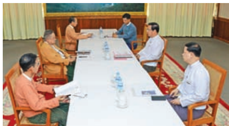
Meeting between the government's supporting committee and the transition team of the National League for Democracy.