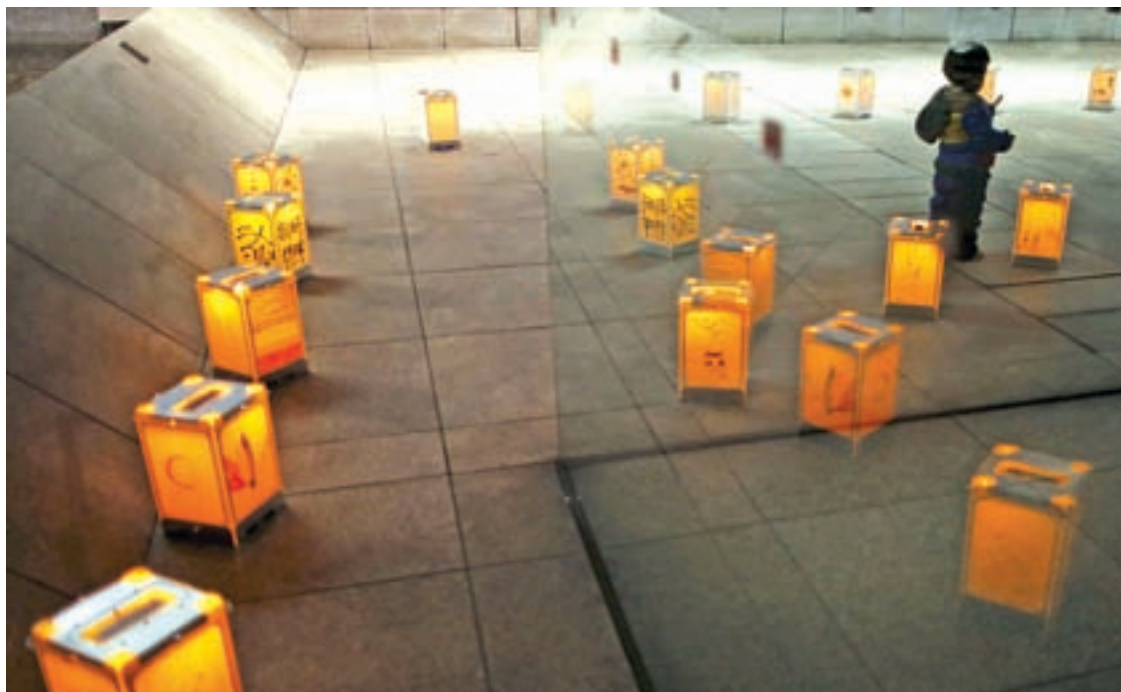
Lanterns from northern Japanese city Natori are illuminated during an event to pray for the reconstruction of areas devastated by the on 11 March 2011 earthquake and tsunami, and mourn victims of the disaster at the Canadian embassy in Tokyo, Japan, on 10 March 2016, a day before the five-year anniversary of the disaster.

Some areas remain no-go zones due to high radiation. Demonstrators in front of plant operator Tokyo Electric Power Co (Tepco) bore signs saying, "Give