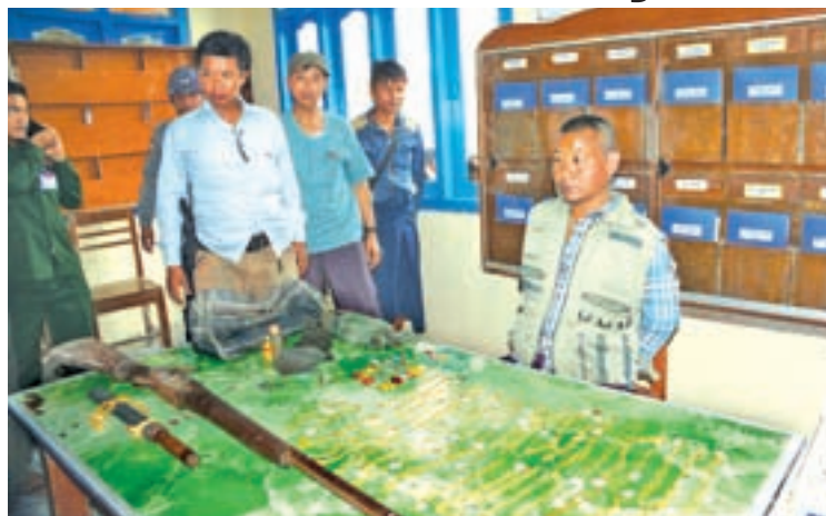
The robber seen with the gun used.

According to an investigation, a man who covered his face with a mask and held a gun robbed the Shwe War Linn Jeweler around 9:30am on Bogyoke road in Aung Myay Man ward, Kale. He forcibly took away with him 41 gold chains and 28 pairs of gold earrings in the presence of the shop owner. He escaped on a motor bike.— Chin Dwin Thar