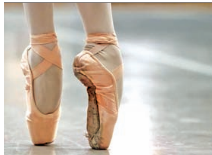
A ballet dancer performing on blocked shoes during a classical class at the Prix de Lausanne in Lausanne.

All styles of dance tend to have slow or quick tempo op-