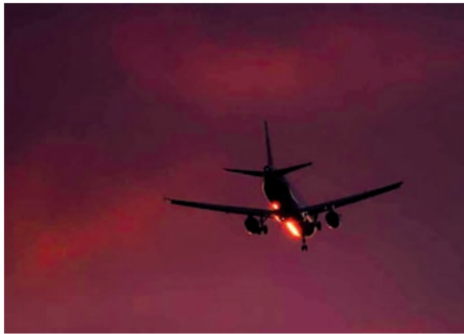
A passenger aircraft makes its landing approach at dusk at Heathrow airport in west London, on 7 March 2016.

Aviation was excluded from the landmark climate accord in Paris in December when countries agreed to limit the rise in global temperatures to "well be-