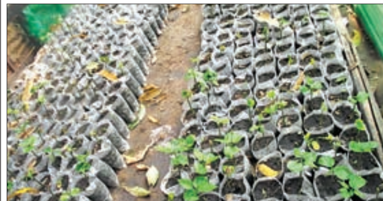
Saplings of Star Beans seen at the plantation.

The star beans have been grown on a commercial scale in Keng Tung Township, Tachilek Township, and upper of Sagaing Region.— Shwe Te Yint (Oakara IPRD)