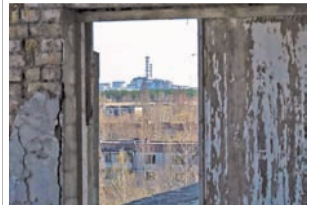
A containment shelter for the damaged fourth reactor at the Chernobyl Nuclear Power Plant is seen from the abandoned town of Pripyat, Ukraine, on 23 April 2013.

"And just as this contamination will be with them for decades to come, so will the related impacts on their health. Thousands of children, even those born 30 years after Chernobyl, still have to drink radioactively contaminated milk." Russia's ministries of health and natural resources did not immediately respond to a Reuters request for comment on the report. In Ukraine, the health, agriculture and ecology ministries did not immediately respond.—Reuters