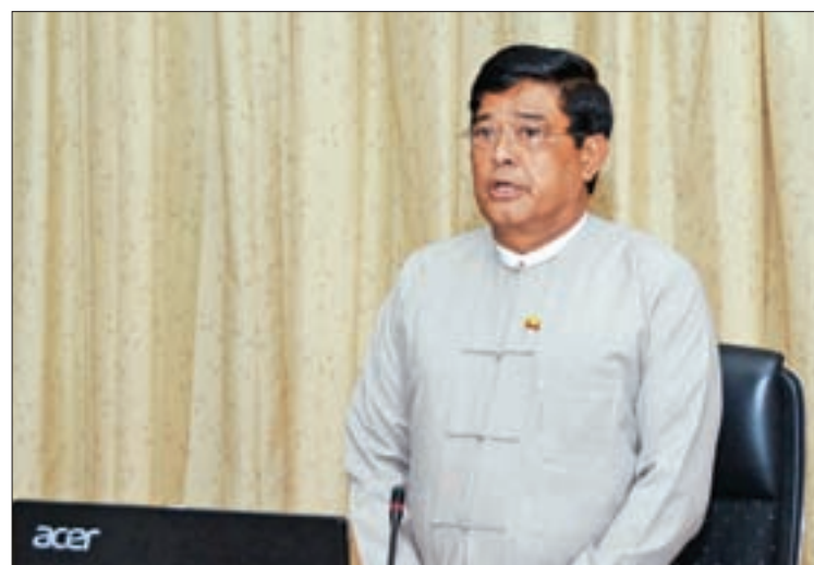
Vice President U Nyan Tun delivers speech at the meeting of the rural development and poverty alleviation work committee.

After hearing reports presented by the Union ministers, region/state chief ministers, deputy ministers and officials, the Vice-President called for sound advice to be given for the implementation of follow-up tasks.— Myanmar News Agency