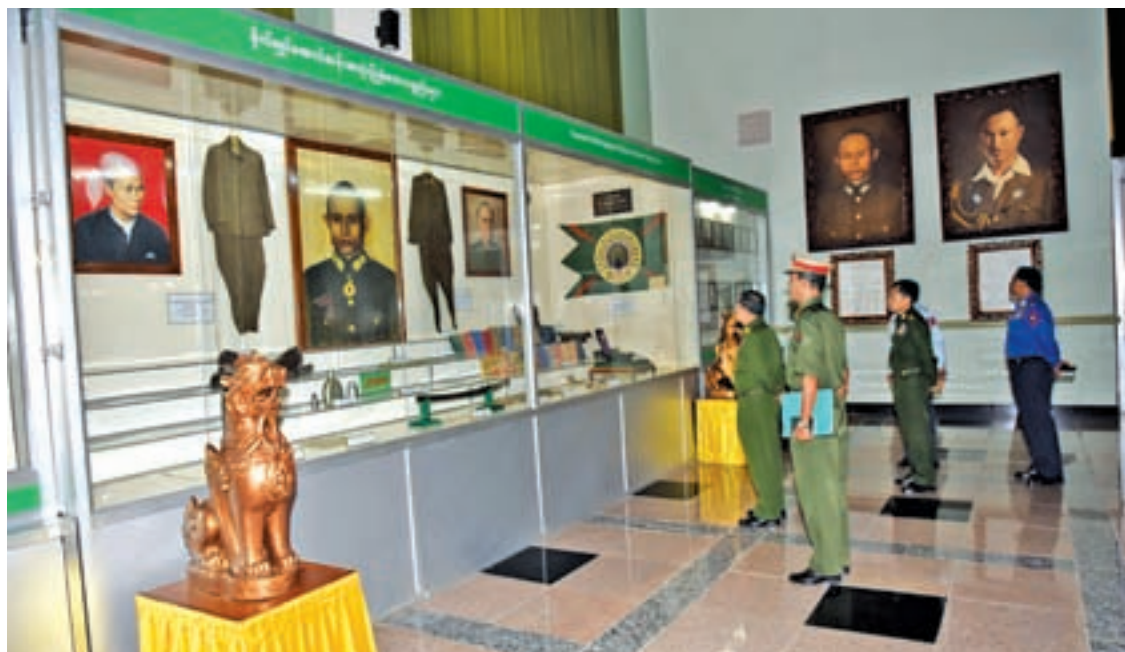
Senior General Min Aung Hlaing visits the museum.

Without stability and the rule of law, there will only be an arbitrary democracy. So, abidance by law matters to effectuate a disciplined democracy. If we really love and cherish democracy, and if we want it to last long, we need