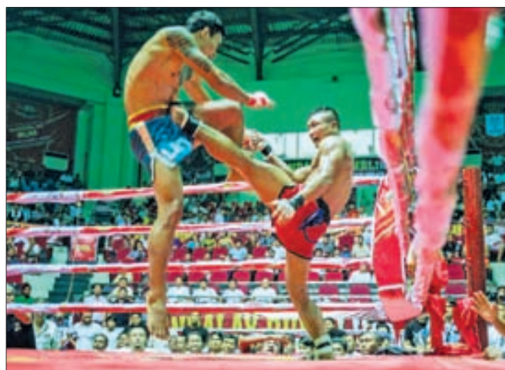
A professional Lethwei fight in action.

"I'm a bit shocked, we lost our two centre backs in the game and we lost Aaron Ramsey," manager Arsene Wenger told BT Sport following his team's sixth match in a hectic 18-day spell.—Reuters