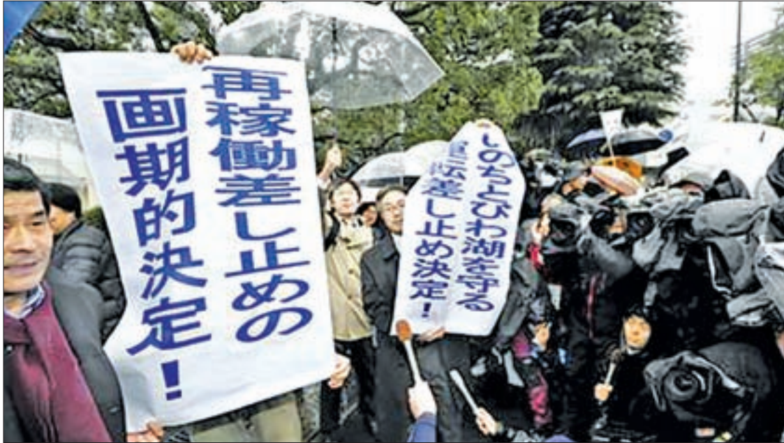
People hold up banners in front of the Otsu District Court in the western Japan prefecture of Shiga on 9 March 2016, to welcome the court's ruling that ordered Kansai Electric Power Co. not to operate two nuclear reactors at its Takahama plant despite their having cleared a set of new safety standards introduced after the 2011 Fukushima disaster.

OTSU (Japan) — A Japanese district court yesterday ordered Kansai Electric Power Co. not to operate its two reactivated nuclear reactors, delivering a blow to the government's push for nuclear power under new safety requirements introduced after the 2011 Fukushima disaster.