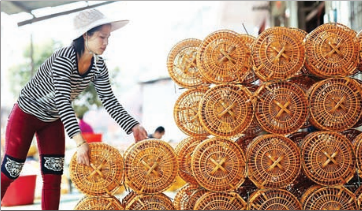
LIUJIANG — A woman moves finished birdcages at a family workshop in Baipeng Town of Liujiang County, southwest China’s Guangxi Zhuang Autonomous Region, on 8 March 2016. Left-behind elders and women here, whose young relatives work in big cities, have supported the birdcage weaving industry, which can produce more than 500,000 birdcages every year with annual production value exceeding 10 million yuan (1.535 million US dollars).

LONDON — From a tiny 4,000-year-old cuneiform tablet to Stephen Hawking’s draft typescript of A Brief History of Time, about 80 most valuable books and manuscripts will be exhibited at the Cambridge University library for its 600 th anniversary.