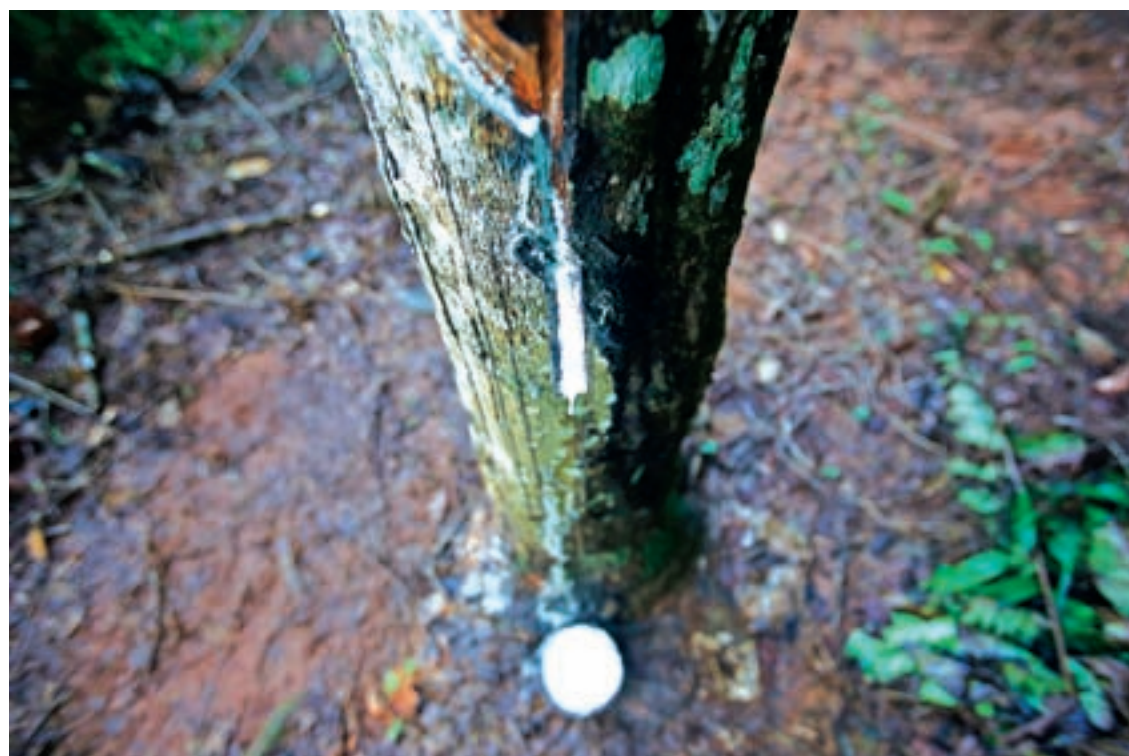
Tapping sap from a rubber tree.