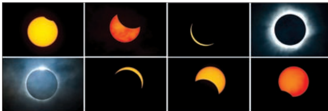
A combination photograph shows the beginning to the end (top L to bottom R) of a total solar eclipse as seen from the beach of Ternate island, Indonesia, on 9 March 2016.

A partial eclipse of the sun was visible to millions in Australia, parts of Southeast Asia and the Pacific, but only people in a small band of Indonesia had the opportunity to see the moon perfectly silhouetted by the sun.