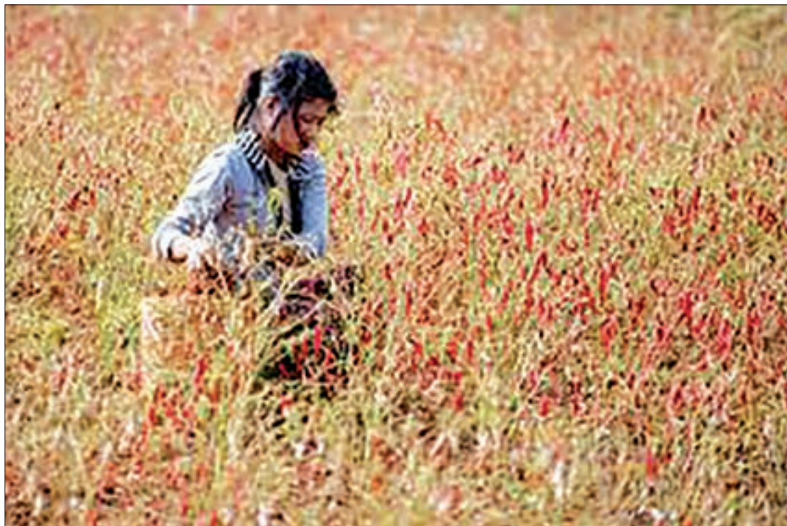
A woman harvesting Chilli in Kalaw.

CHILI production is estimated to drop this season as pepper plantations across Ayeyawady Region have been seriously damaged by Spodoptera mauritia , a caterpillar that feeds on rice, locals say.