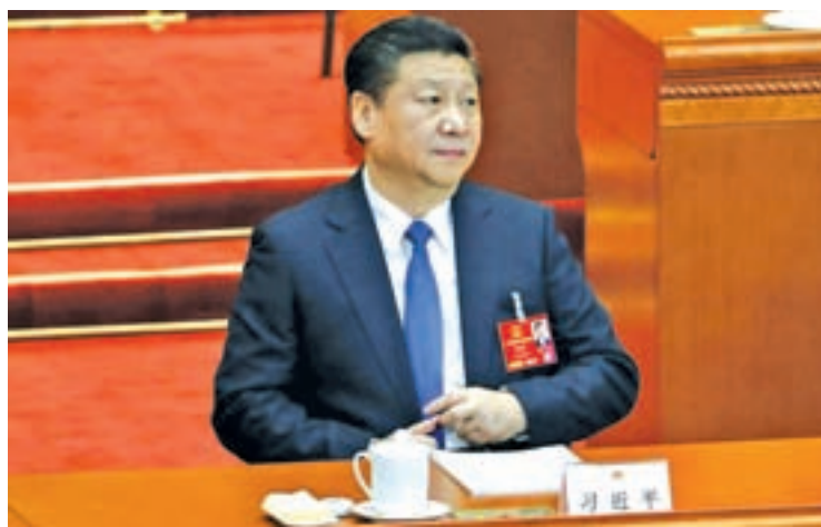
China’s President Xi Jinping attends the second plenary session of the National People’s Congress (NPC) at the Great Hall of the People in Beijing, China, on 9 March 2016.

BEIJING — China is taking a “distinctly Chinese approach” to national security with a raft of new laws, including one on counterterrorism, the third-ranked leader said yesterday, offering a strong rebuttal to Western criticism.