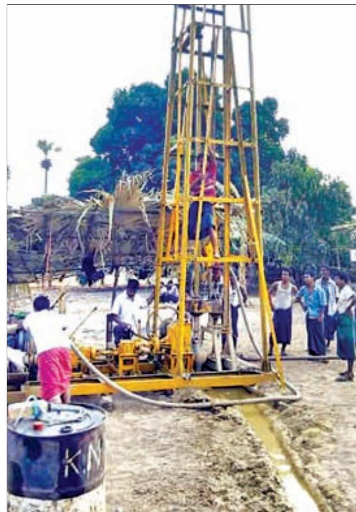
A tube-well being dug in Indaw village, Natmauk Township.

There are 120 households and 600 people in the village. Those wishing to donate funds will have to contact either 09 – 256197223 or the Indaw village committee. — Chanthar (Meikhtila)