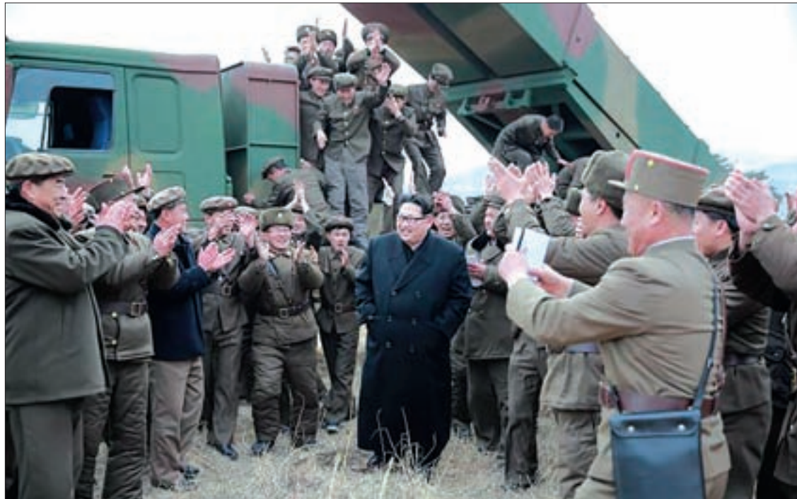
North Korean leader Kim Jong Un (C) smiles as he guides a test fire of a new multiple launch rocket system in this undated photo released by North Korea's Korean Central News Agency (KCNA) in Pyongyang on 4 March 2016.

SEOUL — North Korean leader Kim Jong Un said the country has miniaturised nuclear warheads to mount on ballistic missiles and ordered improvements in the power and precision of its arsenal, state media reported yesterday.