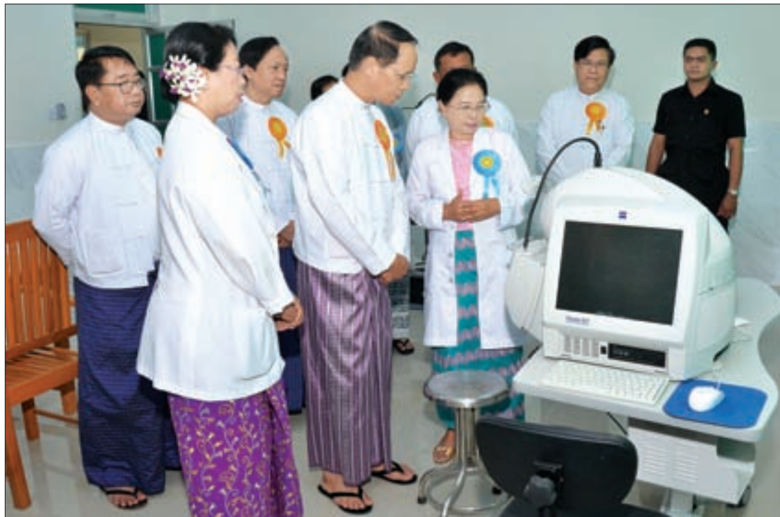
Vice President Dr Sai Mauk Kham visits new Eye, Ear, Nose and Throat Hospital in Ottarathiri Township in Nay Pyi Taw.