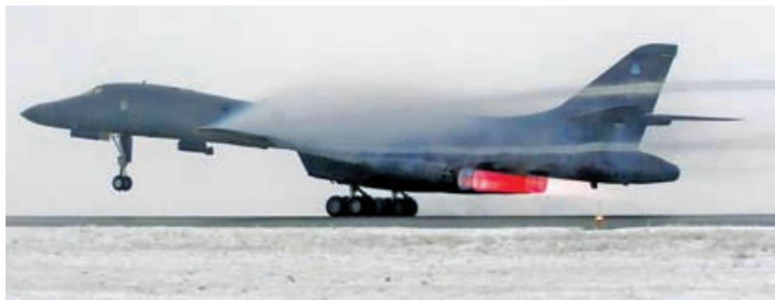
A B-1B Lancer strategic bomber takes off from Ellsworth Air Force Base, in support of Operation Odyssey Dawn in Libya.

SYDNEY/WASHINGTON — The United States is in talks to base long-range bombers in Australia, US defence officials said, within striking distance of the disputed South China Sea, a move that could inflame tensions with China.