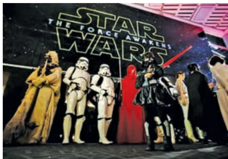
Moviegoers wait before the first showing of the movie "Star Wars: The Force Awakens" at the entrance of a movie theatre in Tokyo, Japan, on 18 December 2015.

"Star Wars: The Force Awakens" failed to win any of its