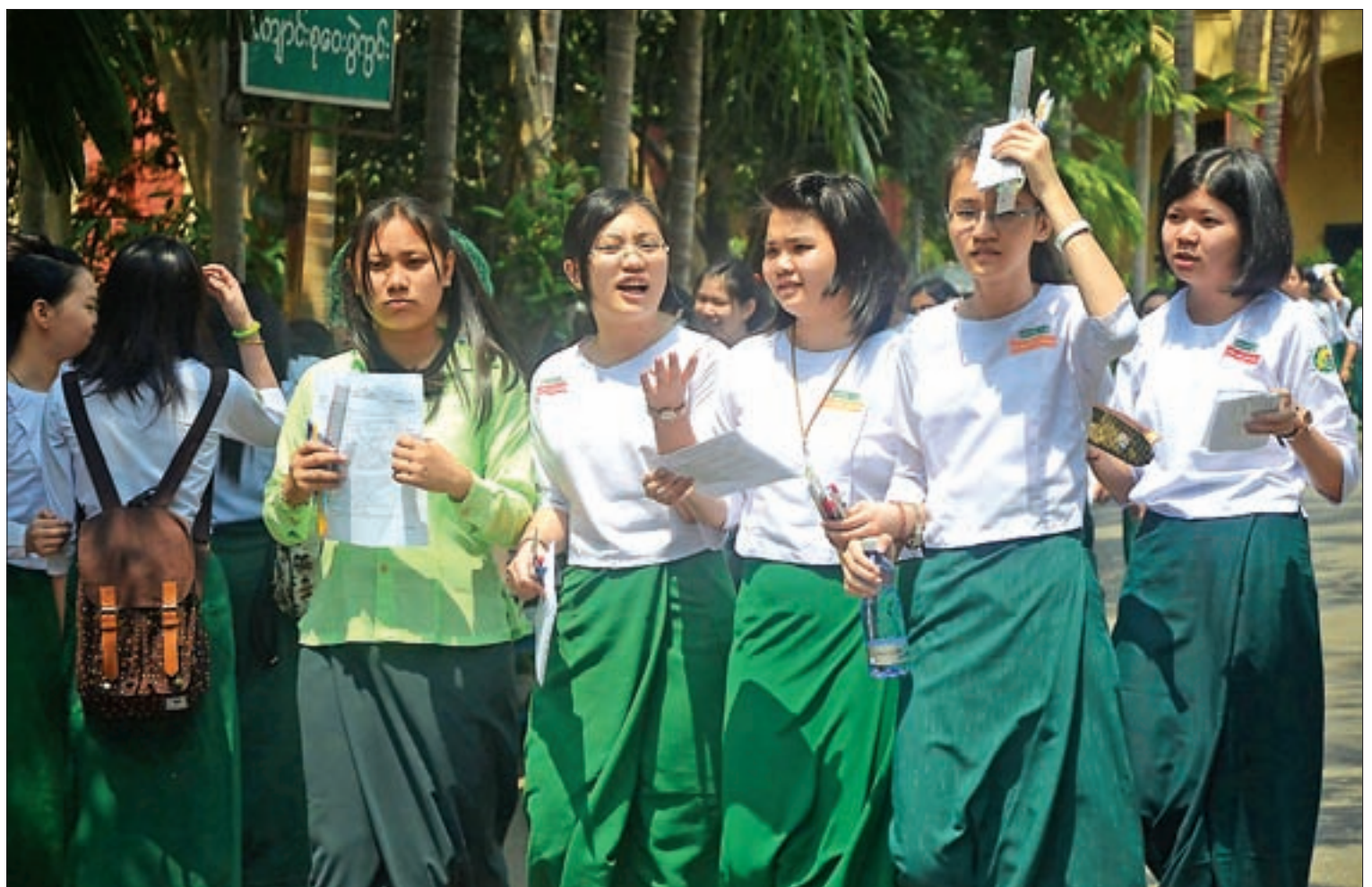
School girls are seen after first day of the matriculation exam on Wednesday, 9th March, 2016.

Of the 95,656 who have registered to sit for the exam-