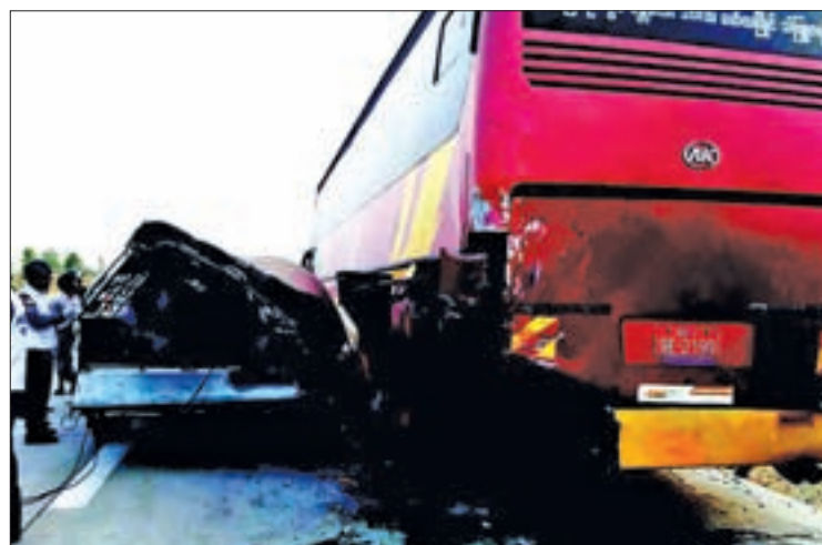
Damaged car seen at the site of the accident.

The accident killed U Zaw Than Oo, 52, and Ma Moe Thidar on the spot while another fourteen were seriously injured. The injured were rushed to Meiktila general hospital. The driver has been charged by local police.— Chan Thar (Meiktila)