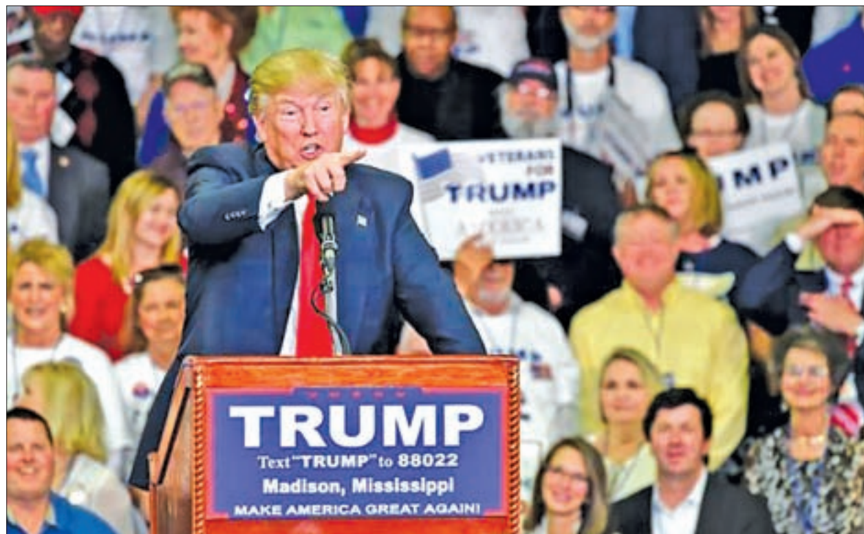
Republican presidential hopeful Donald Trump speaks during a campaign rally at the Madison County School District on 7 March.

The 69-year-old New Yorker built his victories in Michigan, in the heart of the industrial Midwest, and Mississippi in the Deep South with broad appeal across many demographics. He won evangelical Christians, Republicans,