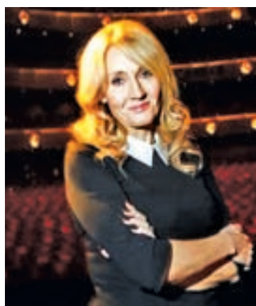
Author JK Rowling.

Wednesday's piece will look at "the dangers faced by witches and wizards in the New World" and Thursday's will reveal "why