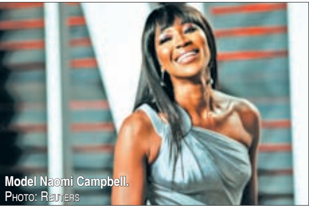
Model Naomi Campbell.

Campbell said her mother, who travelled to Israel with her, was her inspiration and as a single parent had sacrificed a lot for her.—Reuters