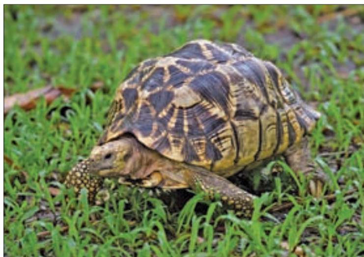
A tortoise seen in the farm.

He added: "Since 2012, we returned three baby star tortoises to the forest and fed them natural products. The breeding of the Myanmar star tortoise is difficult; however, the project produced successful outcomes, resulting in population gains every