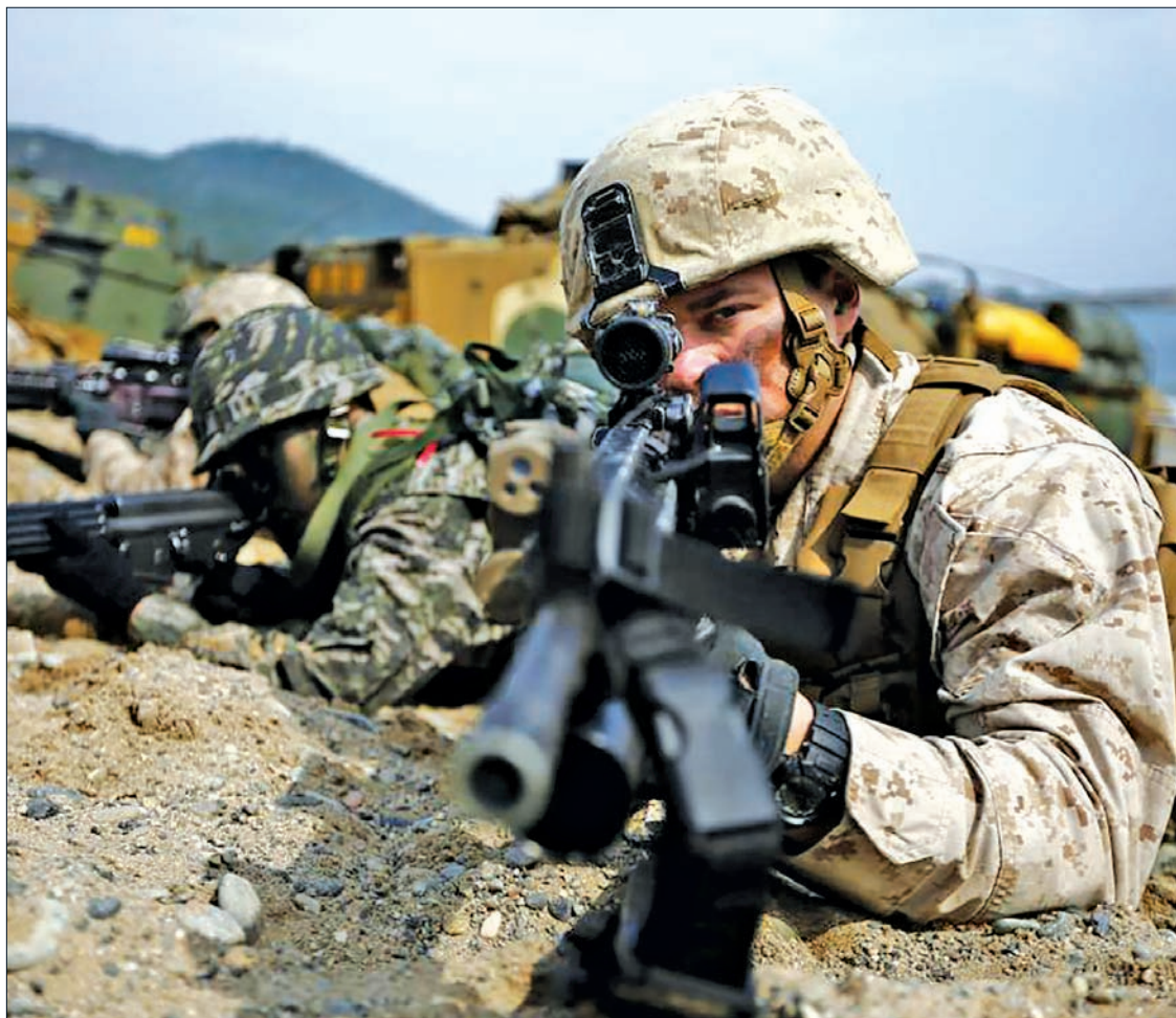
US and South Korean marines participate in a US-South Korea joint landing operation drill in Pohang, South Korea, in 2014.

People's Republic of Korea (DPRK), as it is officially known, routinely issues threats of military action in response to the annual exercises that it sees as preparation for war against it.