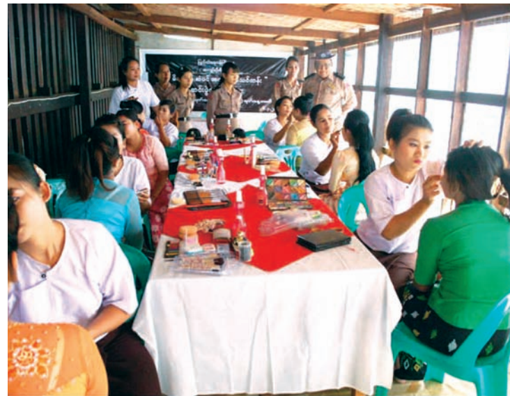
Make-up training session in jail.

THE Myanmar Correctional Department conducted a three-month hair and make-up styling course of for woman prisoners in Monywa Prison with the aim to provide the inmates with vocational skills.