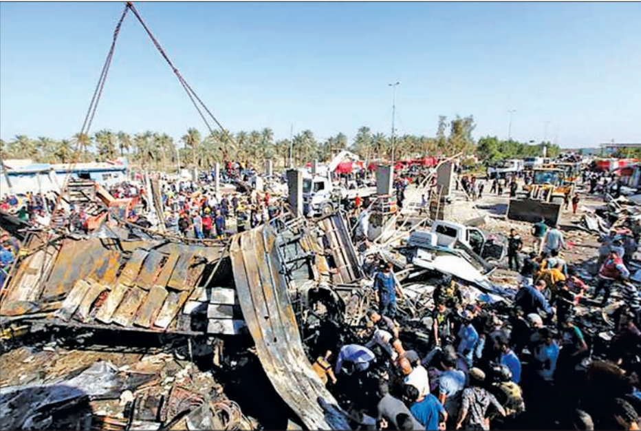
Residents gather at the site of a car bomb attack at a checkpoint in the city of Hilla, south of Baghdad, on 6 March 2016.

HILLA,( Iraq) — A truck bomb at an Iraqi checkpoint south of Baghdad killed at least 60 people and wounded more than 70 on Sunday, medical and security officials said, and Islamic State claimed responsibility for the blast. The suicide attack, involving an explosive-laden fuel tanker, is the second deadliest this year after one