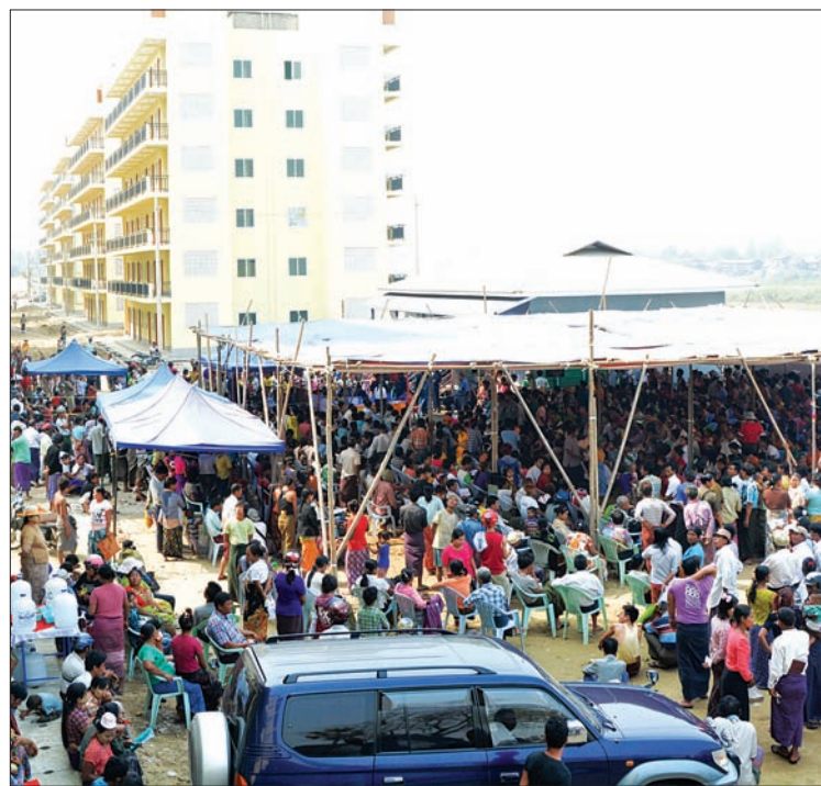
People waiting for lucky draw programme to resubmit for rental apartments in Mandalay.