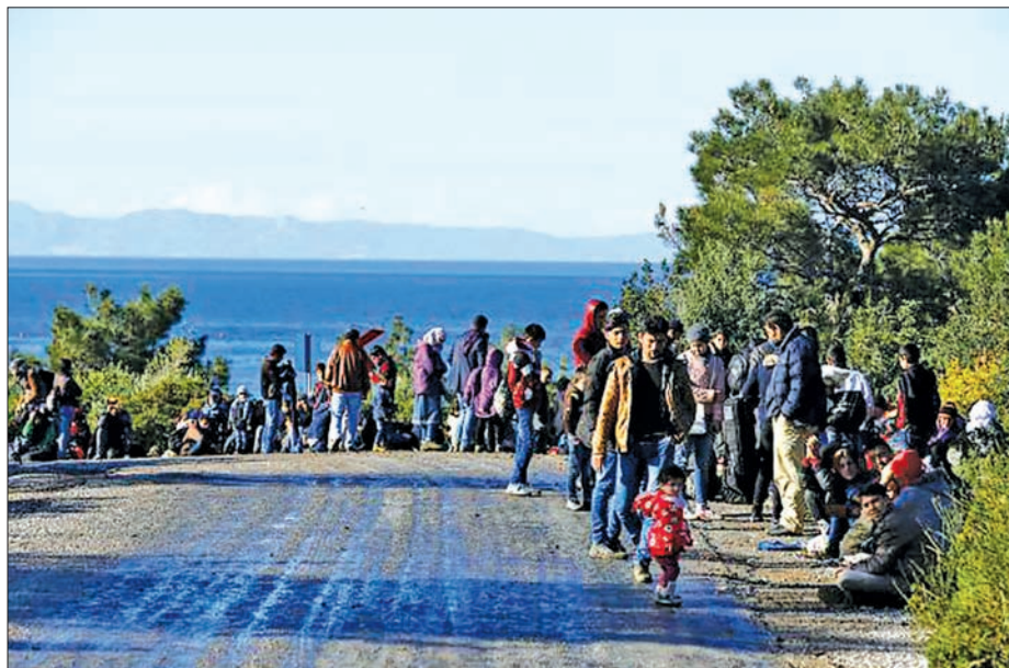
Syrian refugees wait on a roadside near a beach in the western Turkish coastal town of Dikili, Turkey, after Turkish Gendarmes prevented them from sailing off for the Greek island of Lesbos by dinghies, on 5 March.

BRUSSELS — EU leaders sit down with Turkey's premier yesterday seeing a glimmer of hope for an end to the refugee crisis that has divided Europe but troubled by having to seek favours from a government that scorns their ideas of human rights.