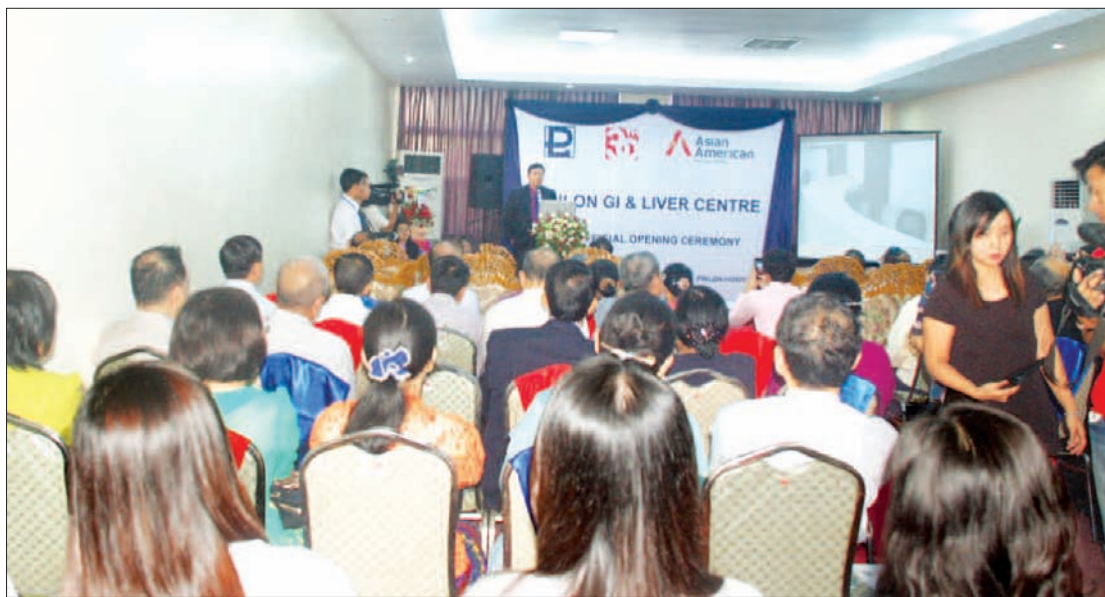
The new GI & Liver Centre opening ceremony in progress.

MYANMAR'S first Gastrointestinal and Liver Centre was opened on 6 March in North Dagon Township, Yangon, with the aim of providing comprehensive quality treatment for patients infected with viral hepatitis. The centre will alleviate the need for patients to receive medical treatment abroad.