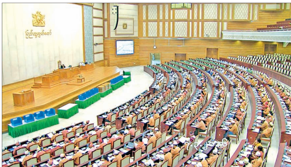
Pyithu Hluttaw is convened in Nay Pyi Taw.