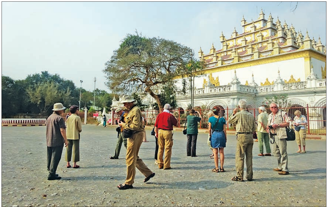
Tourists being seen taking the photos of a pagoda.

Moreover, foreign travellers have been arriving at Mandalay by vehicles and motorbikes through the Mandalay-Muse Union highway and the Mandalay-Tamu highway. Tourists coming to Mandalay visit Myansankyaw Golden Palace, Mandalay Hill, Maha Muni Pagoda, U Bein Bridge, the Golden Temple, Ahtumashi Monastery, the Thatahtarna Pagodas, gold embroidery businesses and gold foil businesses.— Thiha Ko Ko