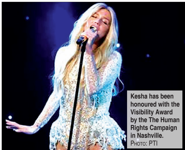
Kesha has been honoured with the Visibility Award by the The Human Rights Campaign in Nashville.

LOS ANGELES — Singer Kesha has been honoured with the Visibility Award by the The Human Rights Campaign in Nashville.