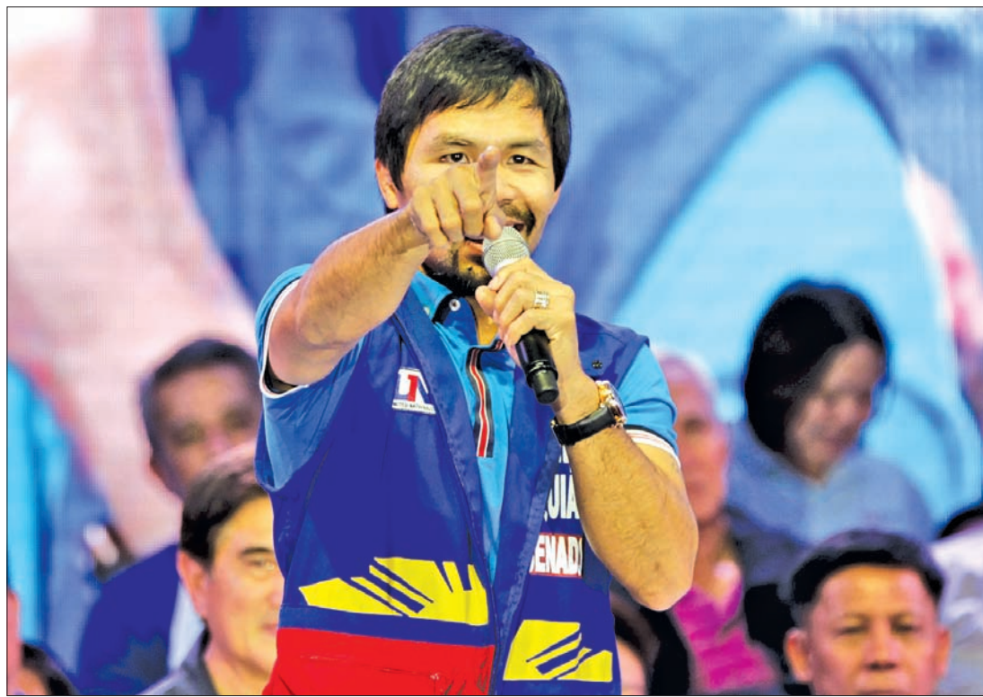
Filipino boxer Manny Pacquiao, who is running for Senator in the May 2016 national elections, speaks to supporters during the start of elections campaigning in Mandaluyong city, Metro Manila on 9 February.

The bout will take a maximum of 36 minutes for a 12-round fight, or less if the fight does not go the distance. Under the law, all candidates are given up to