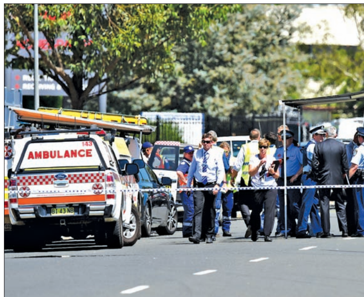
Police and emergency services personnel can be seen behind a road block at the scene of a shooting in the western Sydney suburb of Ingleburn, on 7 March.

In December 2014, a lone gunman and self-styled sheikh who claimed allegiance to the Islamic State militant group took 17 hostages at a cafe in central Sydney. The gunman and two hostages were killed in the final minutes of the 16-hour siege.—Reuters