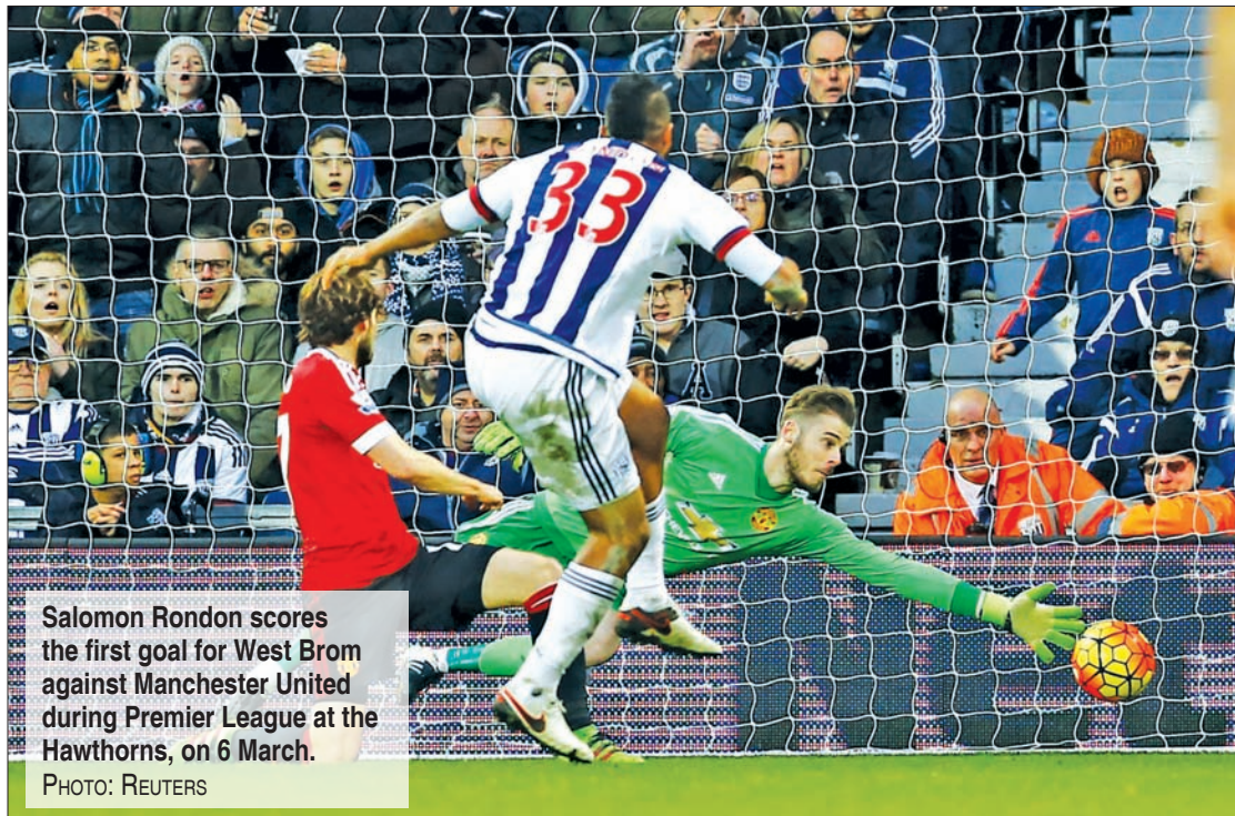
Salomon Rondon scores the first goal for West Brom against Manchester United during Premier League at the Hawthorns, on 6 March.