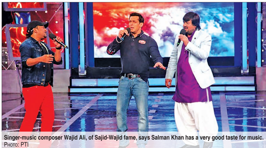
Singer-music composer Wajid Ali, of Sajid-Wajid fame, says Salman Khan has a very good taste for music.

Wajid will be seen mentoring aspiring singers on the show "Sa Re Ga Ma Pa" along with Sajid, music composer Pritam and singer Mika Singh.