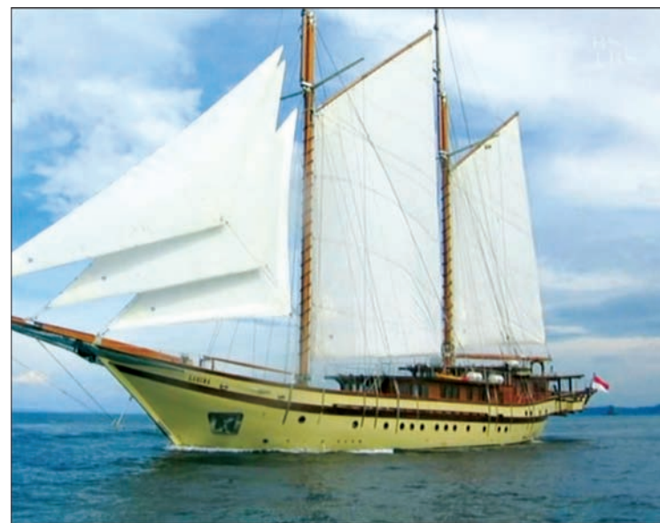
Yacht trips have resumed now.

CROWDS of tourists are flocking to Kawthoung, Taninthayi Region, during the peak season for tourism in Myanmar after restrictions on sightseeing boat tours around the Myeik Archipelago were relaxed, according to the Ministry of Hotels and Tourism.