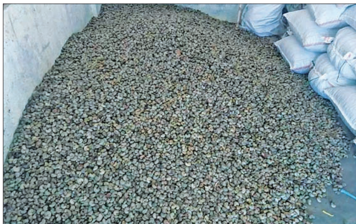
A pile of cashews is seen at a brokerage in Thataung

There are between 500 and 1,000 acres of cashew plantations in villages along the western hills of Thabaung Township.— Myitmakha News Agency