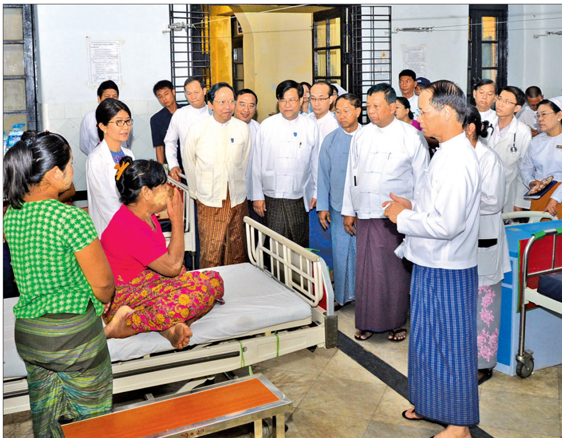
Vice President Dr Sai Mauk Kham visits Yangon General Hospital.

Moreover, the construction of a 10-storey staff building is 20 per cent complete and is slated to be 50 per cent complete by the end of this fiscal year.— Myanmar News Agency