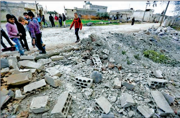
Residents inspect damaged ground after a shell fell in the rebel held town of Jarjanaz, southern Idlib countryside, Syria on 5 March.