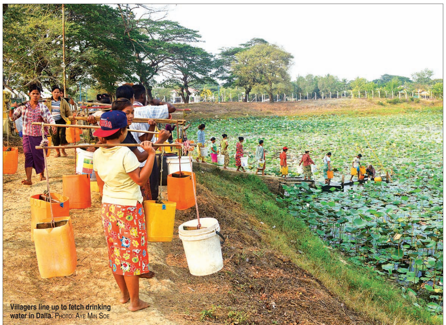
Villagers line up to fetch drinking water in Daffa.

MPs also called on officials to gear up for El Niño's impact,