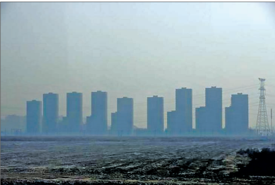
Buidlings are seen on a polluted day in Tianjin, China, on 2 March.

perts said any fall in emissions in 2015 would be mainly due to a slowdown in China’s economy, and it was unlikely that emissions had peaked so early. “I would like to believe that the peak will be around 2030, and if stricter policies for carbon reduction and some reforms in the way local leaders are evaluated on GDP growth, the peak will come in 2025,” said Xi Fengming, a carbon researcher with the China Academy of Sciences. “But I do not think China has reached peak emissions in 2014,” he said. The government said on Saturday that it would cap total energy consumption at 5 billion tonnes of standard coal by 2020, amounting to an increase of 16.3 per cent from 2015. It also said that it would cut carbon intensity