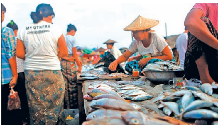
Vendors sell fish in Pauktaw in Rakhine State.

the leadership role of the Union government in the fight against the effects of El Niño in cooperation with regional governments, non-governmental organisations and the people.—GNLM