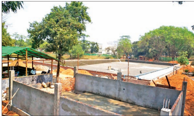
Swimming pool is 85 per cent complete.

AUTHORITIES in Kayin State are building a high-standard swimming pool in Hpa-an, expecting to produce talented swimmers for the state.