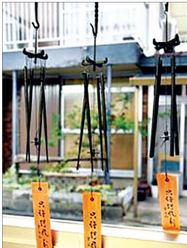
Shows hibashi furin wind chimes, made of four iron chopsticks, in Himeji, Hyogo Prefecture.