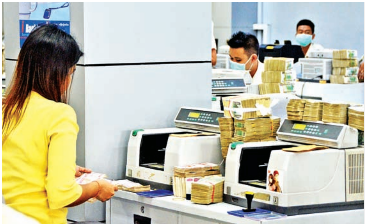
A member of staff of a local bank seen counting cash.

This is the second time Myanmar has allowed foreign banks to open 100-per cent-owned branches inside the country in more than five decades following permits to nine foreign banks in October last year to operate in the country.—GNLM