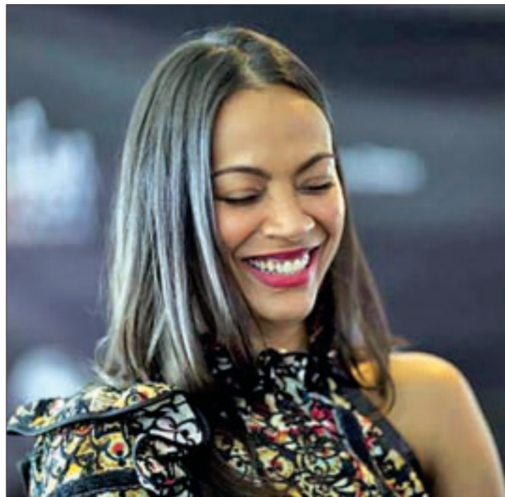
Cast member Zoe Saldana laughs at the premiere of 'Infinitely Polar Bear' part of the Los Angeles Film Festival at Regal Cinemas in Los Angeles, California in 2015.

LOS ANGELES — The studio behind a film about African-American soul and jazz musician Nina Simone on Thursday defended the casting of Zoe Saldana in the lead role after the actress came under fire for not being black enough.