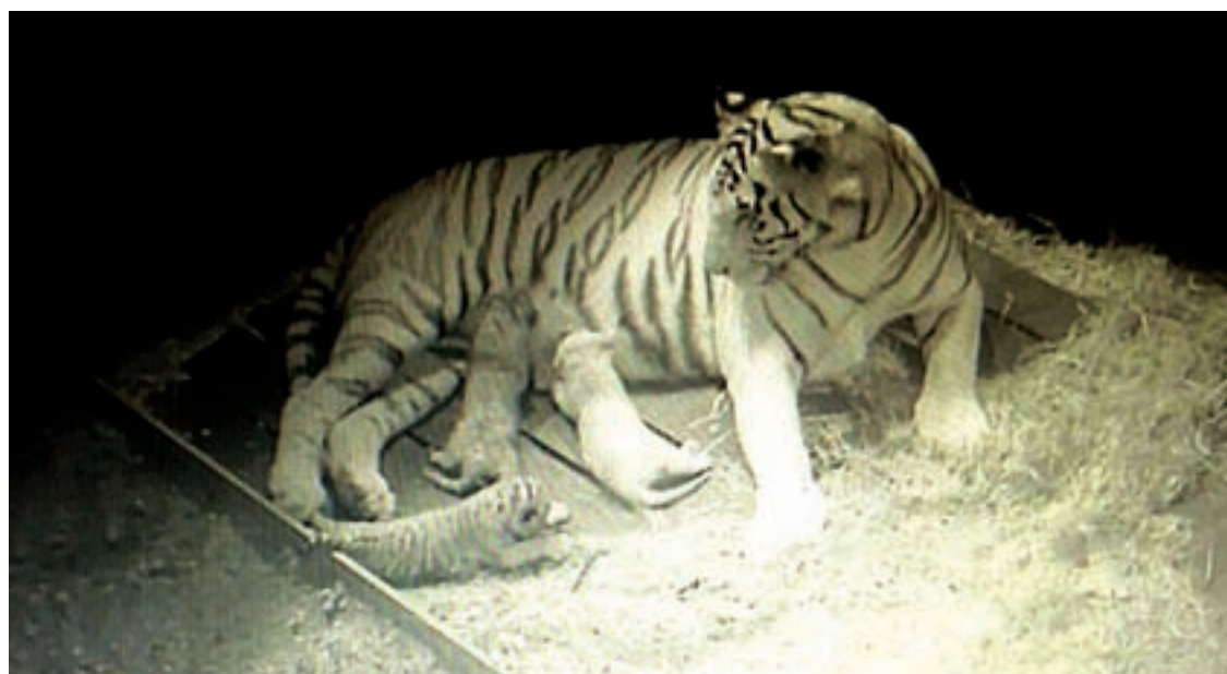
Rosy breastfeeds her cubs at Nay Pyi Taw Zoological Garden.

The Tatmadaw has announced that it will continue to launch offensive attacks against AA forces until the area is cleared of all insurgents. The AA was formed by 20 original members at the former headquarters of the Kachin Independence Army (KIA) in April 2009, when the KIA formed the Federal Union Army (FUA) and sent member ethnic armed groups to conduct operations in their places of origin. In April 2015, further clashes erupted between the AA and the Tatmadaw when the former attempted to seize Tatmadaw-controlled territory. — GNLM