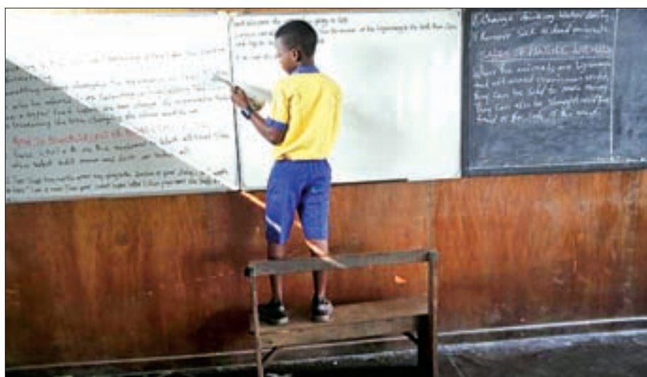
A student stands on a bench to write on the board at a floating school in the Makoko fishing community on the Lagos Lagoon, Nigeria, on 29 February.

Fast Retailing Co, the operator of Japan's largest casual wear chain Uniqlo, will initially post about 10 workers in the British capital, mainly shifting designers including four or five British nationals from its R&D centre in Tokyo, a company official said on Friday.—Kyodo News