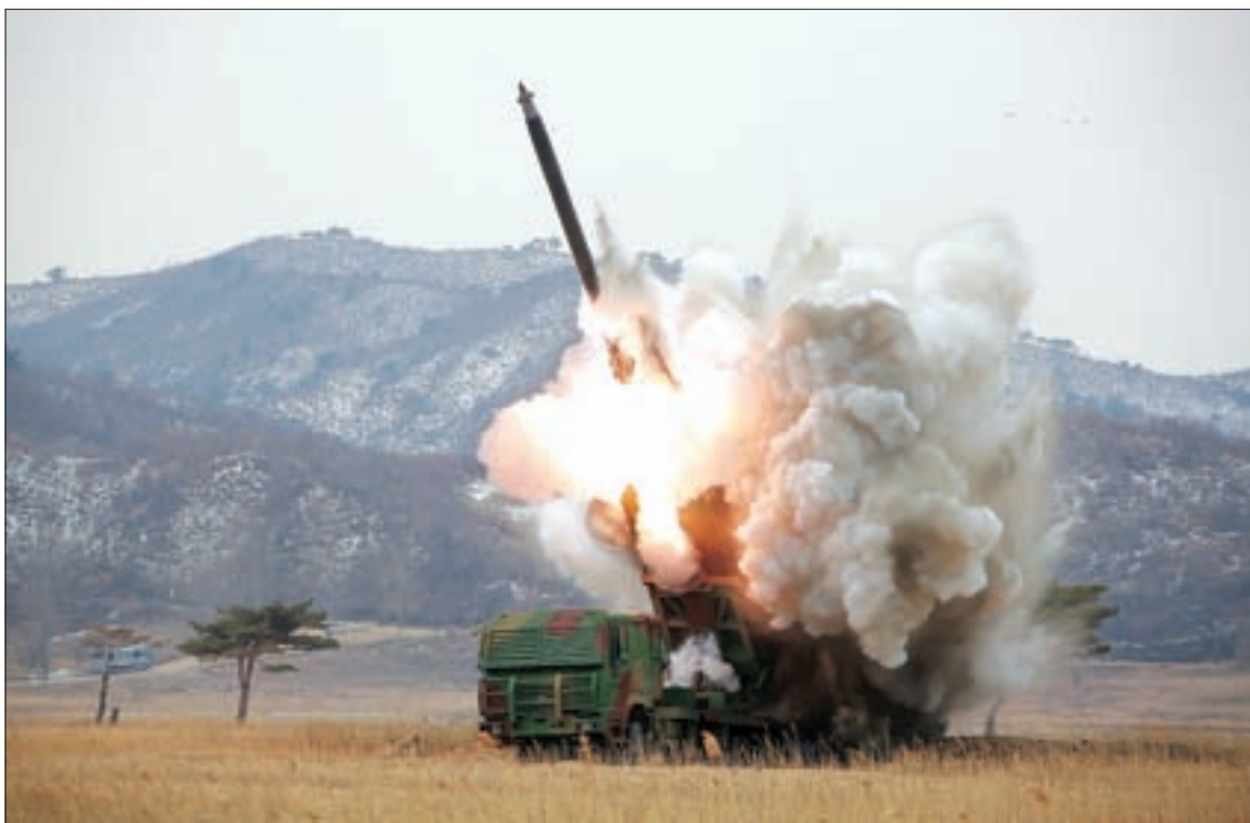
A new multiple launch rocket system is test fired in this undated photo released by North Korea’s Korean Central News Agency (KCNA) in Pyongyang on 4 March 2016.

Asked about the lack of a North Korean response to the sanctions, White House spokesman Josh Earnest told a briefing: “Our expectation is that that will not yield a change overnight, but over time we have seen that increasing isolation does prompt some countries to re-evaluate their strategy.”— Reuters