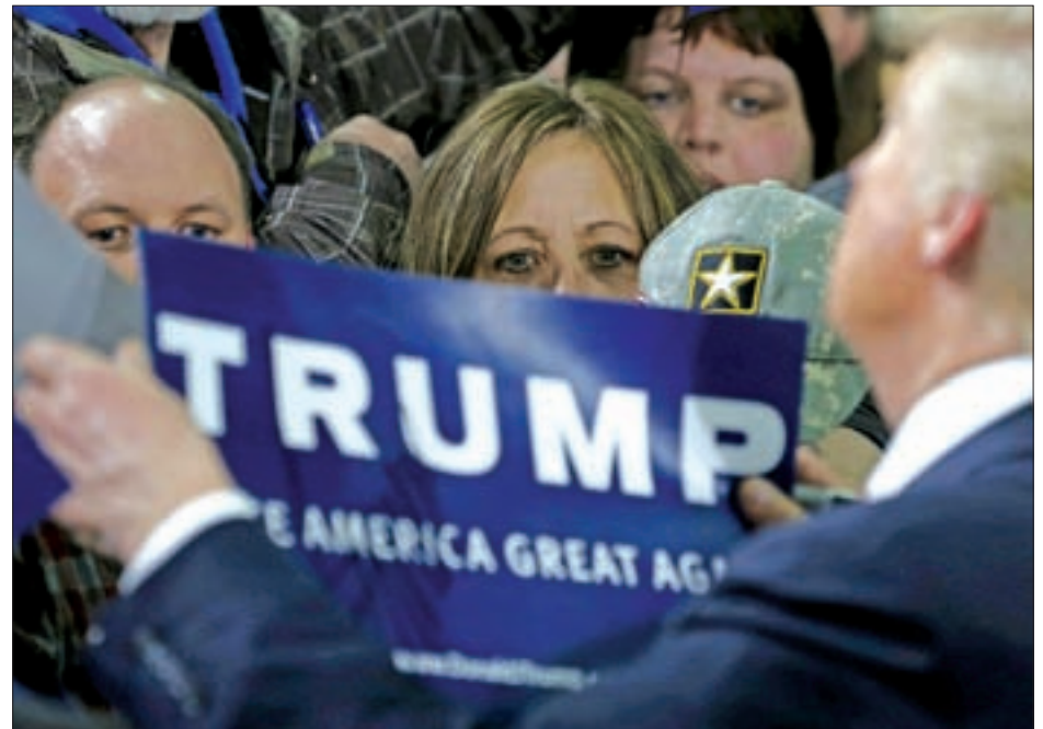
Supporters wait to get an autograph from US Republican presidential candidate Donald Trump at a campaign rally in Cadillac, Michigan, on 4 March.

The real estate magnate, who is drawing sup-