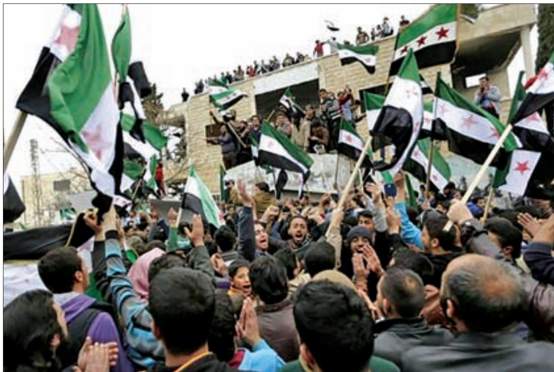
Protesters carry Free Syrian Army flags and chant slogans during an anti-government protest in the town of Marat Numan in Idlib Province, Syria, on 4 March.

But Hijab said government forces had attacked more than 50 opposition-held areas where