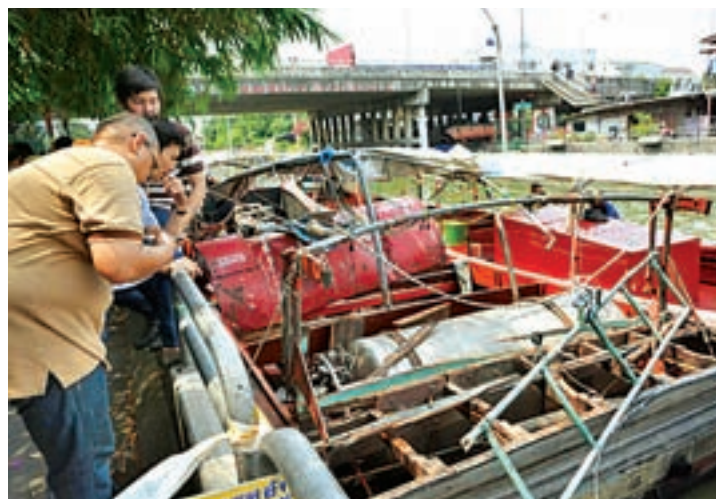
A passenger boat whose engine exploded while navigating a canal earlier on 5 March, 2016. The incident, believed not to be terrorist-related, injured at least 50 people, several seriously.

BANGKOK — At least 50 people were injured, several seriously, when the engine of a passenger boat they were riding exploded while navigating a canal in Bangkok yesterday, Thai police said.