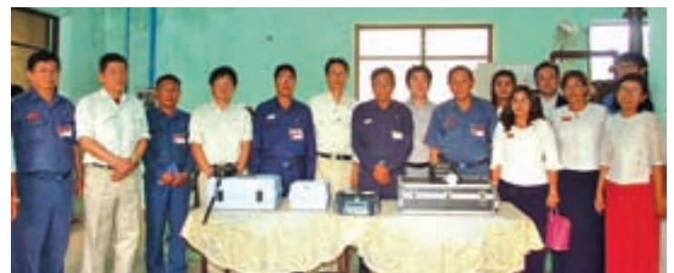
Officials of MCDC receives chlorinator and water analysis kits.

THE Water and Sewer Bureau of Japan donated a chlorinator and water analysis kits to the Mandalay City Development Committee in Mandalay Region on Friday.