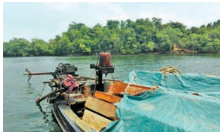
Seized illegal logs seen on the Maliwarn creek.

AUTHORITIES have seized in Maliwarn creek a shipment of illegal logs weighing 4.3 tonnes, according to the police.