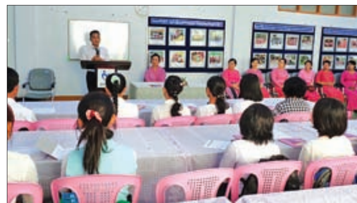
Students ready to learn English proficiency skills in Nay Pyi Taw.

MYANMAR Women and Child Development Federation (MWCDF) has opened English language proficiency course for pre-intermediate level in Nay Pyi Taw yesterday.