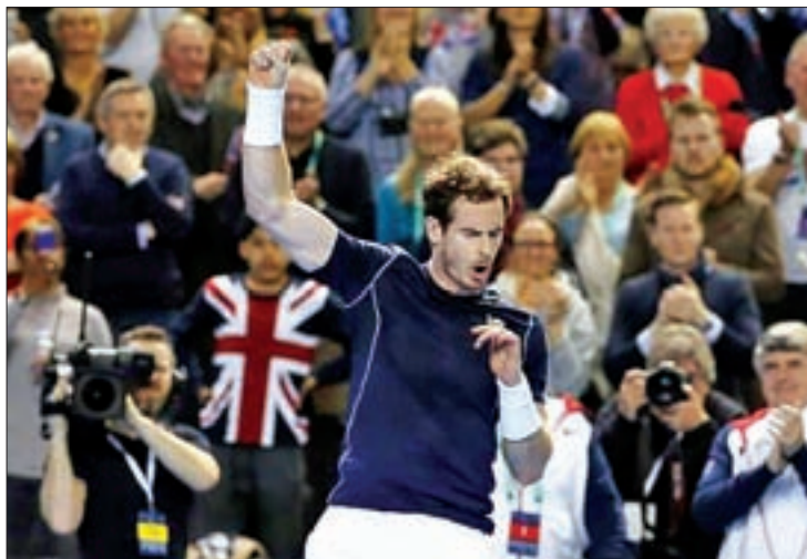
Great Britain's Andy Murray celebrates victory against Japan's Taro Daniel during Davis Cup World Group First Round at Barclaycard Arena, Birmingham, on 4 March.

Daniel, ranked 87 th in the world, briefly knocked Murray