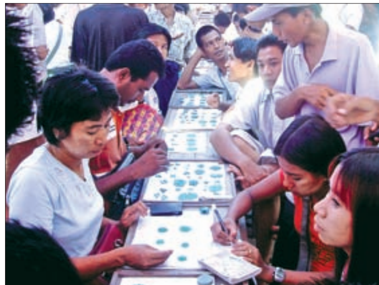
Gem merchants are seen observing the precious stones.

Jade traders have made it known that the majority of jade enterprises within the Myanmar jade market are owned by the Chinese, accounting for 70%, with Myanmar owned enterprises making up just 30% of the market.—Myitmakha News Agency