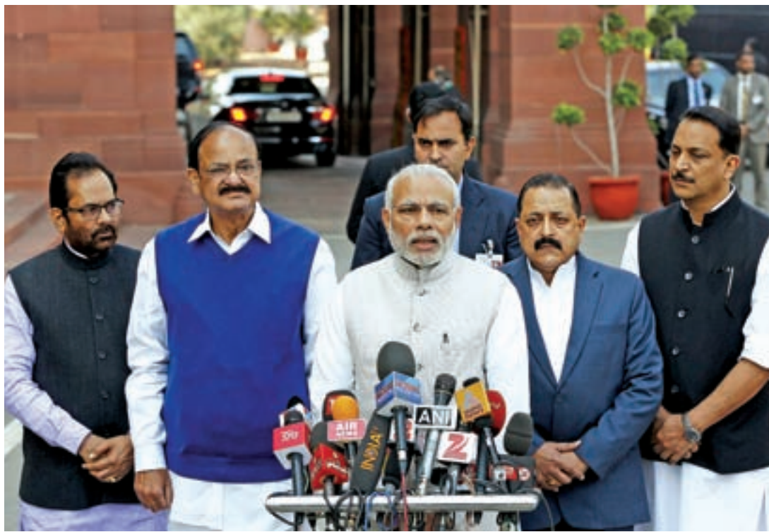
India's Prime Minister Narendra Modi speaks with the media inside the parliament premises upon his arrival on the first day of the budget session in New Delhi, India, on 23 February.

The BJP's best prospects are in Assam where it is fighting on an anti-immigration plank