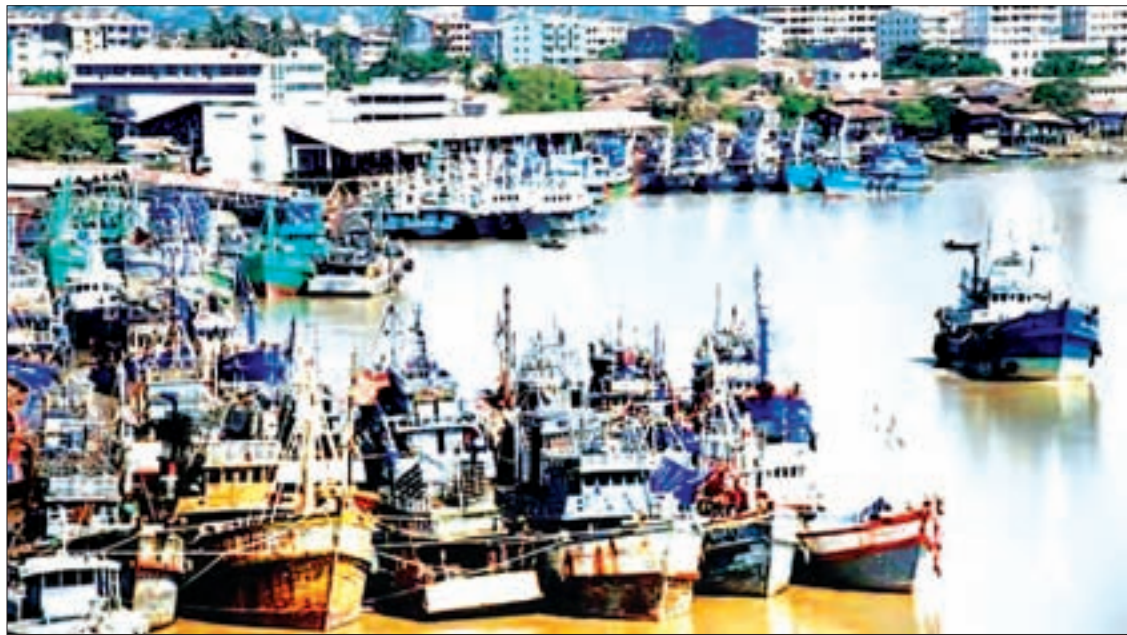
Fishing boats seen at the Pazuntaung jetty.

MYANMAR'S fisheries resources in its territorial waters have declined compared with previous decades, according to the latest survey performed by the Ministry of Livestock, Fisheries and Rural Development with the assistance of Norwegian government.