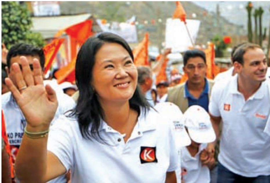
Peruvian presidential candidate Keiko Fujimori of the Fuerza Popular (Popular Force) party greets supporters during a campaign rally in San Juan de Lurigancho, on the outskirts of Lima, on 20 February 2016.

A centre-rightist, she plans to use a nearly $8 billion government "rainy-