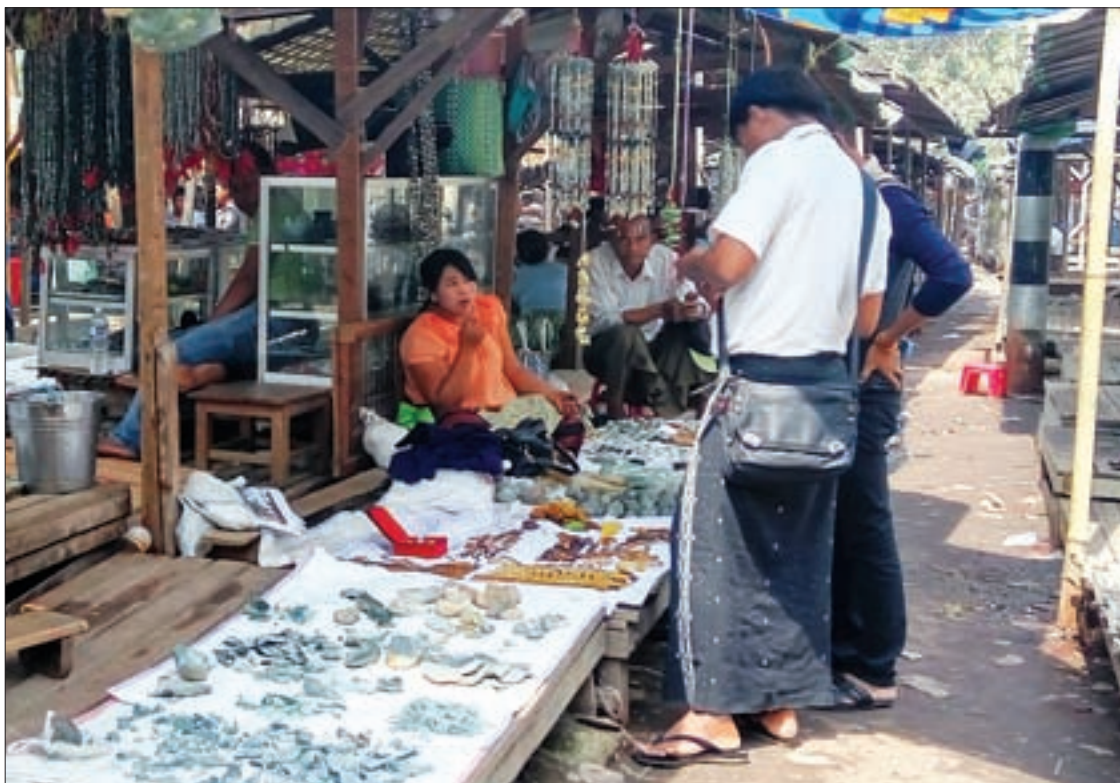
Low-cost souvenirs made of jades sell well in the gift shops.