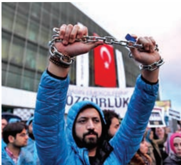
An employee of Zaman newspaper holds a chain during a protest at the courtyard of the newspaper in Istanbul, Turkey on 4 March 2016.