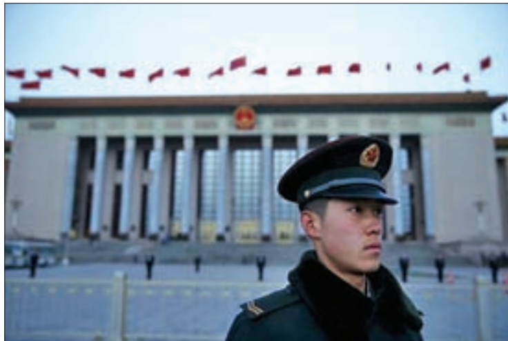
A soldier of the People’s Liberation Army (PLA) stands guard in front of the Great Hall of the People ahead of the opening session of the National People’s Congress (NPC) in Beijing, China, on 5 March 2016.

Premier Li Keqiang told the opening of China’s largely rubber-stamp parliament that the country will “strengthen in a coordinated way military preparedness on all fronts and for all scenarios”.