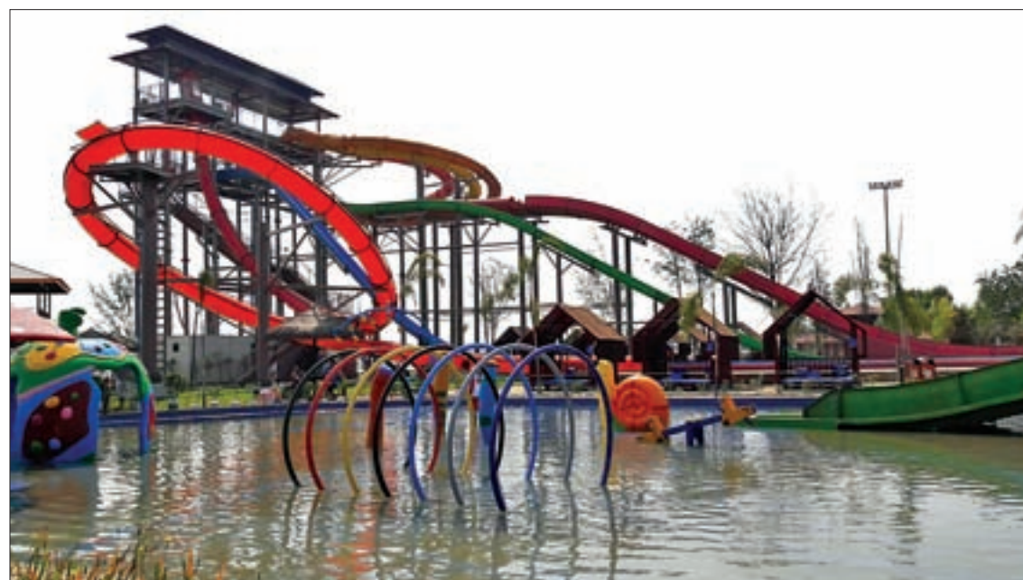
Yangon Waterboom Park in Thakayta.

A barrage of complaints appeared on social media website Facebook almost as soon as the park had opened, criticising a lack of water on the water flumes; dirty, stagnant water, along with poor customer service. Yangon Waterboom officially opened to the public on March 2 before closing its doors the following day. — Myitmakha News Agency