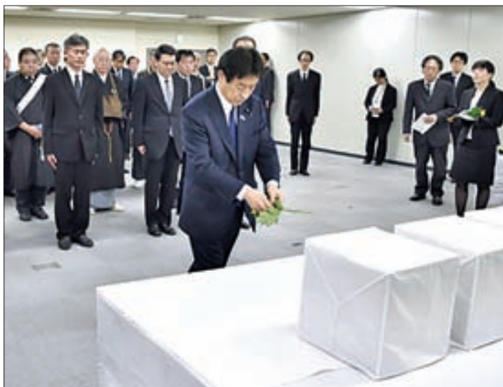
Japan's Health, Labor and Welfare Minister Yasuhisa Shiozaki (C) offers a flower to the remains of 10 Japanese soldiers who died during World War II in what is now Myanmar, in a ceremony at the ministry in Tokyo on 4 March 2016.

According to the ministry, the remains of about 45,000 soldiers are left in Myanmar. The remains returned to Japan on Friday were found by local people in Chin state in northwestern Myanmar