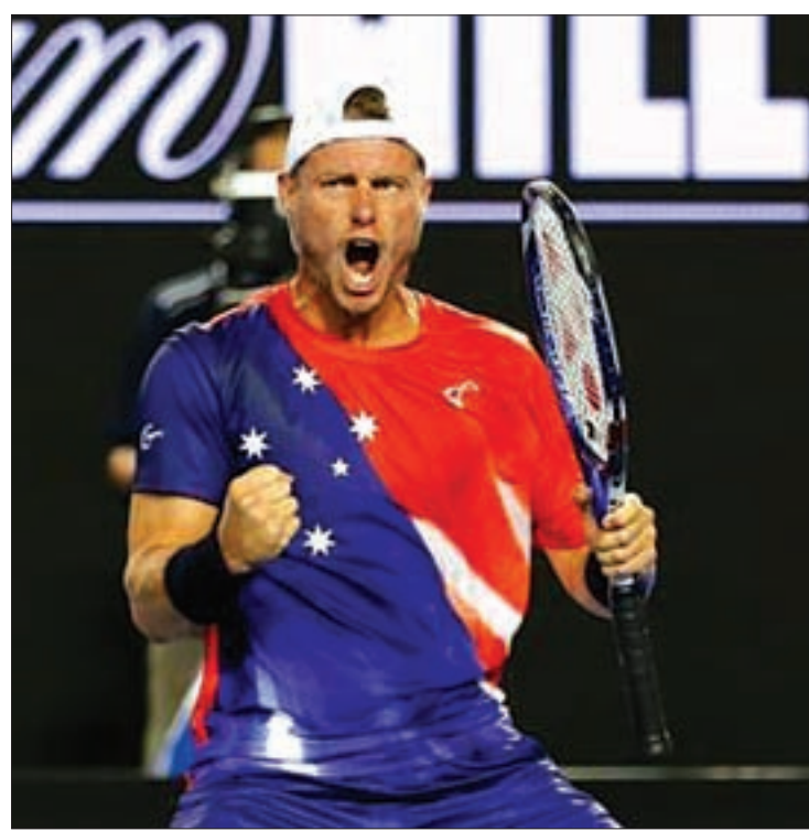
Australia's Lleyton Hewitt.

But Australia can still change their nomination, meaning 35-year-old Hewitt could return to the court against Sock, who lost his first singles tie in four sets to Tomic.—Reuters