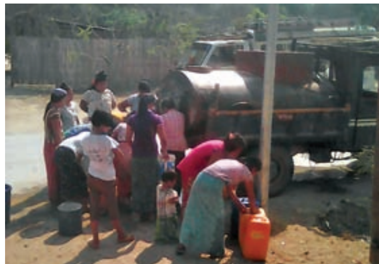
Villagers collecting the drinking water supplied by the Township Rural Development Department.

Not to face with the water shortage, the Township Rural Development Department has made arrangements to supply and distribute the drinking water to the residents of the village and fill the water into water storage tanks.—Tin Maung (Mann Sub-printing)