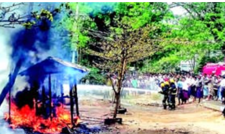
Firefighters putting out the fire.

Another fire broke out in Bogyoke village, Thanlyin township on the same day. The fire was put out by firemen with two fire engines.—Than Win (Thanlyin)