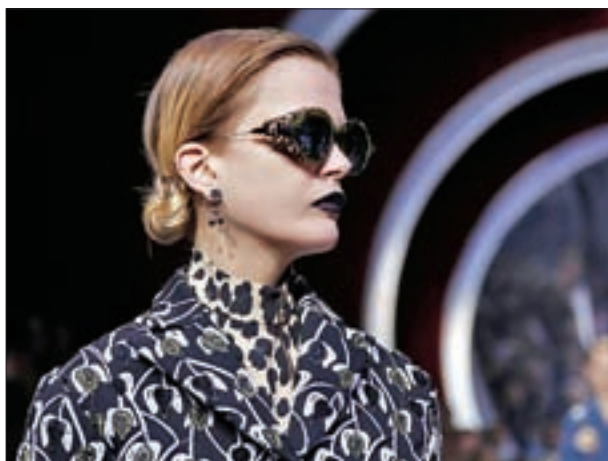
A model presents a creation by Swiss designers Serge Ruffieux and Lucie Meier as part of their Fall/Winter 2016/2017 women's ready-to-wear collection show for fashion house Dior in Paris, France, on 4 March.

Dior also offered plenty of romantic off-the-shoulder looks on short