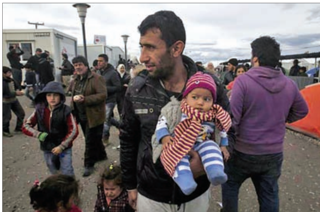
A migrant holding a child stands in a makeshift camp at the Greek-Macedonian border, near the Greek village of Idomeni, on 4 March.

BERLIN — Germany and Italy's interior ministers have written to the European Commission calling for an EU-wide system to register migrants and a harmonisation of selection procedures and rights for asylum seekers, a German newspaper reported.