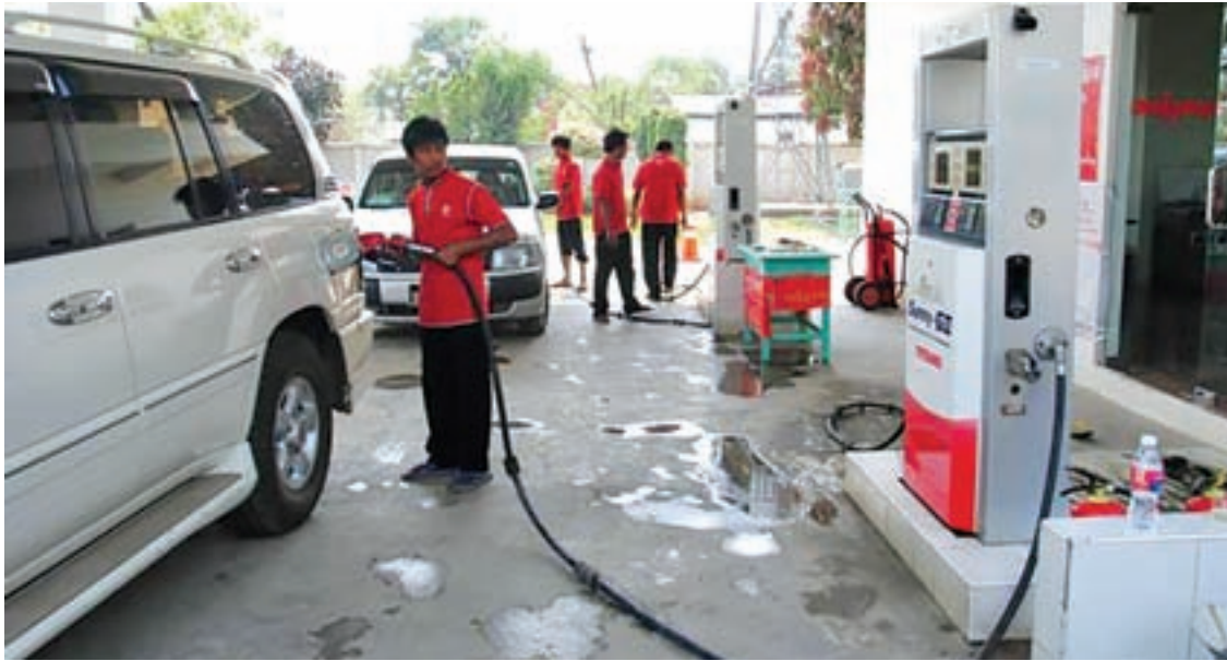
Workers filling fuel into cars.

THE Myanma Petroleum Products Enterprise under the Ministry of Energy is planning to map the locations of illegal fuel shops in Mandalay Region and submit the chart to the headquarters and the regional government.