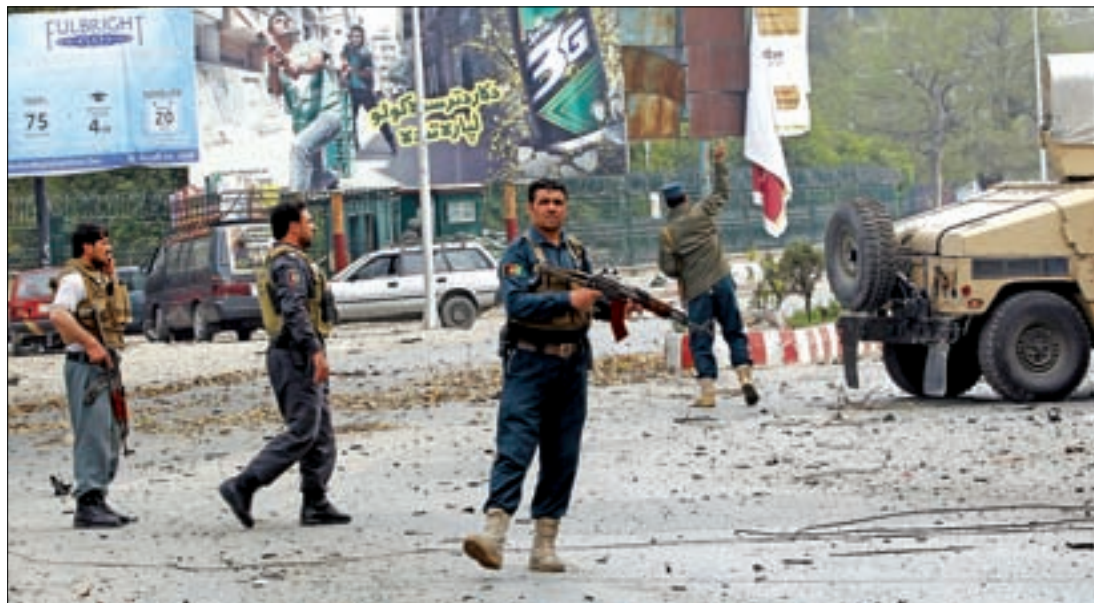
Afghan policemen take position during gunfire near the Indian consulate in Jalalabad, Afghanistan on 2 March 2016.

In January, India’s consulate in the northern Afghan city of Mazar-i-Sharif was also attacked by insurgents.—Reuters