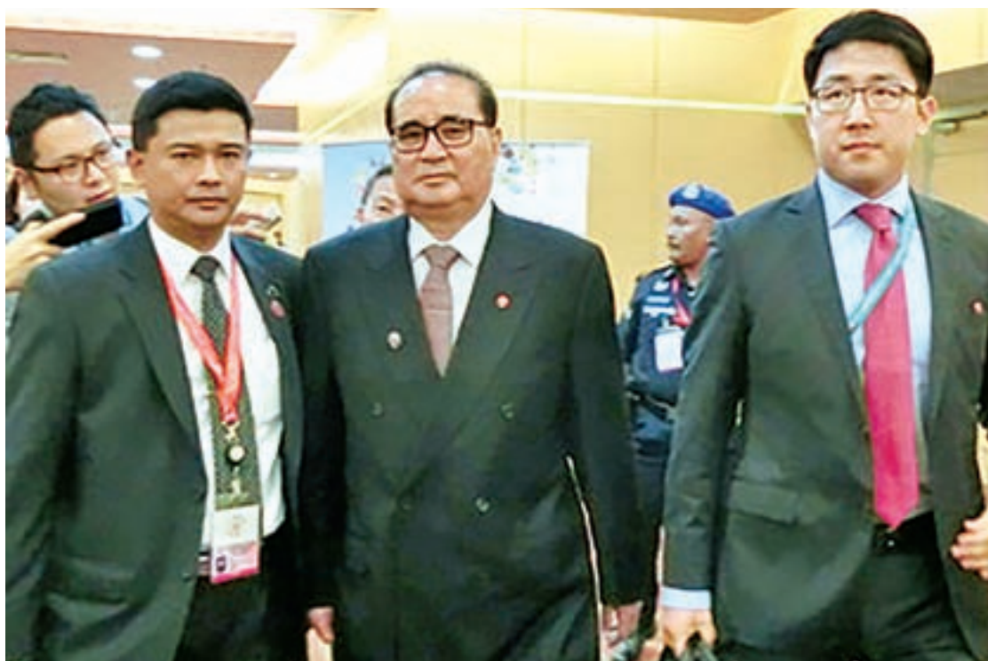
North Korean Foreign Minister Ri Su Yong (C) attending a regional security forum of ASEAN ministers in Kuala Lumpur. Ri blasted the UN Human Rights Council at its regular session on 1 March 2016 for increasingly politicizing North Korea's rights record, threatening to boycott sessions and defy resolutions.

"There are no extra large-scale crimes against humanity and heinous human rights