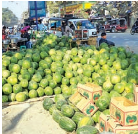
Watermelons . PHOTO: MAUNG PYI THU (MDY)

WATERMELON growers on alluvial lands on the Ayeyawady river, TadaOo Township, Meikhtila plains, and Tatkon Township in Mandalay Region have halted the export of watermelons to China because of the Chinese RMB (Renminbi) falling in value.