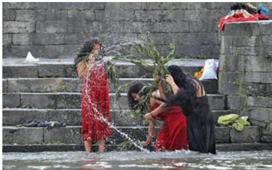
Women lash themselves with the leaves of the Aghada plant along the banks of the Bagmati River, during the Rishi Panchami festival, in Kathmandu on 2 September 2011.

While there is a trend toward abolition of criminal defamation laws in the United States and Mexico, there are no such trends in Central America, the Caribbean or South America, it said.— Reuters