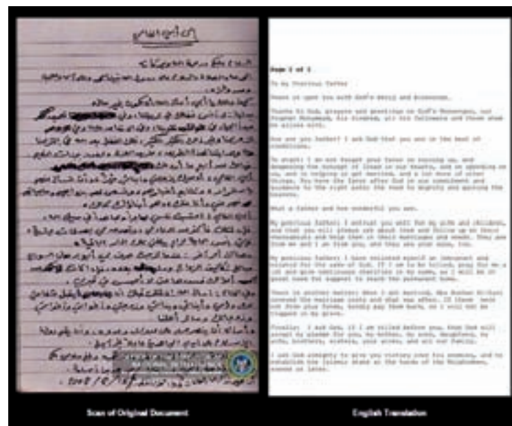
A scan of a document written by Osama bin Laden (L) and translated into English (R) is shown in this image from the office of the director of national intelligence.

“This is a struggle between two of the largest cultures on Earth, and it is in the shadow of catastrophic climate conditions.”—Reuters