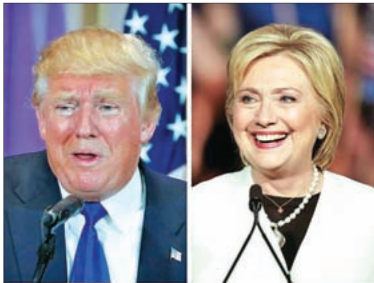
A combination photo shows Republican US presidential candidate Donald Trump (L) in Palm Beach, Florida and Democratic US presidential candidate Hillary Clinton (R) in Miami, Florida at their respective Super Tuesday primaries campaign events on 1 March 2016.