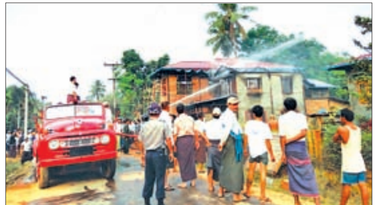
Firefighters putting out the fire.