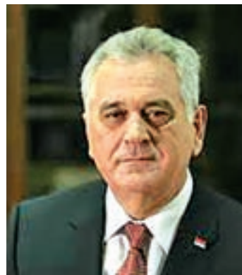
Serbian President Tomislav Nikolic.