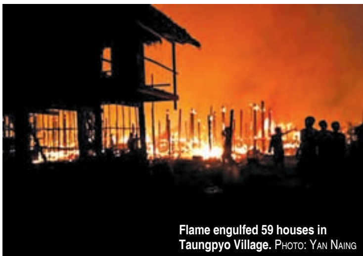
Flame engulfed 59 houses in Taungpyo Village.

The village's only access to water is 35 miles away in Kyunsu Township. — Yan Naing (Kyunsu IPRD)