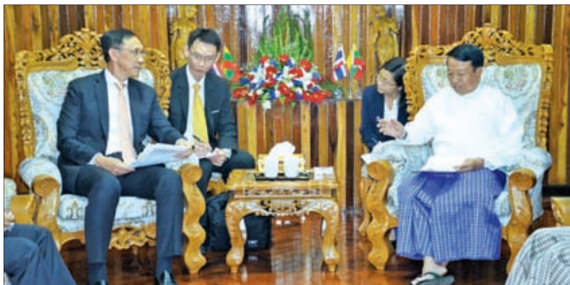
Union Minister U Khin Maung Soe holds talks with Thailand's Energy Minister General Anantaporn Kanjanarat at the Yangon Electricity Supply Corporation in Yangon.