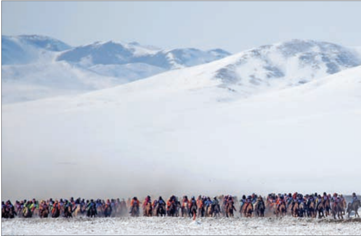
Riders attend a spring horse racing event in Tsagaan Khutul in Mongolia, on 28 February 2016.