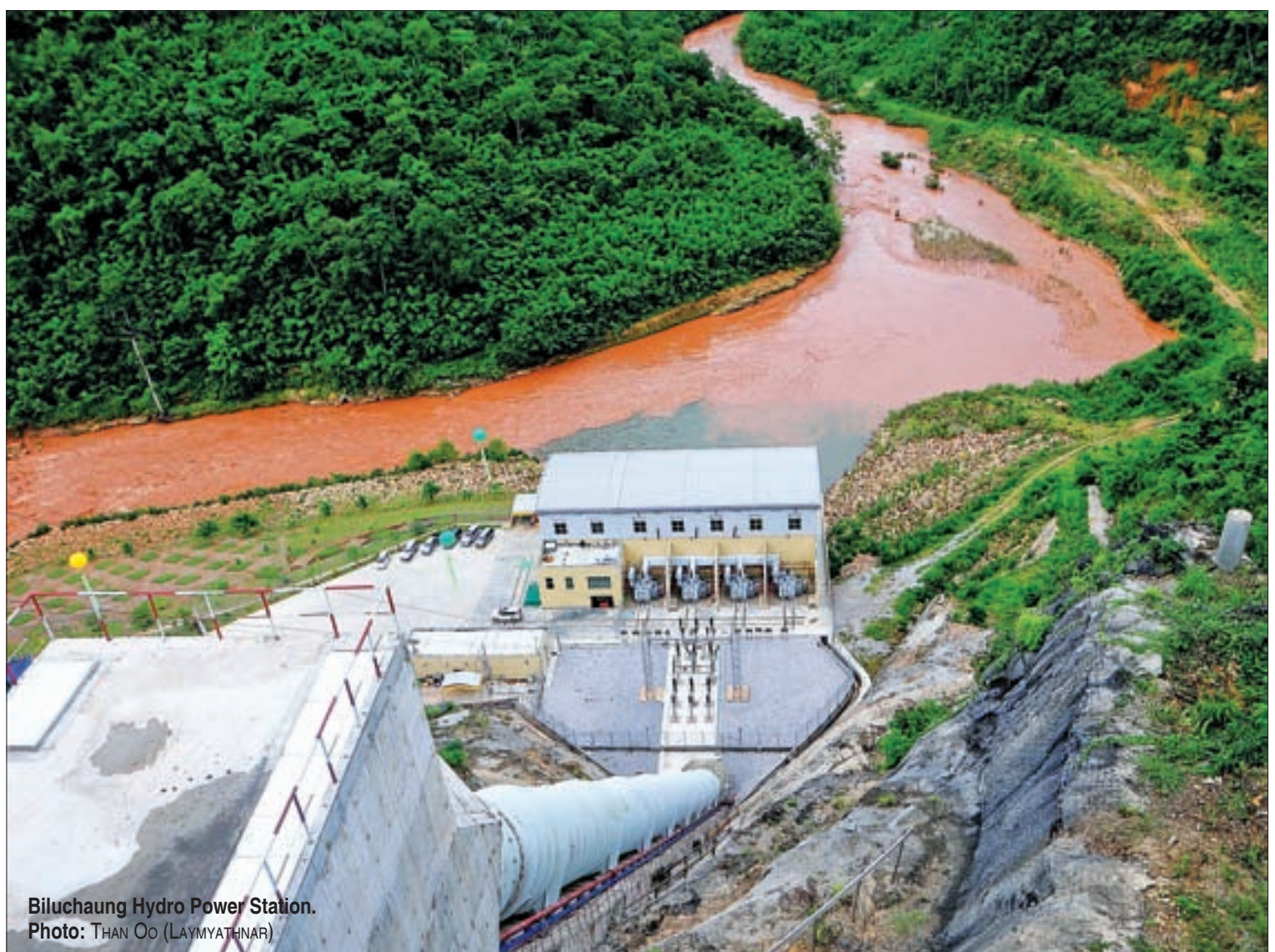
Biluchaung Hydro Power Station.