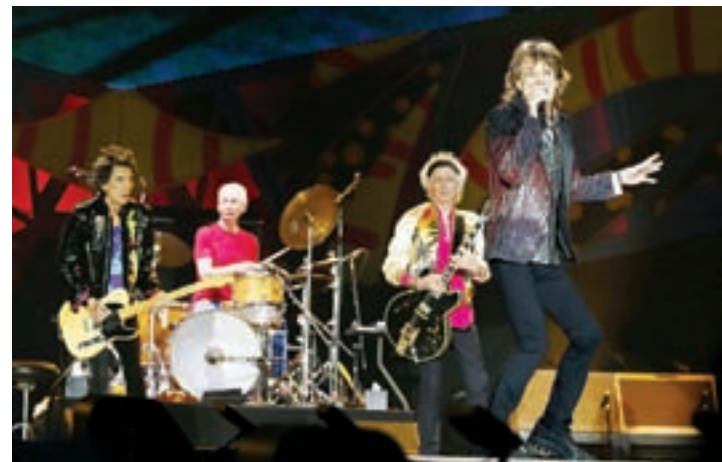
British veteran rockers The Rolling Stones singer Mick Jagger sings next to band member Keith Richards, Ronnie Wood and Charlie Watts during a concert on their "Latin America Ole Tour" in Santiago, Chile on 3 February 2016.

"Los Rolling in Cuba? Wow!" he said. "We have been waiting for them here for many years."—Reuters