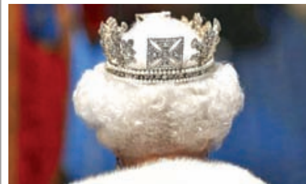
Britain's Queen Elizabeth arrives for the State Opening of Parliament, at the Palace of Westminster in London.