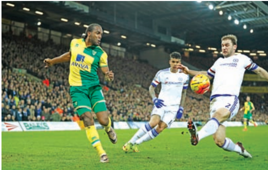
Norwich City's Cameron Jerome in action with Chelsea's Branislav Ivanovic and Kenedy during Barclays Premier League at Carrow Road on 1 March 2016.

"I want to create a lot of chances and sooner or later we score. Tonight wasn't the right moment but we are alive and we fight to the end. Everybody is ready to fight, to play well, to create chances. Only the victory was missing."