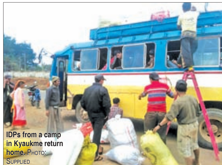
IDPs from a camp in Kyaukme return home. PHOTO: SUPPLIED

Conflict between the Tatmadaw and ethnic armed groups has been flaring up near Hopone Village since 2014. — Myitmakha News Agency