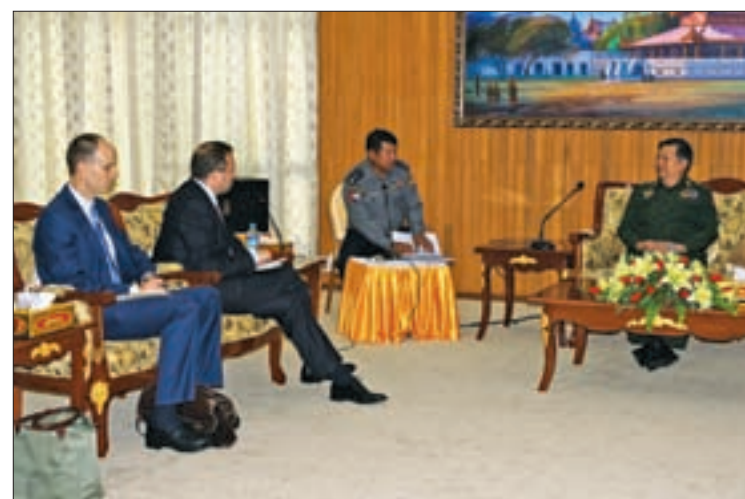
Home Affairs Minister Lt-Gen Ko Ko holds talks with Mr Derek Mitchell, outgoing Ambassador of the United States.

They discussed ways to enhance greater cooperation in the future as part of improving bilateral relations.— Myanmar News Agency