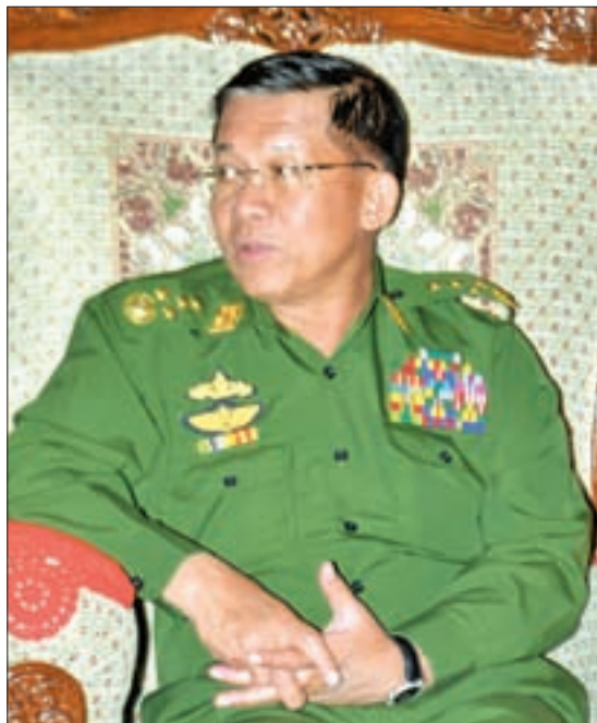
Commander-in-Chief Senior General Min Aung Hlaing.