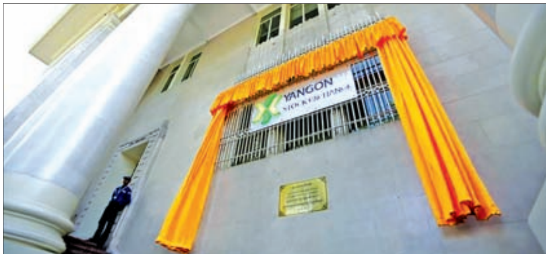
A security stands at the Yangon Stock Exchange center during the opening ceremony of the Yangon Stock Exchange center in Yangon, Myanmar, on 9 December 2015. Myanmar's first-ever stock exchange began operation in Yangon on Wednesday with six local listed companies and Myanmar investors initially selected to act as players in the stock exchange market.

YANGON — Securities trading on Yangon Stock Exchange (YSX) may start in the 3 rd week of this month, said Maung Maung Thein, President of Myanmar's Securities and Exchange Commission (SECM) yesterday.