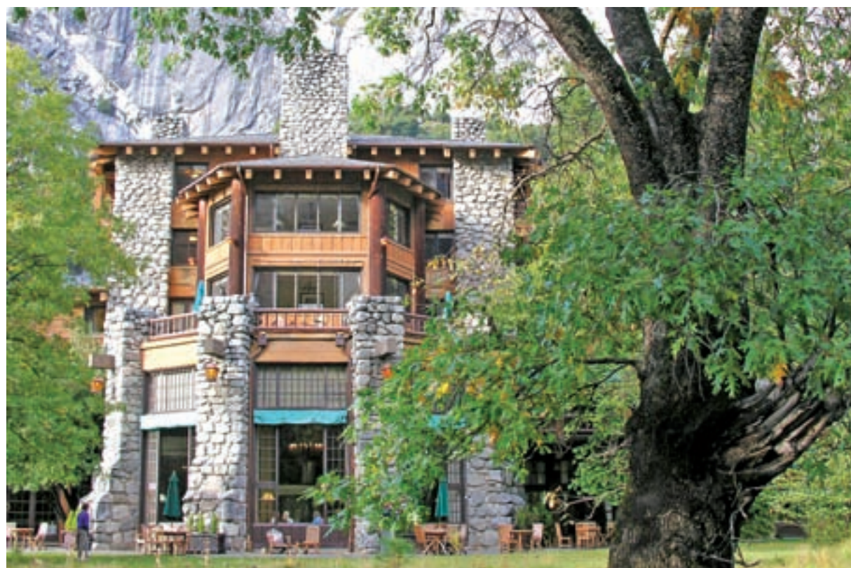
The Ahwahnee Hotel in Yosemite National Park, California is shown on 5 October 2006 handout photo released to Reuters on 4 February 2016. On 1 March 2016, more than 125 years after Scottish-American naturalist John Muir's advocacy helped inspire the creation of Yosemite National Park, some of its most hallowed sites are set to be stripped of their famous names as part of a bitter, $50 million legal squabble.

The gene variant predisposing people to early hair graying was essentially only seen in those of European ancestry. "This might, to some extent, explain why hair graying is more common in Europeans than in other populations," Ruiz-Linares said.—Reuters