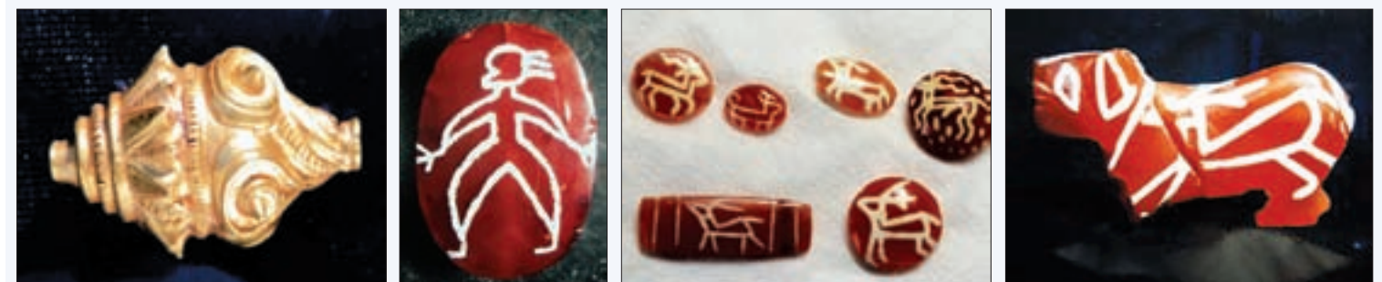
The ornaments and utensils made of stone, bronze, iron, gold and earth excavated from the ancient cities show that the Pyu people were possessed with high professional artistic skills that are now extinct.

in each of the archaeological sites since excavation activities began in February this year. These finds include palace walls and entrances in Hanlin and Sri Ksetra, while religious edifices of Pyu cultur-