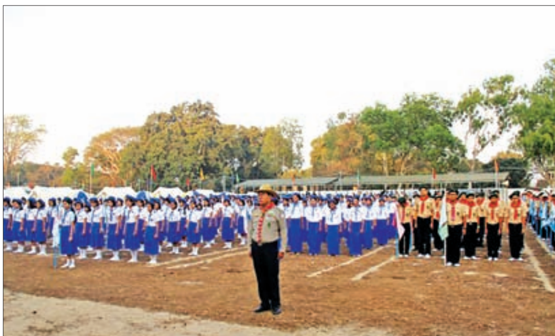
Scouts gather in Mt. Popa.

During their stay at the 4th scout camp at Mt-Popa, 48 teachers, 438 boy and girl scouts from basic education schools and 62 young scouts from colleges and universities will be given lectures and scouting activities. — Myanmar News Agency