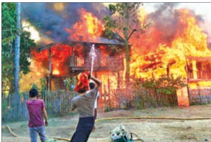
Flames of raging fire engulf the houses.