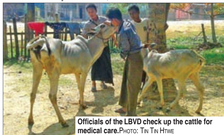
Officials of the LBVD check up the cattle for medical care.

The team also provided additional medical care to the farm animals. This is the third time the department has carried out a free foot-and-mouth vaccination programme in the region.— Tin Tin Htwe