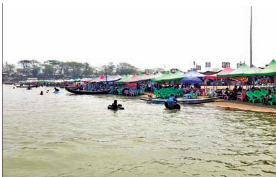
Nyaung Chaungthar beach resort.

A FAMOUS Nyaung Chaungthar beach resort will be formally opened on 28 February on an elaborate scale.