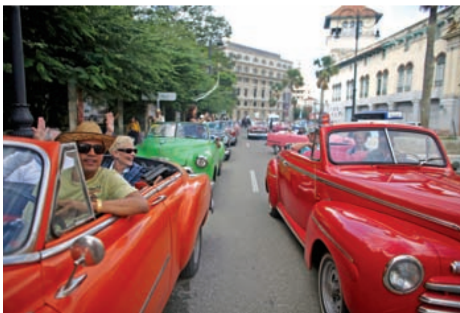
Tourists enjoy a ride in vintage cars in old Havana on 17 January 2016.

Projects remain months or years from completion, meaning the hotel