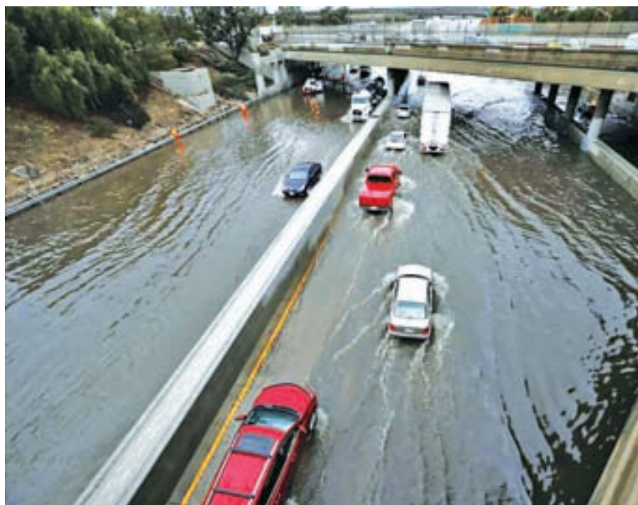
Vehicles drive on a flooded freeway after a storm brought rain to Los Angeles, California, United States, on 6 January 2016.

The researchers compiled a new database of geological sea-level indicators from marshes, coral atolls and archaeological sites in 24 locations around the world, spanning close to 3,000 years. They also used 66 tide-gauge records from the last 300 years.