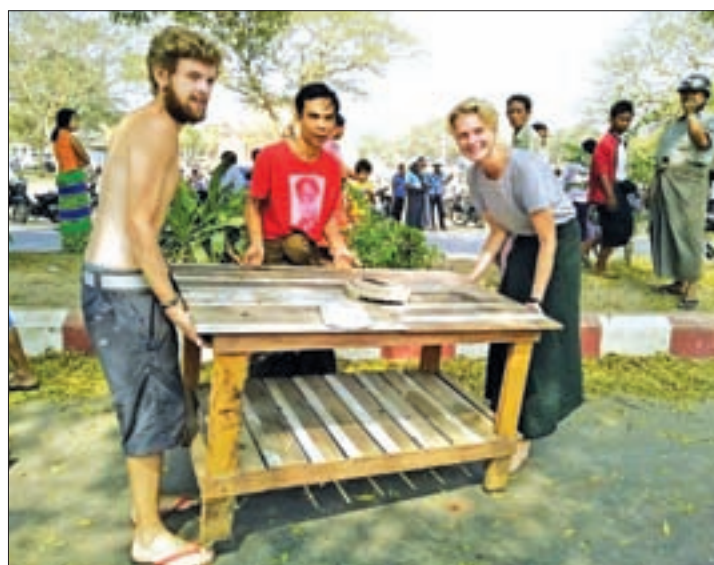
Tourists seen helping carry the belongings of the fire victims.