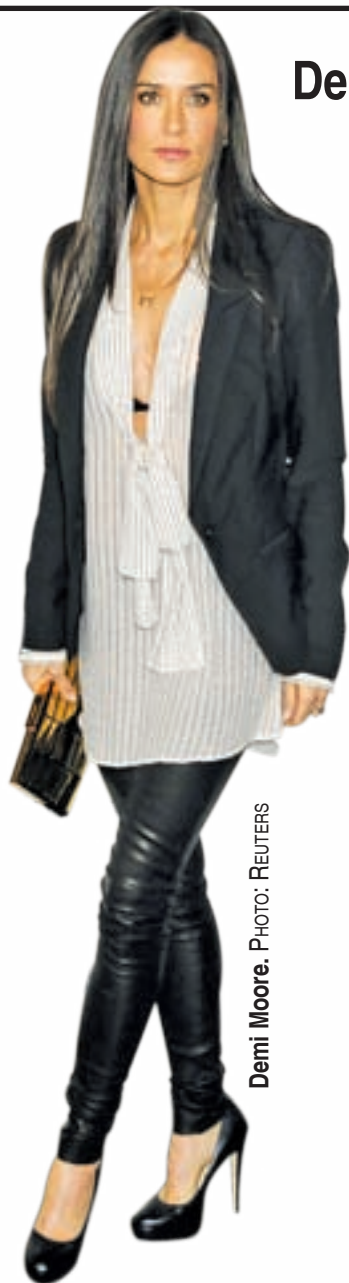
Demi Moore.