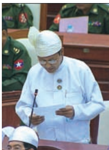
Dr Maung Thin.