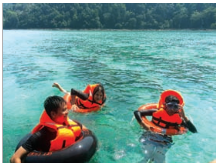
Visitors seen at the beach in Dawei.

THE number of foreign tourists visiting the southern Myanmar coastal region of Dawei has increased this year, when comparing current figures with those of January last year according to the department of hotels and tourism industry development.