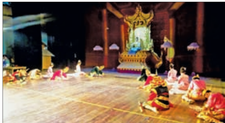
Local performers entertaining audience with a plot of the drama.