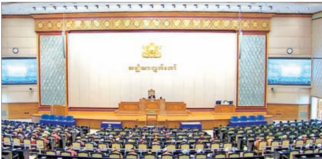
Amyotha Hluttaw is convened in Nay Pyi Taw.