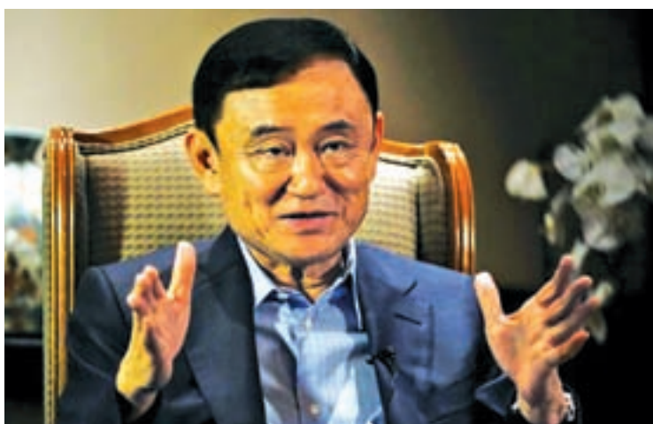
Former Thai Prime Minister Thaksin Shinawatra speaks to Reuters during an interview in Singapore, on 23 February 2016.

Thaksin cannot take his old support base for granted, say analysts and allies, and might find himself struggling for relevance in a country which has undergone a profound political awakening in