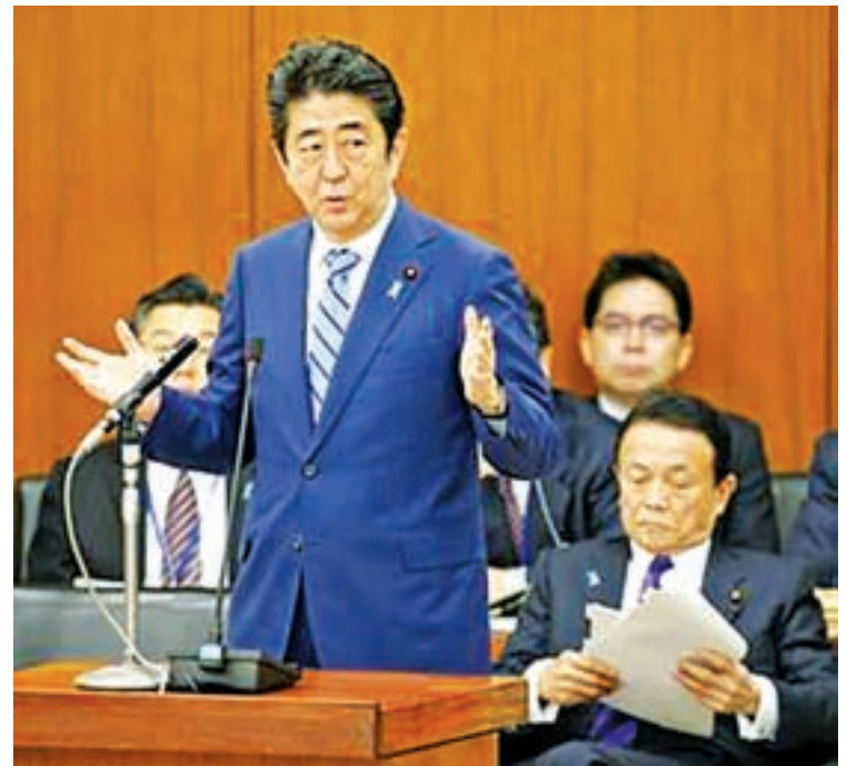
Japanese Prime Minister Shinzo Abe speaks during a parliamentary session in Tokyo on 24 February 2016. Top government spokesman Yoshihide Suga said the same day that Abe will proceed with plans to visit Russia, declining US President Barack Obama's request for him not to make the trip.

ed States and other members of the international community have imposed economic sanctions on Russia, while Moscow's membership of the Group of Eight has been suspended. Despite Obama's request, Abe intends to visit Sochi, Russia in early May for talks with Putin, seeking to find a breakthrough in the long-standing bilateral dispute over Russian-held, Japanese-claimed islands off Hokkaido that has prevented the two countries from signing a peace treaty after World War II. The islands — Etorofu, Kunashiri, Shikotan and the Habomai group of islets — were seized by the Soviet Union following Japan's surrender on 15 August, 1945.— Kyodo News