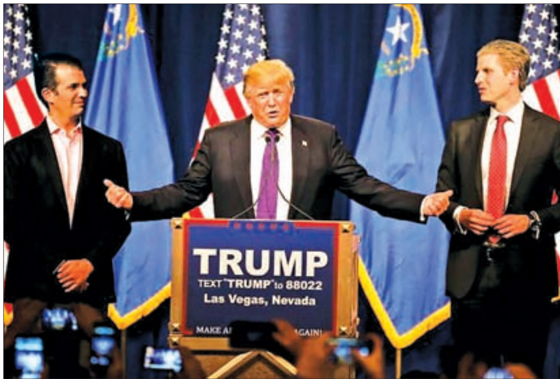
Republican US presidential candidate Donald Trump gestures to his sons Donald Trump Jr. (L) and Eric Trump (R) as he addresses supporters after being declared by the television networks as the winner of the Nevada Republican caucuses at his caucus night rally in Las Vegas, Nevada, on 23 February 2016.