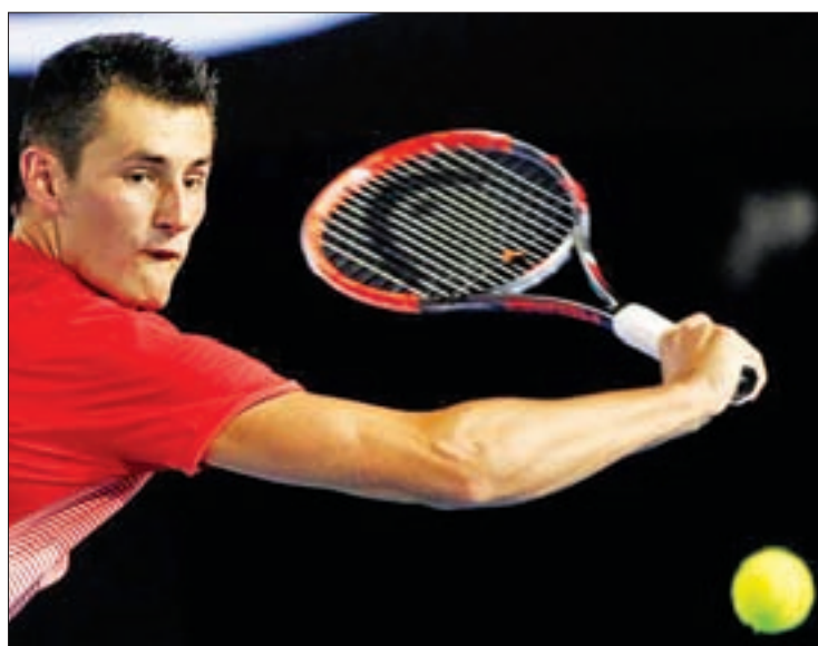
Australia's Bernard Tomic hits a shot during his third round match against compatriot John Millman at the Australian Open tennis tournament at Melbourne Park, Australia, on 24 January 2016.

Peers, ranked ninth in the world in doubles, will team up with big-serving Sam Groth in the doubles rubber, team captain Lleyton Hewitt said in Melbourne on Tuesday. Peers reached two grand slam finals last year with Andy Murray's older brother Jamie Murray and had earned his spot, twice grand