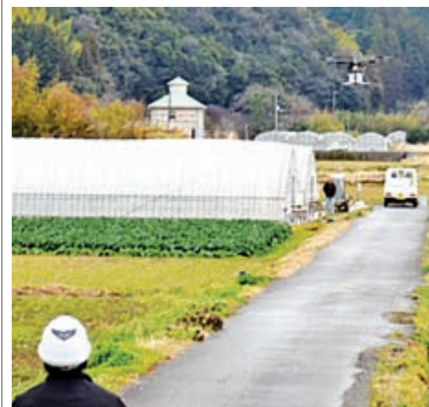
A drone, carrying a cargo, flies over a crop field in Naka, Tokushima Prefecture in western Japan on 24 February 2016, as part of an experiment by the transport ministry. The ministry conducted the experiment in collaboration with a Tokyo firm aiming to launch a business delivering goods via drone to households of senior citizens.

Parcel delivery drones “would address the shortage of delivery truck drivers, reduce time and costs, and be a relief for seniors in thinly populated areas who have become shopping refugees,” said an official of the Ministry of Land, Infrastructure, Transport and Tourism.—Kyodo News