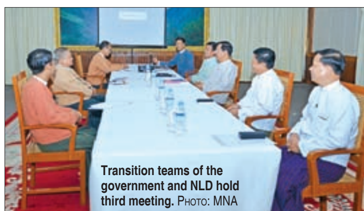
Transition teams of the government and NLD hold third meeting.

THE government's support committee and the National League for Democracy's transition team met for the third time yesterday in Nay Pyi Taw to coordinate the agenda for the transfer of state responsibilities to the incoming government.