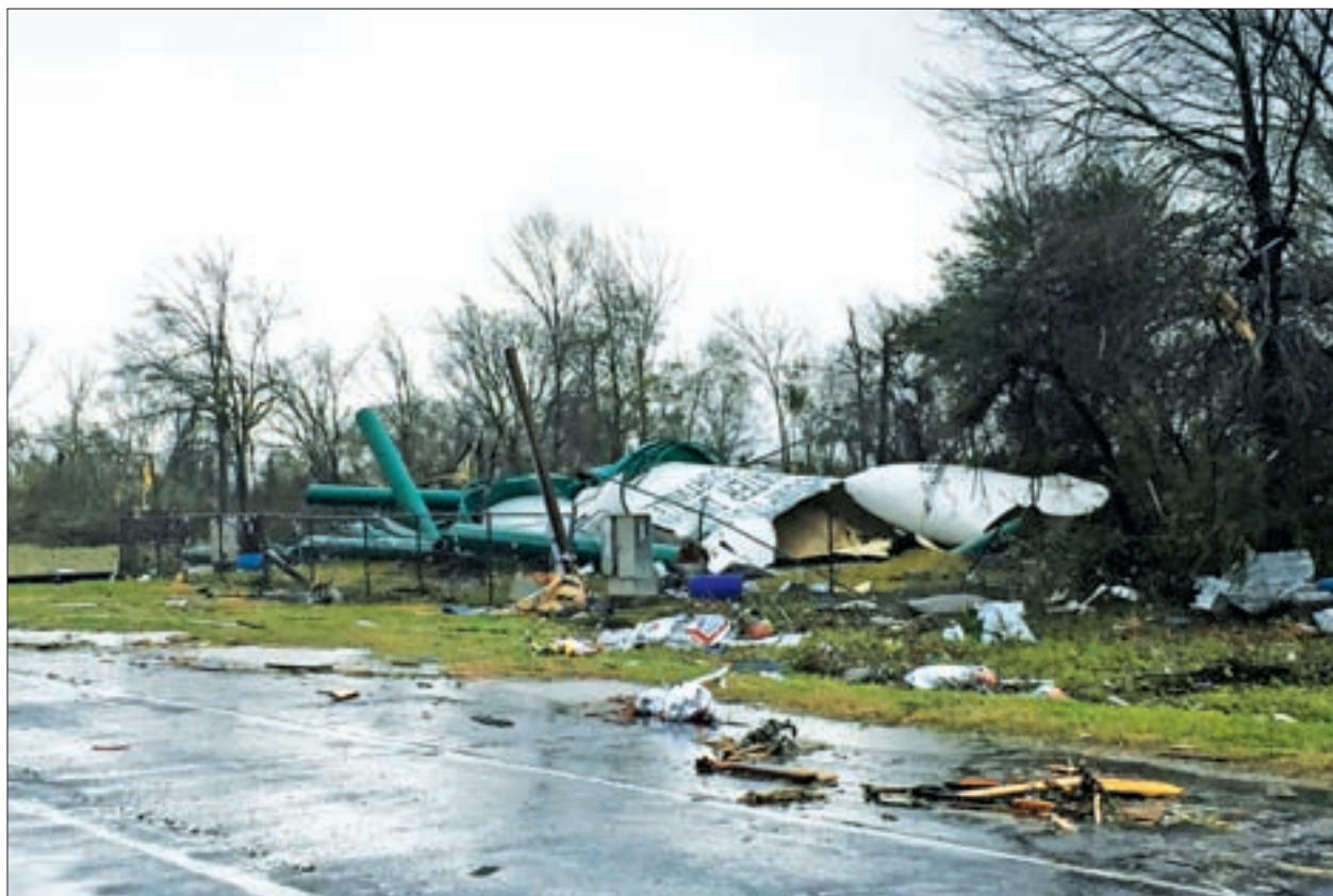
Debris from a damaged water tower is shown in this handout photo provided by Assumption Parish Sheriff's Office, west of New Orleans, Louisiana on 23 February 2016.