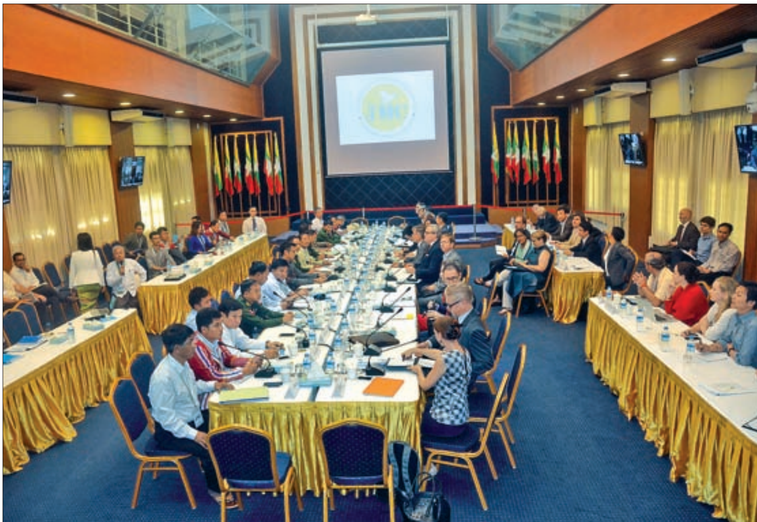
Union Joint Monitoring Committee (JMC-U) holds a third-day meeting, seeking ways to prevent further clashes.

LOCAL BUSINESS High-speed water transport companies dry-docked by lack of passengers PAGE 5