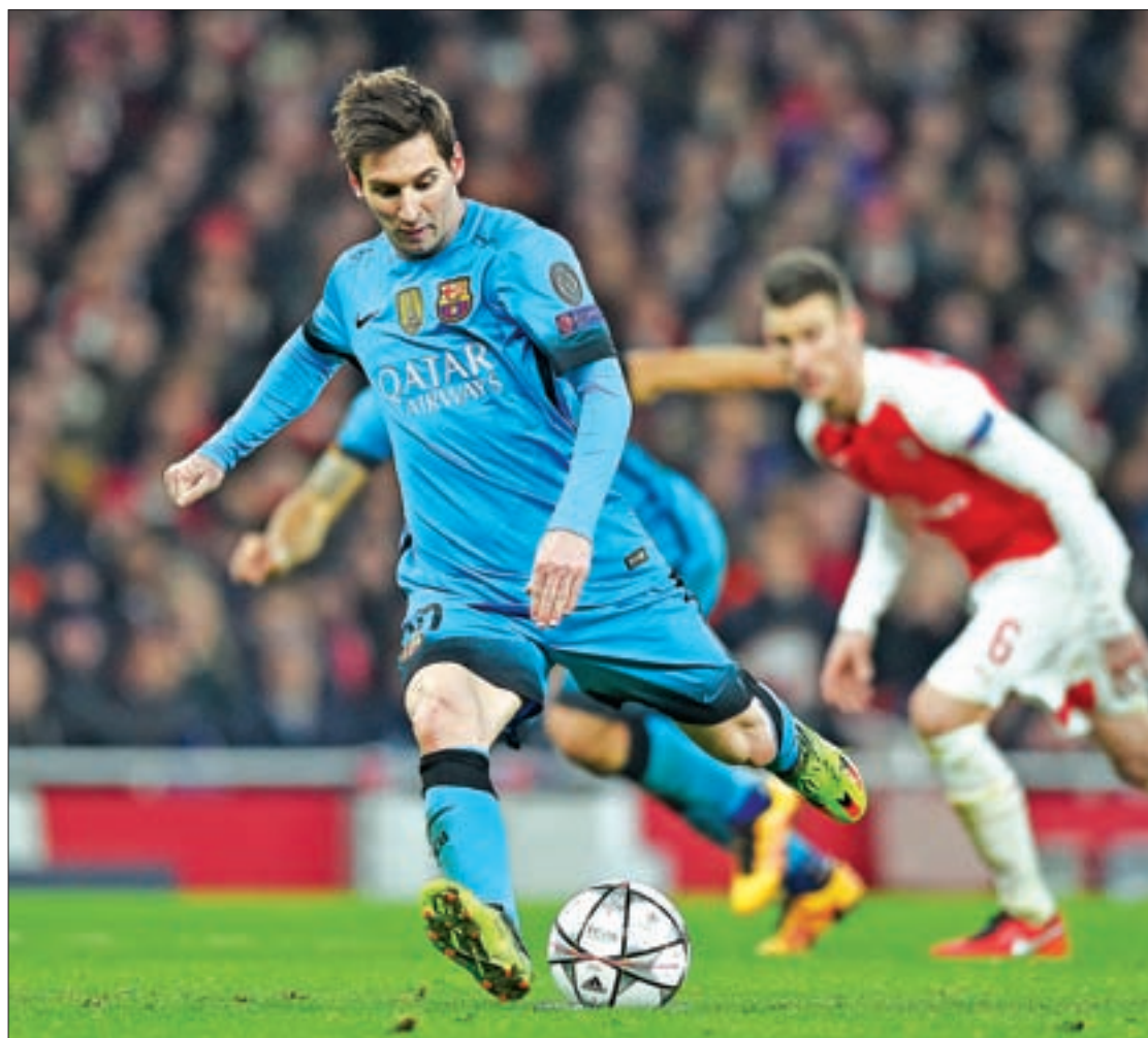
Lionel Messi scores the second goal for Barcelona from the penalty spot during UEFA Champions League Round of 16 First Leg at Emirates Stadium, London, England on 23 February 2016.

all competitions this term, headed Dani Alves's dinked cross wide with the goal gaping before Neymar was denied by goalkeeper Petr Cech after being played in by Andres Iniesta.