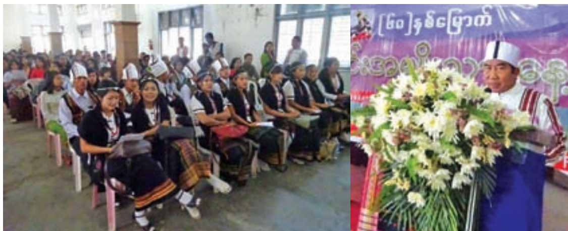
68 th Chin National Day opening ceremony in progress.