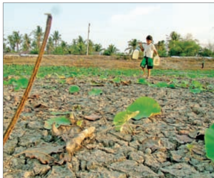
A child walks across a dried pond as he carries water in southern Yangon in 2010.

Meteorological experts regard this year El Nino weather front to be the strongest in a century, the effects of which have already started to be felt in Myanmar.— Myitmakha News Agency