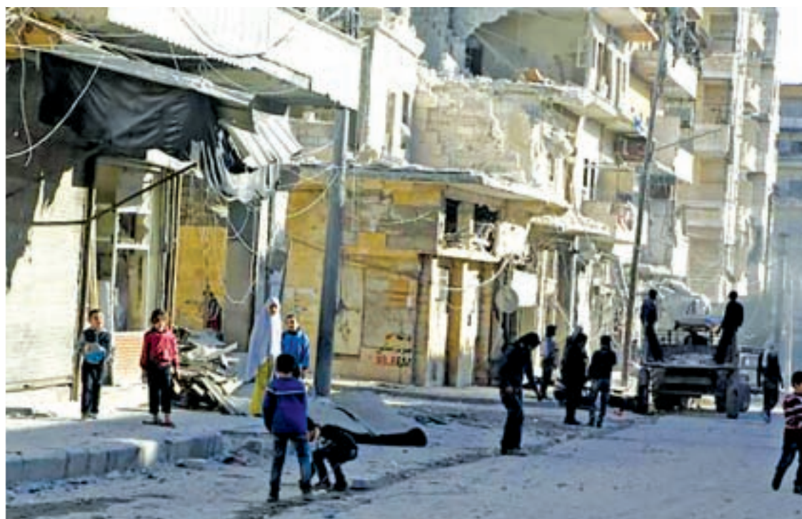
Residents inspect damage after an airstrike on the rebel held al-Fardous neighbourhood of Aleppo, Syria, on 18 February 2016.

as a whole Syria if we wait much longer,” he said.