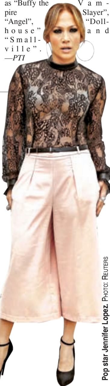
Pop star Jennifer Lopez.

"Angel", "Dollhouse" and "Smallville". —PTI