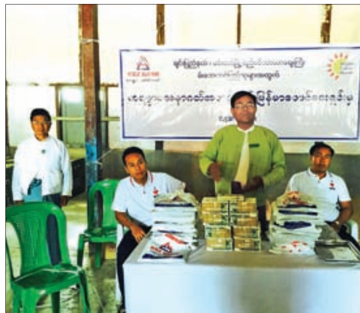
Employees from Kambawza Bank in Pakokku present cash assistance to victims to Mindat fire.

KBZ's aid to affected families of the fire broke that out in Namhsan in northern Shan State, Labutta in Ayeyawady Region, and Kyaukkar in Tanintharyi Region in February has reached a total of K44.5 million ($362,114). —GNLM