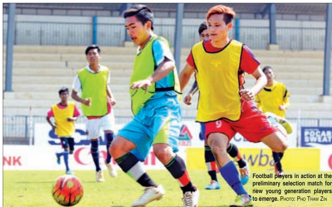
Football players in action at the preliminary selection match for new young generation players to emerge.

SHAN United Football Club will continue its tentative selection of young players for the team on last day of February and on 1 March in Taunggyi, Shan State, aiming to turn out a new generation of players in the region.