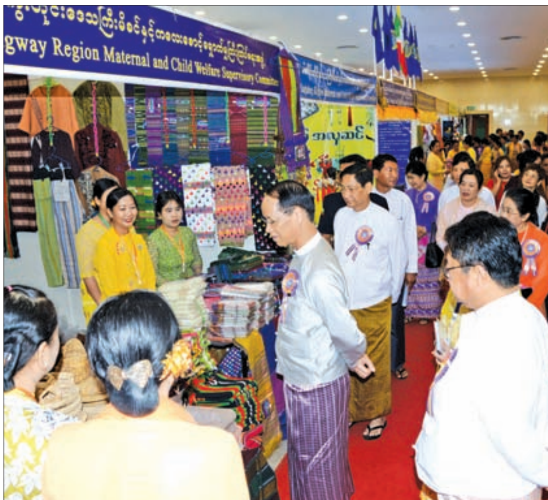
Vice President Dr Sai Mauk Kham visits booths at 8 th Asia Pacific Conference on Reproductive and Sexual Health and Rights.

Myanmar is the eighth host country after the Philippines in 2001, Thailand in 2003, Malaysia in 2005, India in 2007, China in 2009, Indonesia in 2011 and the Philippines in 2014.— Myanmar News Agency