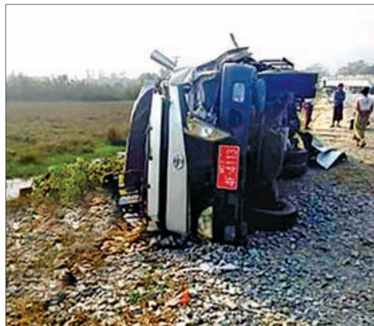
22 wheel container seen being turned over at the site of the incident.