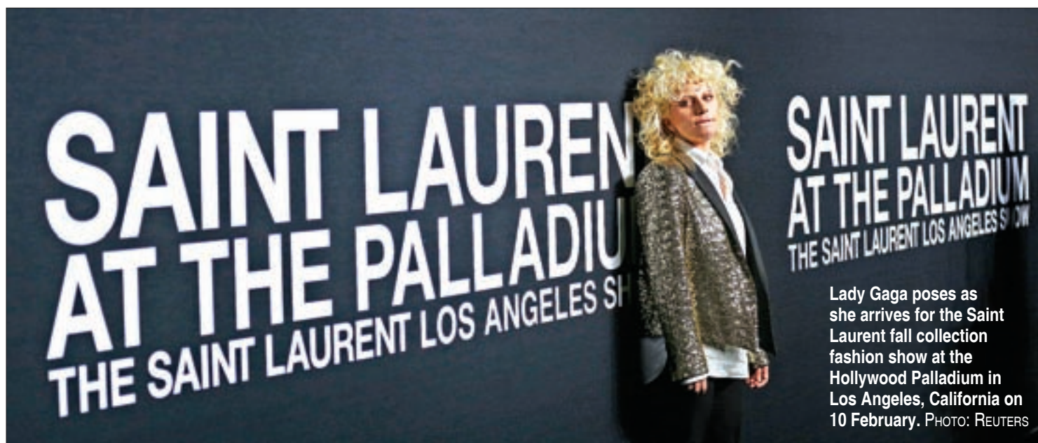
Lady Gaga poses as she arrives for the Saint Laurent fall collection fashion show at the Hollywood Palladium in Los Angeles, California on 10 February.