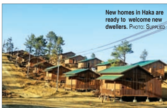
New homes in Haka are ready to welcome new dwellers.