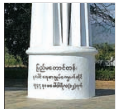
Panglong Union Monument.

The summit is scheduled to be held in Sunnylands, California, from 15 to 16 February, 2016.—Myanmar News Agency