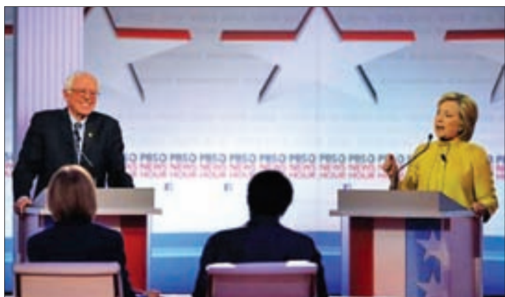
Hillary Clinton speaks as Bernie Sanders listens.

MILWAUKEE — Democratic presidential candidates Hillary Clinton and Bernie Sanders clashed sharply in a debate on Thursday over their support for President Barack Obama, with Sanders accusing Clinton of “a low blow” after she compared him to Republicans.