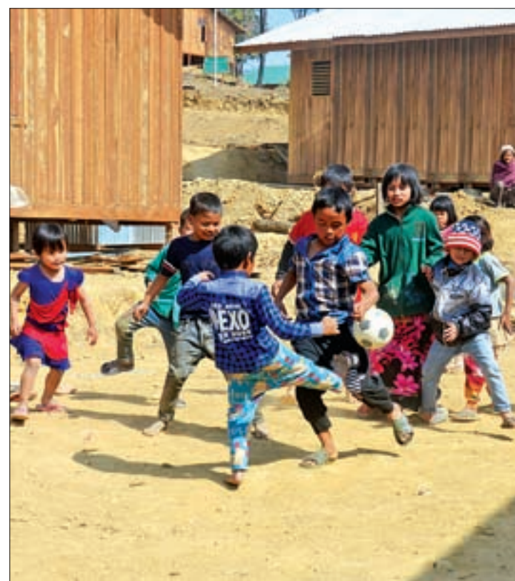
Children from families relocated to new homes are playing.

The nationwide death toll from landslides and floods between June and late August reached 120. Most of these deaths occurred in Rakhine State, where 56 people were killed, followed by 23 in Sagaing and 12 in Mandalay Region, according to data from the Ministry of Social Welfare, Relief and Resettlement.— Myanmar News Agency