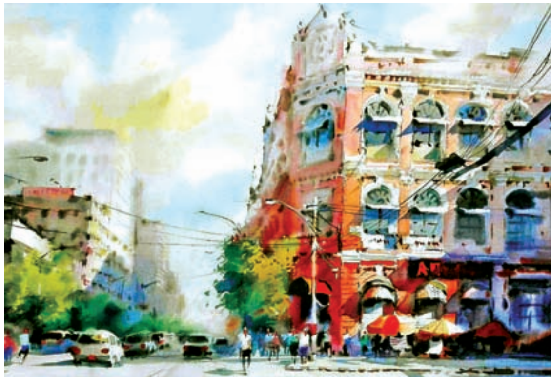
A watercolour painting depicting the lifestyle of Yangonites.

YANGON'S Gallery 65 will showcase watercolour works by local artists depicting the lives of the city's residents at an exhibition from 14 to 17 February. The gallery is located on Yawmingyi Street in Dagon Township.