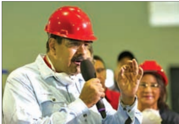
Venezuela's President Nicolas Maduro talks during the opening ceremony of a plant of PVC tubes in the state of Carabobo, in this handout picture provided by Miraflores Palace, on 11 February.