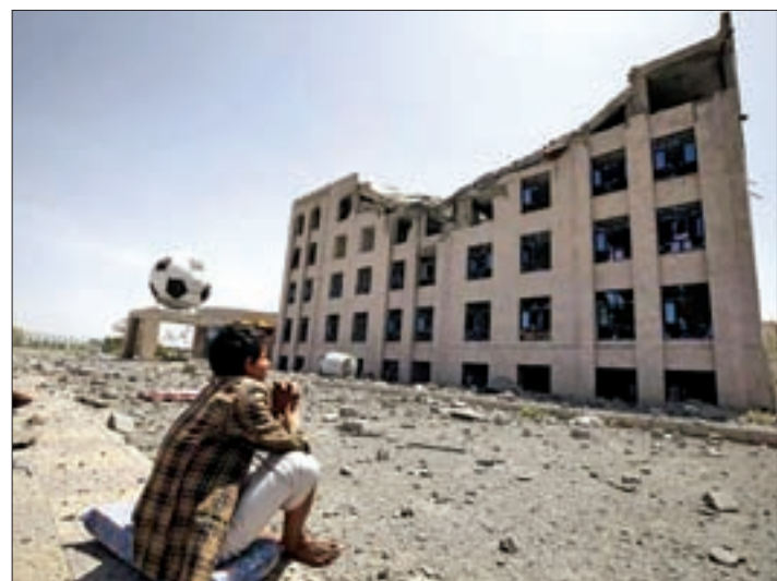
A Houthi militant sits amidst debris from the Yemeni Football Association building, which was damaged in a Saudi-led air strike, in Sanaa, in 2015.

The panel of experts documented 119 coalition sorties "relating to violations of international humanitarian law" and said that "many attacks involved multiple air strikes on multiple civilian objects."—Reuters