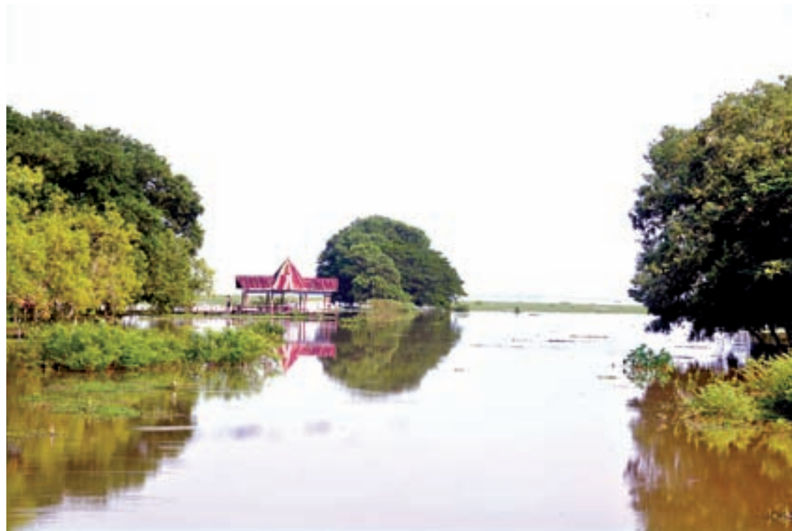
Moeyungyi Wildlife Sanctuary in Waw Township.

SITUATED about 70 miles north of Yangon by the Yangon-Man-dalay highway in Waw Township, Bago Region, the Moeyungyi Wildlife Sanctuary and Wetlands Resort received a low number of international tourists last year compared with 2014.