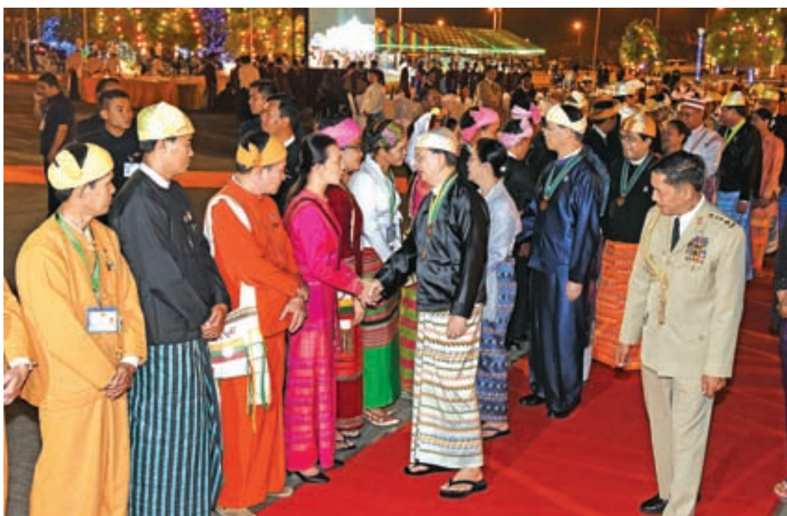
President U Thein Sein greets ethnic delegates at dinner to mark 69th Anniversary Union Day.

Next, the President and his wife cordially greeted members of the national races cultural troupes.— Myanmar News Agency