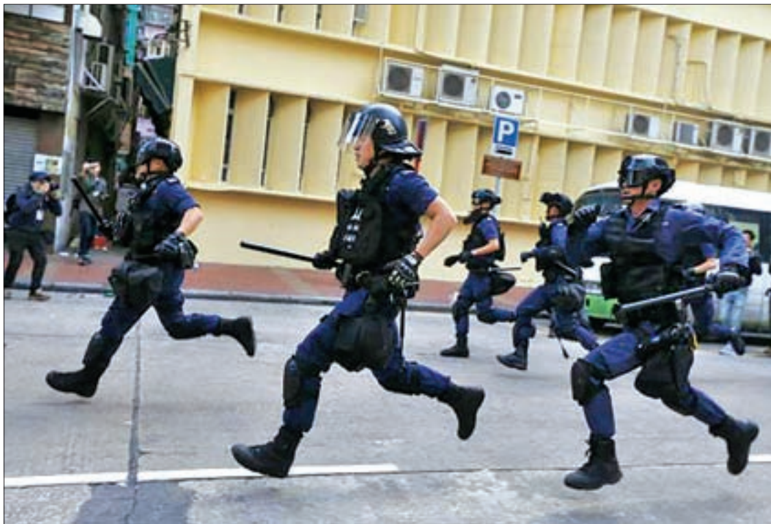
Riot police move forward to charge at protesters during a clash at Mongkok District in Hong Kong, China, on 9 February.

"The violence quickly subsided as the Hong Kong police took effective measures in a professional manner with restraint and in accordance with the law," the statement said.—Reuters