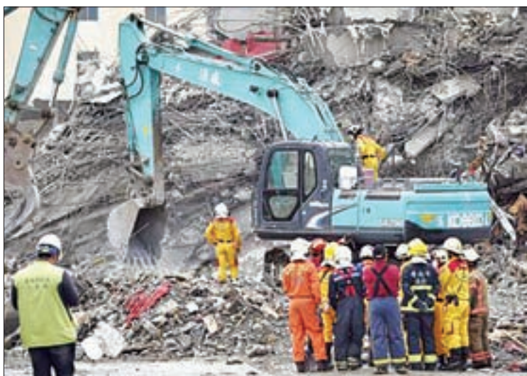
Heavy machinery removes rubble at the site of a collapsed high-rise condominium building in Tainan, southern Taiwan, on 12 February 2016, six days after a massive earthquake struck the city, killing at least 96 people and injuring hundreds.

Earlier, a ceremony was held in Tainan to remember the people who died in the quake.