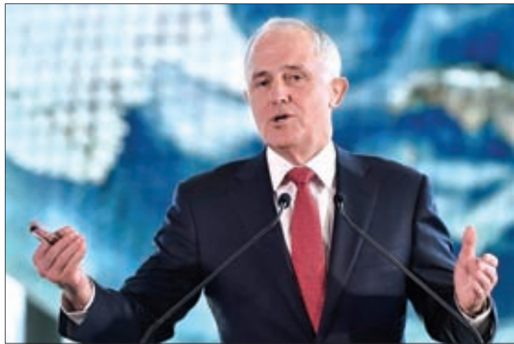
Australian Prime Minister Malcolm Turnbull.

SYDNEY — Australian Prime Minister Malcolm Turnbull accepted the resignation yesterday of a Cabinet minister who admitted he had attended a contract signing between China's Minmetals Corp and an Australian company with which he had financial links.