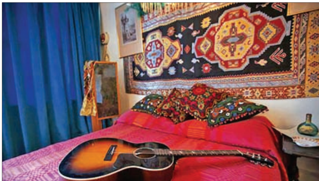
Replica items, including a guitar, in the bedroom of the home where Jimi Hendrix and girlfriend Kathy Etchingham lived in 1968-69 London, on 8 February.

LONDON — The London apartment where Jimi Hendrix lived more than 45 years ago has opened to the public, restored to look just how the rock star used it.