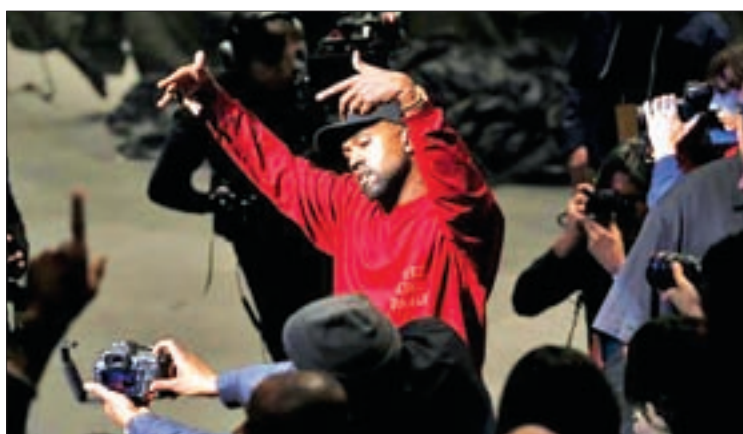
Kanye West dances during his Yeezy Season 3 Collection presentation and listening party for the 'The Life of Pablo' album during New York Fashion Week on 11 February.

As West played new tracks for his upcoming "The Life of Pablo" album, dozens of models were unveiled standing on raised platforms