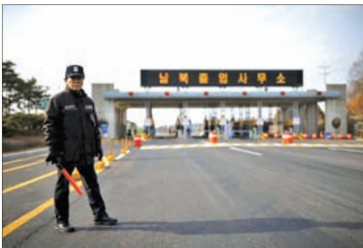
A South Korean security guard stands guard on an empty road which leads to the Kaesong Industrial Complex (KIC) at the South's CIQ (Customs, Immigration and Quarantine), just south of the demilitarised zone separating the two Koreas, in Paju, South Korea, on 11 February. PHOTO: REUTERS

THAAD, built by Lockheed Martin Corp (LMT.N), is designed to intercept and destroy ballistic missiles inside or just outside the atmosphere during their final phase of flight.—Reuters