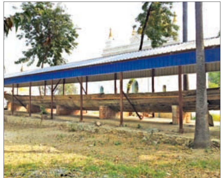
Royal wooden boat in Mingun.

The royal boat was kept in the compound of the Parda Nathan Settawya pagoda near the Mingun Bell—the third largest in the world—which also attracts large numbers of local and foreign tourists.— Myitmakha News Agency