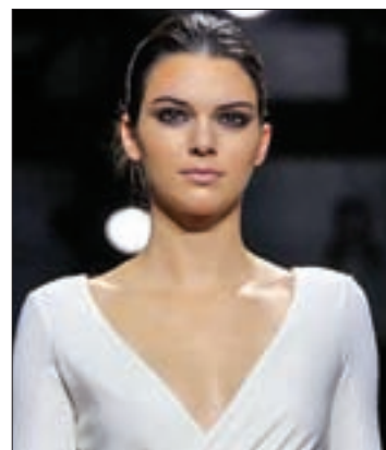
Model and television personality Kendall Jenner.

NEW YORK — Kendall Jenner, the model and a star of reality TV show "Keeping Up with the Kardashians," is suing a skin care company for at least $10 million, saying it used her photo in advertisements for acne laser treatment without permission.