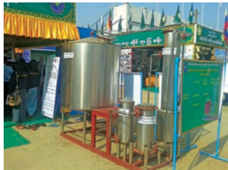
Chindwin chemical engineering seen at an exhibition.

"The waste water remaining in the reaction flask will also be used as a toxin-free natural fertiliser," he added.— Myo Win Tun (Monywa)