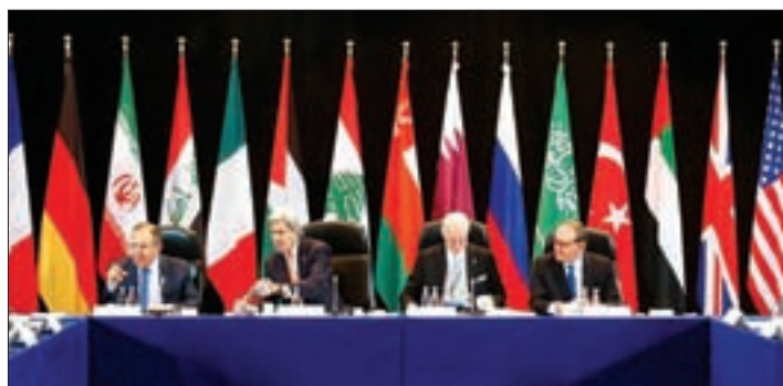
Russian Foreign Minister Sergei Lavrov (L) and US Foreign Secretary John Kerry (2L) attend the International Syria Support Group (ISSG) meeting in Munich, Germany, on 11 February 2016, together with members of the Syrian opposition and other officials.

The United States and European allies say few Russian strikes have targeted those groups, with the vast majority