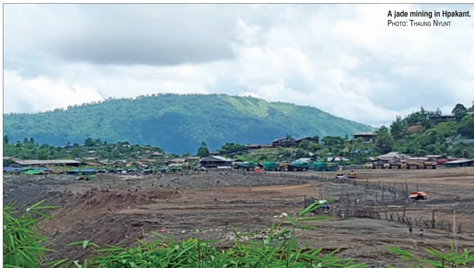
A jade mining in Hpakant.

"We are not in a position whereby we can sell manganese dioxide from our mining activities as we don't have any foreign buyers. The world market of minerals is falling. Right now we're in a spot of difficulty as the Myanmar Enterprise No 2 is requesting us to cough up the money owed to them so that can show their share to the new government," said U Tin Nway, secretary of the Eastern Shan State Mining Entrepreneurs Association.