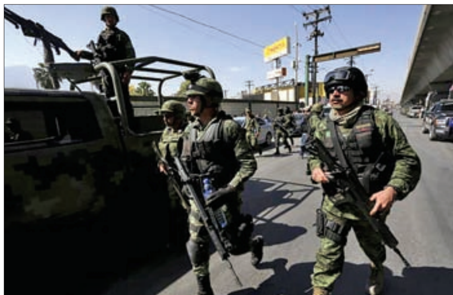
Soldiers walk near the Topo Chico prison in Monterrey, Mexico, on 11 February.

Fighting broke out before midnight in two areas of the Topo Chico prison between supporters of a gang leader known as "Zeta 27" and another group, with prisoners using bottles and blades, Nuevo Leon state Governor Jaime Rodriguez said. "Topo Chico is a ... very old prison. A prison with very difficult security conditions," said Rodriguez, who described the state's prison system as a "time bomb" that needed to be defused. Rodriguez himself