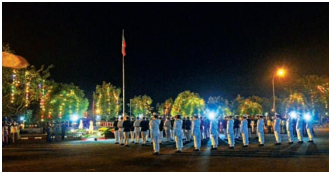
The State Flag is hoisted in the early morning at a ceremony to celebrate 69th Union Day in Nay Pyi Taw on 12 February.

A STATE flag hoisting and saluting ceremony was held in commemoration of the 69th Anniversary Union Day at the square of Nay Pyi Taw City Hall yesterday morning.