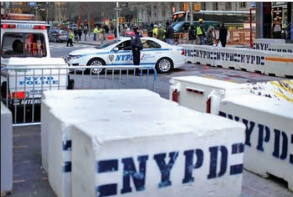
A New York City Police Department (NYPD) check point is seen on Broadway in lower Manhattan in New York, on 20 January 2016.