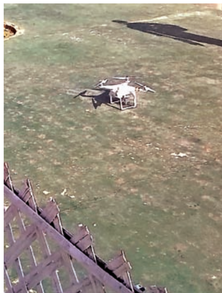
Drones are now being used for aerial photography.

Authorities said they are now planning to regulate the use of drones with licence requirements.— Htay Myint Maung