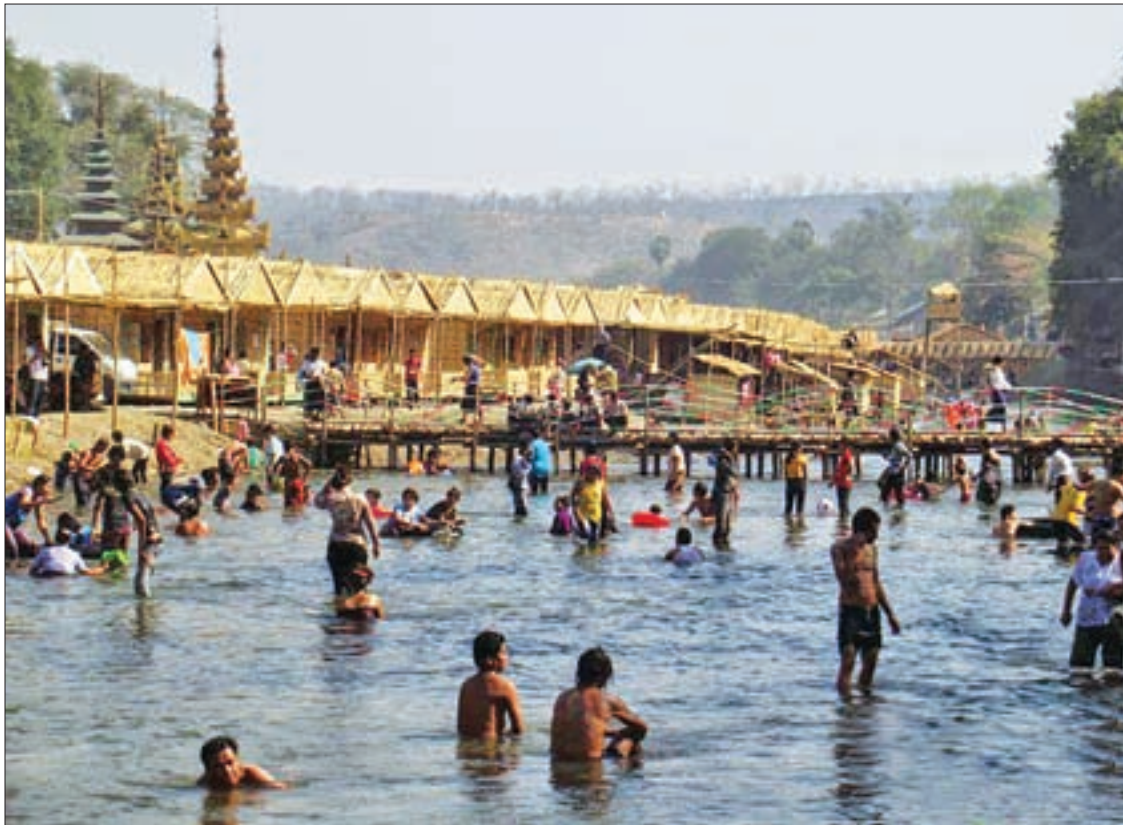
Visitors swim in the Mann Creek flowing near Manshwesettaw Pagoda.

THE Manshwesettaw pagoda festival will be opened today (5th Waxing of Ta Bo Dwe) on an elaborate scale in Saku township, Minbuu District, Magway Region.