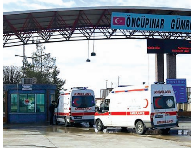
Ambulances enter Syria from Turkey at Turkey's Oncupinar border crossing on the Turkish-Syrian border in the south-eastern city of Kilis, Turkey, on 7 February.

ONCUPINAR, (Turkey)/BEIRUT — Aid trucks and ambulances entered Syria from Turkey on Sunday to help tens of thousands of people who have fled an escalating government assault on Aleppo, as air strikes targeted villages on the road linking the city to the Turkish border. Rebel-held areas in and around Aleppo, Syria's largest before the war, are still home to 350,000 people, and aid workers have said they could soon fall to the government.