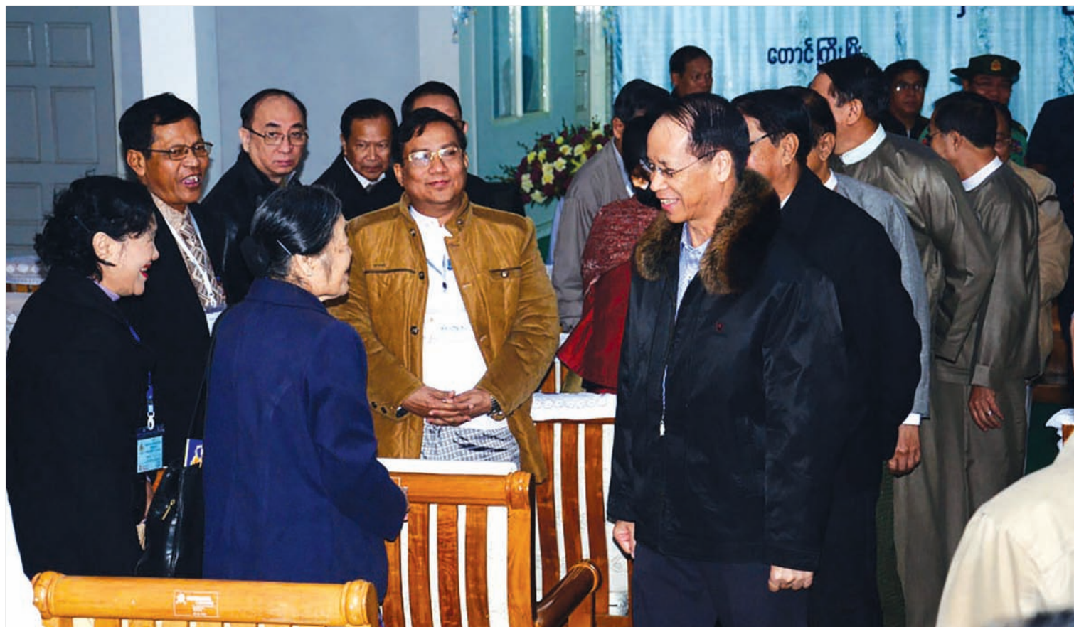
Vice President Dr Sai Mauk Kham greets attendees of 16th annual conference of the Myanmar Medical Association in Taunggyi.

The vice president also visited University of Medicine in Taunggyi, where he met faculty members and medical students. During his tour, Vice President Dr Sai Mauk Kham also inspected Aye Thaya Public Housing in Aye Thaya Township.— Myanmar News Agency