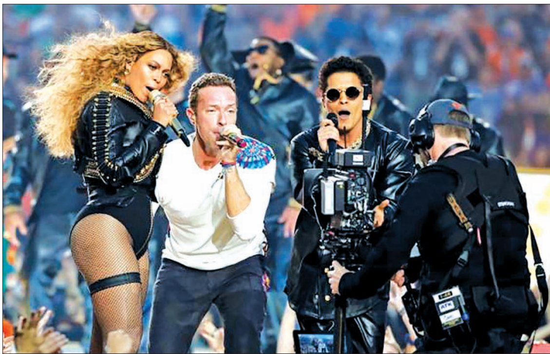
Beyonce, Chris Martin and Bruno Mars perform during the half-time show at the NFL's Super Bowl 50 between the Carolina Panthers and the Denver Broncos in Santa Clara, California, on 7 February.

But, partnered with Mars on the football field, the tone of the performance was lighter than the video. They subtly conveyed the themes of "Formation" with female dancers dressed in black shorts, crop tops and berets, in