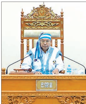
Speaker of Pyithu Hluttaw U Mahn Win Khaing Than.