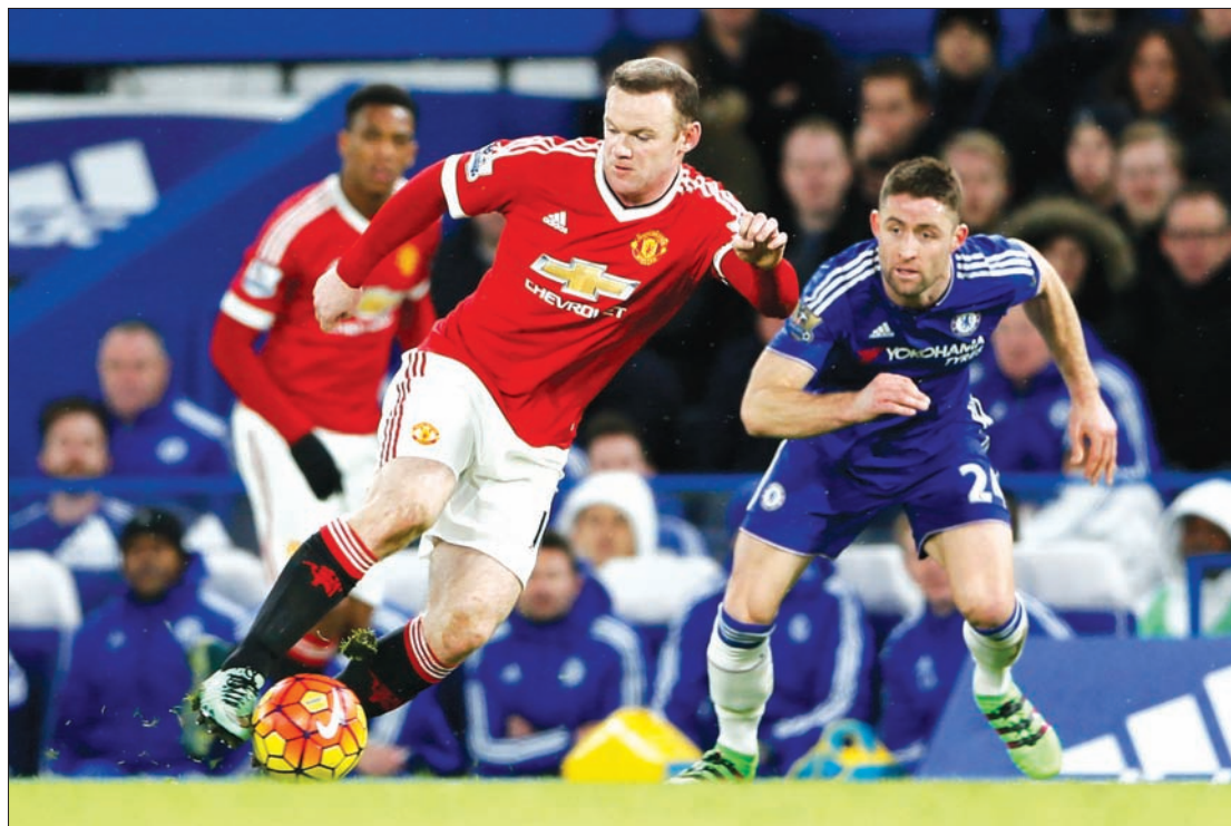
Chelsea's Gary Cahill and Manchester United's Wayne Rooney in action during their Barclays Premier League at Stamford Bridge, on 7 February.

football at Stamford Bridge and went ahead through Jesse Lingard's superb strike on the hour but Chelsea's Diego Costa equalised in the first minute of added time to leave United fifth on 41 points from 25 matches.