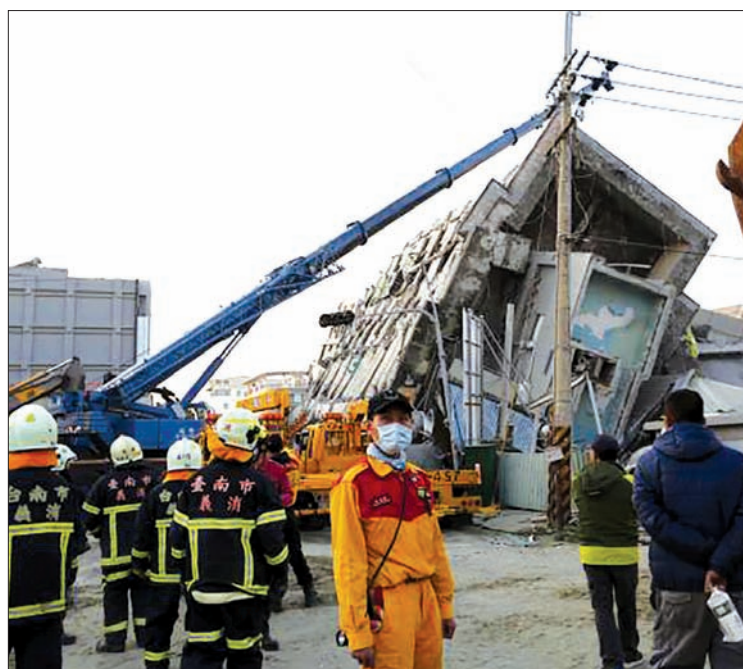
Rescue workers stand in front of a 17-storey apartment building which collapsed after an earthquake hit Tainan, southern Taiwan on 7 February.