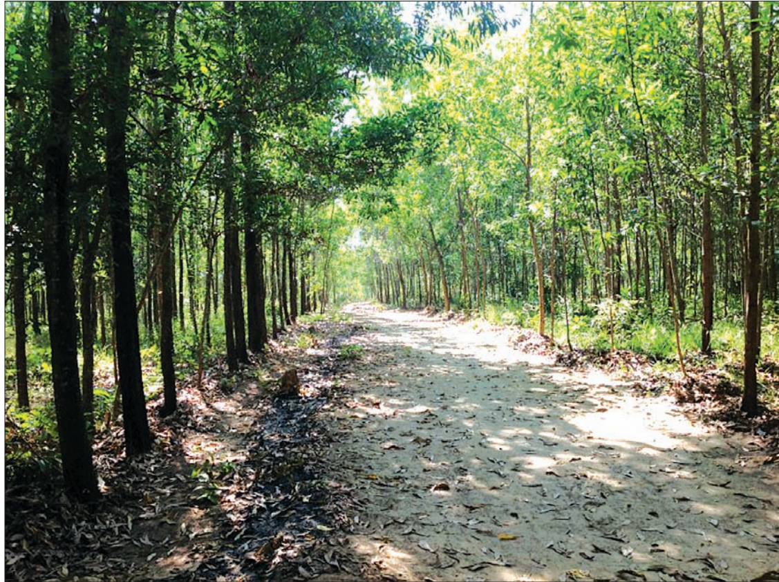
Reserve forest in Yangon Region.

THE Ministry of Environmental Conservation and Forestry has expanded its use of community forests in Yangon Region, inviting residents to grow crops on such areas.