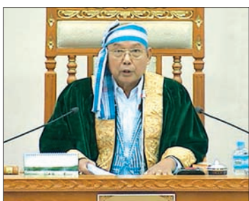
Speaker Mahn Win Khaing Than.

THE Pyidaungsu Hluttaw announced yesterday that group meetings for the nominations of three vice presidents will take place on March 17 in order to elect Myanmar's next president and two vice presidents.