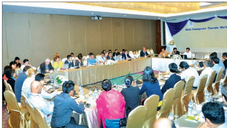
Experts participate in Media Development Thematic Working Group meeting.

He expressed his view that the current government has done as