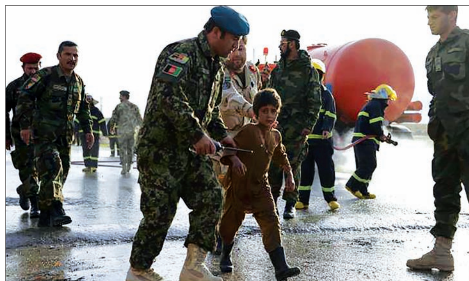
An Afghan National Army officer escorts a slightly injured boy from the site of a suicide attack on the outskirts of Mazar-i-Sharif, Afghanistan, on 8 February.

MAZAR-I-SHARIF, (Afghanistan) — At least three people were killed and 14 wounded yesterday when a suicide bomber attacked a bus filled with Afghan army personnel in northern Afghanistan, officials said.