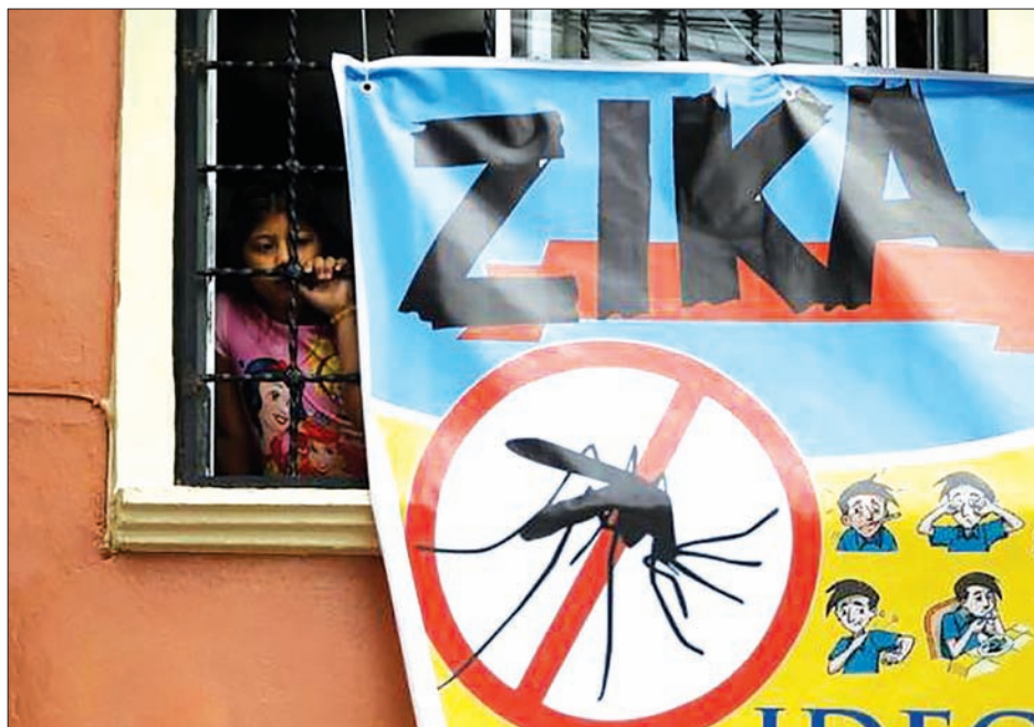
A woman looks on next to a banner as soldiers and municipal health workers take part in cleaning of the streets, gardens and homes as part of the city's efforts to prevent the spread of the Zika virus vector, the Aedes aegypti mosquito, in Tegucigalpa, Honduras, on 6 February.