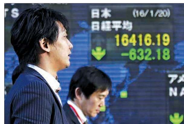
Men walk past an electronic board showing Japan's Nikkei average outside a brokerage in Tokyo, Japan, on 20 January.

But the unemployment rate fell to 4.9 per cent, the lowest since February 2008, and wages rose, indicating some signs of underlying