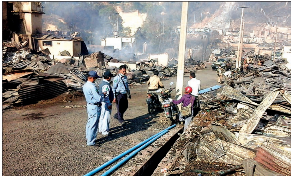
Officials of State Development Affairs Department (Branch) laying the pipes for drinking water in Namhsan.

FIRE victims in Namhsan Township, Shan State, who previously faced a water shortage, have been given access to clean water as of 6 February thanks to the efforts of departmental officials and staff.