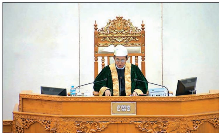
Speaker of Pyithu Hluttaw U Win Myint.

THE first regular session of the second Pyithu Hluttaw (Lower House) entered its fourth day yesterday, approving the members of the two standing committees.