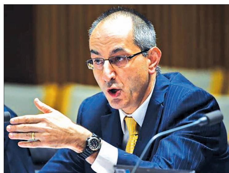
Michael Pezzullo, Secretary of the department of immigration and border protection, speaks during his appearance at an Australian Senate Estimates Committee in Parliament House, Canberra, on 8 February.

The refugees, including 37 babies, had been brought to Australia from Nauru for medical treatment.