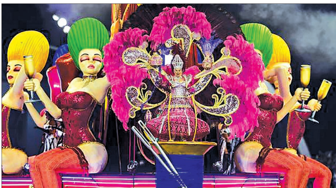
A reveller parades for the Vai-Vai samba school during the carnival in Sao Paulo, Brazil, February 7, 2016.

would investigate a report that an American in Texas had transmitted Zika to a sexual partner. On Friday, Brazilian researchers said they had found genetic material from the Zika virus in saliva and urine from two patients.