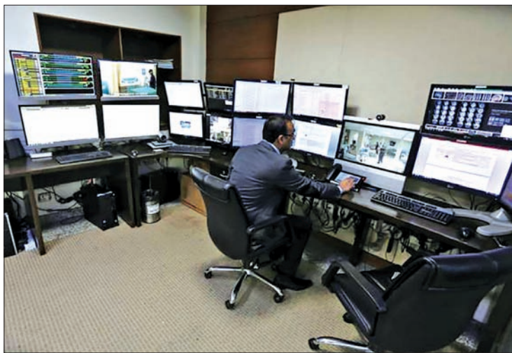
A doctor remotely monitors live footage of patients inside an electronic intensive care unit (eICU) at Fortis hospital in New Delhi, India, January 20, 2016.

Fortis will start remote monitoring of intensive care patients in the Bangladeshi city of Khulna this week, its first such cross-border