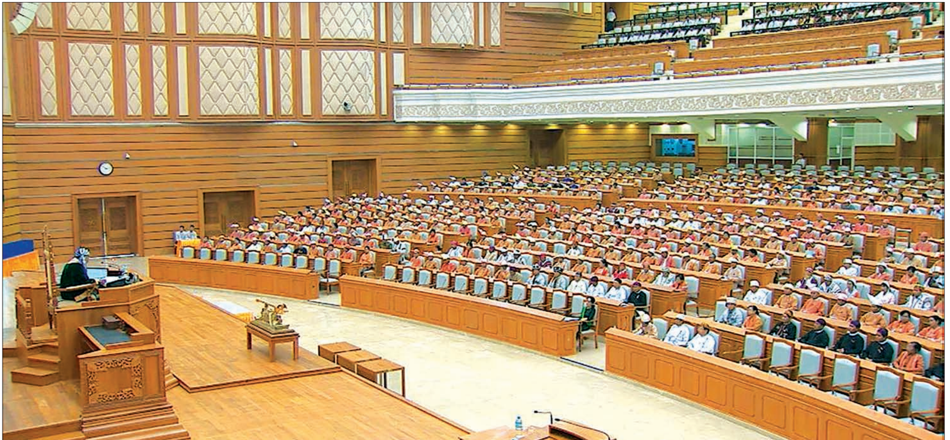
Pyidaungsu Hluttaw is convened in Nay Pyi Taw.