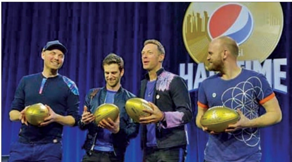
Recording artists from left Jonny Buckland, Guy Berryman, Chris Martin and Will Champion of Coldplay are presented with gold souvenir footballs during the Super Bowl 50 halftime show press conference at Moscone Center, San Francisco, CA, USA, on 4 February.

"I cannot wait to see people on social media somehow muster passionate opinions about Coldplay," the show's host, Chris Hardwick, said during Thursday's episode. He added: "Since the haters are coming, let's pre-empt them with tonight's hashtag."