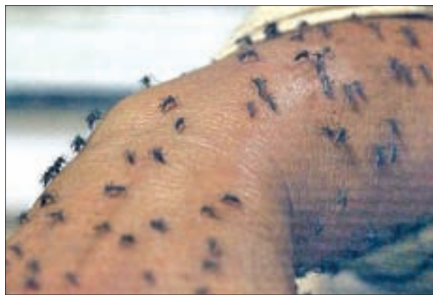
Female Aedes aegypti mosquitoes are seen on the forearm of a health technician in a laboratory conducting research on preventing the spread of the Zika virus and other mosquito-borne diseases, at the entomology department of the Ministry of Public Health in Guatemala City, on 4 February 2016.

There is no vaccine or treatment for Zika.