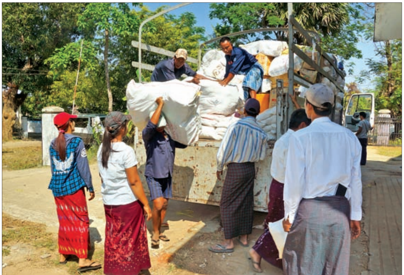
See page 3 >> Aid arrive at a monastery where Labutta fire victims are sheltering.

Donation in cash for the victims reached more than K 291 million yesterday, according to the ministry.