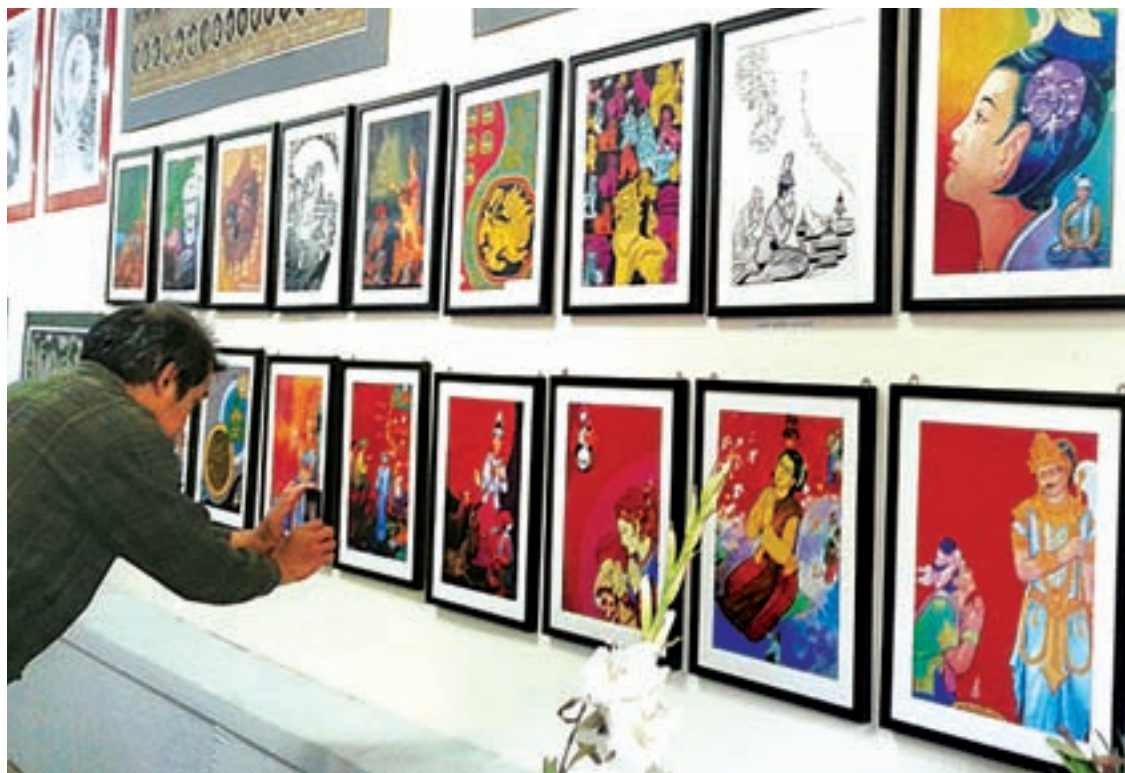
A painting fan taking a photo of paintings.