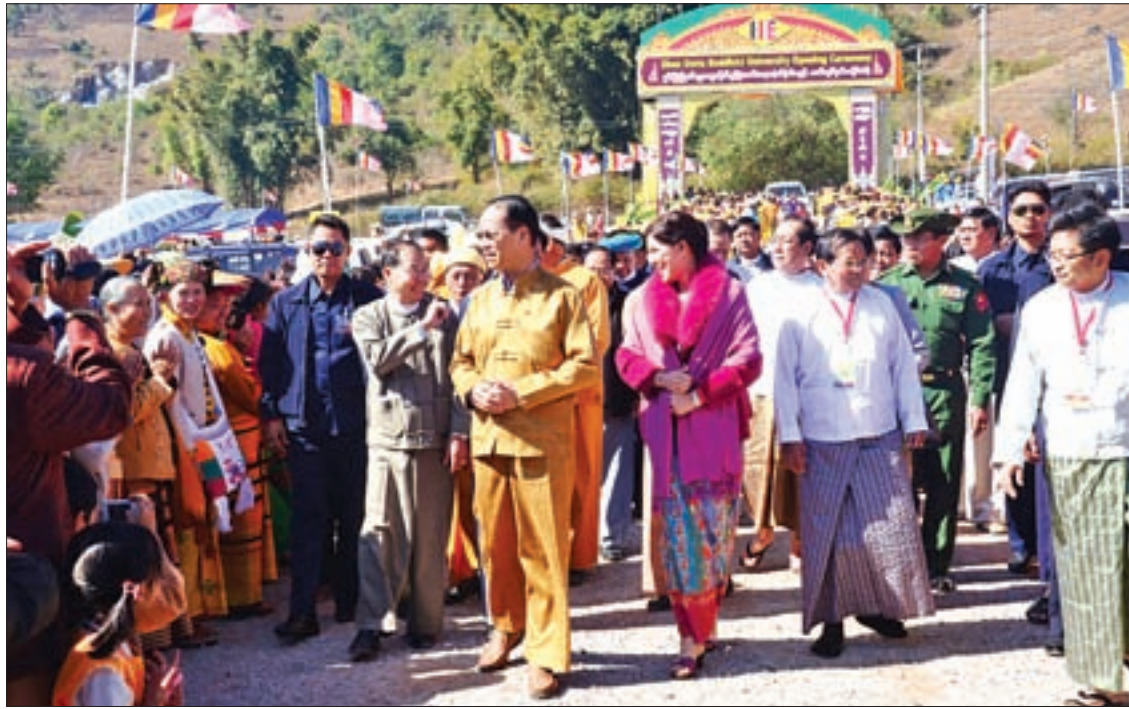
Vice President Dr Sai Mauk Kham greets local peoples after attending an international literary talk at Shan State Buddhist University in Taunggyi.