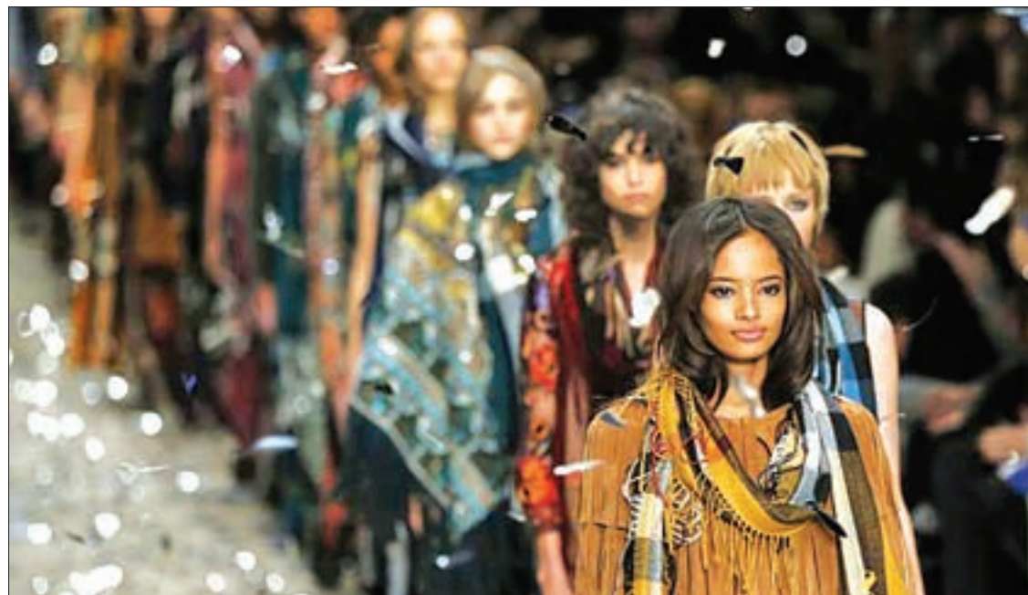
Models present creations from the Burberry Prorsum Autumn/Winter 2015 collection during London Fashion Week in

LONDON/PARIS — Design houses Burberry and Tom Ford on Friday announced new strategies that will allow them to close the gap between the runway and retail in order to get clothing and accessories more quickly to customers in different climates around the world.