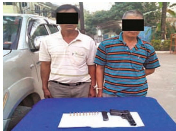
The accused seen together with the arm seized.