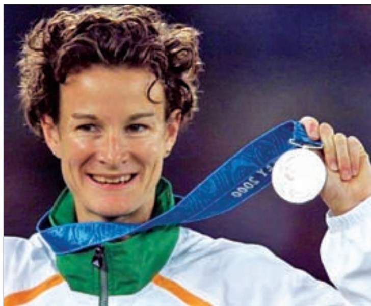
Ireland's Sonia O'Sullivan holds her silver medal for the 5000m final at the Sydney Olympic Games, in 2000.

DUBLIN — It would be a hollow victory for Sonia O'Sullivan if she became a double world champion 23 years after losing to Chinese athletes being probed for systematic doping, the former Irish distance runner said on Friday.