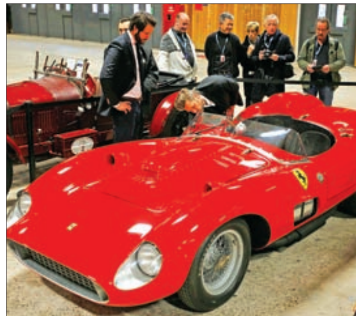
Visitors look at a red 1957 Ferrari 335 Sport Scaglietti model on display at the Paris Retromobile fair in Paris, France, on 5 February 2016.