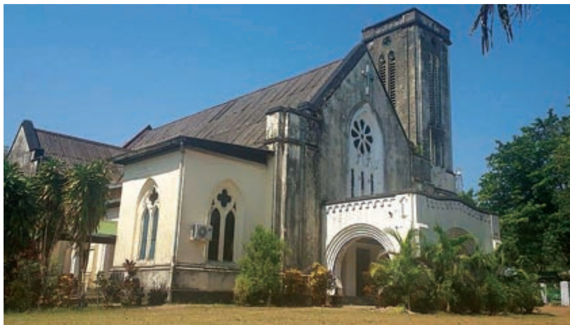
The 188-year-old First Baptist Church in Mawlamyine.

“They’ve now taken away with them evidence and records. An event will be held in May to mark the start of preparations for restoration, which itself will begin come the end of the rains in November. We’ve allocated a two