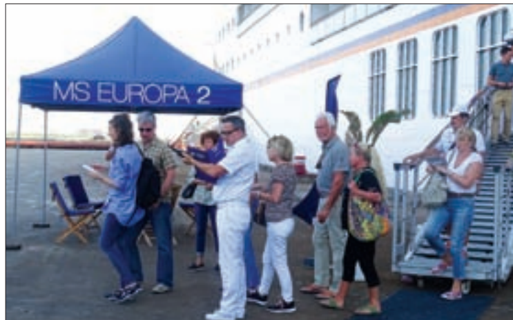
Tourists arrive at Thilawa Port by Cruise Liner MS Europa 2.

The cruise liner will leave the country for Phuket, Thailand today.— Myanmar News Agency