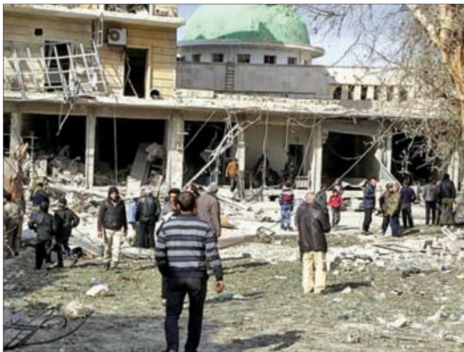
People inspect the damage after airstrikes by pro-Syrian government forces in the rebel held al-Sakhour neighbourhood of Aleppo, Syria, on 5 February.

The last two days saw government troops and their Lebanese and Iranian allies fully encircle the countryside north of Aleppo and cut off the main supply