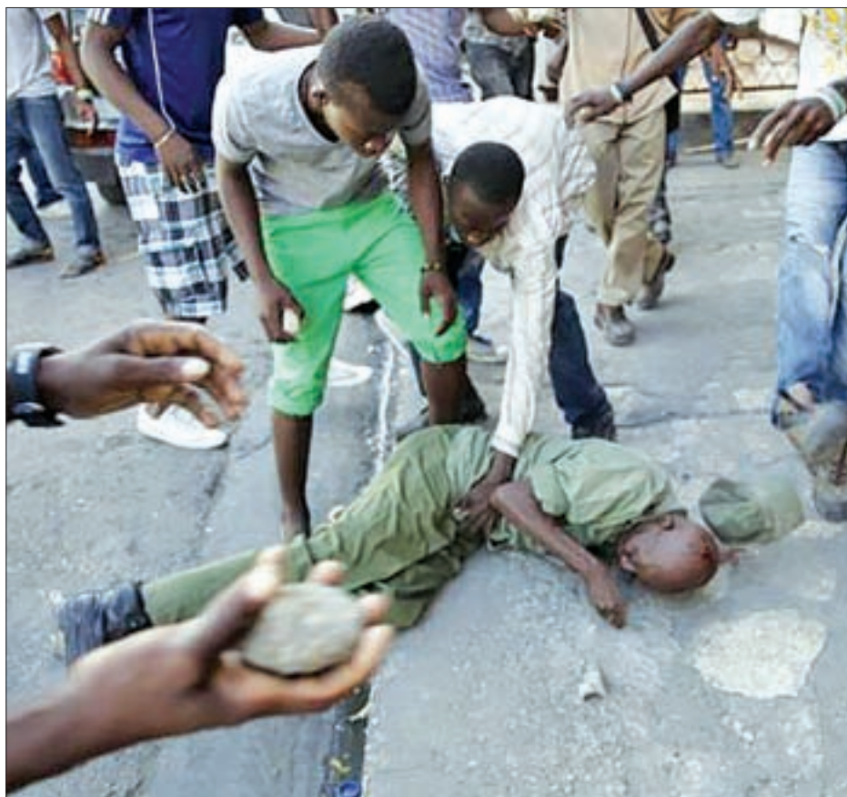
A man kicks in the head of an unidentified man in military style clothes who was stoned to death by a mob of protesters in Port-au-Prince, Haiti, on 2 February.

old divisions in Haitian society, with mainly poor opposition protesters calling for the leftist Aristide to be brought back as an interim