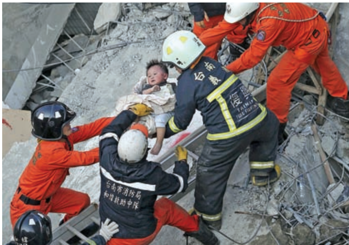
Rescue personnel help a child rescued at the site where a 17-storey apartment building collapsed during an earthquake in Tainan, southern Taiwan, on 6 February.

tions in the city of 2 million people had collapsed and five were left tilting at alarming angles, a government emergency centre said.