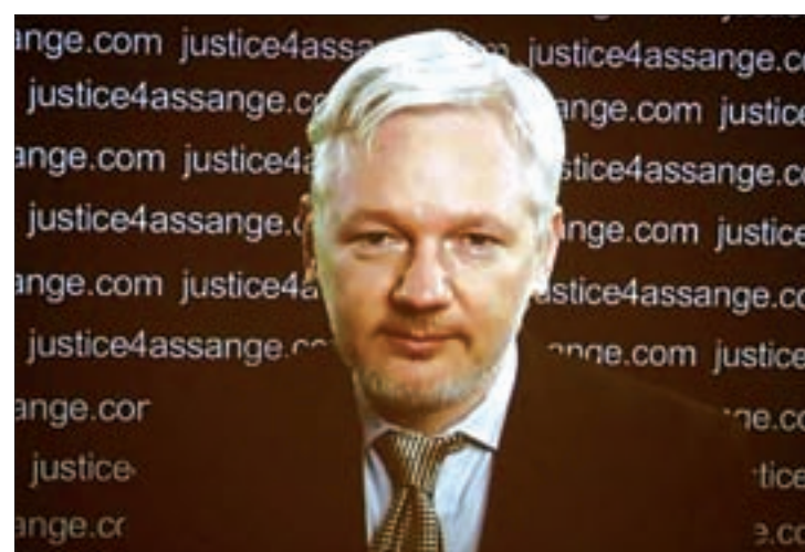
WikiLeaks founder Julian Assange appears on screen via video link during a news conference at the Frontline Club in London, Britain on 5 February 2016.

When a heckler persistently asked whether he planned to stay for five more years in the embas-