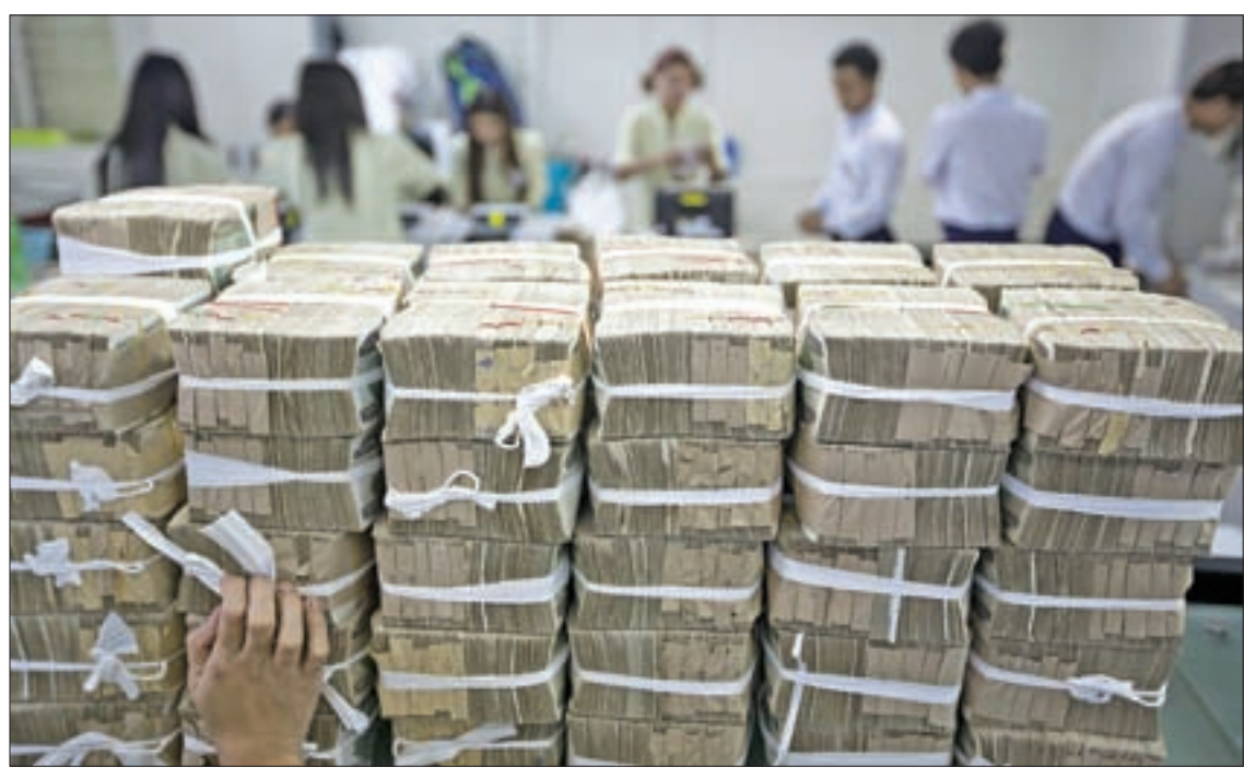
Stacks of Myanmar Kyat are prepared at a bank ahead of being transported in Yangon.

The town of Tachileik is a discussion was held over the currently served by the Myanmar Economic Bank and six independent banks, while there are a minimum of five banks located in the Thai boarder town of Mai