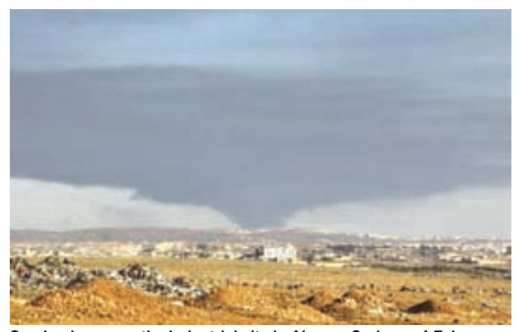
Smoke rises over the industrial city in Aleppo, Syria, on 4 February.