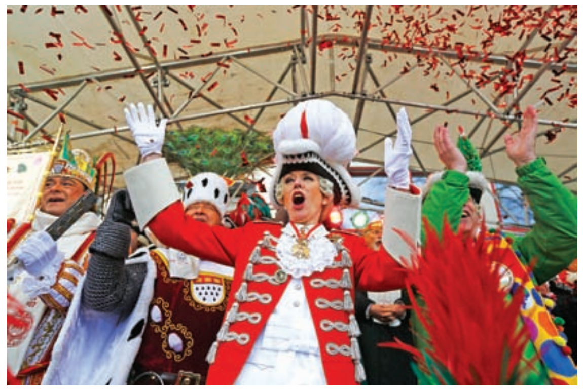
Cologne Mayor Henriette Reker takes part in the 'Weiberfastnacht' (Women's Carnival) celebrations in Cologne, Germany, on 4 February.

The festival is called the 'fifth season' in the Rhineland. Alcohol-fuelled parties with fancy dress, popular songs and dancing continue over the weekend,