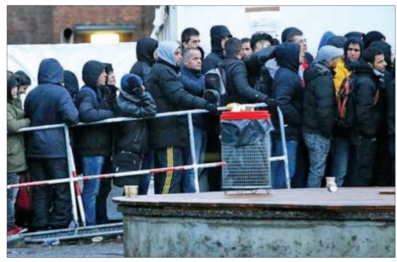
Migrants queue in front of the compound of the Berlin Office of Health and Social Affairs (LAGESO) for their registration process early morning in Berlin, Germany, on 2 February.

Merkel has said the number of migrants entering Germany will fall after 1.1 million people arrived