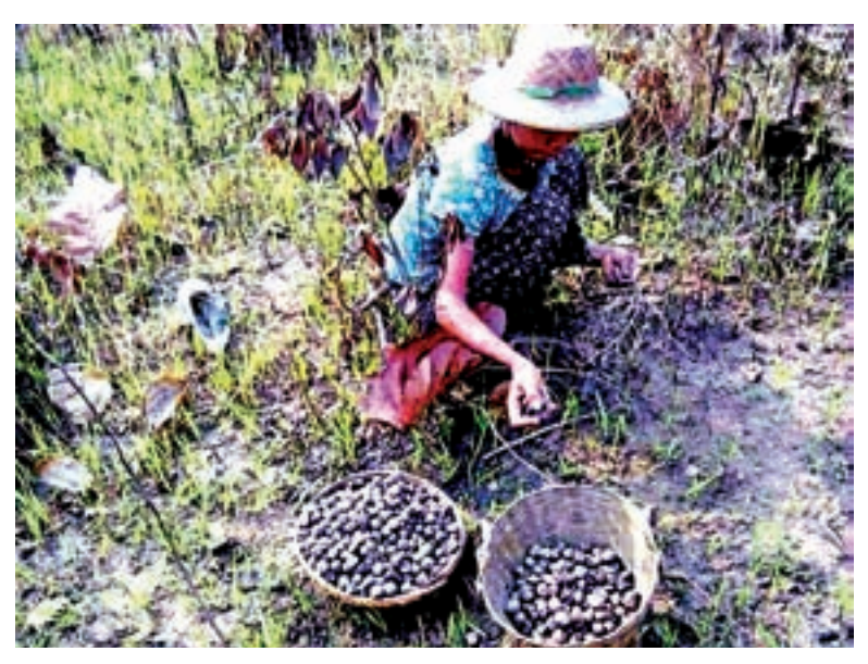
Teak seeds being collected. Photo: Sai Lumin (Media Group)

There are nine forest reserves.—Sai Lumin (Media Group)