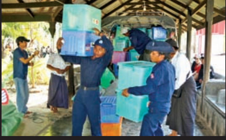
Aid flows into Labutta. Ayeyawady Region.