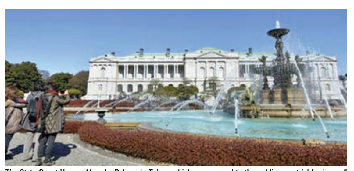
The State Guest House, Akasaka Palace, in Tokyo, which was opened to the public on a trial basis, on 5 February 2016. The government plans to start full-year opening of the neo-baroque style building from April to attract foreign visitors and further boost the tourism.

The festive eating and drinking mark the final days before Christian start 40 days of fasting in the run-up to Easter.—Reuters