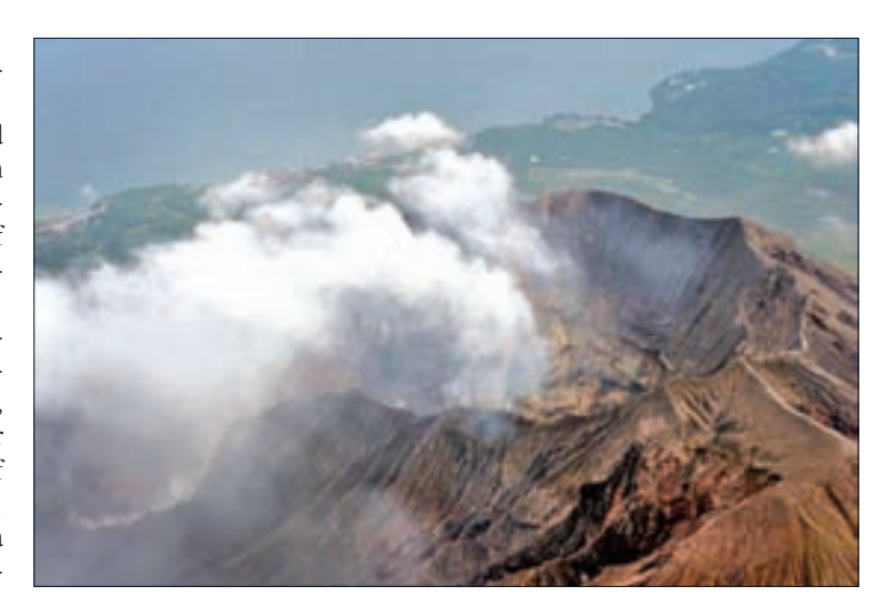
An aerial view shows the crater atop Mt. Sakurajima in Kagoshima, southwestern Japan, in August 2015.

A spokeswoman for Kyushu Electric said there was no impact from the eruption on the plant and its operations, and it was not taking any special precautions. Japan lies