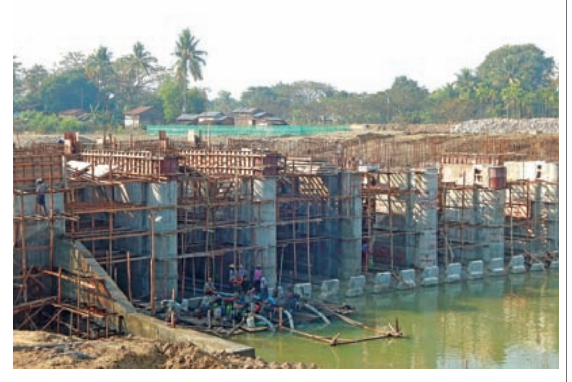
Mezali sluice gate being seen under construction.

THE construction of a sluice union government budget, gate near Mezali Village in Nyaungdon Township, Ayeyawady Region, is 50 per cent complete, according to the Ministry of Agriculture and Irrigation.