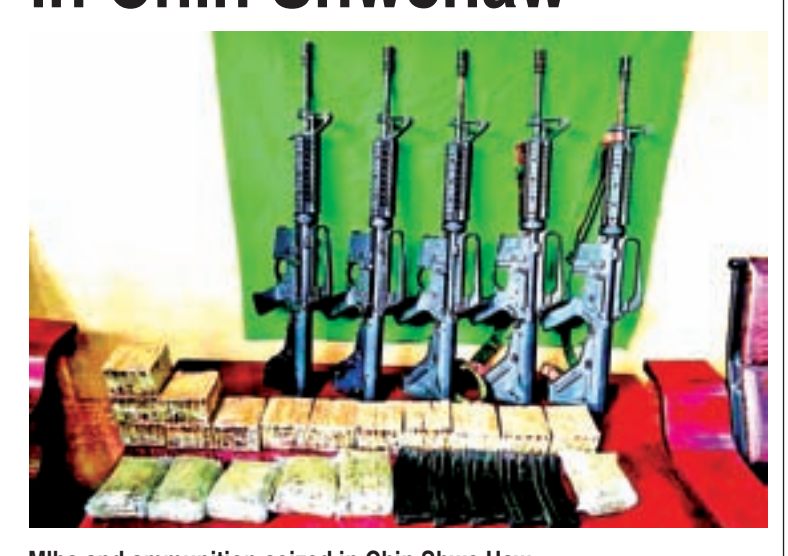
MIbs and ammunition seized in Chin Shwe Haw.