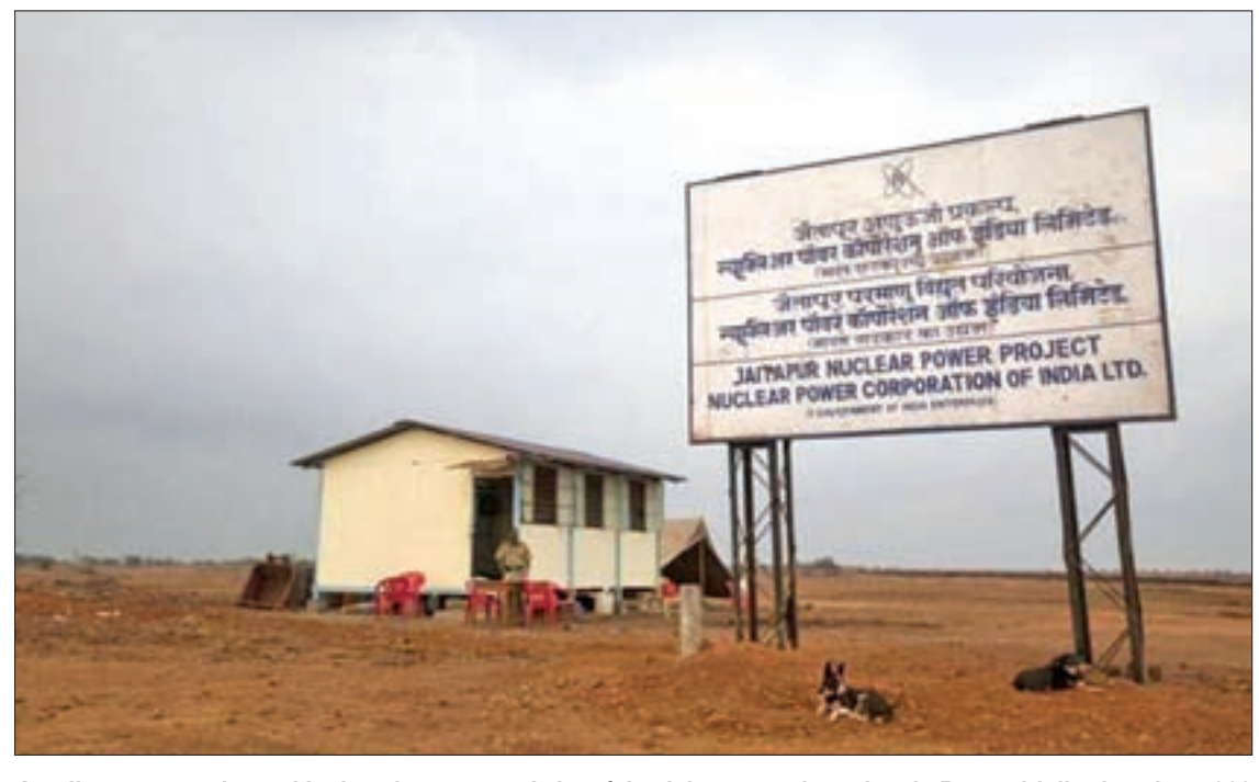
A policeman stands at a kiosk at the proposed site of the Jaitapur nuclear plant in Ratnagiri district, about 360 km (224 miles) south of Mumbai in 2011.

step in the addressing of issues related to civil nuclear liability in India," the Foreign Ministry said after the document was handed to the International Atomic Energy Agency in Vien-