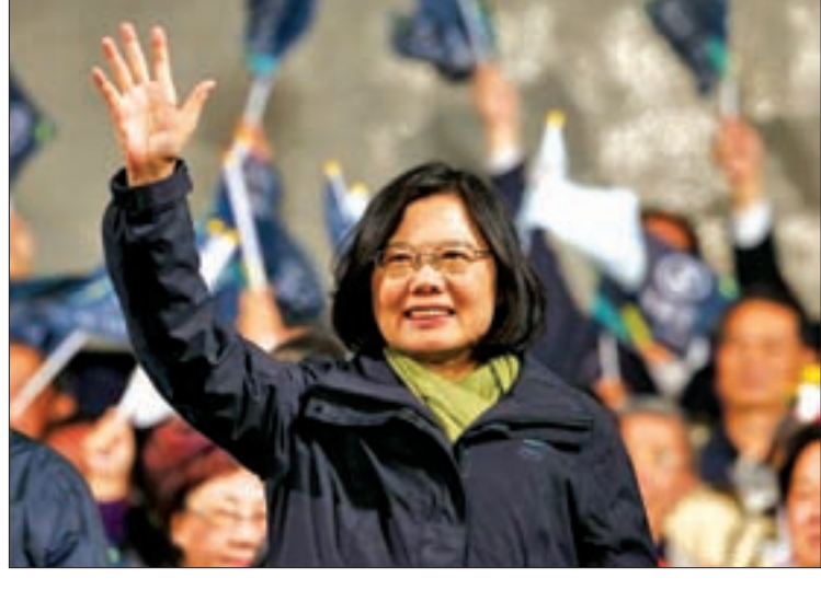
Democratic Progressive Party (DPP) Chairperson and presidential candidate Tsai Ing-wen waves to her supporters after her election victory at party headquarters in Taipei, Taiwan on 16 January.

Tsai has said she will maintain peace with China, and Chinese state-run media have also noted her pledges to maintain the "status quo" with China.