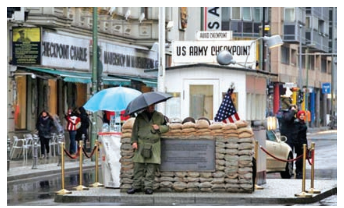
Genreal view of the former Berlin Wall border crossing point Checkpoint Charlie is pictured in Berlin, Germany, on 4 February.