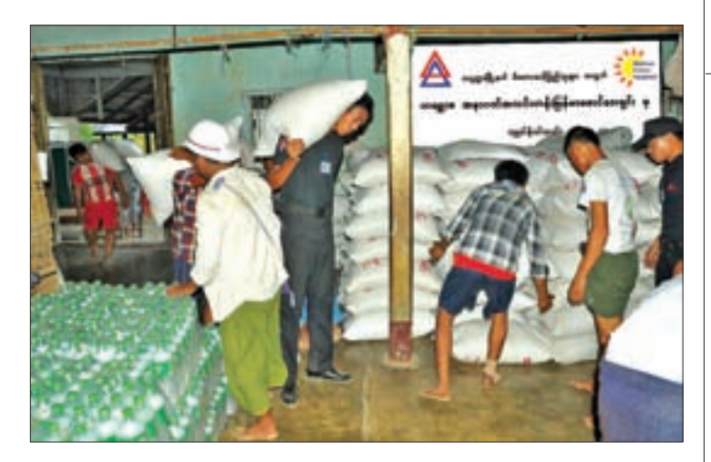
Relief aid from KBZ's Brighter Future Myanmar Foundation arrives Labutta.

KANBAWZA's Brighter Future ter, K 500,000, breakfast, lunch Myanmar Foundation reached out to the fire victims in Labutta, Ayeyawady Region and Namhsan, Shan State, yesterday, distributing aid including food and cash to individuals.