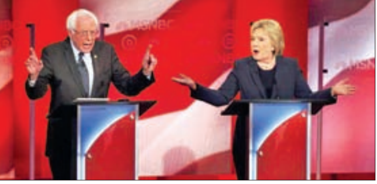
Democratic US presidential candidate and Senator Bernie Sanders (L) and former Secretary of State Hillary Clinton speak simultaneously as they discuss issues during the Democratic presidential candidates debate.

Clinton charged that Sanders' proposal for single-payer