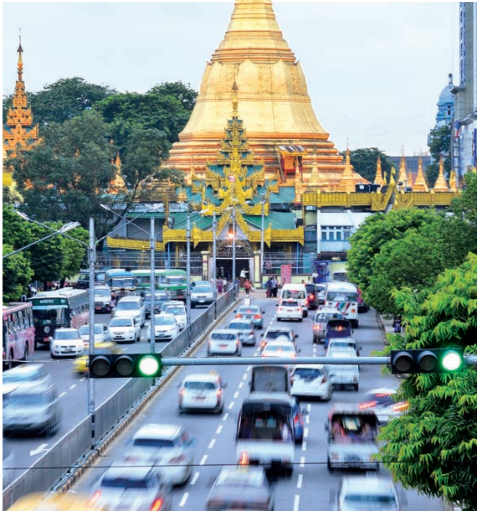
Bus stops at downtown Yangon are crowded with people during rush hours.

The first bus route has 23 stops running from Htaukkyant to Alanpya Pagoda Road via Pyay Road and Bogyoke Aung San Road and the second has 27 stops running from Htaukkyant to Pyay Road via Kabar-Aye Pagoda Road, Bogyoke Aung San Road, Botahtaung Pagoda Road, Strand Road and Phonegyi Road.