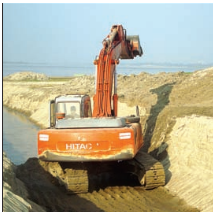
New drain is under construction in Amarapura.

CONSTRUCTION of a new drain was started as of 26 January in response to calls from Shwe Kyet Yet village and nearby villages which are suffering from the impact of water pollution in Amarapura Township, Mandalay, according to the Water Resources Utilisation Department.