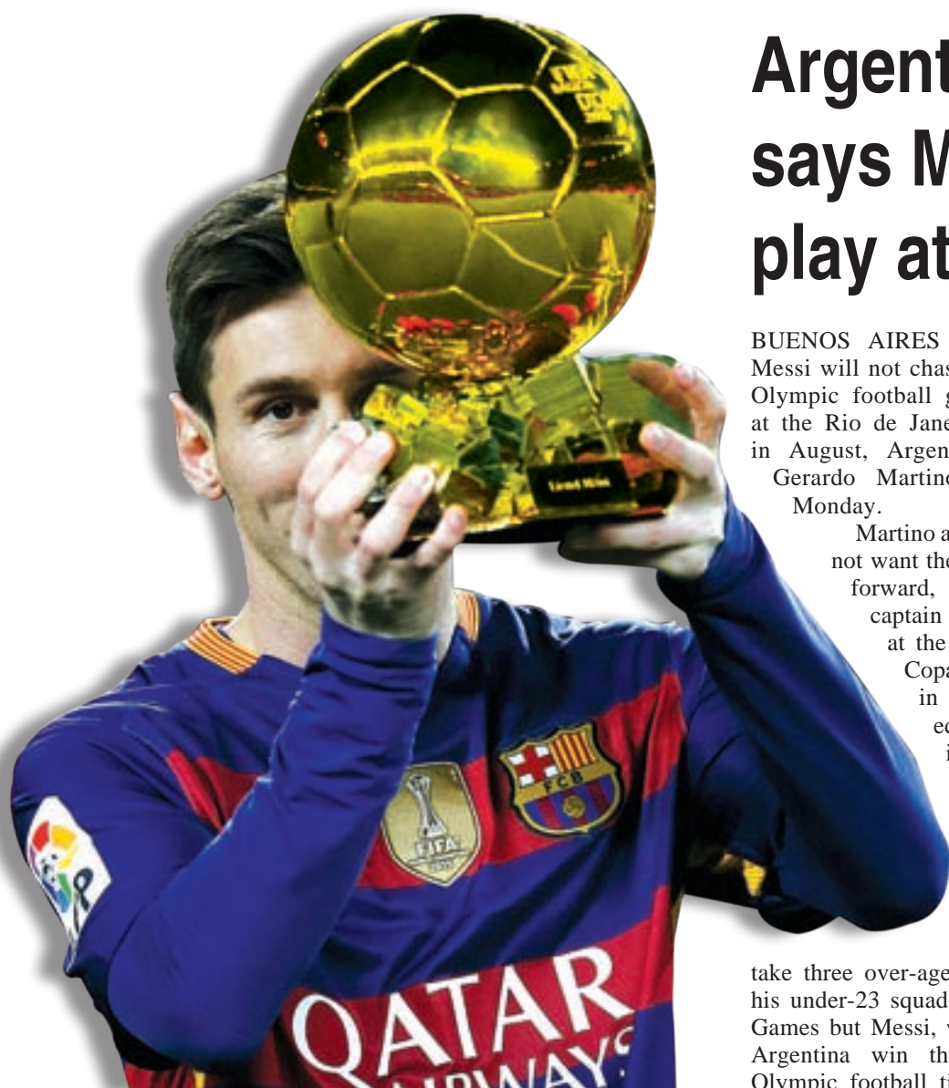
Barcelona's Lionel Messi shows to the crowd the FIFA Ballon d'Or 2015 trophy before their Spanish League soccer match against Athletic Bilbao.