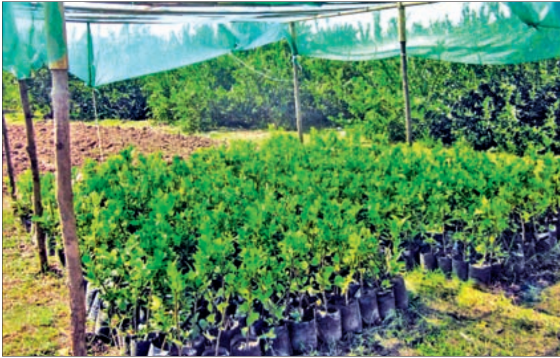
Lemon Seedlings seen at the plantation.

THE demand for lemons is very high in Nay Pyi Taw as people have increasingly begun using lemons in place of limes, local farmers said.