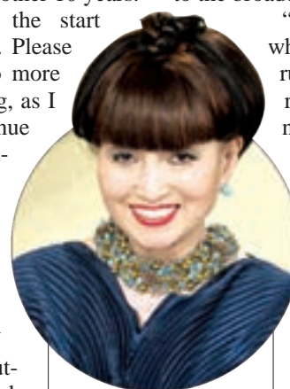
Actress Tetsuko Kuroyanagi.

In May 2015, it reached its 10,000 th episode, a feat also recognised by Guinness. More than 10,000 domestic and foreign celebrities have appeared on the show, including actor Ken Takakura, Nobel laureate for literature Kenzaburo Oe, cartoonist Osamu Tezuka, former British Prime Minister Margaret Thatcher and US singer Lady Gaga.—Kyodo News