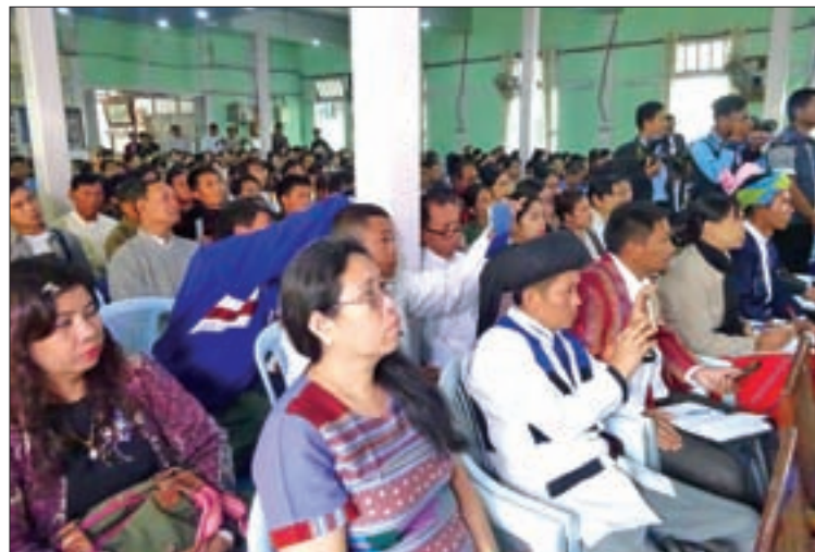
Teachers attending the Central Level Instructor course.

The new curriculum features several pillars: writing and reading, ensuring physical and mental well-being for being able to learn the knowledge including Mathematics with enthusiasm, moral development, interaction, exploring Basic Math, art and creation, environmental observation. — Thiha Ko Ko (Mandalay)