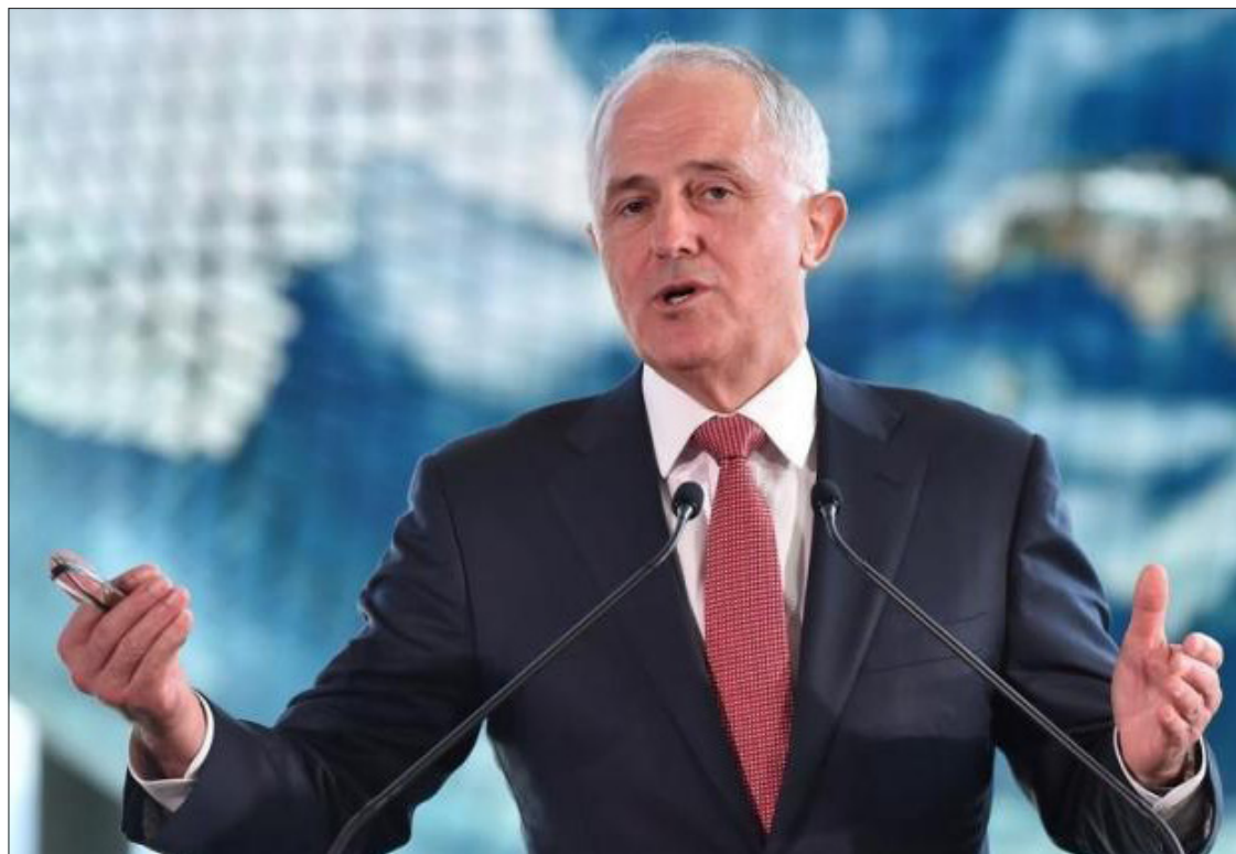
Australian Prime Minister Malcolm Turnbull.

cial with knowledge of the briefing confirmed the account.