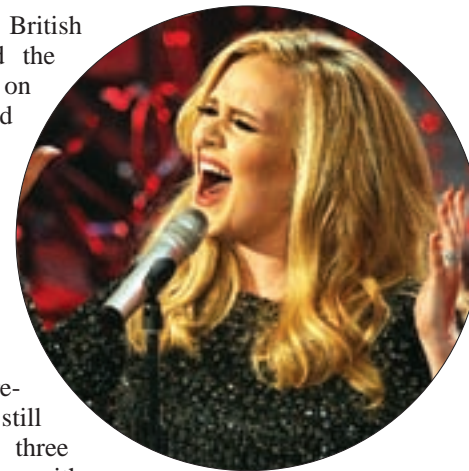
British singer Adele.

"Anti" sold under 500 albums but through a deal with Samsung, a million copies were offered free to fans who signed up for Tidal membership, making them ineligible for Billboard charts rankings, which does not count sales of albums priced under $3.49.