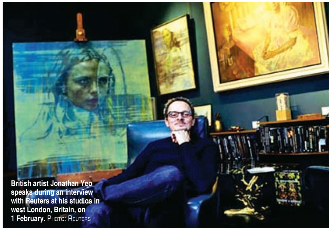
British artist Jonathan Yeo speaks during an interview with Reuters at his studios in west London, Britain, on 1 February.

LONDON — Known for his famous subjects, from politicians and royalty to Hollywood celebrities, portrait artist Jonathan Yeo explores different ways of looking at the same person in his latest work — a series of paintings of model and actress Cara Delevingne.