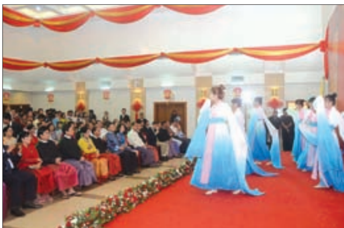
Yangon Region Chief Minister U Myint Swe, Ambassador of the People's Republic of China to Myanmar H E Mr Hong Liang and dignitaries enjoy a performance at a reception to mark the new year festival of China in Yangon on 2 February, 2016.

checking their products as the testing process is being carried out nationwide, said an official, adding that works are underway in cooperation with the MCDC to complete the process as soon as possible.— Min Htet Aung (Mann)