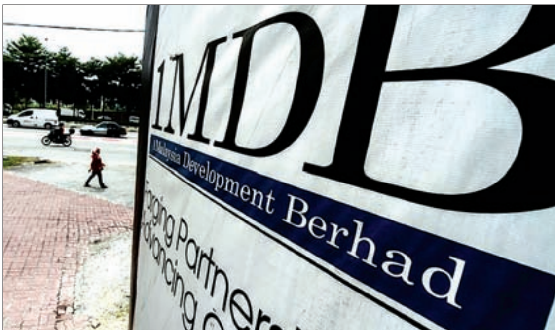
Singapore has seized "a large number of bank accounts" as part of investigations into controversial Malaysian state fund 1MDB, authorities said, vowing not to let the city-state become a refuge for illicit funds.

Last week, Malaysia's attorney general cleared Najib of any criminal offences or corruption, declaring that $681 million deposited into his personal bank ac-