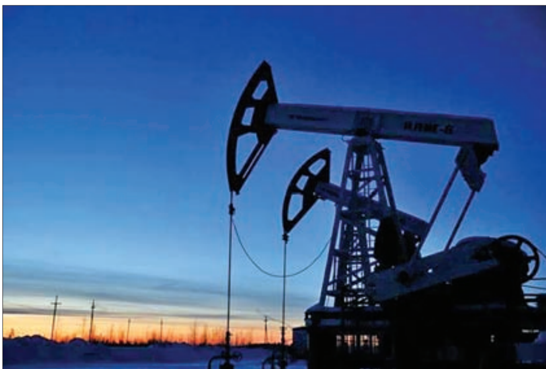
Pump jacks are seen at the Lukoil company owned Imilorskoye oil field outside the West Siberian city of Kogalym, Russia, on 25 January.

Crude prices fell after China's purchasing managers index dropped to a three-year low in