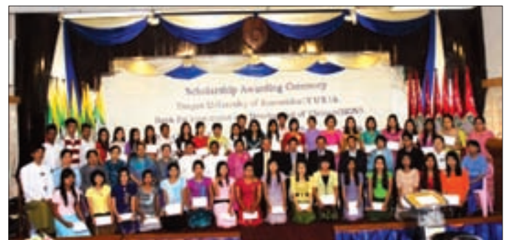
Students of Yangon University of Economics (YUE) pose for documentary photo at the scholarship award ceremony.