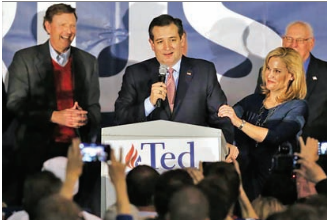
US Republican presidential candidate Ted Cruz speaks, with his wife Heidi Cruz by his side, after winning at his Iowa caucus night rally in Des Moines, Iowa, on 1 February.

DES MOINES — US Senator Ted Cruz soundly defeated billionaire Donald Trump in Iowa's Republican nominating contest on Monday, upending the party's presidential race and creating a three-way competition with establishment candidate Senator Marco Rubio.