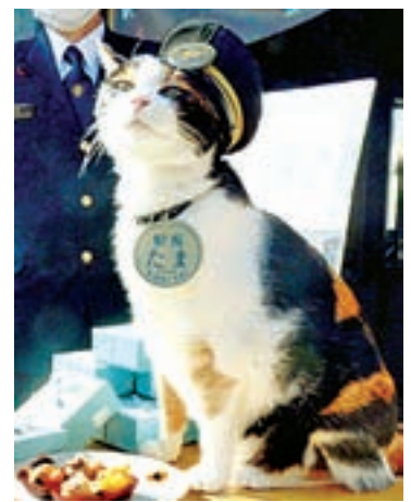
Tama, honorary stationmaster of Kishi Station on the Kishigawa Line of Wakayama Electric Railway Co in western Japan, attends an event at her station in January 2013.

The railway also appointed Nitama (Tama the Second), another calico cat, to become the stationmaster of Kishi Station to continue the tradition established with Tama.