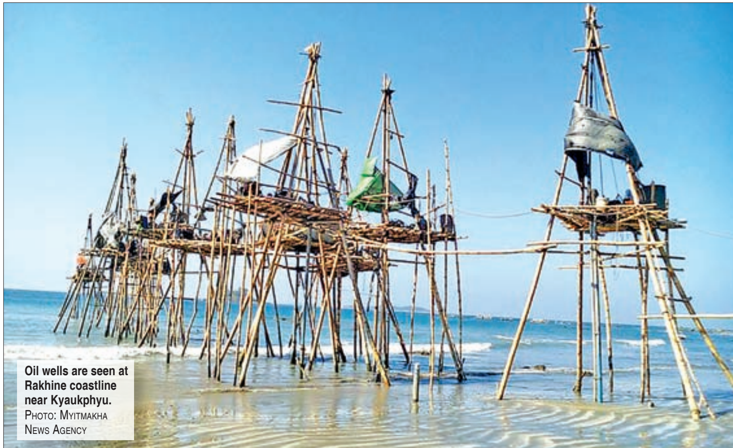
Oil wells are seen at Rakhine coastline near Kyaukphyu.