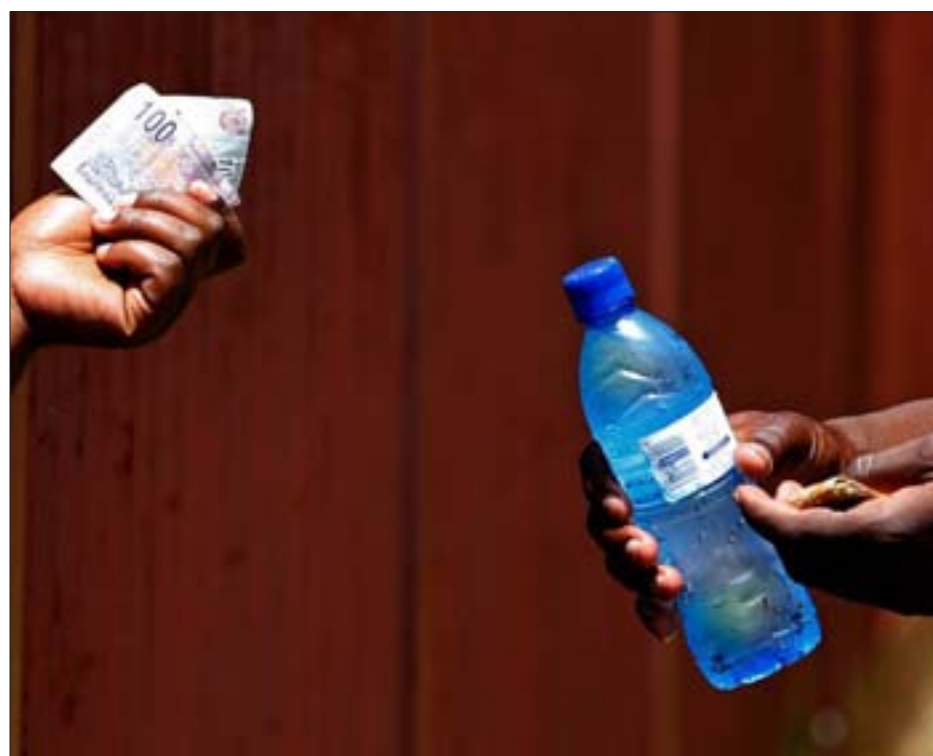
People buy water while waiting in a bus line to pay their respects to former South African President Nelson Mandela in Pretoria in 2013.

The capital has grappled with problems providing clean water for most of a decade, but an extended