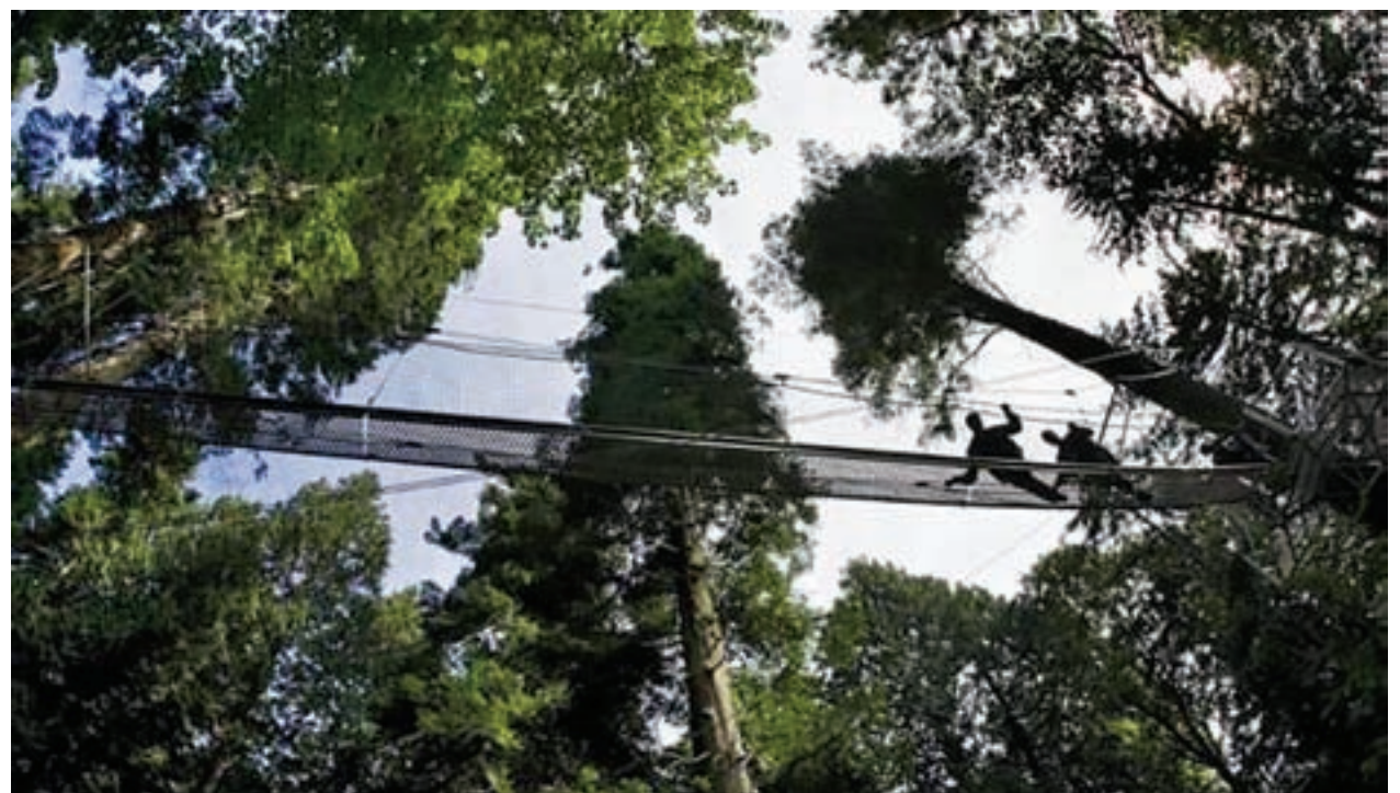
Visitors at the University of British Columbia's Botanical Garden walk along a forest canopy walkway in Vancouver, British Columbia in 2008.

By the early 2000s, environmental groups and industry players, including Interfor Corp, Western Forest Products Inc and Catalyst Paper Corp, had started talks. At the same time, the government began negotiating with the Coastal First Nations and