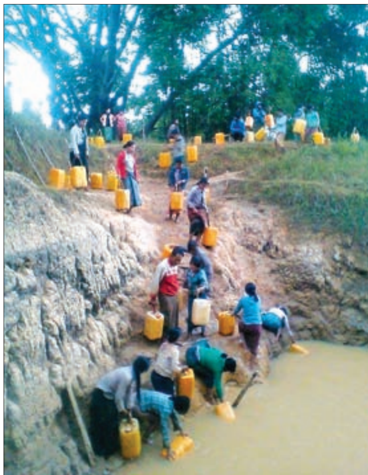
Villagers fetch water from a lake at a village in Heho Township.

"Over roughly 300 households have been hit with this water shortage. We are financially supporting efforts so that those people have enough access to water, working together with youth groups to give assistance. We're sourcing the water from the Heho dam," said Ko Aung Hsan, general