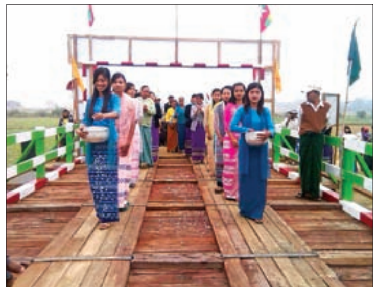
Opening ceremony of the Inter-village bridge in progress.

The bridge is a steel structure on reinforced concrete, 70 feet in length and 14 feet in width and was built with the use of the allotted fund of the Department of Rural Area Development for 2015-2016 FY.— Ko Ko Rupa(Nay Pyi Taw)