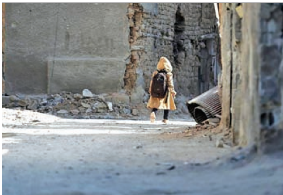
A child carries a school bag near damaged buildings in Harasta, in the eastern Damascus suburb of Ghouta, Syria on 30 January.

“We are here for a few days. Just to be clear,