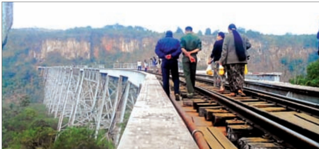
Gokhteik Viaduct.

CROWDS of local and foreign visitors continue to flock to the bridge over the Gokhteik Viaduct every day, despite the prohibition against tourists crossing the bridge, according to a spokesperson for the Gokhteik Railway Station.