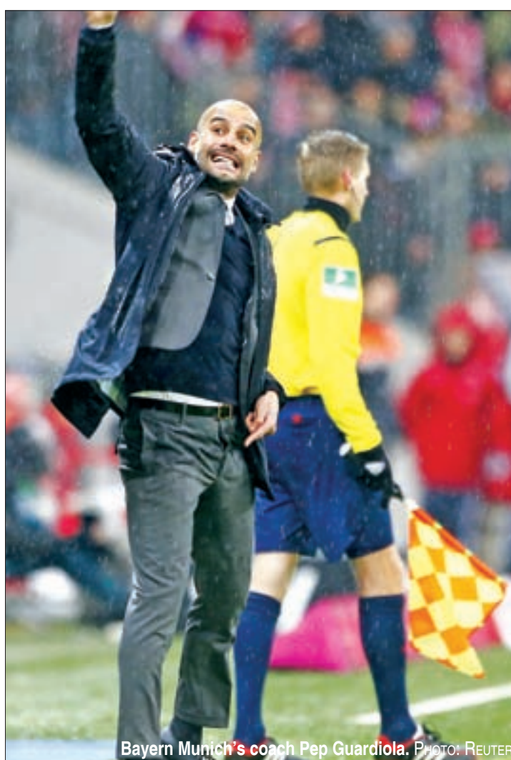
Bayern Munich's coach Pep Guardiola.

City's rivals sat up and took notice, with Liverpool manager Juergen Klopp saying Guardiola was on a mission to conquer Europe. "Pep won everything in Spain, nearly everything in Germany, so I think he wants to win everything in England, that is clear." While Guardiola will have a huge war chest to add to the squad in the summer, he might be surprised by the spending power of the Premier League's smaller clubs.—Reuters