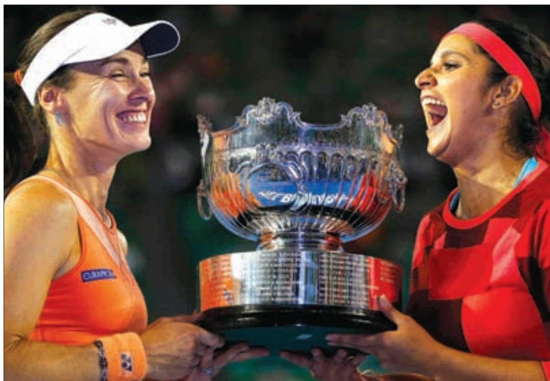
Switzerland's Martina Hingis (L) and India's Sania Mirza pose with the trophy after winning their doubles final match at the Australian Open tennis tournament at Melbourne Park, Australia, on 29 January.

Hingis, who was knocked out by Mirza and Croatia's Ivan Dodig in the mixed doubles quarter-finals, took a medical time out at the end of the first set to have treatment to her right shoulder, but did not appear troubled.