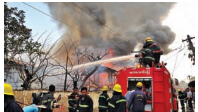
Firefighters putting out the fire.