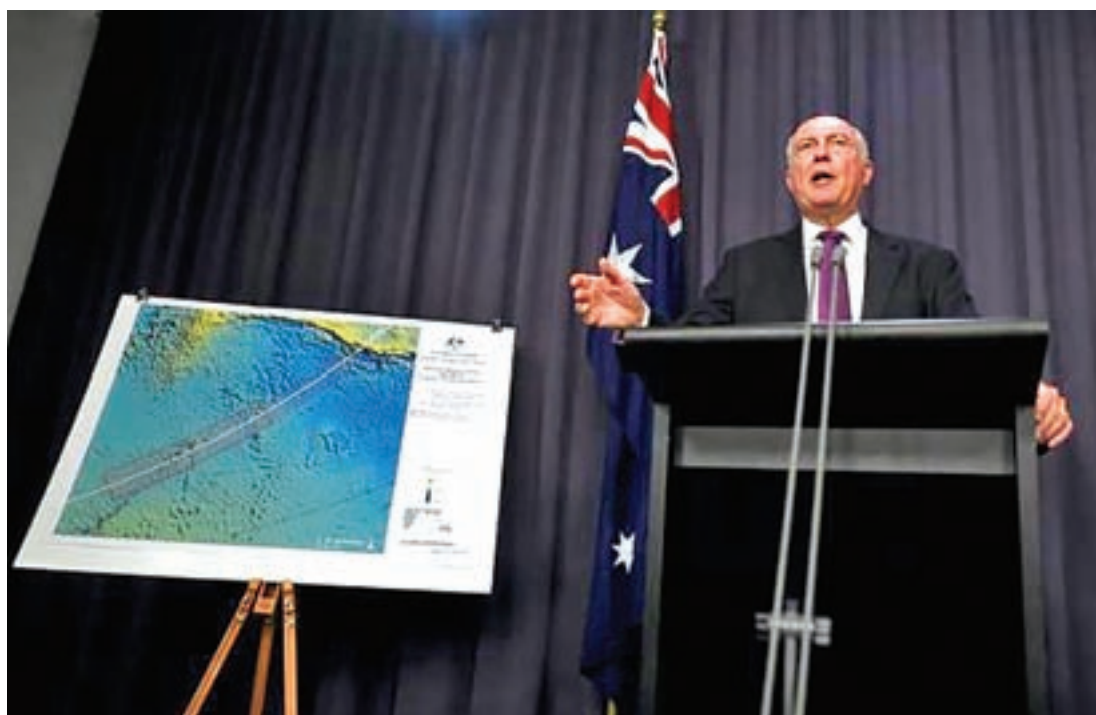
Australia's Deputy Prime Minister Warren Truss speaks during a media conference next to a map displaying the search area for missing Malaysia Airlines Flight MH370 at Parliament House in Canberra, Australia, in December 2015.

The presence of Dong Hai Jiu will take to four the number of vessels scouring a search area that has been expanded