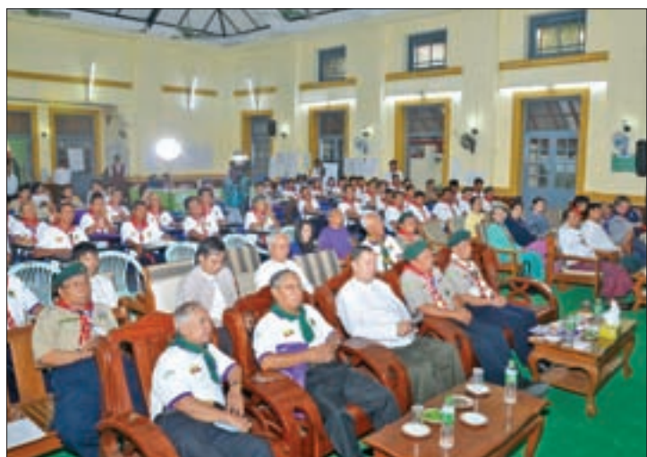
Myanmar scouts are seen at the concluding ceremony of strategy development workshop.

The workshop drew 50 scouts, including former scouts, from six regions and states.— Myanmar News Agency