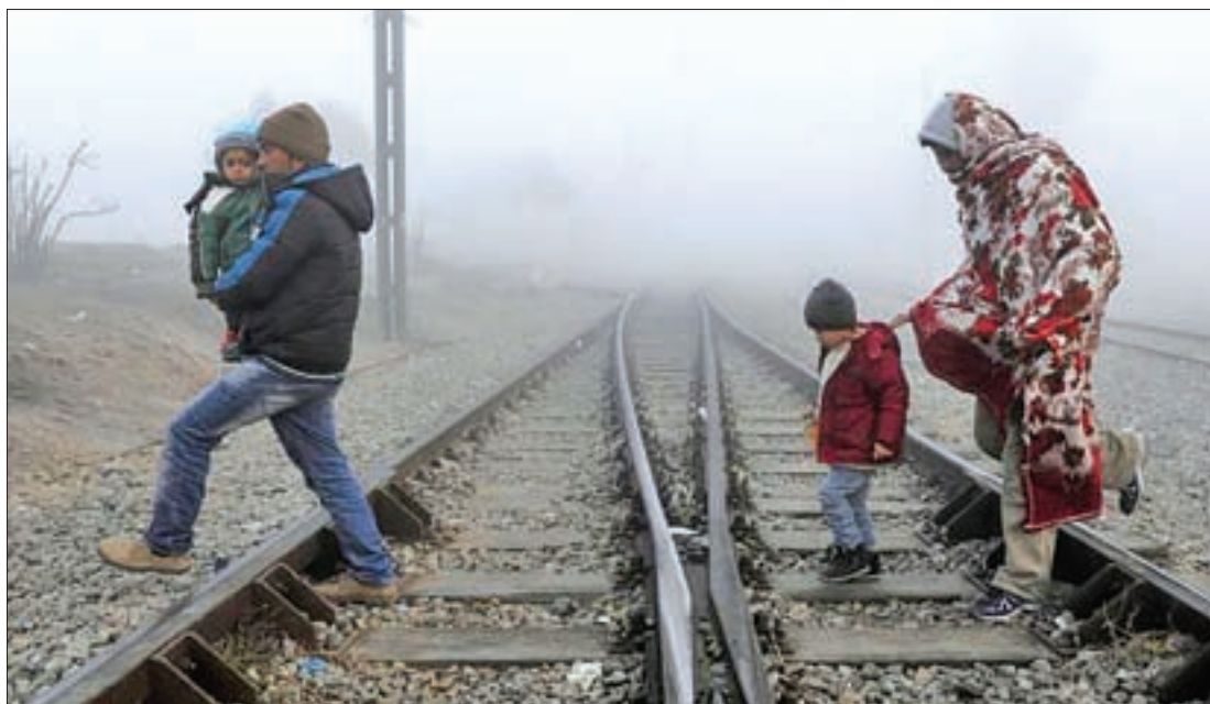
Migrants cross the railway tracks as they wait to cross the Greek-Macedonian border near the village of Idomeni, Greece, on 28 January 2016.

BRUSSELS/THE HAGUE — The Netherlands floated an idea on Thursday to ferry migrants reaching Greece straight back to Turkey to stop a relentless influx into the European Union as EU officials cited a rise in the numbers of those who would not qualify for asylum.