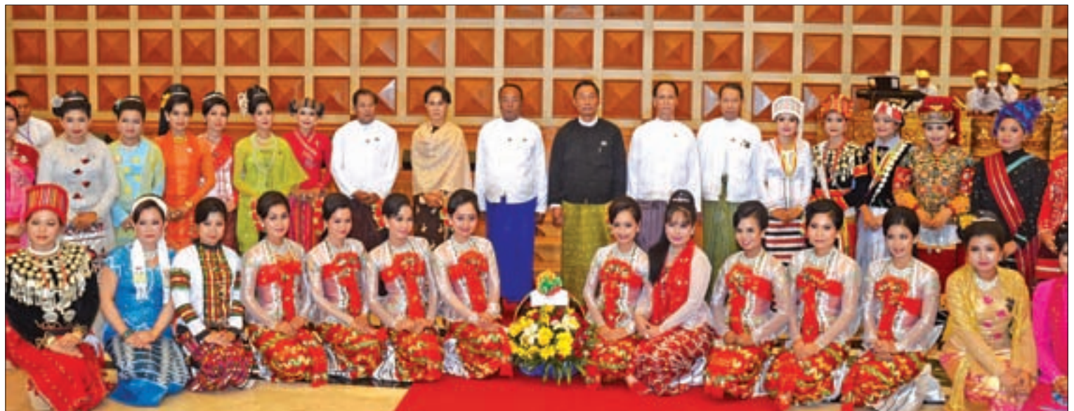
Vice President Dr Sai Mauk Kham poses for photo together with speakers, MPs and artistes at luncheon in honour of MPs.

The Amyotha Hluttaw Speaker and Daw Aung San Suu Kyi, chair of the National League for Democracy, spoke at the occasion.— Myanmar News Agency