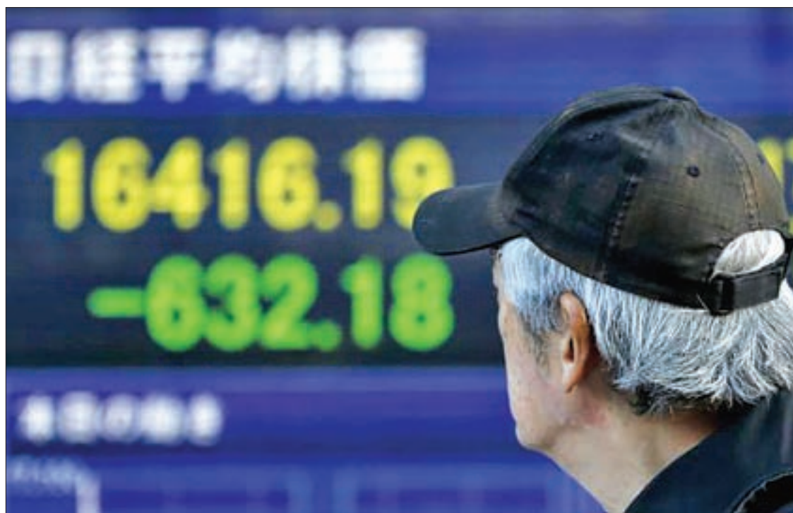
A man walks past an electronic board showing Japan's Nikkei average outside a brokerage in Tokyo, Japan on 20 January.

Asia-Pacific shares outside Japan .MIAPJ0000PUS added 1.8 per cent, up 2.7 per cent for the week.