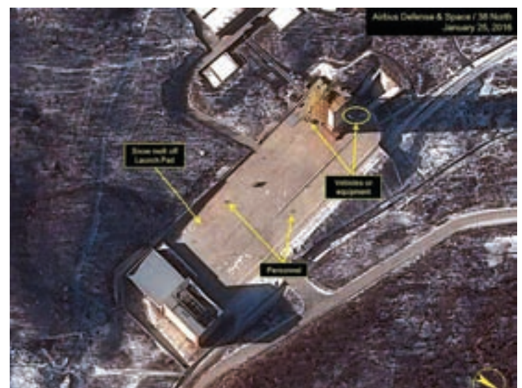
Airbus Defence & Space and 38 North satellite imagery dated 25 January, 2016 shows three objects at the base of the gantry tower that are either vehicles or equipment at Sohae Satellite Launching Station in North Korea in this image released on 28 January.

The analysis said commercial satellite images, taken as a series of "snapshots" from 28 December to 25 January, showed