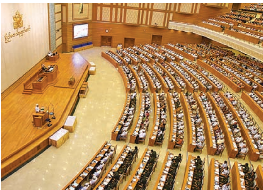
President U Thein Sein delivers an address at Pyidaungsu Hluttaw.

The following is the full text of the State of the Union Address delivered by the President at Pyidaungsu Hluttaw on 28 January, 2016.