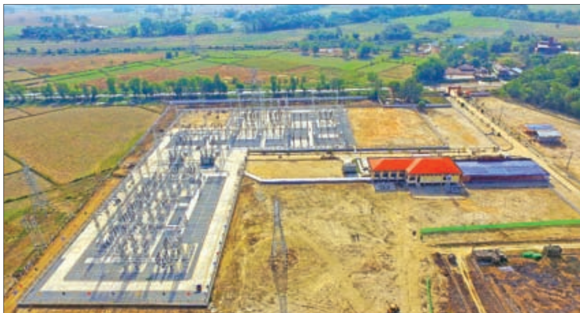
Newly opened power stations in Pathein.

TWO power stations in Pathein in the delta region were opened yesterday, as part of the equal access to electricity in Ayeyawady Region.