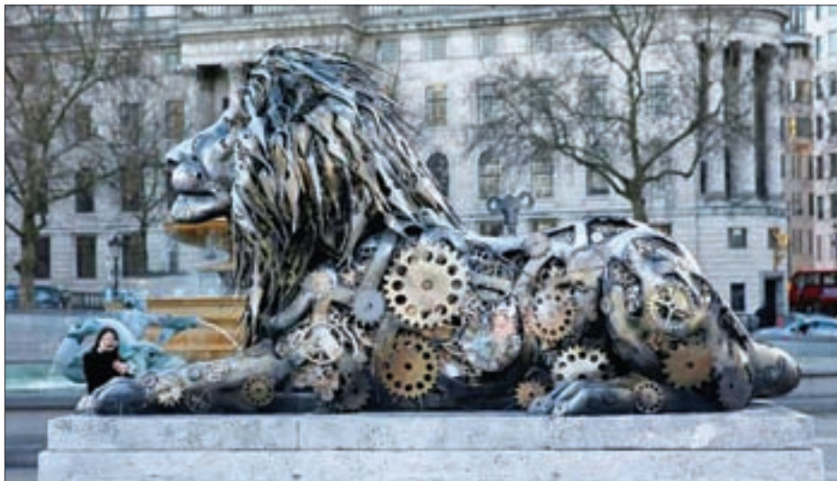
A pedestrian photographs a lion sculpture installed by National Geographic Wild to highlight the threat to endangered big cats, in Trafalgar Square in London, on 28 January 2016.

"I think most people don't believe actually lions are in danger," said Jeff Ford of television channel