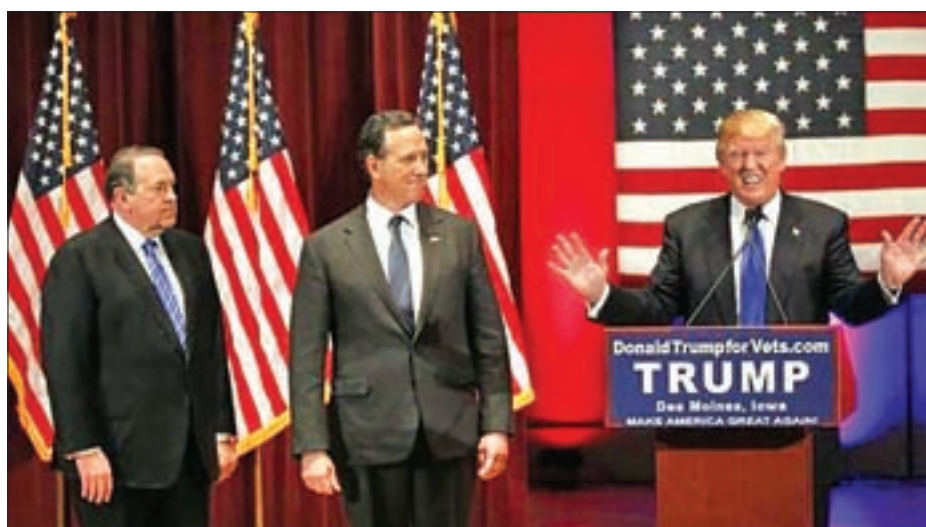
Republican US presidential candidate Donald Trump (R) introduces his Republican presidential candidate rivals Mike Huckabee (L) and Rick Santorum (C) at his veteran's rally in Des Moines, Iowa, on 28 January 2016.

The billionaire businessman has mounted his