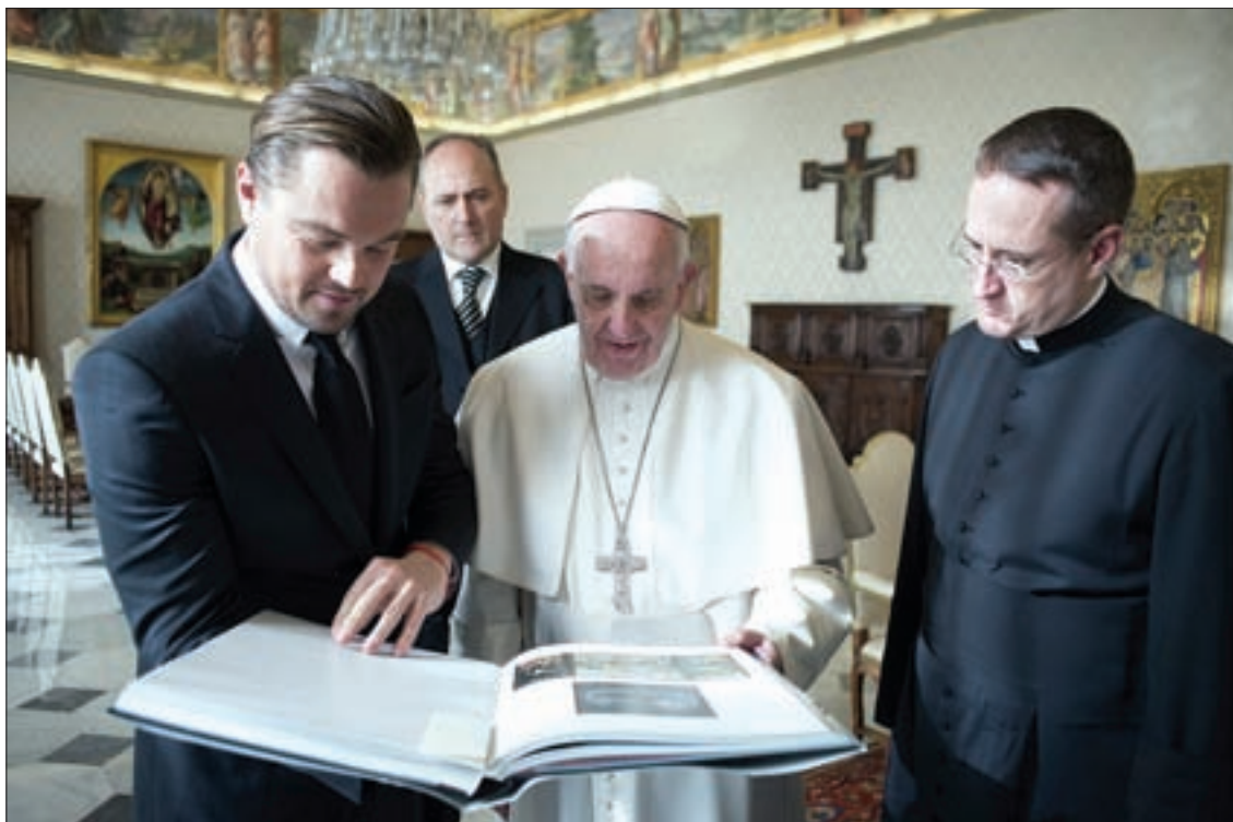
Pope Francis meets actor Leonardo DiCaprio at the Vatican, on 28 January.

Last week, the 41-year-old Oscar nominee was honoured at