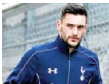
Tottenham's Hugo Lloris.

"We always want to improve and to develop our mentality to become a winning team. The road is still long but we feel we are improving all together and we are starting to be very hungry for the next few months