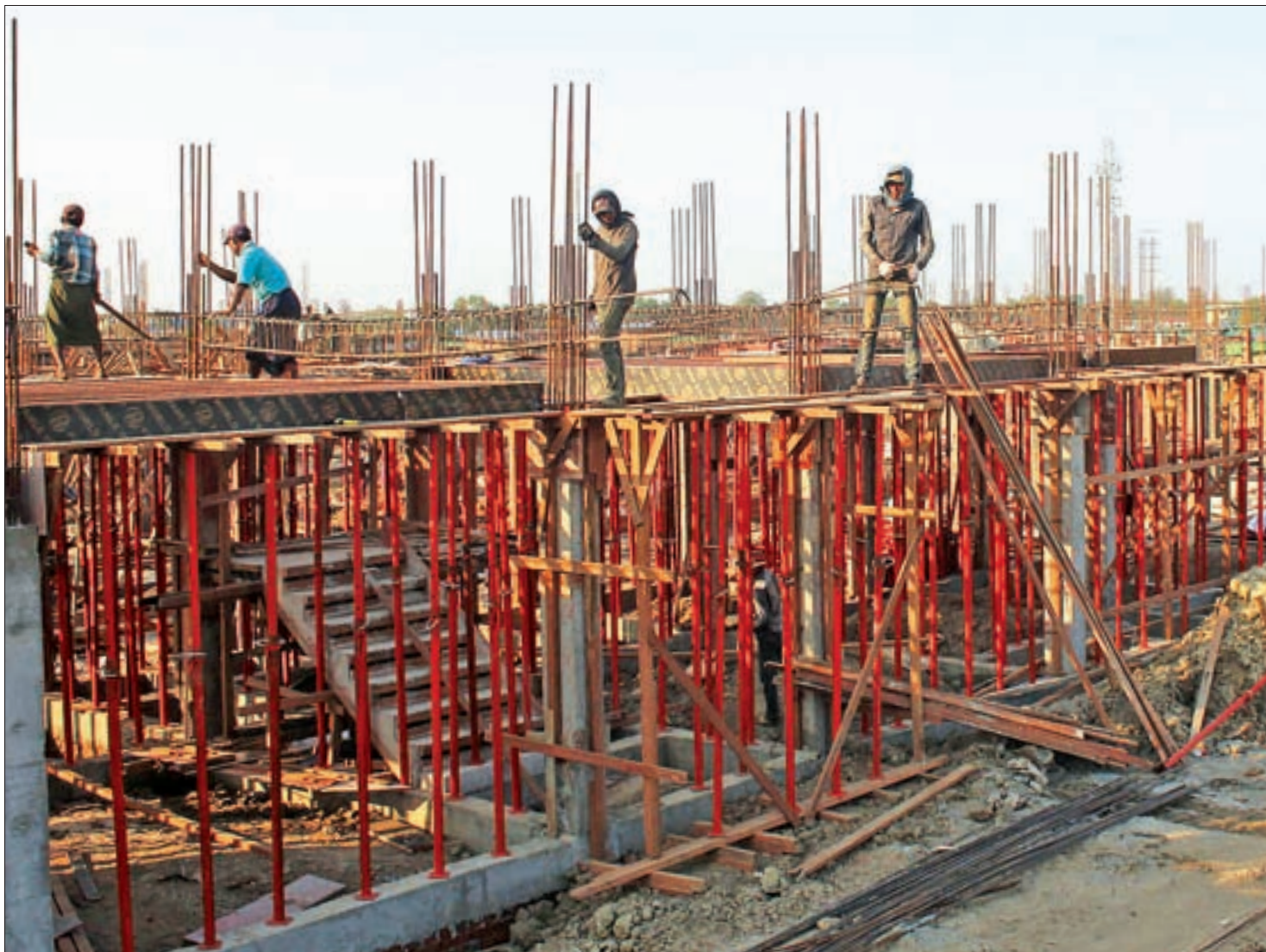
Workers put up houses for homeless Yangonites in Dagon Myothit at a site called The Mahabandoola Housing Complex.