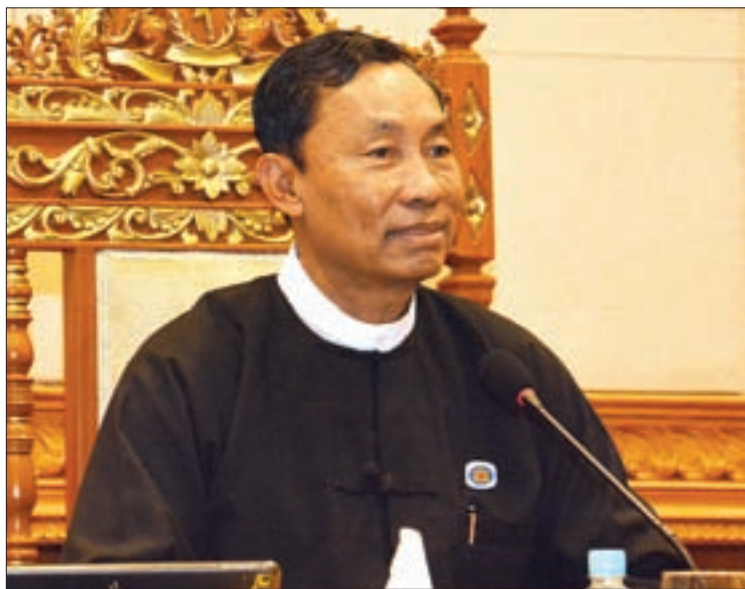
Pyidaungsu Hluttaw Speaker Thura U Shwe Mann gives a press conference.