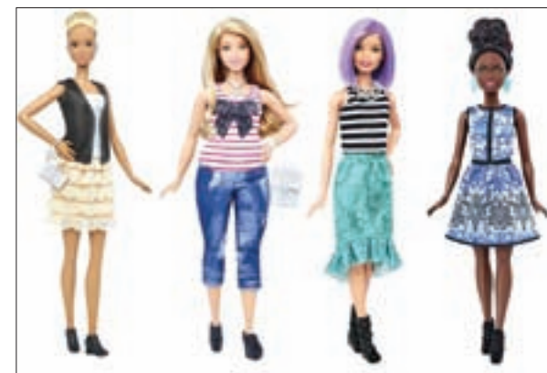
New Barbie doll body shapes of tall (L), curvy (2nd L) and petite (R) are seen next to the traditional Barbie (2nd R) in this image released by Mattel on 28 January. PHOTO: REUTERS

African-American Barbies and other ethnic versions were introduced starting in the late 1960s. —Reuters