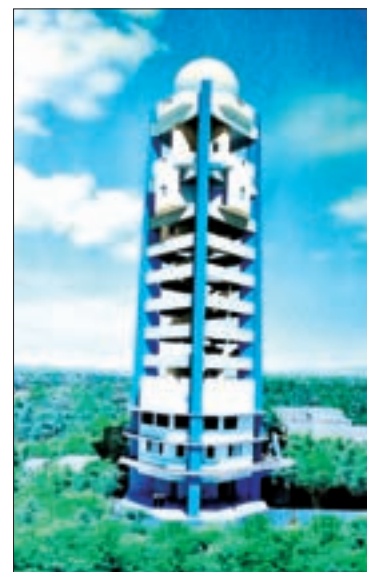
A scale model of a radar station in Mandalay.

Upon completion of three radar stations in Myanmar, weather forecast will be more accurate than before as the three stations will be able to exchange information with one another, added the director.— Aung Thet Khaing