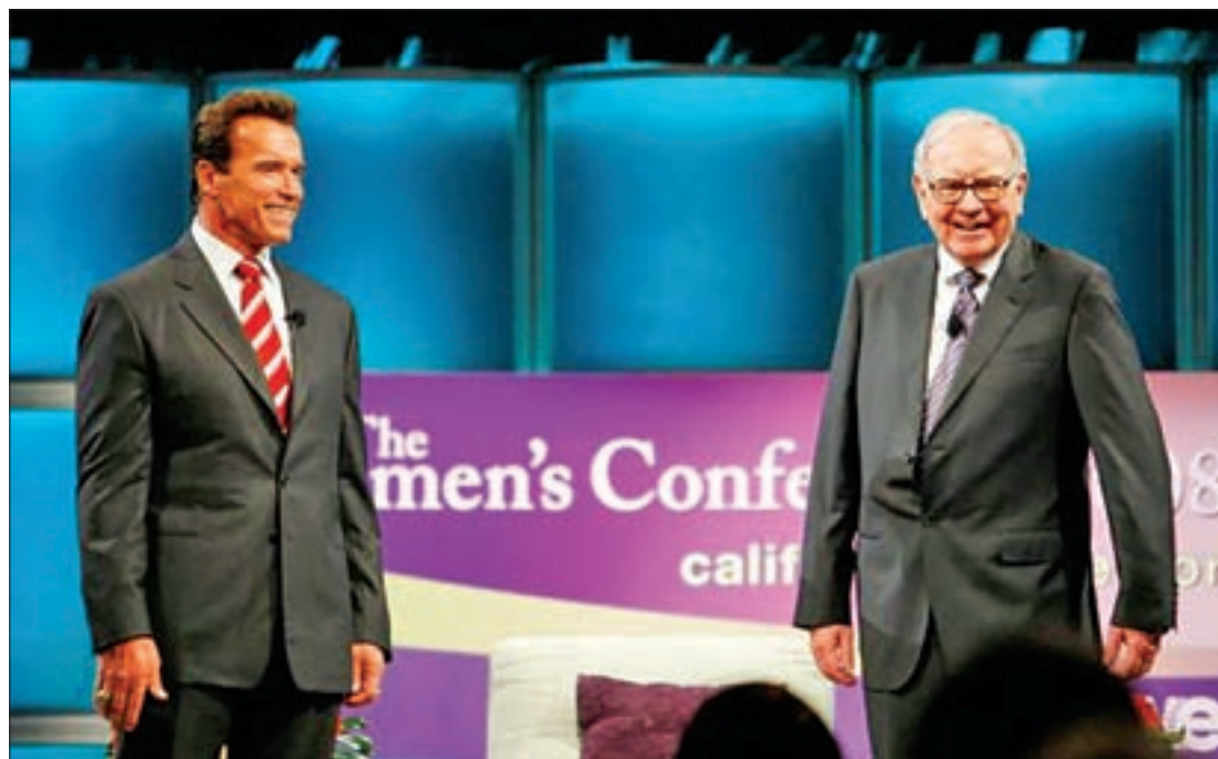
Arnold Schwarzenegger and Warren Buffett.

NEW YORK — Billionaire investor Warren Buffett has signed on as an advisor on the eighth season of NBC's "The Celebrity Apprentice," more than a decade after advising new host Arnold Schwarzenegger during his successful 2003 run to become California's governor.