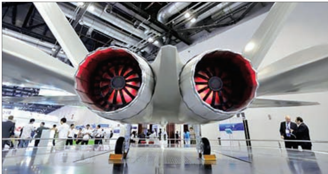
Foreign visitors stand next to a model of the J-31 stealth fighter at the Aviation Industry Corporation of China (AVIC) booth at the Aviation Expo China 2015 in Beijing, China, in September 2015.