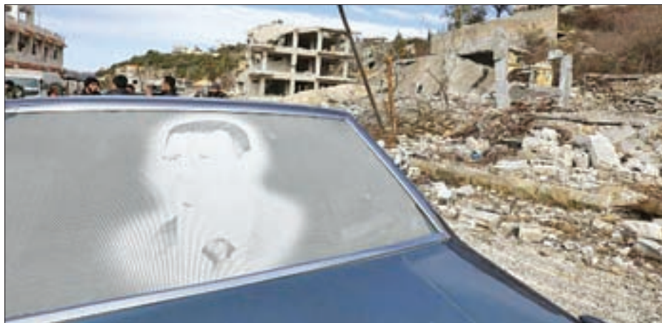
An image of Syria's President Bashar al-Assad is seen on a car parked in front of damaged buildings in the town of Rabiya, after pro-government forces recaptured the rebel-held town in coastal Latakia Province, Syria, on 27 January.