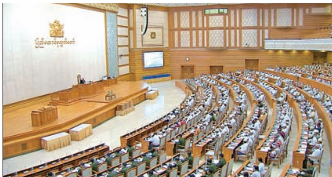
Pyidaungsu Hluttaw is being convened in Nay Pyi Taw.

THE 13 th regular session of the First Pyidaungsu Hluttaw continued for the 39 th day in Nay Pyi Taw yesterday, with parliamen-