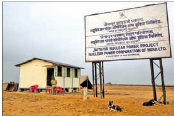
A policeman stands at a kiosk at the proposed site of the Jaitapur nuclear plant in Ratnagiri district, about 360 km (224 miles) south of Mumbai, in 2011.

Hollande and Prime Minister Narendra Modi said in a joint statement they had agreed to hasten the nuclear talks and aim for construction to begin in early 2017. EDF also said its EDF Energies Nouvelles unit had agreed to a partnership with India's SITAC to build four onshore wind farms by the end of 2016 with a total capacity of 142 MW in the state of Gujarat. — Reuters