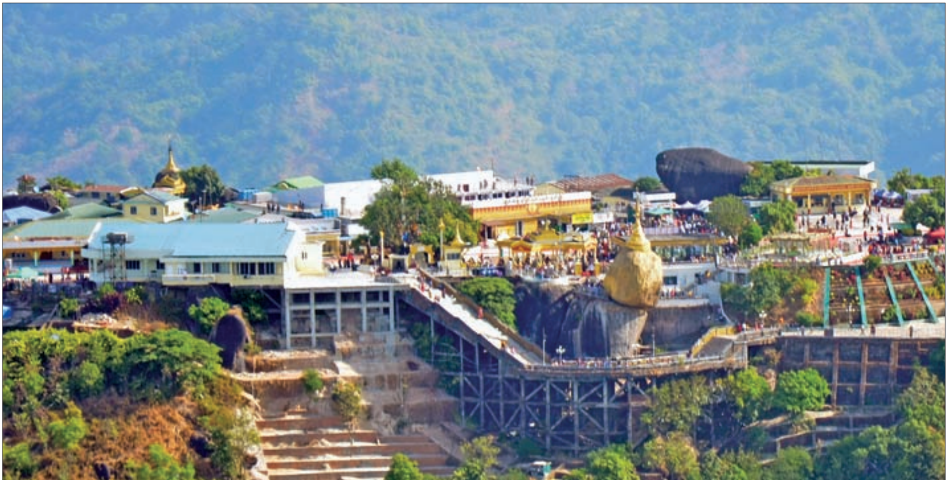
Panoramic view of Kyaikhtiyo Pagoda.