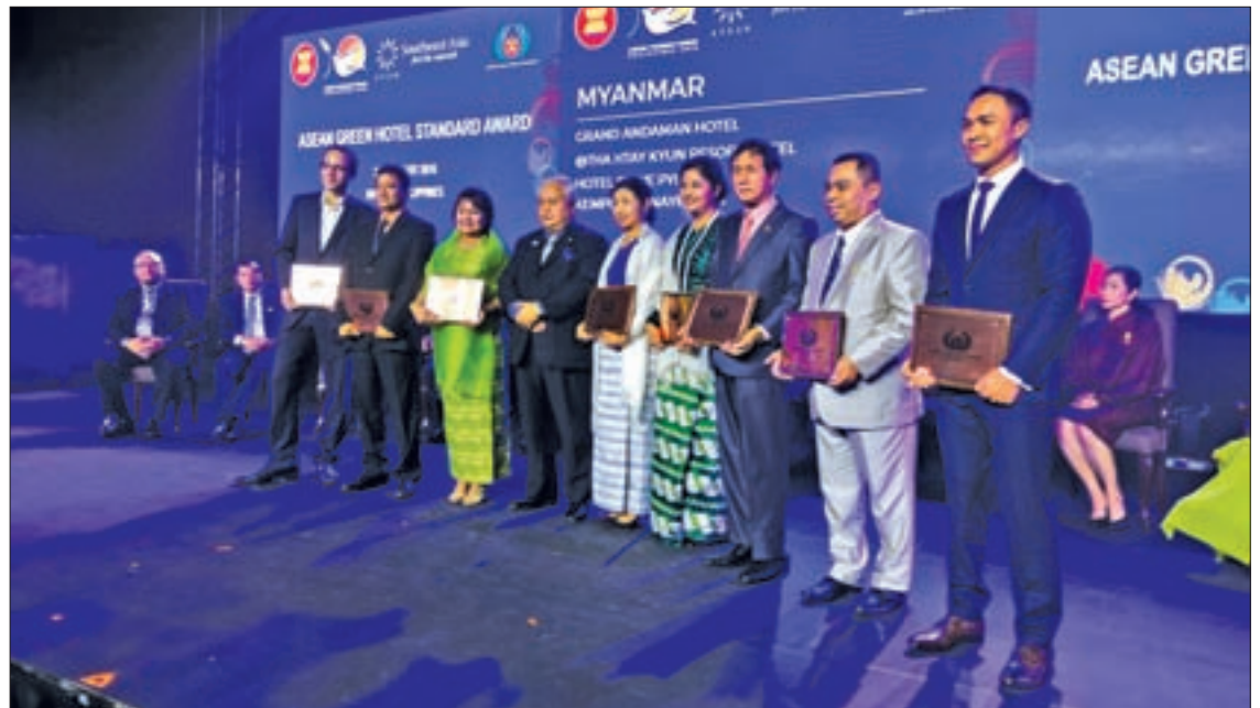
Hoteliers seen after receiving the awards.

EIGHT hotels from Myanmar won the ASEAN Green Hotel Award-2016.