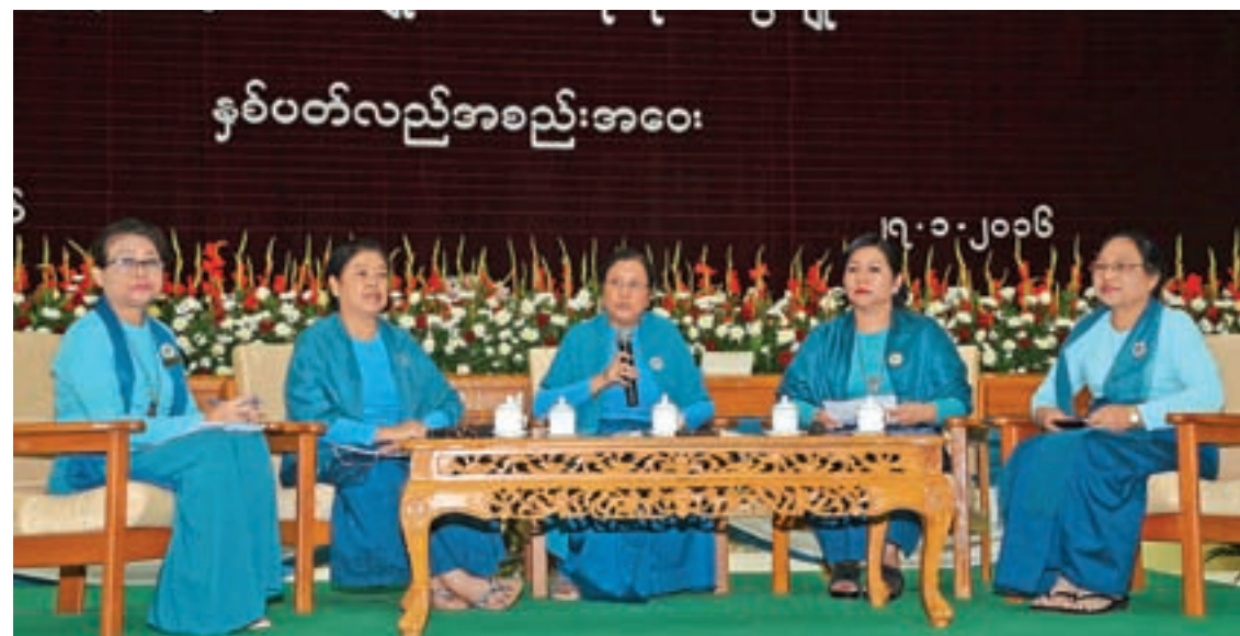
Participants are taking part in annual meeting of the Myanmar Women's Affairs Federation.

come generation programs, ways to stop violence against women, anti-human trafficking, legal assistance for the victims, protection of women and children affected by conflicts and natural disasters.— Myanmar News Agency