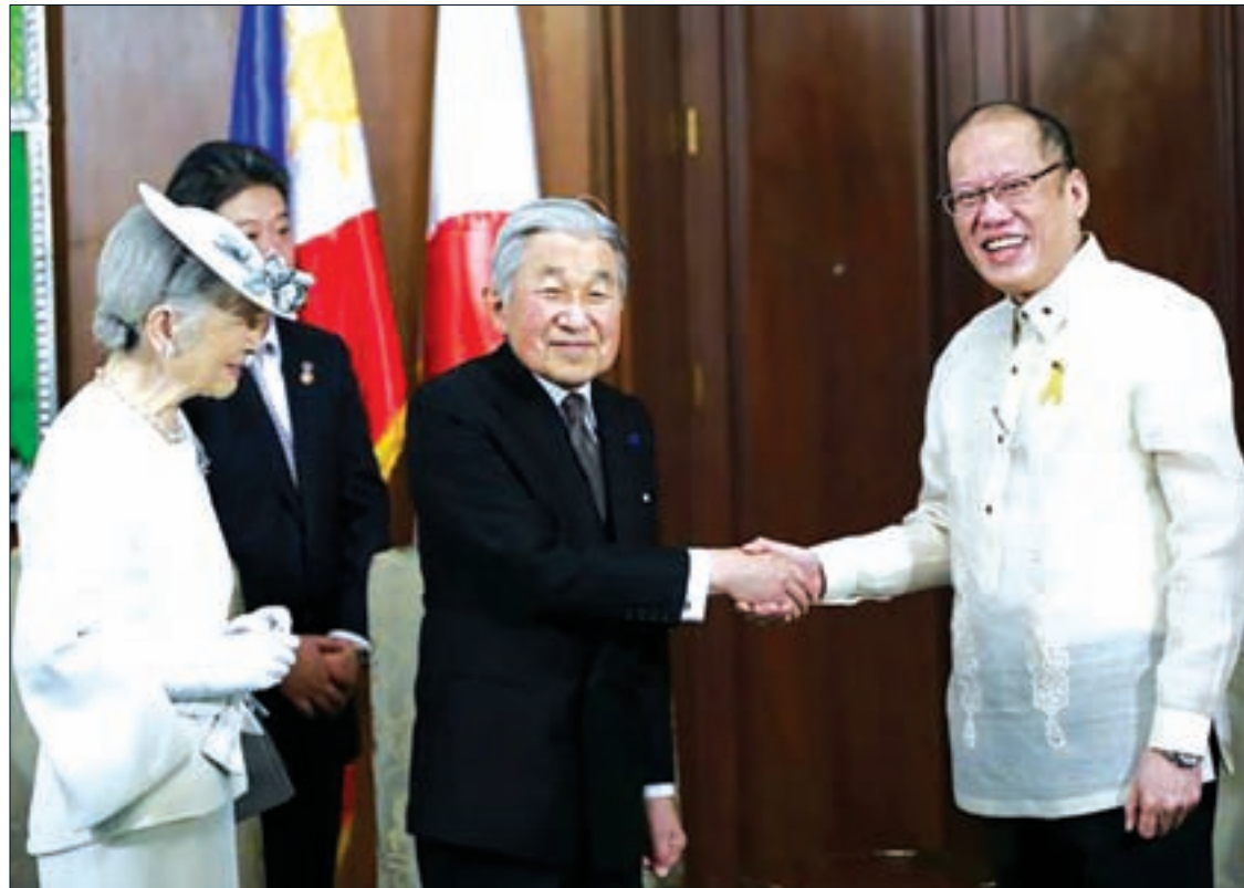
President Benigno Aquino greets visiting Japanese Emperor Akihito, while Empress Michiko watches, before the start of their meeting inside the presidential palace in Manila on 27 January.

The current emperor was 11 years old when Japan surrendered unconditionally in the war in August 1945.— Kyodo News