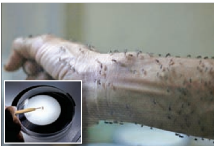
The forearm of a public health technician is seen covered with sterile female Aedes aegypti mosquitoes after leaving a recipient to cultivate larvae, in a research area to prevent the spread of Zika virus and other mosquito-borne diseases, at the entomology department of the Ministry of Public Health, in Guatemala City, on 26 January 2016.

On Monday, the World Health Organisation predicted the virus would spread to all countries across the Americas