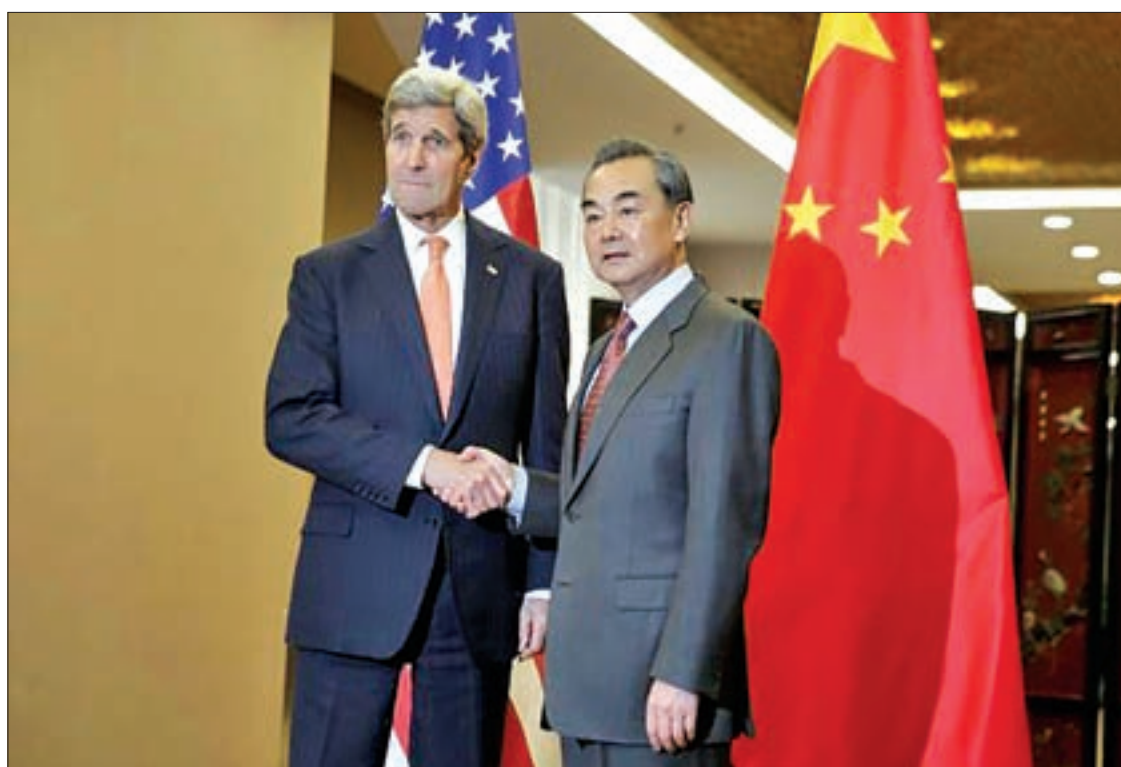
US Secretary of State John Kerry (L) and Chinese Foreign Minister Wang Yi shake hands before their bilateral meeting at the Ministry of Foreign Affairs in Beijing on 27 January 2016.

The 15-member UN Security Council said at the time of North Korea's test that it would begin working on significant new measures in response, a threat diplomats said could mean an ex-