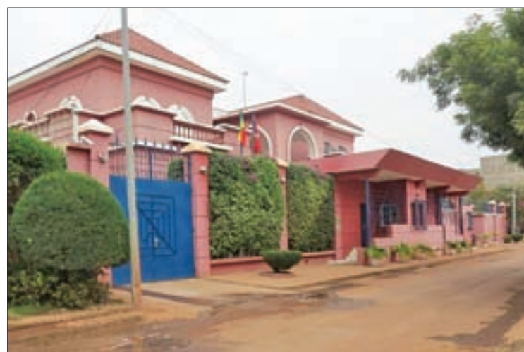
The Swiss Embassy is seen in Bamako, Mali.

Mali's expansive north has been unstable since 2012, when separatist rebels and jihadists seized the area. Although French forces scattered them from cities the following year, they have stepped up attacks in recent months.—Reuters