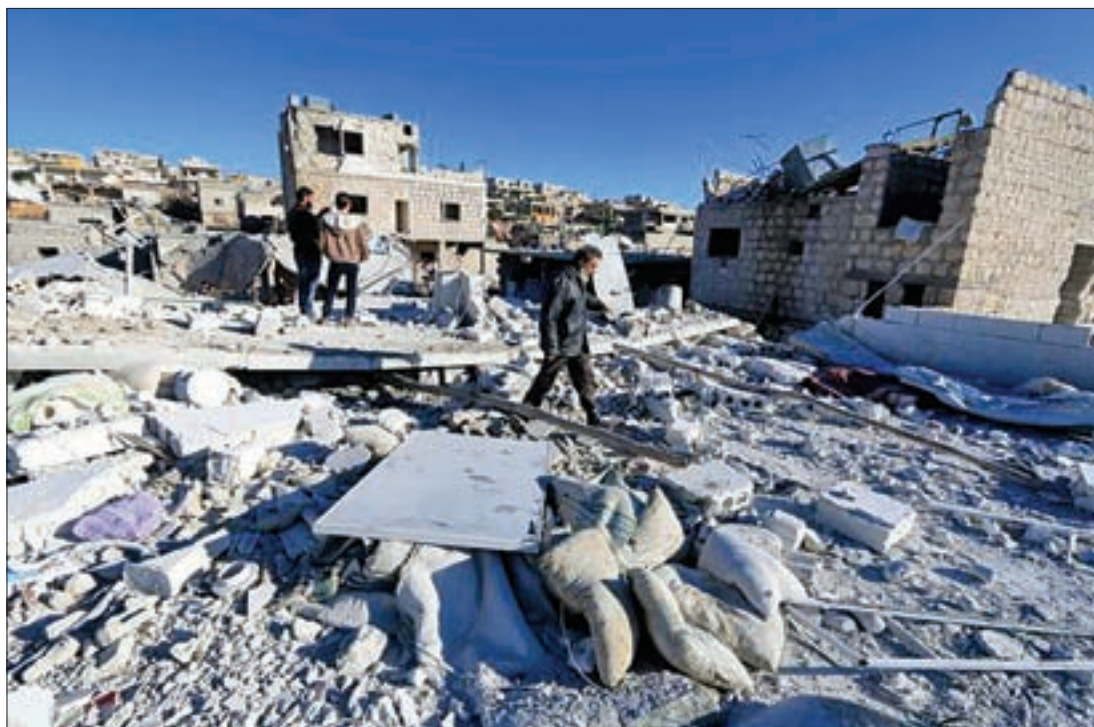
People inspect a site hit by what residents said were airstrikes carried out by the Russian air force in the town of Turmanin, in Idlib Governorate near the Syrian-Turkish border, on 25 January.

PARIS — France's foreign minister said yesterday the United Nations' special envoy to Syria had told him that he would not be inviting Syrian PYD Kurds to peace talks in Geneva and that a Riyadh-backed opposition group would lead the negotiations.