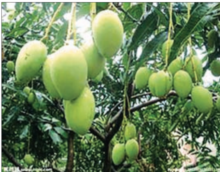
Seintalone mangoes.

Residents show greater interests in growing Seintalone plants this year. They currently purchase K500 (US$0.39) per three-month-old plant and K1,000 ($0.77) per one-year-old plant from Myeni Village in Kawlin Township.— Sai Lu Min