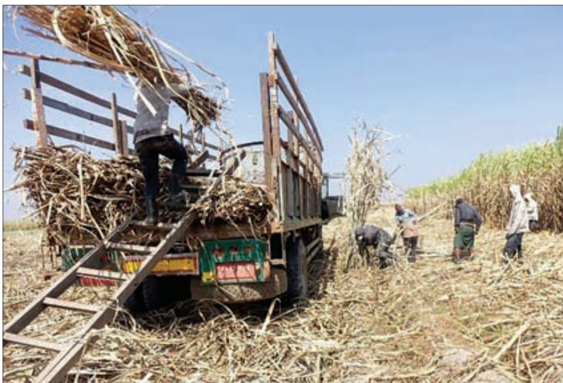
Sugar cane growers in Bago Region.

The Inngarkhwa sugar refinery used to be able to process 2,000 tonnes of sugar a day, but machinery malfunctions have caused fluctuations in the daily amount of sugar that can be refined, resulting in trucks transporting the sugar cane habitually having to queue up for days at a