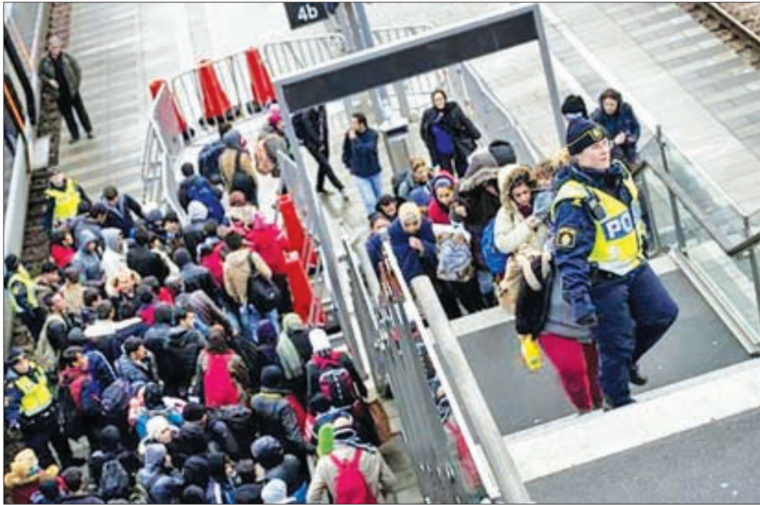
Police organise the line of refugees at on the stairway leading up from the trains arriving from Denmark at the Hyllie train station outside Malmö, Sweden, in November 2015.

COPENHAGEN — Denmark's parliament passed measures on Tuesday aimed at deterring refugees from seeking asylum, including confiscating valuables to pay for their stay, despite protests from international human rights organisations.