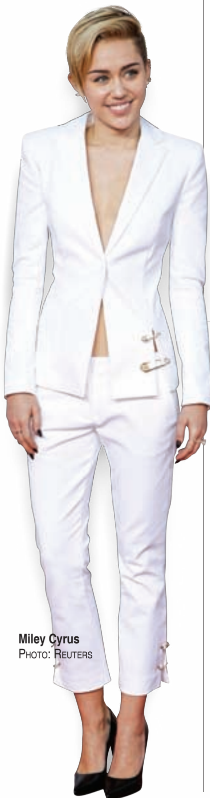
Miley Cyrus

The yet untitled, six half-hour-episode series, will mark the first collaboration between the former Disney star and Allen. Filming of the project will begin in March.—PTI