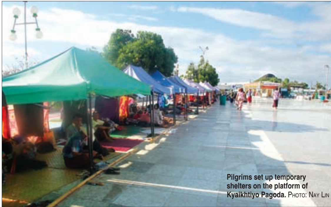
Pilgrims set up temporary shelters on the platform of Kyaikhtiyo Pagoda.