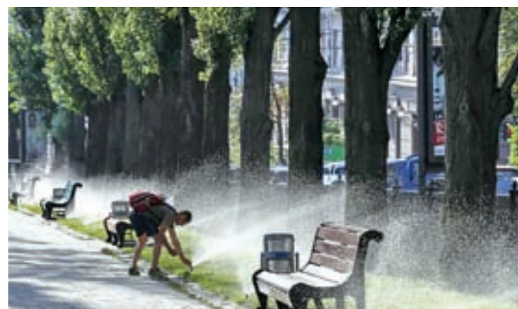
A man cools off in a water sprinkler in a park during a hot summer morning in central Kiev, Ukraine in 2015.

“Recent observed runs of record temperatures are extremely unlikely to have occurred in the absence of human-caused global warming,” a US-led team of experts wrote in the journal Scientific Reports . Written before 2015 temperature data were released, it estimated the chance of the record run — with up to 13 of the 15 warmest years all from 2000 to 2014 — was between one in 770 and one in 10,000 if the series were random with no human influence.