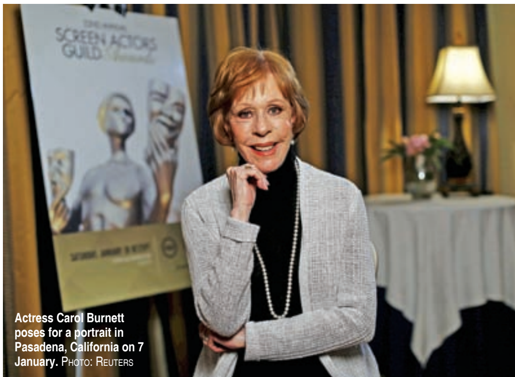
Actress Carol Burnett poses for a portrait in Pasadena, California on 7 January.