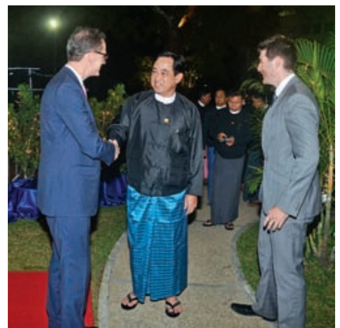
Union Minister for Energy U Zeyar Aung is being welcomed by Ambassador of Australia to Myanmar Mr Nicholas Coppel on his arrival at a reception to mark the National Day of Australia in Yangon Wednesday.

"Tourist carriers have said that they can't meet expenses by just ferrying passengers. Their business is only viable if they can also make earnings from transporting goods. As such, permission to transport goods should be brought back," said U Win Kyaing.—Myitmakha News Agency