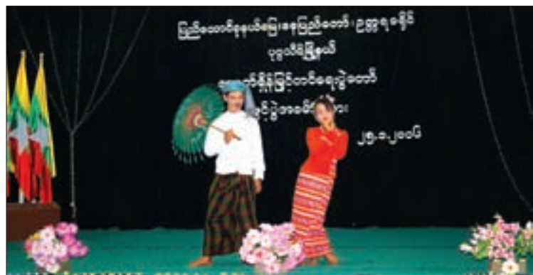
No 20. BEHS performed the U Shwe Yo and Daw Moe dance.

that sugar cane growers receive less for their crops than estimated, resulting in financial losses.—Myitmakha News Agency