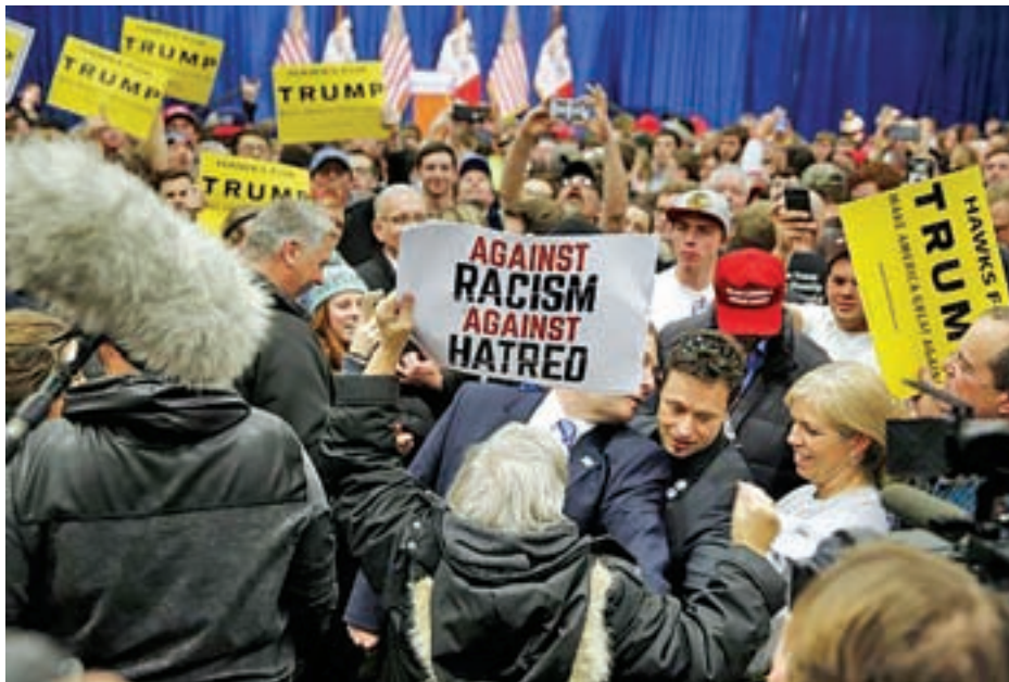
A protester holding a sign against racism and hatred is removed from US Republican presidential candidate Donald Trump's campaign rally at the University of Iowa in Iowa City, Iowa, on 26 January.

He also expressed displeasure at a Fox News statement on Monday night saying Trump would have to learn sooner or later that