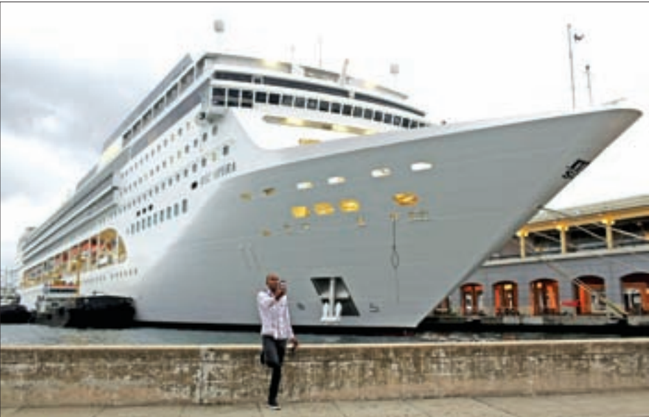
A man takes selfies in front of the passengers cruise ship MSC Opera in Havana on 13 January.

HAVANA — Cuba’s tourism industry is under unprecedented strain and struggling to meet demand with record numbers of visitors arriving a year after detente with the United States renewed interest in the Caribbean island. Its tropical weather, rich musical traditions,