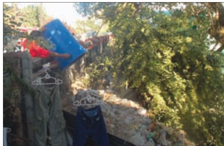
A woman throws away garbage litters.

In accordance with his instruction, local authorities are drawing a master plan for the sustainability of the mountains and environment.