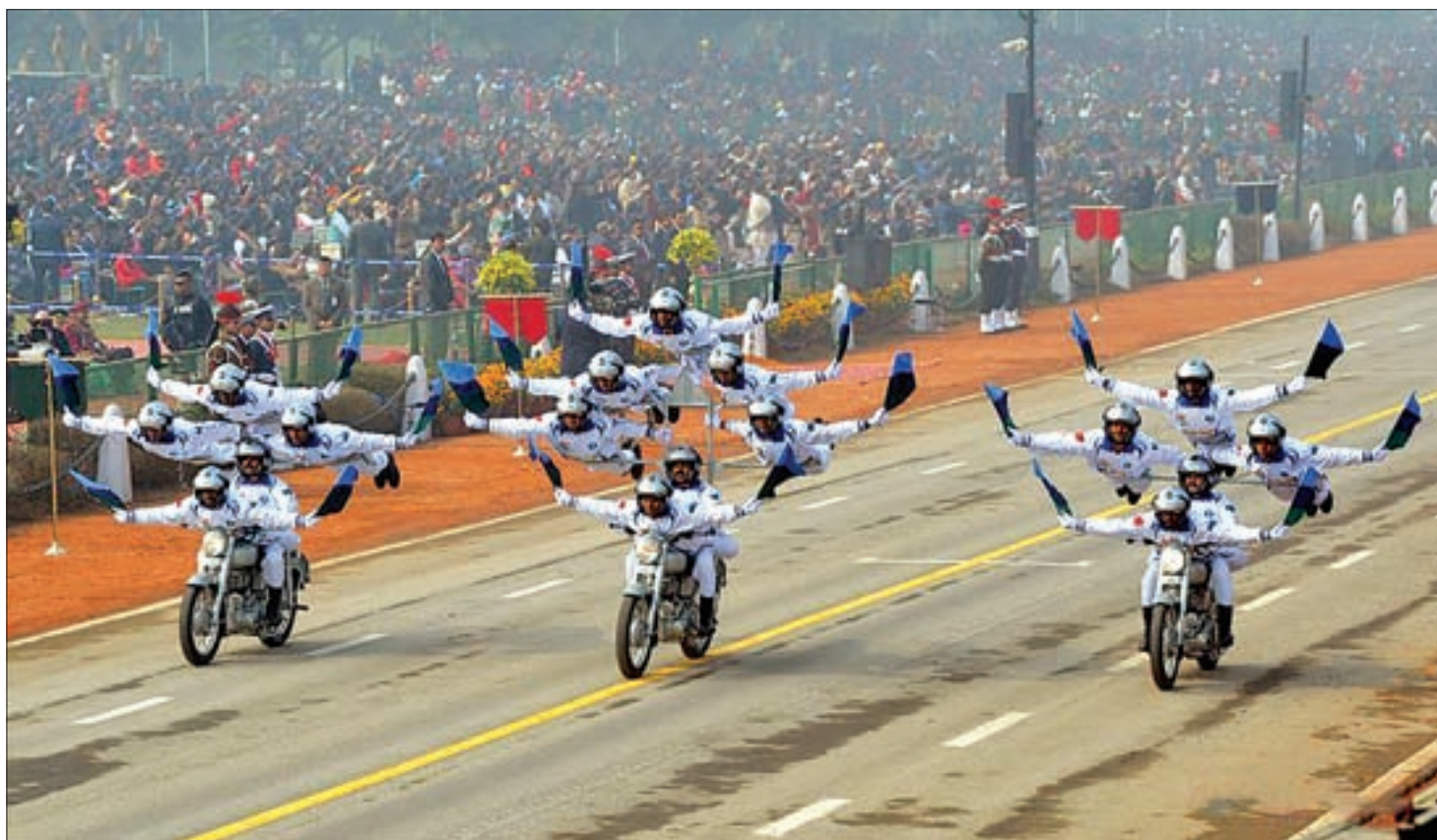
Daredevils of Indian Corps of Signals move with motorcycles during the 67 th Republic Day Parade in New Delhi, India, on 26 January 2016. India on Tuesday displayed its military might at its 67 th Republic Day parade in the national capital, with French President Francois Hollande as the chief guest.