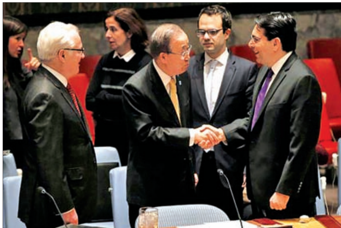
United Nations Secretary General Ban Ki-moon greets Israel's Ambassador to the UN Danny Danon (R) as Russian Ambassador Vitaly Churkin looks on (L) before a UN Security Council meeting on the Middle East at UN headquarters in New York, on 26 January.

"These provocative acts are bound to increase the growth of settler populations, further