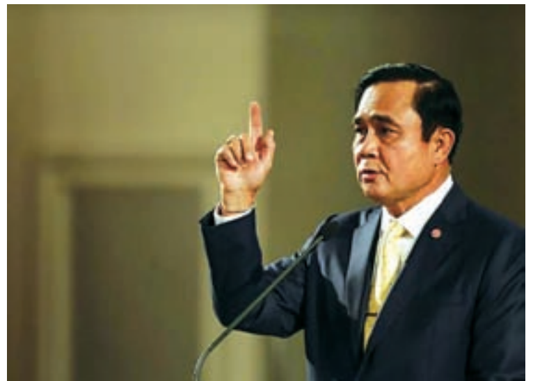
Thailand's Prime Minister Prayuth Chan-ocha addresses the nation and summarises the junta government's annual report in Bangkok, Thailand on 23 December 2015.