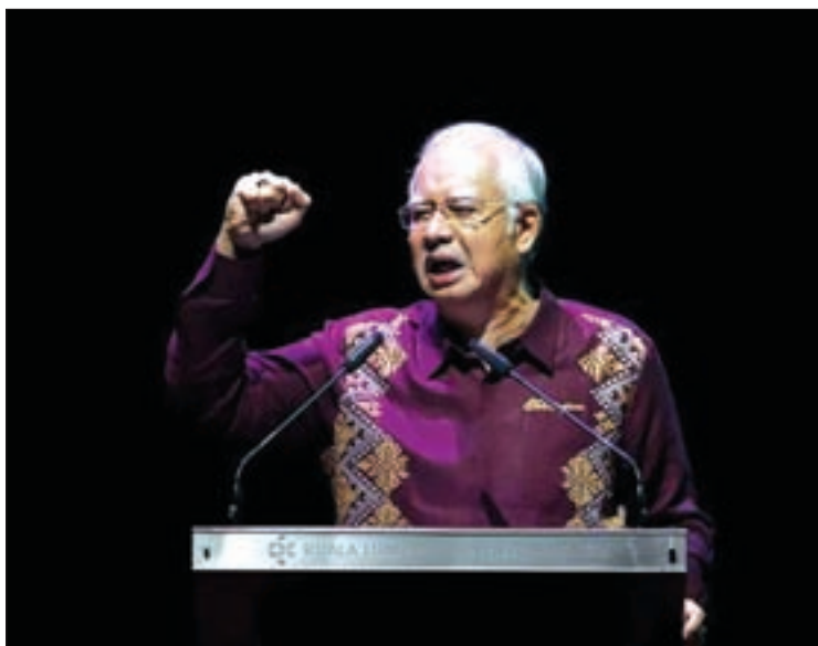
Malaysia's Prime Minister Najib Razak.

Apandi said in a statement that $620 million was returned to the Saudi royal family in August