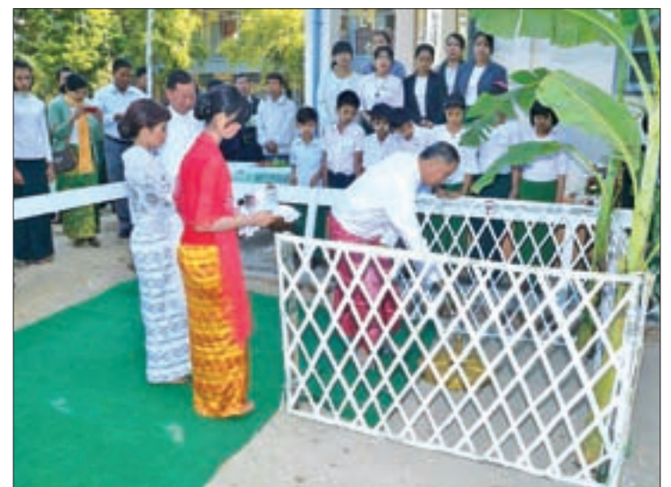
A ground breaking ceremony in progress.

A ground breaking ceremony for construction of a new school building for No (1) Basic Education Middle School was held at the school in Pyay, Bago Region on Thursday.