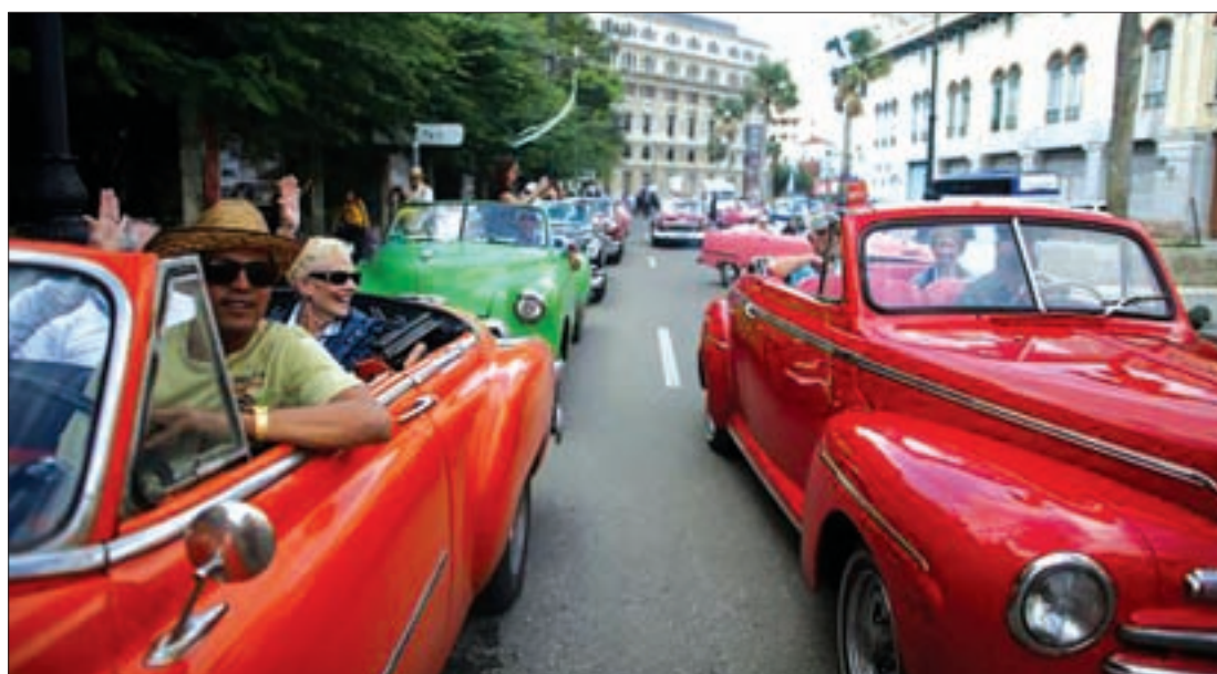
Tourists enjoy a ride in vintage cars in old Havana on 17 January 2016.

HAVANA — Cuba's tourism industry is under unprecedented strain and struggling to meet demand with record numbers of visitors arriving a year after détente with the United States renewed interest in the Caribbean island.