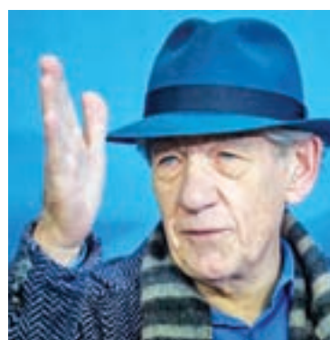
Actor Ian McKellen.

to take a bus ride around those buildings and say, 'Look, that's where we were', and then the bus show extracts from the film," McKellen told Reuters.