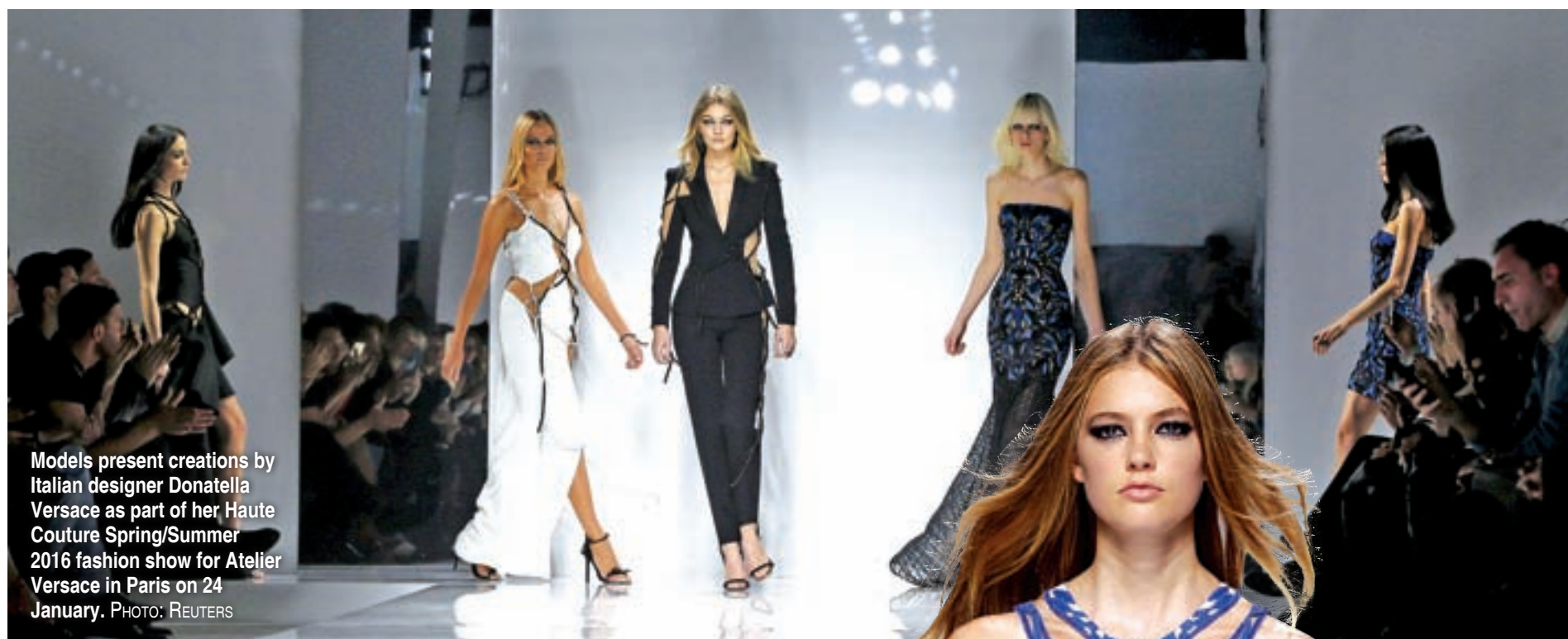
Models present creations by Italian designer Donatella Versace as part of her Haute Couture Spring/Summer 2016 fashion show for Atelier Versace in Paris on 24 January.