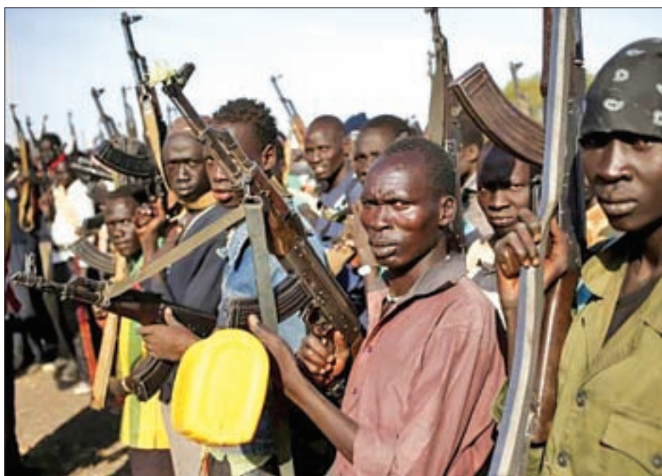
Jikany Nuer White Army fighters holds their weapons in Upper Nile State, South Sudan on 10 February 2014.

The 15-member Security Council has long-threatened to impose an arms embargo, but veto power Russia, backed by council member Angola, has been reluctant to support such an action. Russia's UN Ambassador Vitaly Churkin said on Monday he was concerned that an arms embargo would be one-sided because it would be easier to enforce on the government.