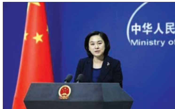
Hua Chunying, spokeswoman of China's Foreign Ministry, speaks at a regular news conference in Beijing, China, on 6 January 2016.