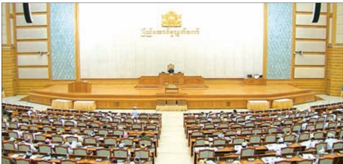
Pyidaungsu Hluttaw is being convened in Nay Pyi Taw.

Next, presentation of the reports of the respective committees followed, and members of Union-level organisations responded to the reports. — Myanmar News Agency