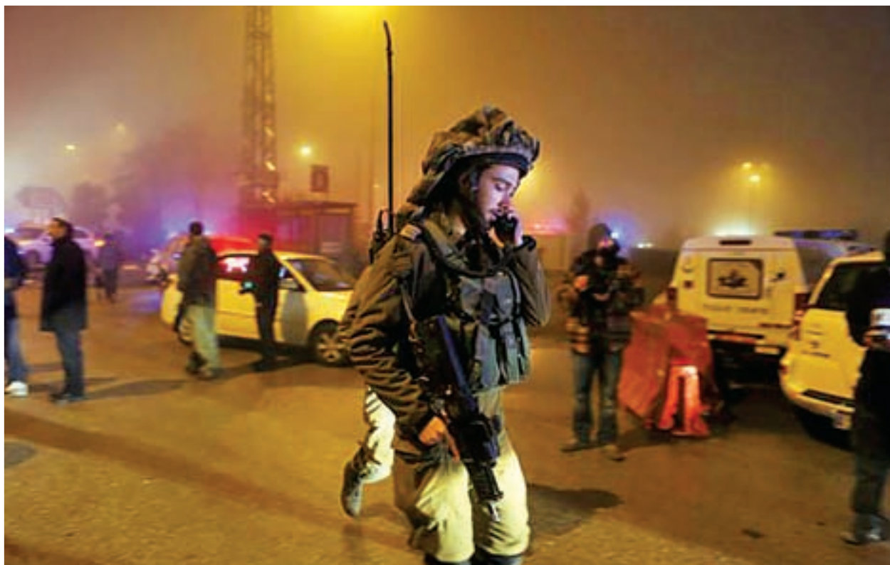
An Israeli soldier secures the area near the scene of what Israeli police said was a stabbing attack by two Palestinians on two Israelis in the West Bank Jewish settlement of Beit Horon near Jerusalem on 25 January.

JERUSALEM — An Israeli woman died on Tuesday of wounds suffered in a stabbing attack in a Jewish settlement in the occupied West Bank a day earlier in which two Palestinian assailants were shot dead, police said.