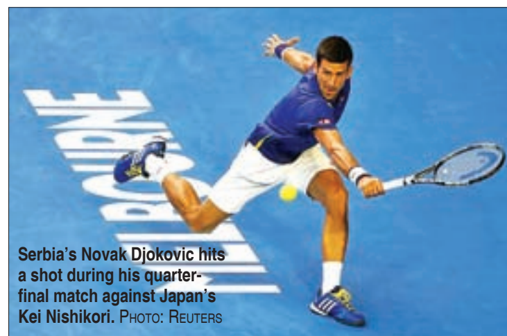
Serbia’s Novak Djokovic hits a shot during his quarter-final match against Japan’s Kei Nishikori.

on his own serve and threw his racket onto the court in a rare show of frustration. Djokovic fired a sizzling cross-court backhand winner to close out the match and will make his sixth appearance in the last four at Melbourne Park, having avenged his loss to Nishikori in the 2014 US Open semi-finals.—Reuters