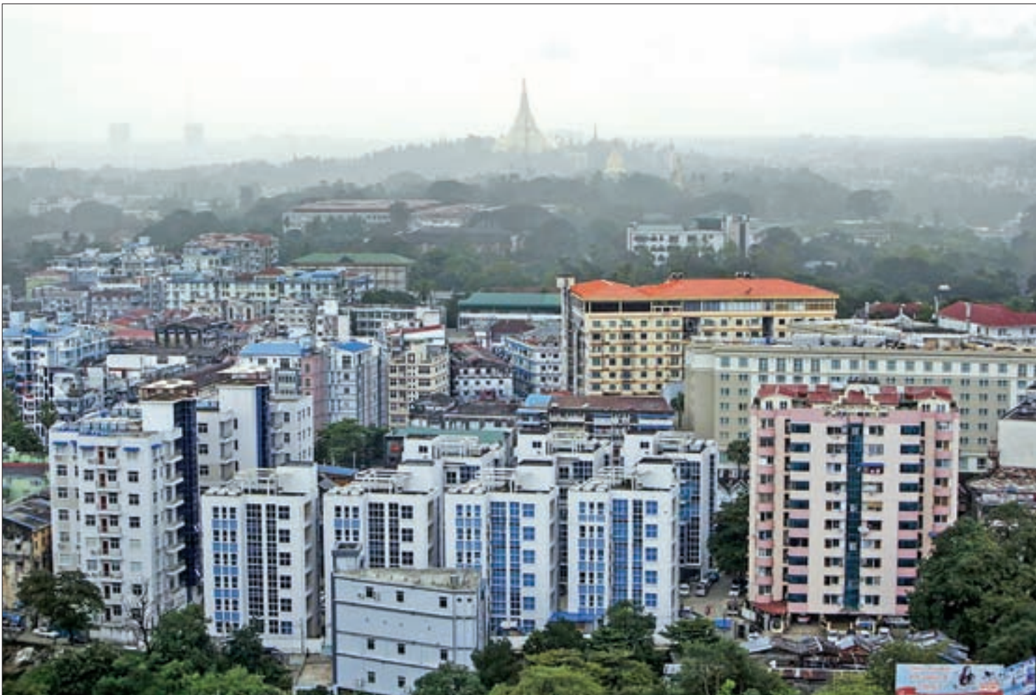
Looking over a cluster of rental apartments toward Shwedagon Pagoda, Yangon.