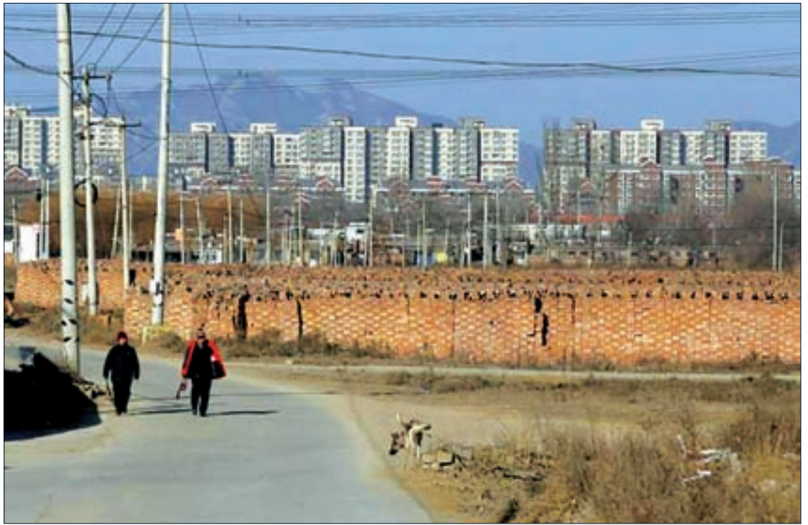
People walk past stacks of bricks in a field near new residential compounds, at a village in Beijing, China, on 18 January 2016.

closures are just one of many tactics adopted to make the city's air less noxious. Others include closing or relocating coal-fired power plants, many of which are operated by large state-owned businesses, forcing old cars off roads and limiting outdoor construction.