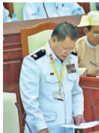
Commodore Aung Thaw.

THE 13 th regular session of the First Pyithu Hluttaw (Lower House) entered its 29 th day in Nay Pyi Taw yesterday, approving a proposal to seek final approval of the former Presi-