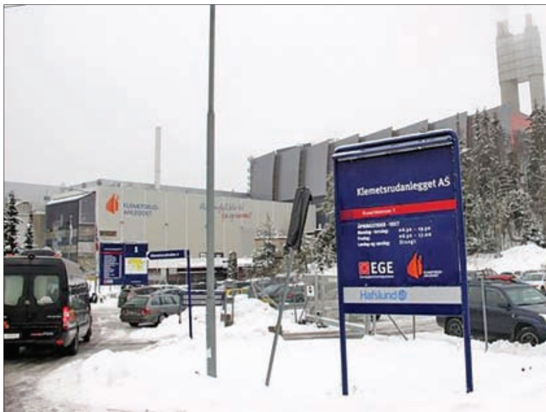
A general view of the Klemetsrud incinerator in Oslo, Norway, on 25 January 2016.

The test plant, in five containers feeding exhaust gases through a series of pipes and filters, will capture carbon dioxide at a rate equivalent to 2,000 tonnes a year until the end of