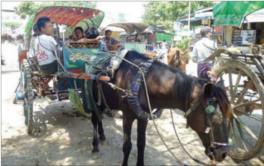
Horse-drawn carriages seen in Minbu.

HORSE-drawn carriage in Minbu Township is going to disappear soon as the region sees the increasing number of three-wheeled vehicles and motorcycles.