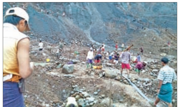
Migrant workers are scavenging for leftover Jade.