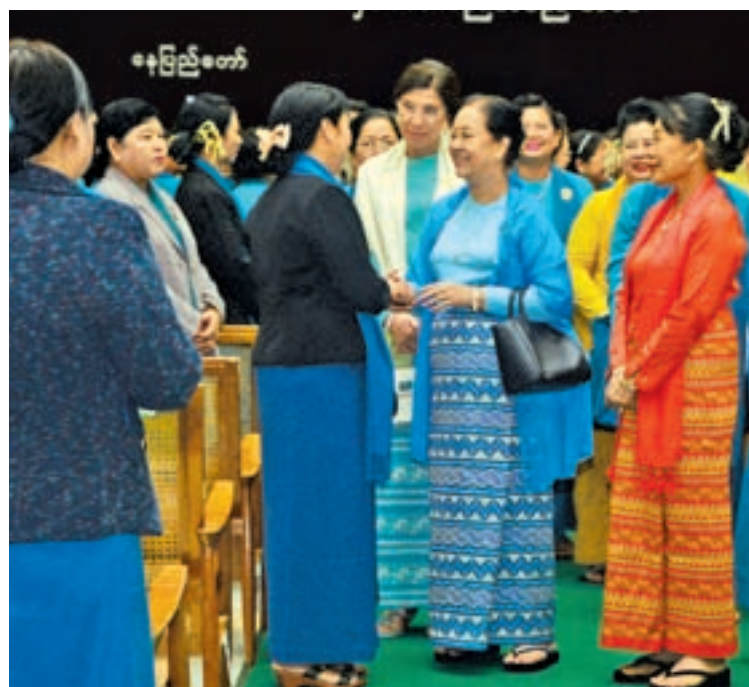
Daw Khin Khin Win, wife of President U Thein Sein, greets attendees of Myanmar Women's Affairs Federation.

THE Myanmar Women's Affairs Federation held its annual meeting for 2015 at Thiri Yadana Hall of the building in Nay Pyi Taw, with the opening ceremony