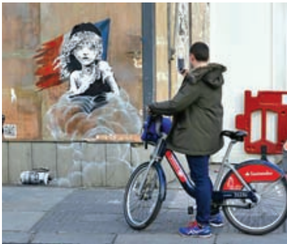
People photograph a new graffiti mural attributed to Banksy, opposite the French embassy in London, Britain on 25 January.

Other works in the French town that homes thousands of migrants from the Middle East and Africa who want to enter Britain also appeared on Banksy’s website.—Reuters