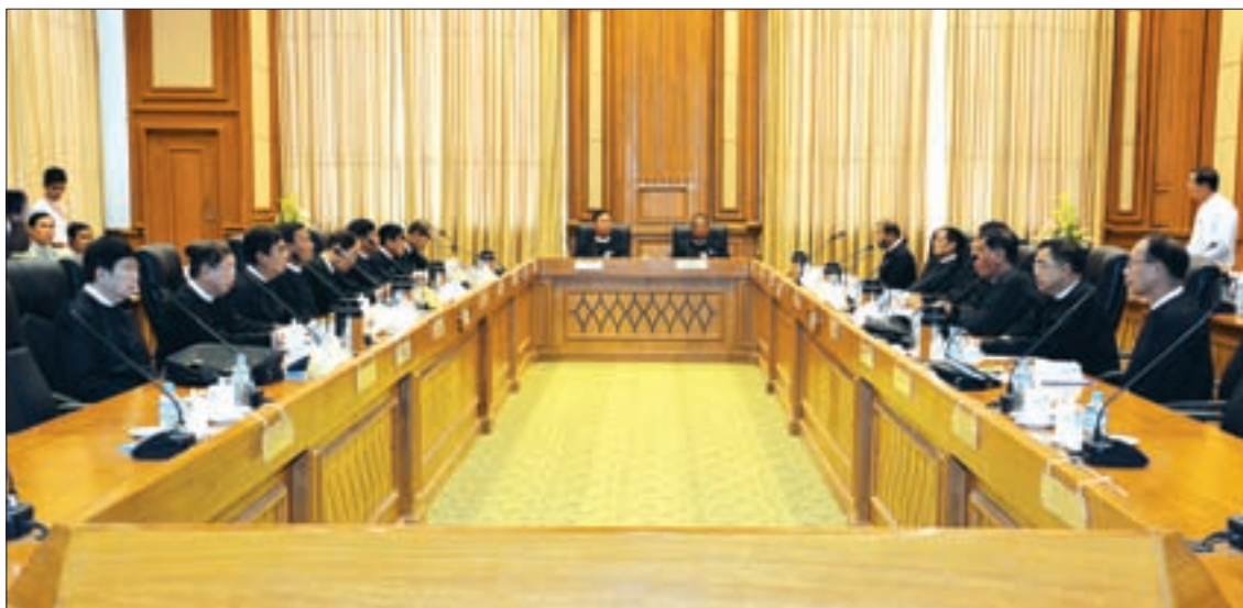
Pyidaungsu Hluttaw Speaker Thura U Shwe Mann and Amyotha Hluttaw Speaker U Khin Aung Myint chair Myanmar Parliamentary Union Meeting in Nay Pyi Taw.

According to the statement approved at the meeting, MPU meetings were held 14 times during the period from 2012 to 2015, focusing on capacity enhancement for parliamentarians and enactment of laws that are of benefit to the people. Progress was made through coordination between the Union parliament and regional parliaments, said the statement, calling on the new Parliament to keep up the sound foundations of the First Parliament. — Myanmar News Agency