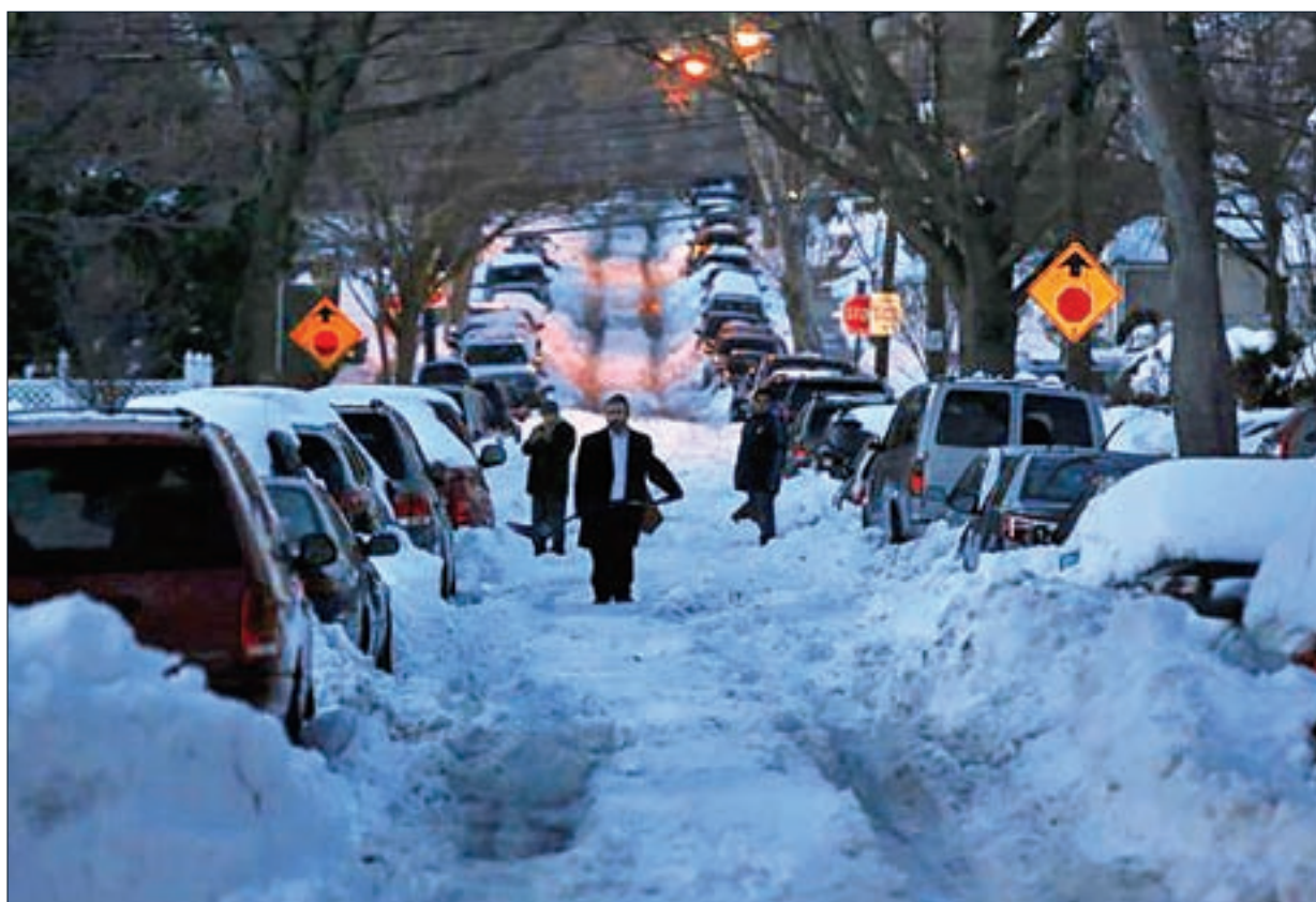
A man carries a shovel down 108 th street in the Richmond Hill section of the Queens borough of New York on 25 January 2016.

WASHINGTON/NEW YORK — Washington will need several more days to return to normal after a weekend blizzard dropped more than 2 feet (60 cm) of snow along the US East Coast, likely causing billions of dollars in damage and killing more than 30 people.