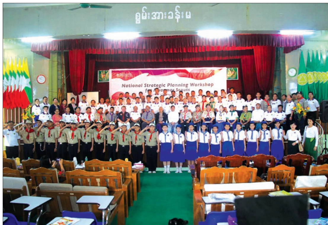
Myanmar scouts pose for photo with dignitaries at National Strategic Planning Workshop.

A WORKSHOP on scouting in Myanmar was held yesterday, taking a second step in development of Scouting in the country.