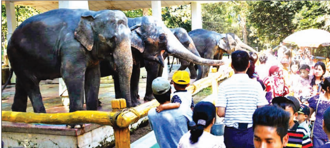
Visitors celebrate 110 th anniversary of the founding of the Yangon Zoological Garden.

THE Yangon Zoological Garden, the oldest and second-largest zoo in Myanmar, celebrated its 110 th anniversary of its founding on 25 January this year.