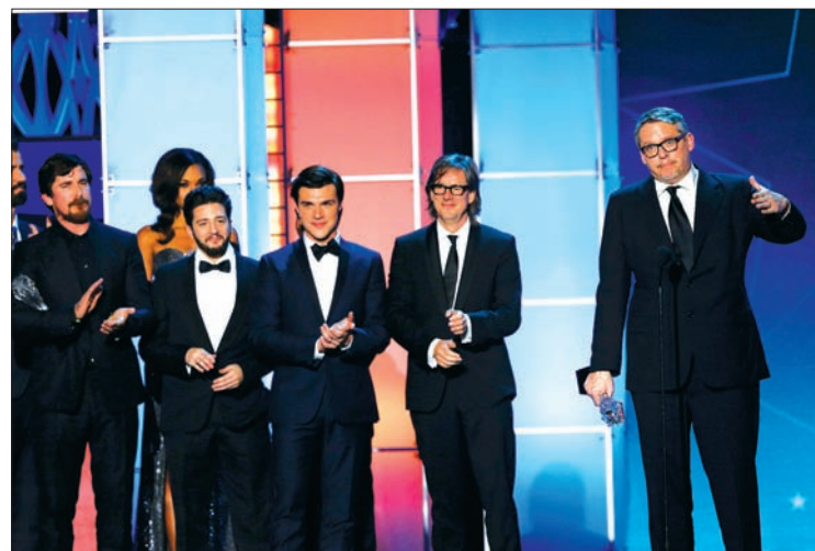
Director Adam McKay (R) accepts the award for Best Comedy for "The Big Short" along with actor Christian Bale (2 nd from L) and other cast and crew at the 21 st Annual Critics' Choice Awards in Santa Monica, California on 17 January 2016.