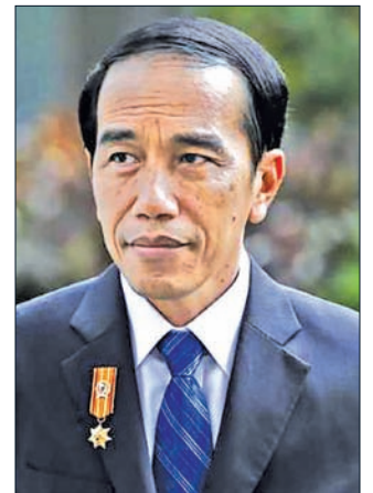
Indonesian President Joko Widodo.

JAKARTA — The leader of Indonesia's second-largest political party has said his party will lend support to President Joko Widodo's government, potentially making it easier to pass legislation by giving it a majority in the house of representatives, news Website Detik reported yesterday.