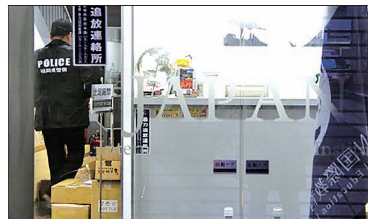
Police search Japan International Education Institute, a Japanese language school in Nogata, Fukuoka Prefecture, in southwestern Japan, on 23 January, 2016. A man running the school was arrested the same day for allegedly letting several foreign students work longer than the maximum hours allowed by law.

The school officials are suspected of trying to cover up the students' illegal work by keeping their weekly work hours at each workplace at 28 hours or shorter.—Kyodo News