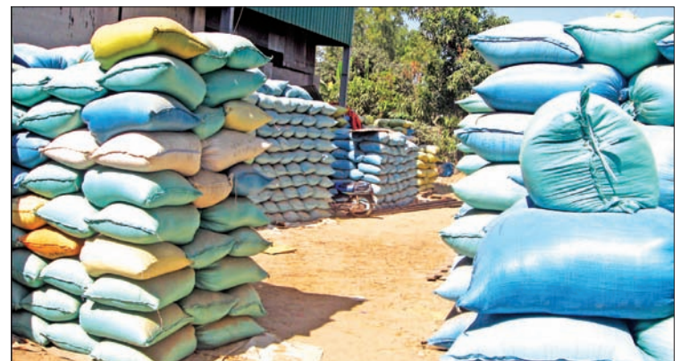
Bags of rice await sale at a mill.

“Farmers will be able make a profit by selling their stocks this year,” said a farmer from the eastern part of Phyu Township. “We charged just K500,000 for 100 baskets last year.”