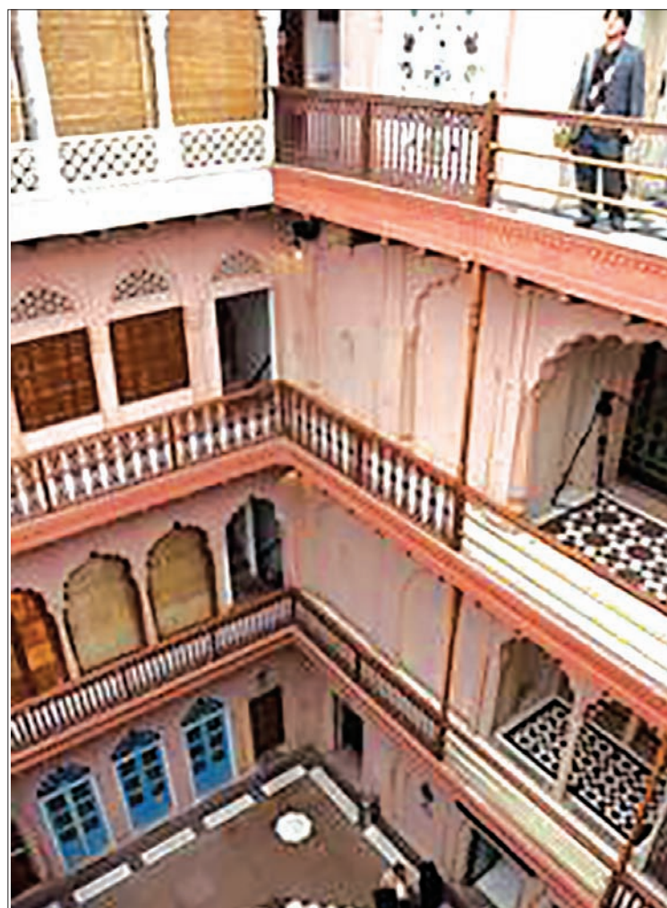
A 200-year-old building belonging to India's ruling Bharatiya Janata Party is pictured in old Delhi on 19 January, 2016. The structure, a "haveli," which is a historically significant mansion with different spaces for men and women, has recently been restored, and is set to showcase Indian culture, from dance and music to Indian cuisine. PHOTO: KYODO NEWS

In order to attract foreign tourists, the surroundings of the haveli have also been spruced up, with tons of open wiring hanging above the streets being laid underground, and a proper sewerage system replacing the open drains of old.—Kyodo News