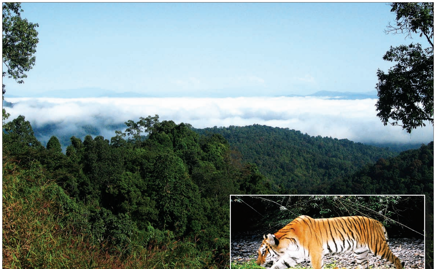
Hukawng Valley in northern Myanmar, home to endangered species including tigers and monkeys.