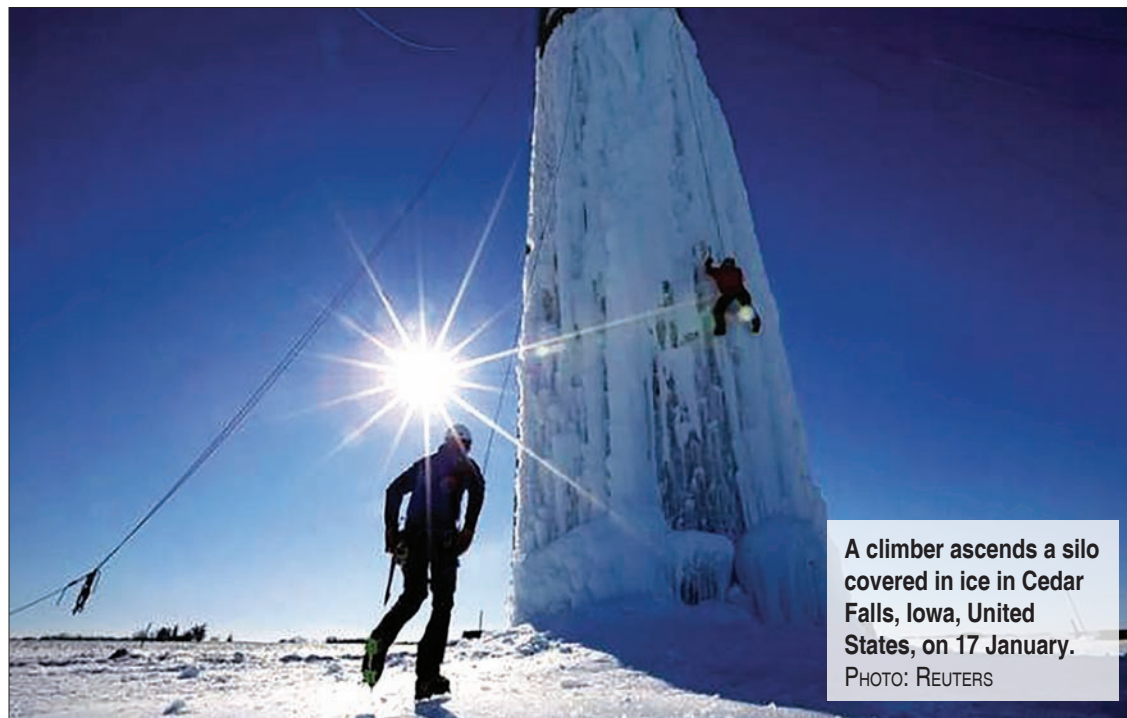
A climber ascends a silo covered in ice in Cedar Falls, Iowa, United States, on 17 January.

NEW YORK — Oil prices surged 10 per cent on Friday, one of the biggest daily rallies ever, as bearish traders who had taken out record short positions scrambled to close them, betting the market's long rout may finally be over.