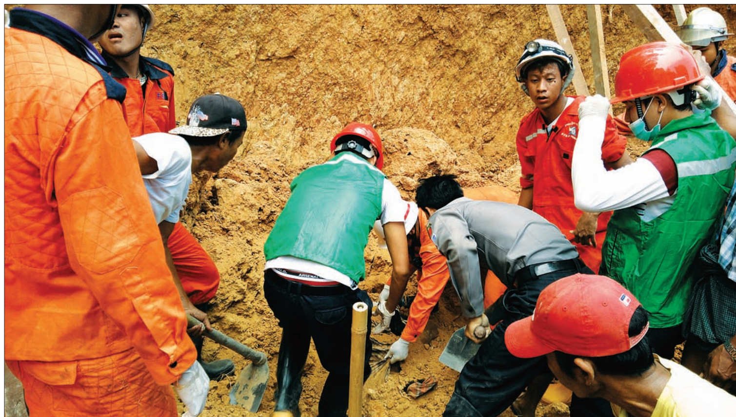
Rescuers remove soil to evacuate the scene of accident of the victims.

A LANDSLIDE at a monastery in Mayangon Township yesterday left three people dead.