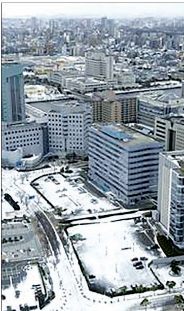
Central areas of Fukuoka, western Japan, are covered in snow on 24 January 2016, as heavy snow fell over a wide area of western and central Japan.

Up to 1 metre of snowfall is expected through Monday morning in the Hokuriku region,