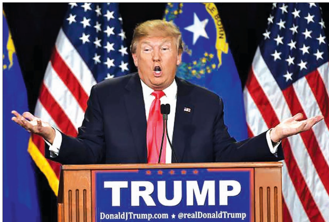
US Republican presidential candidate and businessman Donald Trump speaks at a campaign rally at the South Point Resort and Casino in Las Vegas, Nevada on 21 January 2016.

PELLA, (Iowa) /ANKENY — US Republican front-runner Donald Trump expressed confidence on Saturday that he could push back attempts by his rivals to knock him off his top perch, saying he could stand on New York's Fifth Avenue "and shoot somebody," and still not lose voters.