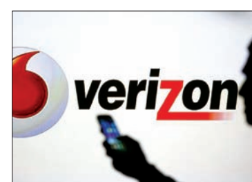
A man is silhouetted against a video screen with Vodafone and Verizon logos as he poses with a Samsung Galaxy S3 in Bosnian town of Zenica in 2013.