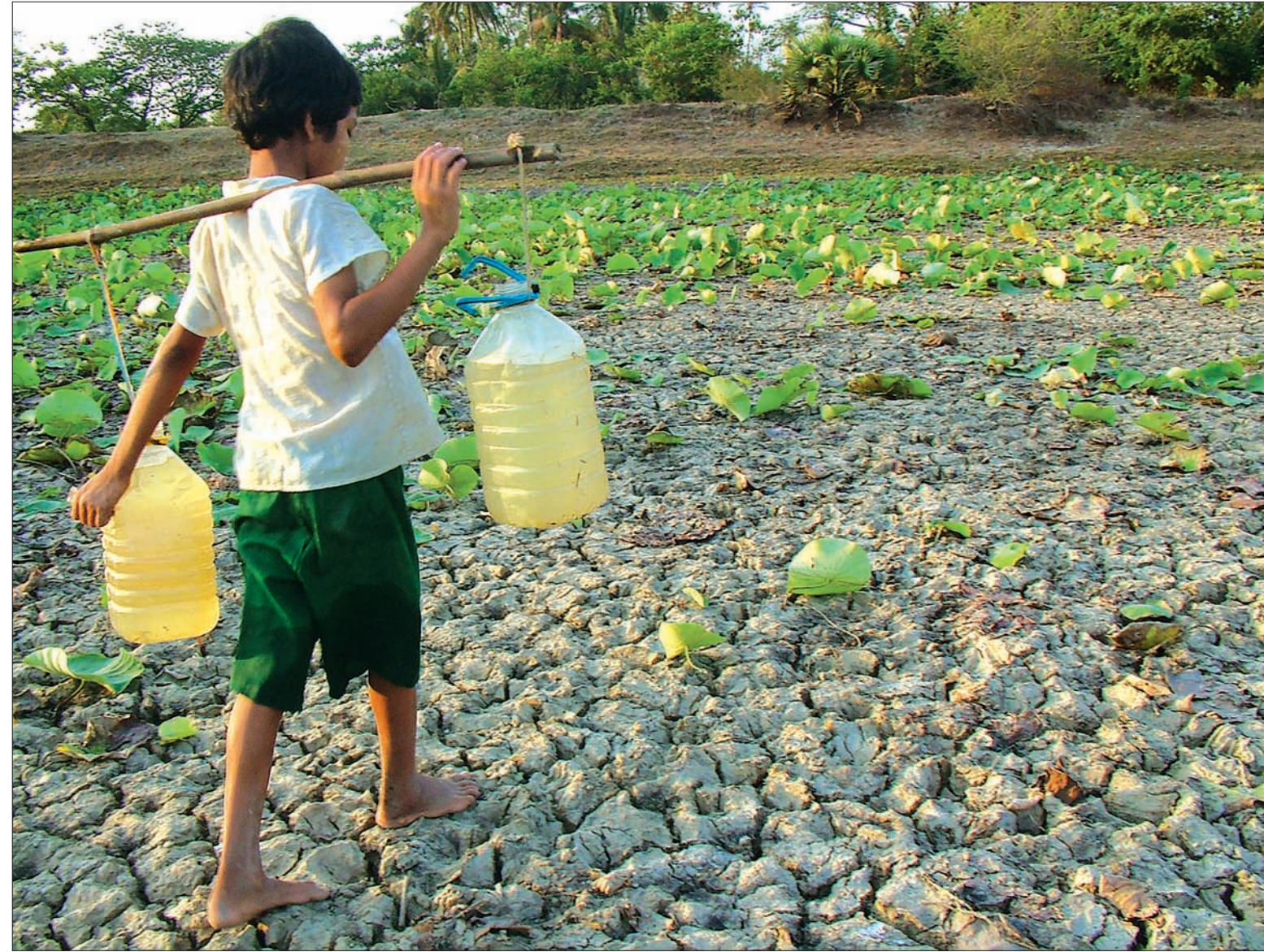
Access to safe drinking water is very important to prevent the outbreak of infections diseases.

Some of the most serious disasters and emergencies are created or further complicated by conflict and the forced movement of large numbers of people. Conflict also imposes the greatest demands on environmental health personnel, equipment, supplies and supporting services, thus calling for the most skilful use of relief resources. The secondary impact of conflict, in terms of the public health problems it creates and the disruption of environmental health services it causes, are of major importance. An emergency is a situation or