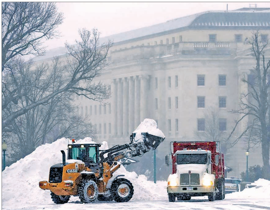
A heavy earth moving machine is used to clear snow on Capitol Hill during a winter storm in Washington on 23 January 2016.

canceled on Sunday, with more than 600 already canceled for Monday, said FlightAware.com, the aviation data and tracking website.