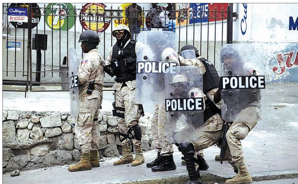
National Police officers protect themselves from rocks thrown by protesters during a demonstration against the electoral process in Port-au-Prince, Haiti, on 22 January 2016.

About a thousand protesters snaked through capital Port-au-Prince's downtown, a district still largely in ruins after a devastating