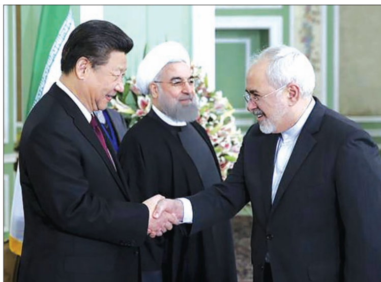
Iranian Foreign Minister Mohammad Javad Zarif (R) shakes hands with Chinese President Xi Jinping in Tehran, Iran on 23 January 2016.