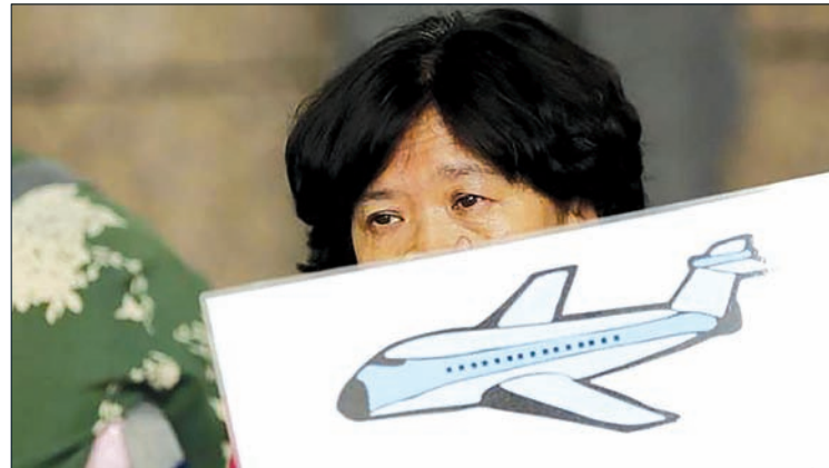
A woman whose relative was aboard Malaysian Airlines flight MH370 holds a placard as she and other family members express their demands to Malaysia Airlines outside its Beijing office on 6 August 2015.