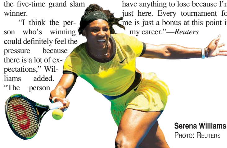
Serena Williams.

"But in this situation, I don't have anything to lose because I'm just here. Every tournament for me is just a bonus at this point in my career." —Reuters