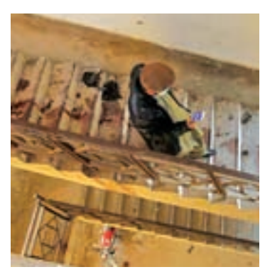
A man walks down the bloodstained stairs leading down from the roof of a dormitory where a militant attack took place, at Bacha Khan University in Charsadda, Pakistan on 20 January.

The reason for the conflicting claims by the official spokesman and Mansoor was not immediately clear but has led to speculation of a possible split in the Taliban lead-