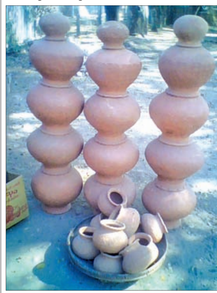
Earthern pots.