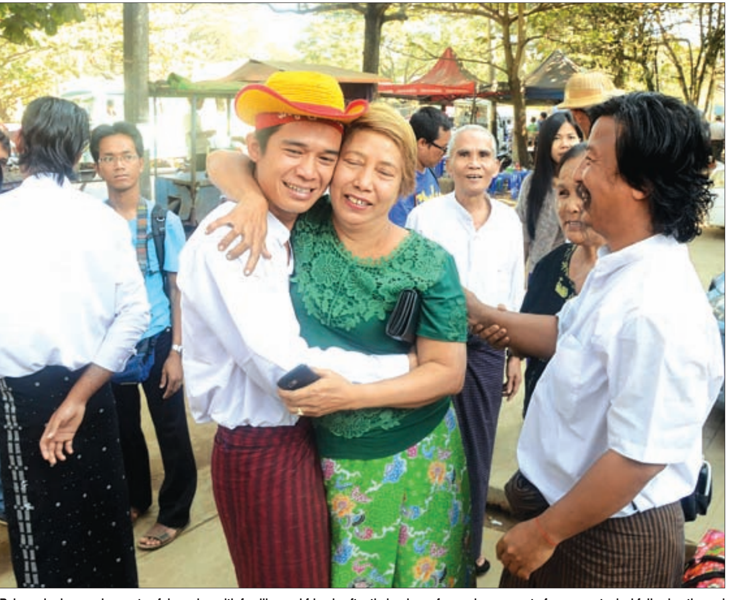
Released prisoners have a tearful reunion with families and friends after their release from prison as part of an amnesty deal following the end of the UPC.

Intensify our response to the coming of record-high El Niño