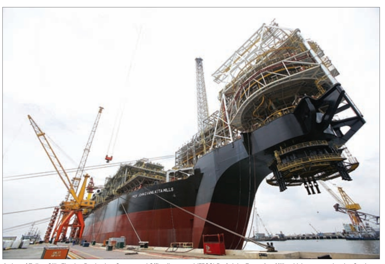
A view of Tullow Oil's Floating Production, Storage and Offloading vessel (FPSO) Prof. John Evans Atta Mills which was completed at Sembcorp Marine's Jurong Shipyard in Singapore on 20 January.

SINGAPORE — Amid one of the from a Very Large Crude Carrier deepest oil price crashes in history, Britain's Tullow Oil (TLW.L) is sending one of the world's biggest floating deep-water oil production platforms to West Africa to pump crude for at least 20 years.