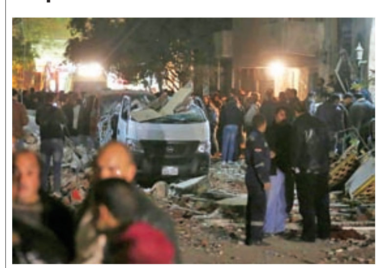
Damaged cars are seen at the scene of a bomb blast in Giza, Egypt, on 21 January.

CAIRO — Nine people, including six policemen, were killed on Thursday in a Cairo suburb near the pyramids when a makeshift bomb went off as police prepared to raid a militant hideout, security sources said.