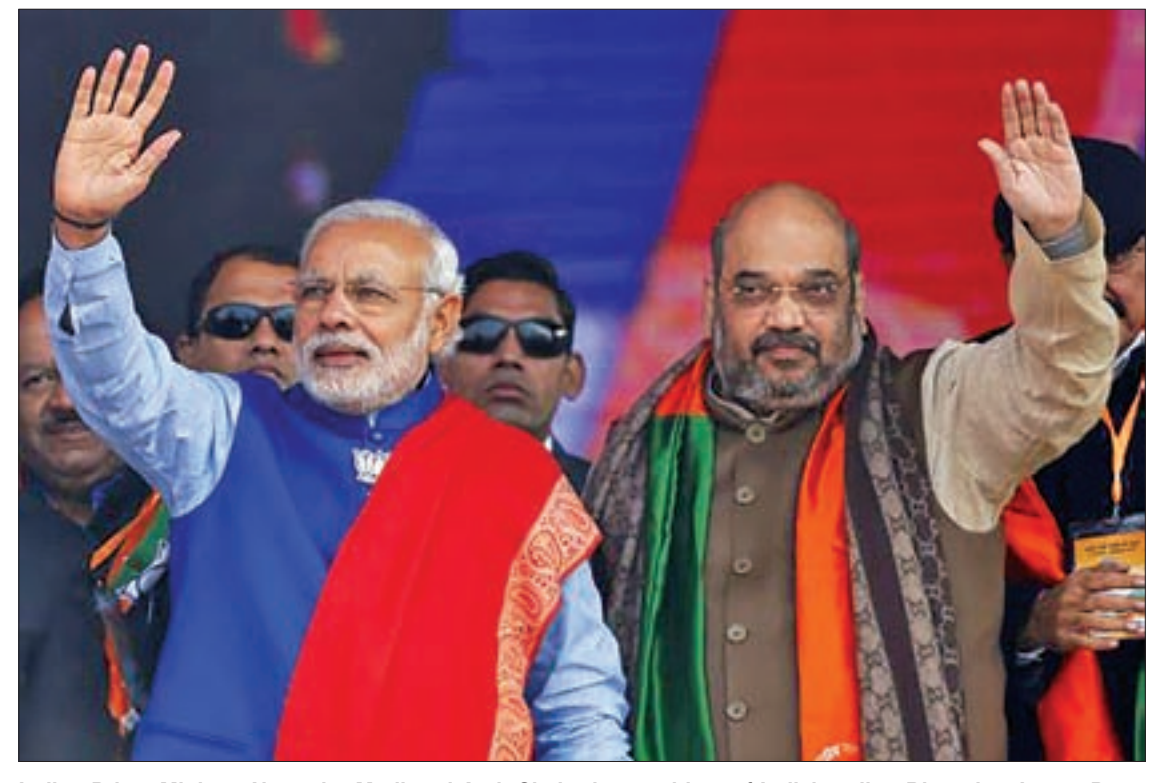
Indian Prime Minister Narendra Modi and Amit Shah, the president of India's ruling Bharatiya Janata Party (BJP), wave to their supporters during a campaign rally ahead of state assembly elections at Ramlila ground in New Delhi, India, in January 2015.

It would also open the way for power and coal minister Piyush Goyal to take the finance