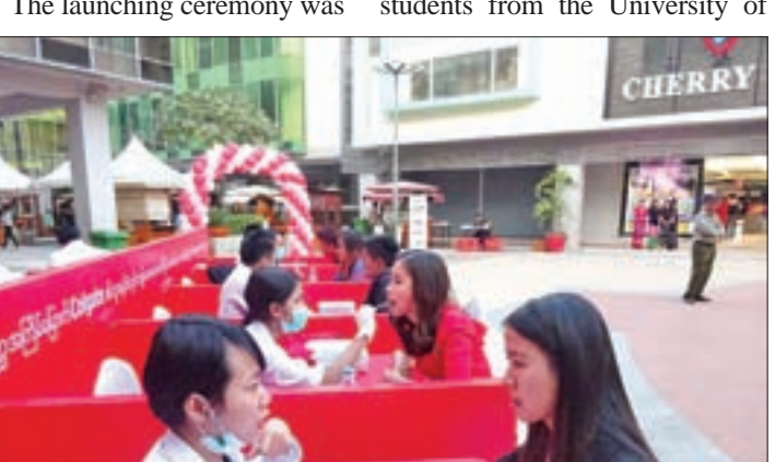
Dentists give oral health care to attendees.