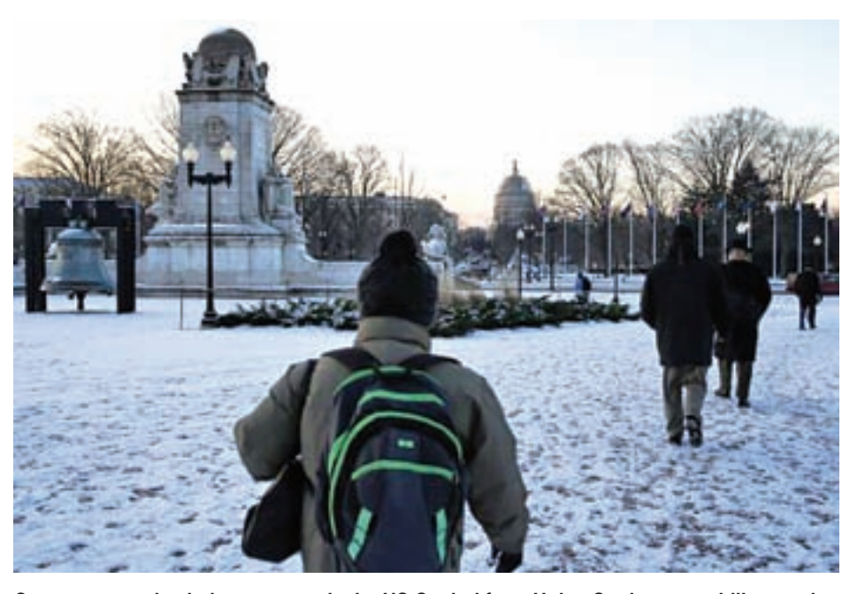
Commuters make their way towards the US Capitol from Union Station on a chilly morning after a light snow fell in Washington on 21 January.

Airlines American Group Inc scrapped all Friday flights into North Carolina's Charlotte Douglas International Airport, and Delta Air Lines Inc cancelled about 120 flights in the Southeast region. Amer-