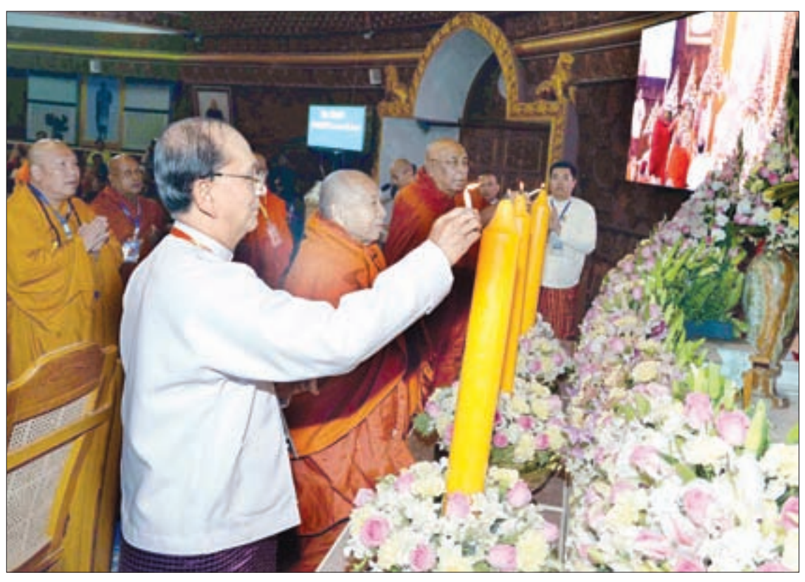
President U Thein Sein and Sayadaws light candles at the World Buddhist Peace Conference.

The Great Discourse of Buddhism teaches the opposite exist-