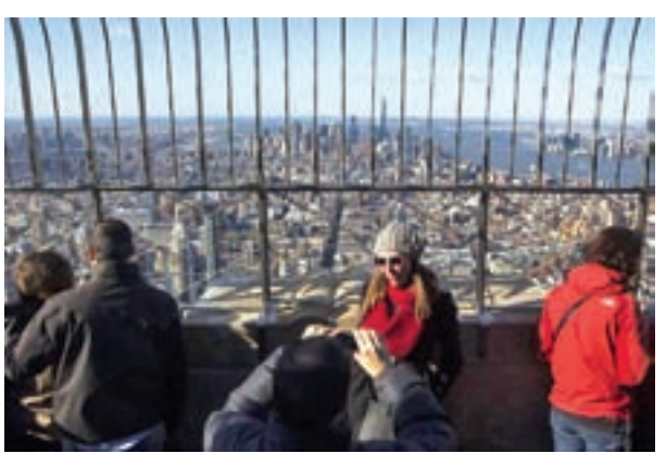
A tourists poses for a photo with One World Trade Centre in the background from the observation deck of the Empire State Building in New York in 2014.

December shooting in San Bernardino that killed 14, New York City officials repeatedly sought to reassure the public that the city was equipped to