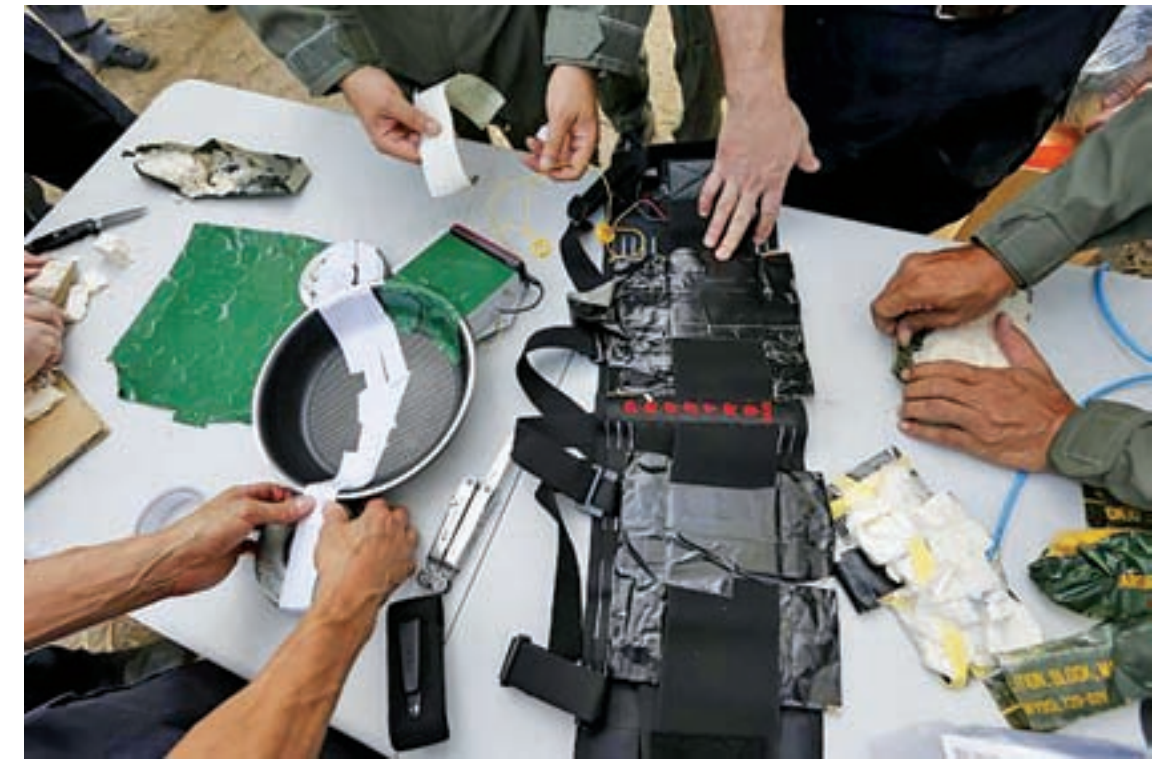
Experts from the US Bureau of Alcohol, Tobacco, Firearms and Explosives (ATF) prepare improvised explosive devices (IEDs), which will be detonated during a course on blast scene investigation, near Hua Hin, Thailand, on 17 January.

a veteran ATF bomb technician based in Baltimore who worked the bloody aftermath of the Boston Marathon bombing in 2013.