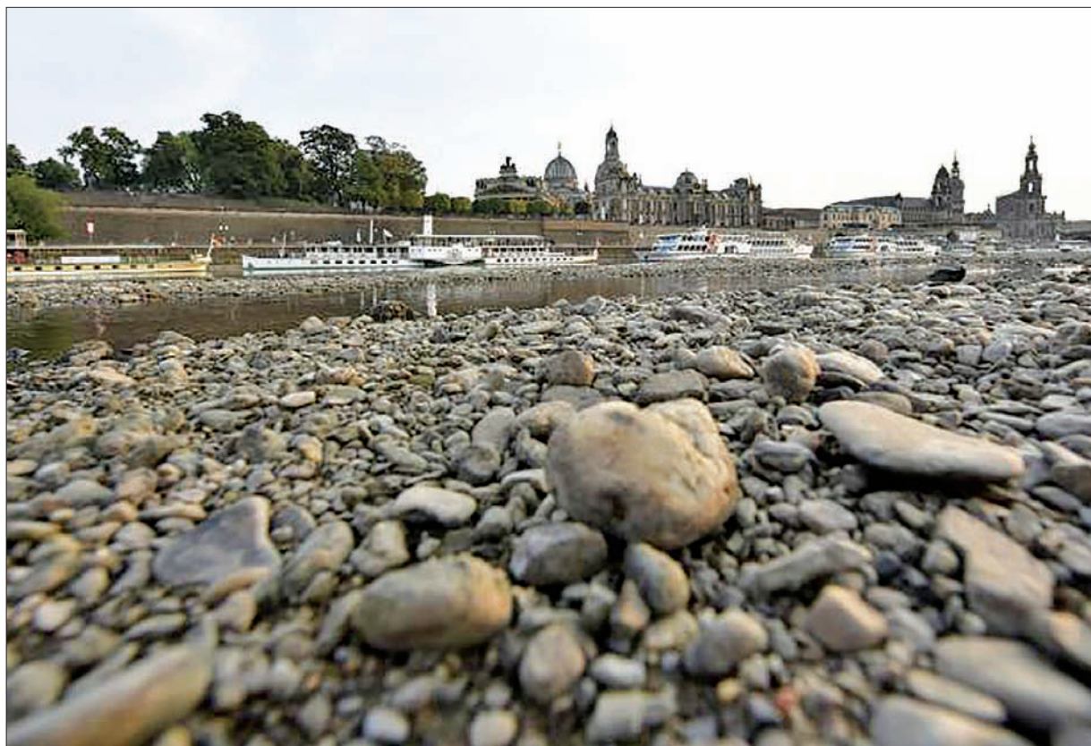
A dry bank of the river Elbe is seen after the water level dropped due to hot temperatures in Dresden, Germany in 2015.

OSLO — For British climate expert Chris Hope, new data showing that 2015 was the hottest year ever recorded is not just confirmation he's been right all along that the planet is getting warmer.