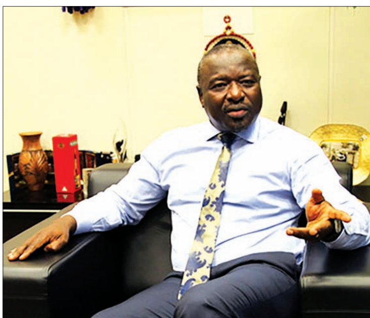
Lassina Zerbo, executive secretary of the Preparatory Commission for the Comprehensive Nuclear Test Ban Treaty Organisation, gives an interview to Kyodo News in Vienna on 18 January.