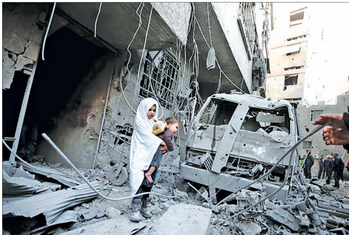
A girl carrying a baby inspects damage in a site hit by what activists said were airstrikes carried out by the Russian air force in the town of Douma, eastern Ghouta in Damascus, Syria on 10 January.

De Mistura, asked if he was able to send the invitations to the talks, told CNN in the Swiss resort of Davos: "I can't tell you today, I will tell you on the 24 th , one