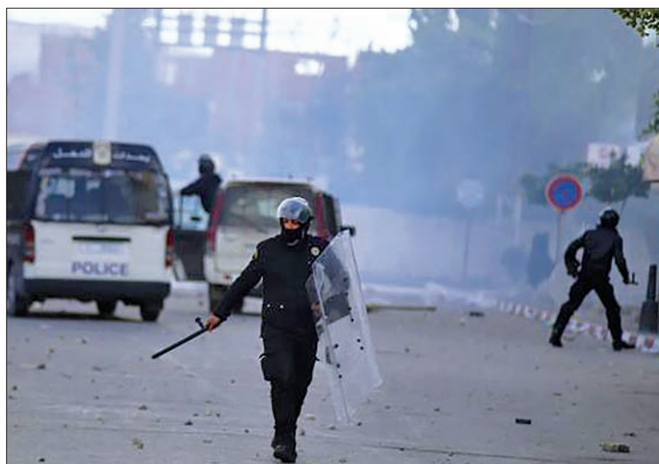
Riot policemen walk on a road during a protest in Kasserine, Tunisia on 20 January.

At least one policeman was killed in Feriana after he was attacked by protesters, a spokesman for the Interior Ministry