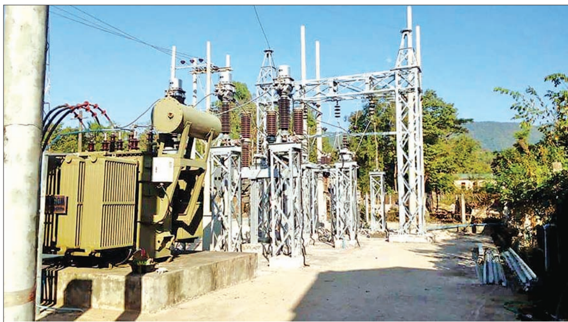
Kyaukkyi Electric Transformer. PHOTO 045

RESIDENTS in Kyaukgyi Township of Taungoo District recently have access to electricity thanks to the establishment of a 33KV power substation in the township, locals say.