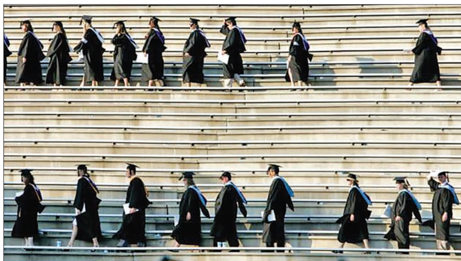
Graduating students enter the Paladin stadium before US President George W. Bush watches them during the commencement ceremony at Furman University in Greenville, South Carolina in 2008.

The proposal recommended that colleges that continue to rely on the