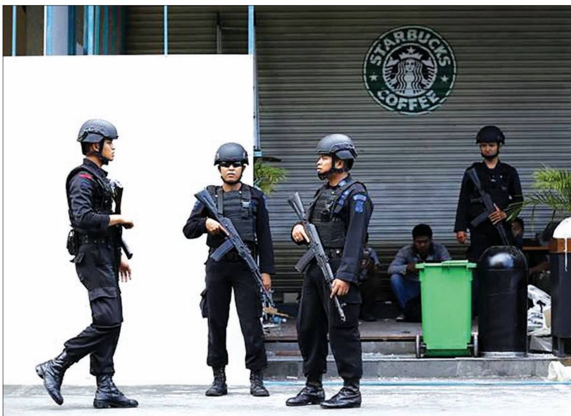
Indonesian police stand guard at the site of this week's militant attack in central Jakarta, Indonesia on 16 January.

Jakarta says it is working with China to stem the flow of Uighur militants, who police say are responding to a call by Santoso, Indonesia's most high-profile backer of Islamic State, to join his band of fighters.—Reuters