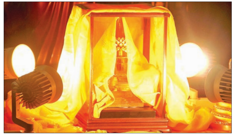
Sacred bone relic of the Buddha.

Yangon residents will be able to pay homage to the bone relic at Shwedagon Pagoda.