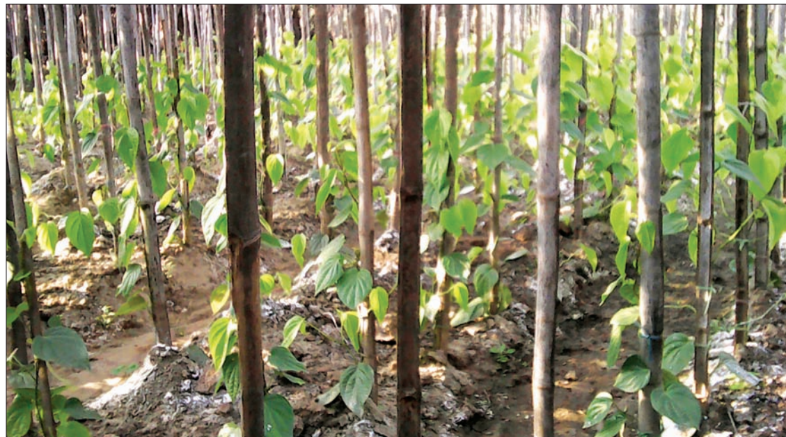
Betel farm in NyaungU.

GROWERS from NyaungU Township in Mandalay Region get a record price for betel leaves that are linked to the lower production this season, a grower says.