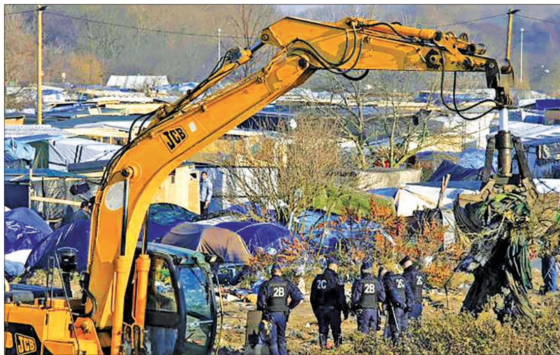
French police officers secure the area as a crane is used to clear dismantled shelters of the camp known as the 'Jungle', a squalid sprawling camp in Calais, northern France, on 20 January.

CALAIS, (France) — French bulldozers have begun to clear a 100-metre (110-yard) strip next to a road that passes above a migrant camp in Calais, as local authorities attempt to secure a busy traffic route between France and Britain.