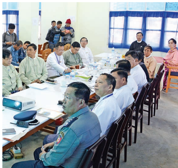
Authorities and MPs are discussing accommodation for new MPs.

Also present at the meeting were Daw Aung San Suu Kyi, chairperson of Pyithu Hluttaw Rule of Law and Tranquility, parliamentarians and officials.— Myanmar News Agency