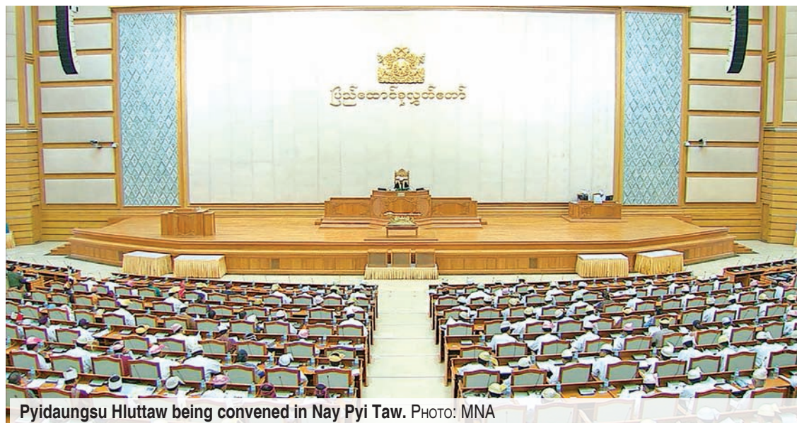
Pyidaungsu Hluttaw being convened in Nay Pyi Taw.

THE 13 th regular session of the first Pyidaungsu Hluttaw entered its 35 th day yesterday, with the sessions documenting plans to establish new towns and villages and the government's second five-year, short-term development plan. One MP also read out a report before the parliament.