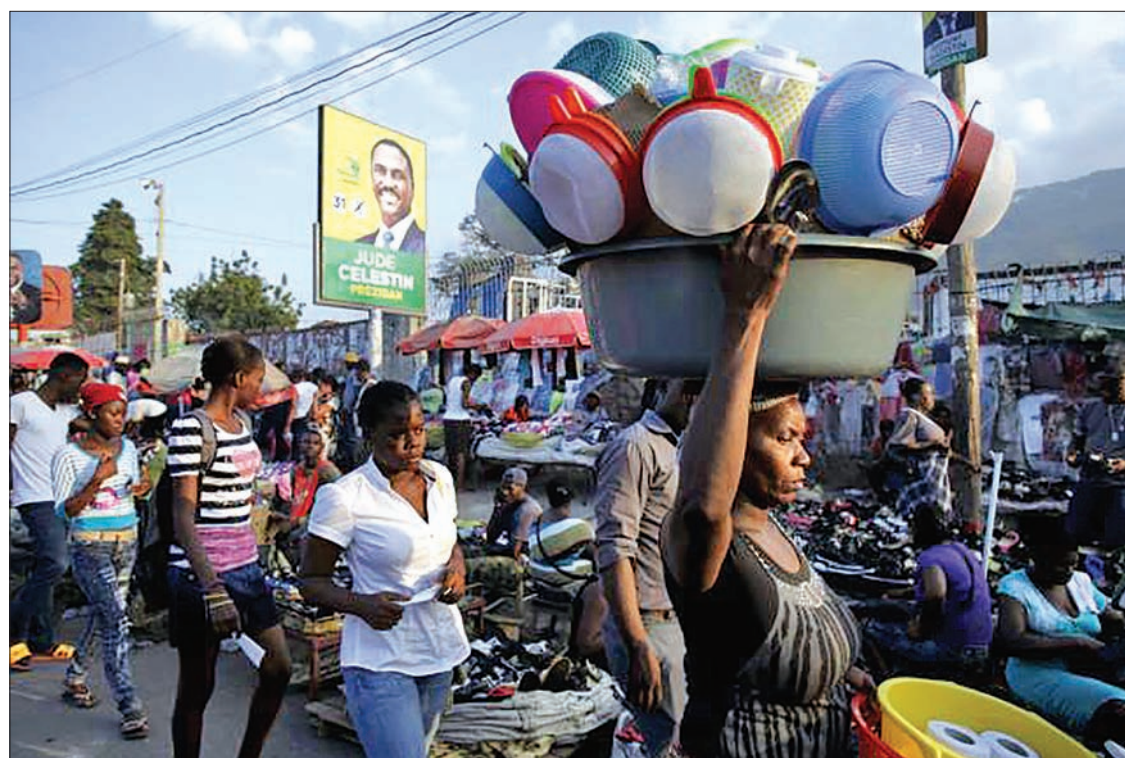
Residents walk next to an electoral sign of presidential candidate Jude Celestin in Port-au-Prince, Haiti, on 20 January.