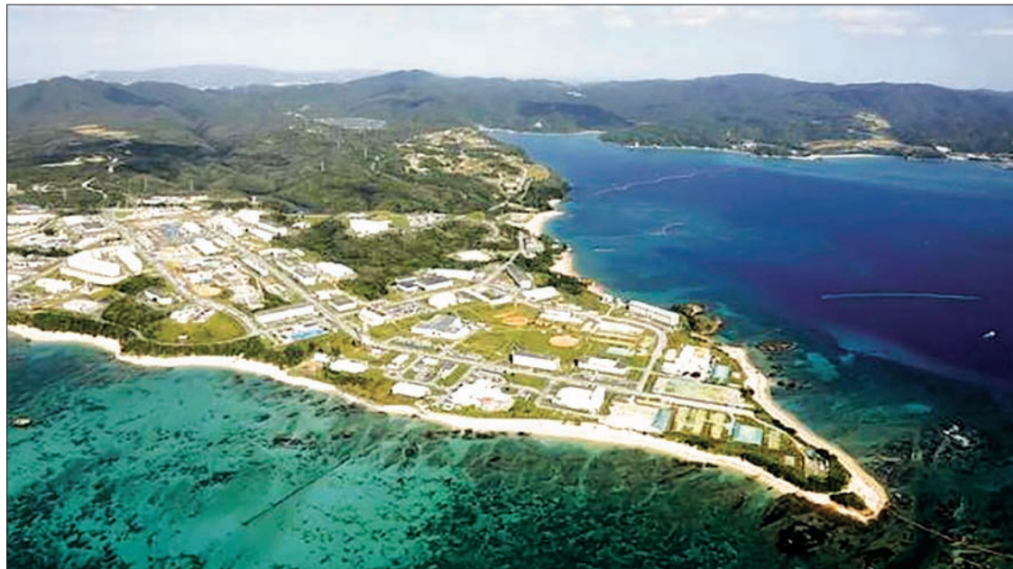
Coral reefs are seen along the coast near the US Marine base Camp Schwab, off the tiny hamlet of Henoko in Nago on the southern Japanese island of Okinawa, in October 2015.

"But if the opposition wins it is a huge defeat for Abe." —Reuters