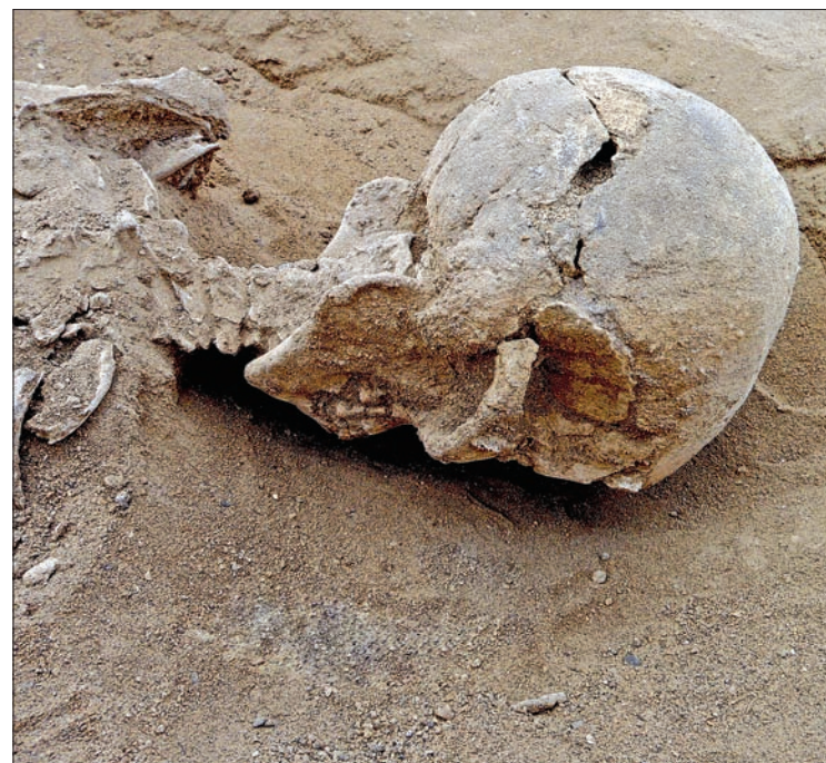
Detail of the skull of the skeleton of a man found lying prone in the sediments of a lagoon 30km west of Lake Turkana, Kenya, at a place called Nataruk, on 20 January 2016.

The research appeared in the journal Nature .—Reuters