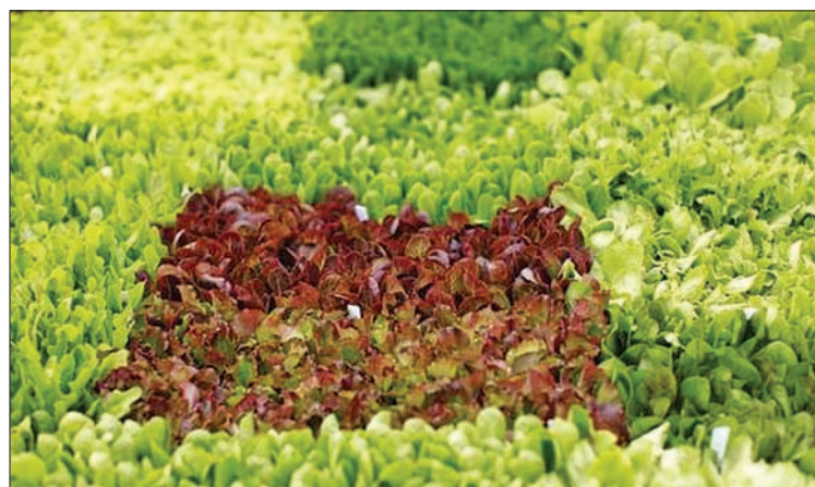
Lettuce transplants grow in a greenhouse on the Sino family farm in Rancho Santa Fe, California.

BOSTON — People who eat more green leafy vegetables, a good source of nitrate, may significantly decrease their risk of developing glaucoma, according to a large study.