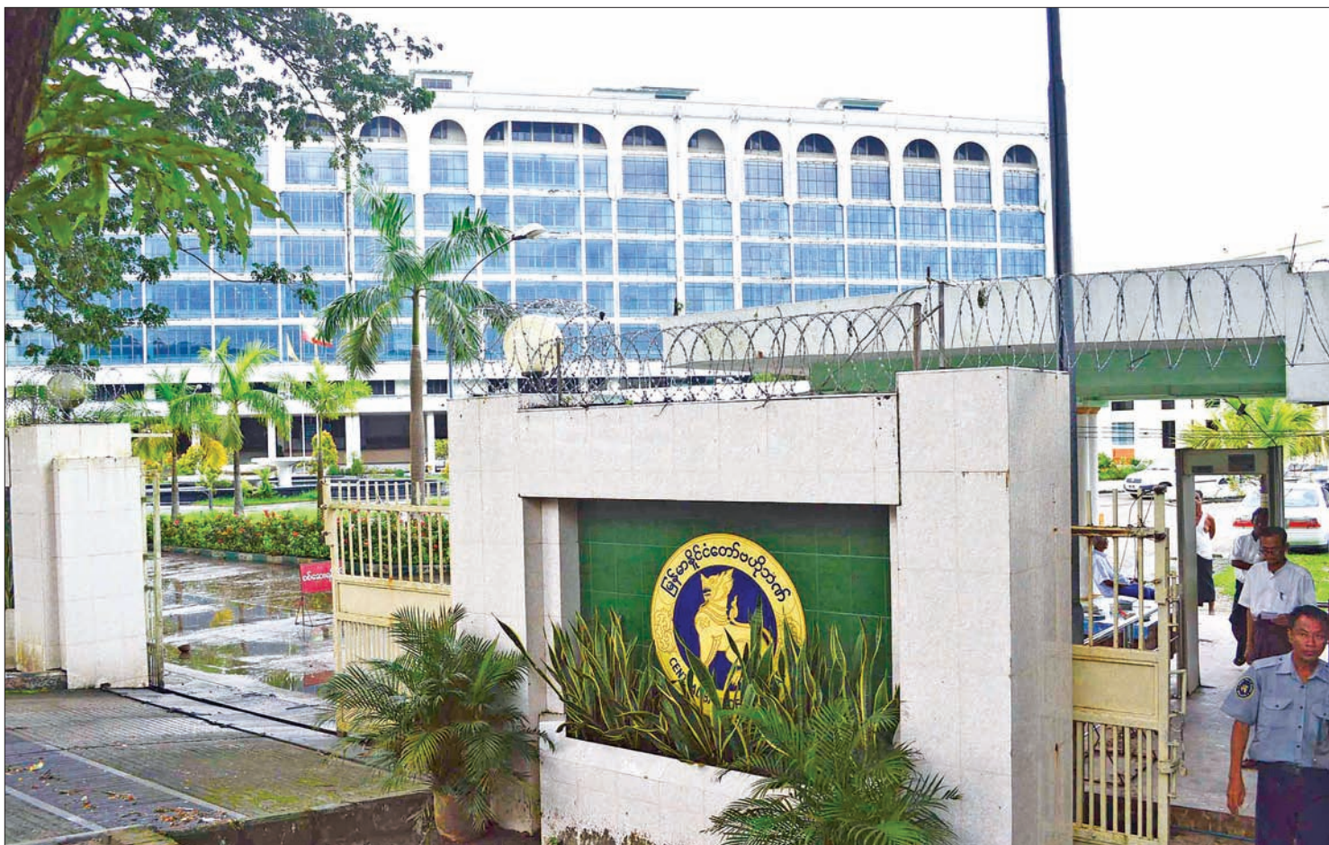
Central Bank of Myanmar in Yangon.

MPU, UnionPay to introduce international debit card