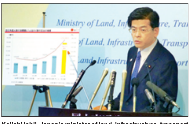
Keiichi Ishii, Japan's minister of land, infrastructure, transport and tourism.

than doubled to 5 million from 2.41 million in 2014, with those from South Korea growing 20.3 per cent to 4 million and Taiwanese tourists up 18.6 per cent at 3.68 million, the agency said.