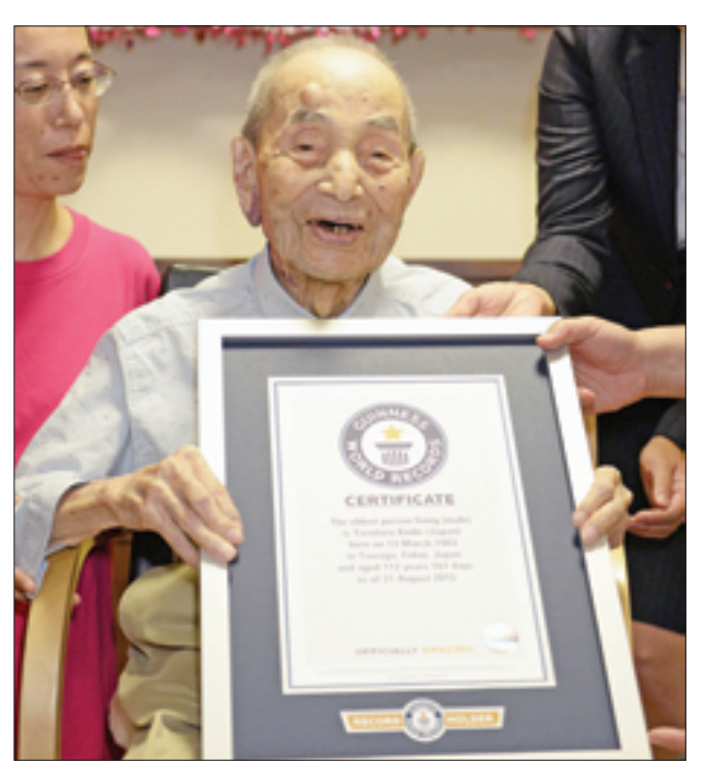
Yasutaro Koide in the central Japan city of Nagoya receiving a certificate from Guinness World Records as the world's oldest living man in August 2015.

NAGOYA — Yasutaro Koide, a former tailor recognised by Guinness World Records as the oldest living man on earth, died at the age of 112 of chronic heart failure at a hospital in Nagoya,