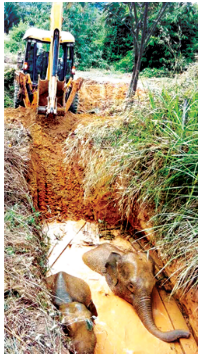
Volunteers are trying to evacuate two baby elephants.

Officials and employees of the farm were able to save the victims with the use of heavy machineries in the evening. Those people then returned the two babies to their herd after they had been rescued, one of employee said.-Kyaw Soe