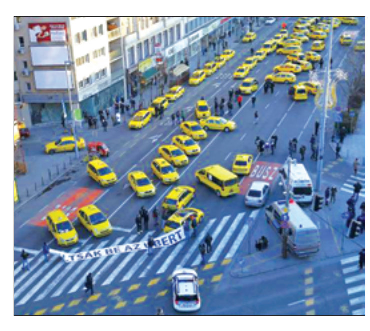
Taxis block a main road in Budapest's city centre, Hungary, on 18 January 2016.

About 140 vehicles took part in the demonstration, organisers said. Drone pictures by Drone Media Studio, published on the news web site 444.hu, showed a few dozen