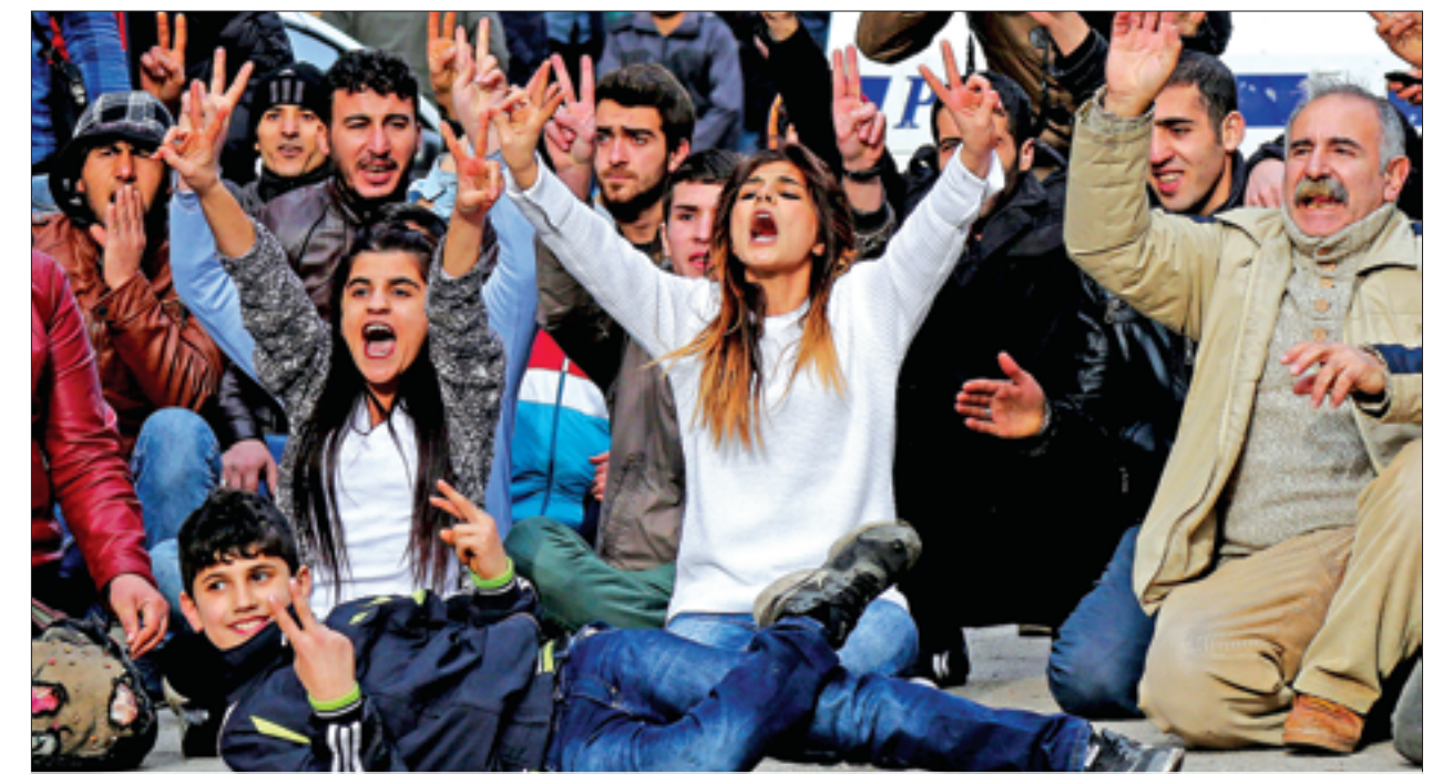
Kurdish demonstrators shout slogans during a protest against a curfew in Sur District and security operations in the region, in the southeastern city of Diyarbakir, Turkey on 17 January.

Davutoglu's comments were published after the governor of Sirnak province said a round-theclock curfew in the town of Silopi, near the Iraqi border, would only be enforced between 6 pm (1600