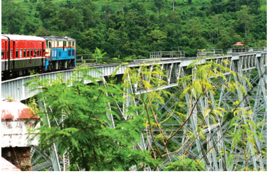
Gokhteik Bridge.

Transport and communication were the two in-dispersible necessities in the pursuit of "forward policy" of British imperialism. In the Sub-continent of India the push to the furthest limit to the north brought British Colonial Power into confrontation with the Czarist Russia and Manchu China. The so-called Himalayan States such as Nepal, Sikkim and Bhutan were firstly turned into buffer, but later by alternate use of diplomacy and show of force {Localised War} the British converted these states into a sort of protectorates. Networks of com-