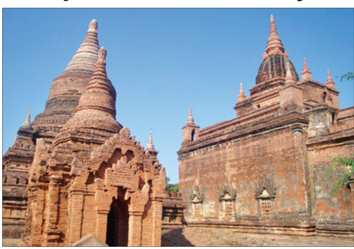
Some pagodas in Bagan are in urgent needs of restoration.

THE Archaeological Department under the Ministry of Culture has announced that the restorations to some of the pagodas in Bagan will be completed in February 2016. The project is receiving emergency funding from UNESCO.