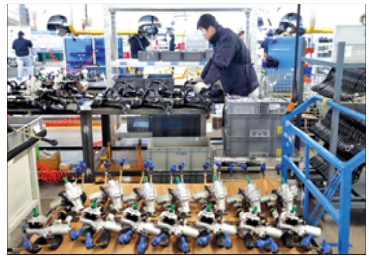
An employee works on an assembly line producing electronic cars at a factory of Beijing Electric Vehicle, funded by BAIC Group, in Beijing, China, on 18 January.

Growth in fourth-quarter gross domestic product (GDP) eased as expected to 6.8 per cent