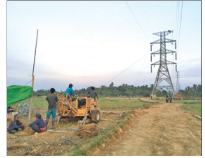
Workers install cables to connect with the national grid in Bilugyun.

According to the MNA, the Ministry of Electric Power began its plan to electrify the township since the 2013-2014 fiscal year, and completed the establishment of a sub-power station last June and the installation of all power lines this January.—GNLM