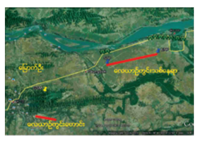
A map shows the site for the new airport in MraukU.

Under the project, a 6,000 foot long and 100 foot wide runway to take ATR 72 aircrafts will be constructed for the first