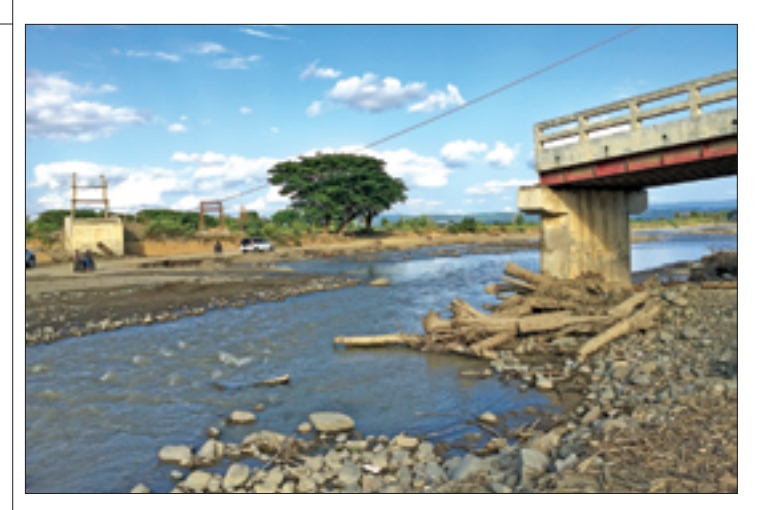
A bridge destroyed by flood in Kalay.

The income tax of real estate will come into effect from 1 April 2016 and will be roughly five times higher than currently imposed tax levies.-Myitmakha News Media