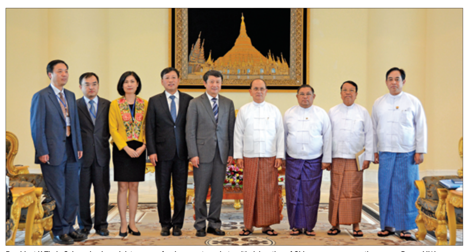
President U Thein Sein and union ministers pose for documentary photo with delegation of Chinese power generation group.

THE President of the Republic of the Union of Myanmar U Thein Sein received a Chinese delegation led by Mr. Wang Binghua, chairman of the State Power Investment Corporation-SPIC of the People's Republic of China and party at a hall of the Presidential Palace in Nay Pyi Taw yesterday.