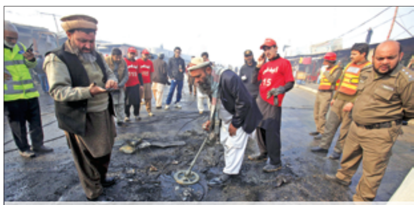
Investigators look for evidence after a suicide bomber blew himself up close to a police checkpoint in Peshawar, Pakistan on 19 January.

PESHAWAR (Pakistan) A suicide bomber blew himself up close to a police checkpoint in northwestern Pakistan yesterday, killing at least ten people and wounding more than 20, officials said.