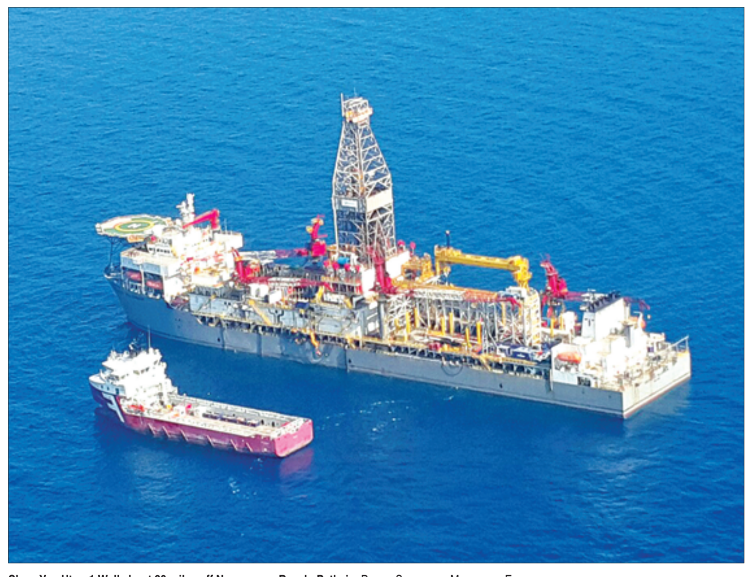
Shwe Yee Htun-1 Well about 30 miles off Ngwesaung Beach, Pathein.