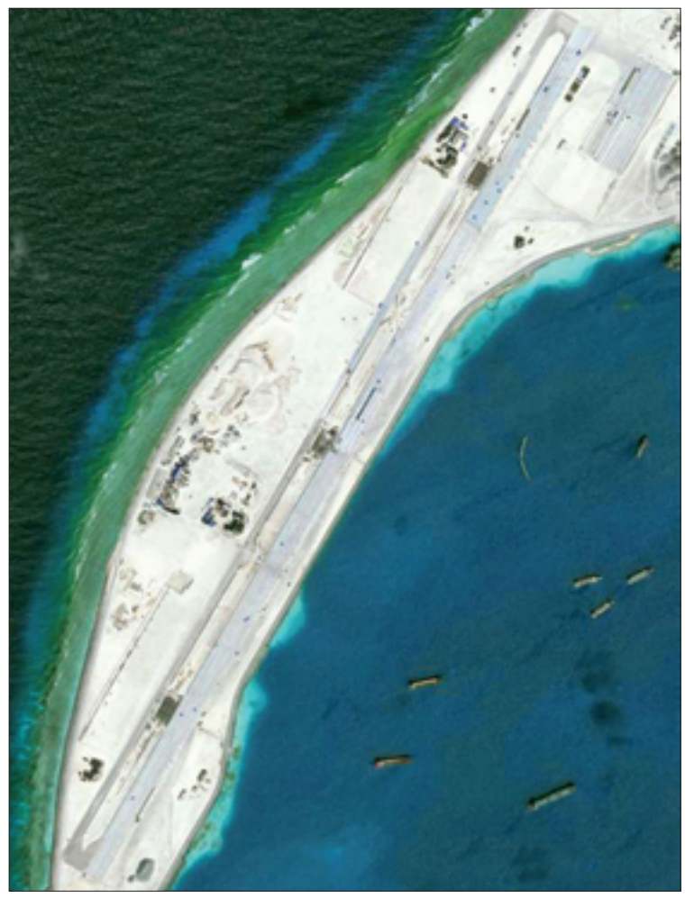
The work on the runway at Mischief Reef, located 216 km (135 miles) west of the Philippine island of Palawan, in this Centre for Strategic and International Studies (CSIS) Asia Maritime Transparency Initiative on 8 January 2016 satellite image released to Reuters on 15 January.

"The concerns about the recent activities of China along with the reclamation activities and construction of air-