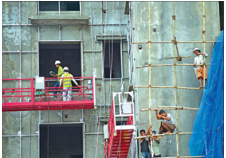
Workers at a construction site in Yangon.

real estate and buildings is going to increase about five times over. It has already been discussed in parliament. As such, whether it's the buying or selling of property, building construction or the changing of