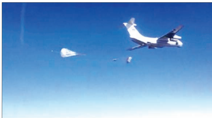
A Russian air force cargo plane drops off humanitarian aid in the region around the eastern Syrian city of Deir al-Zor, which is besieged by Islamic State militants, according to Russia's Defence Ministry.