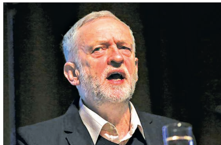
Britain's opposition Labour Party leader Jeremy Corbyn reacts after delivering the keynote speech at the Fabian Society new year conference in London, Britain on 16 January 2016.