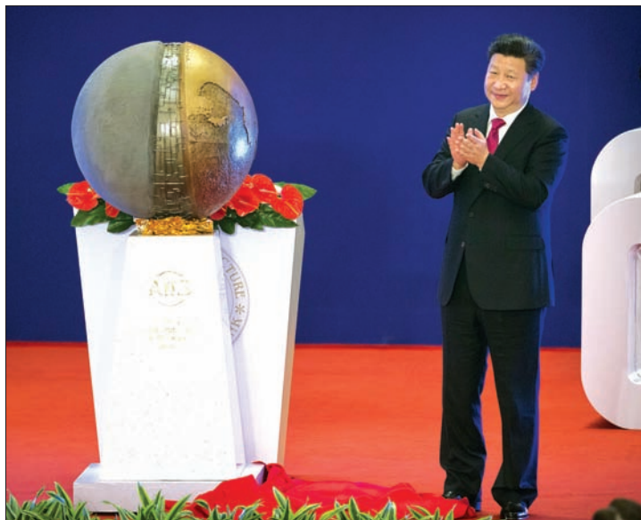
Chinese President Xi Jinping applauds after unveiling a sculpture during the opening ceremony of the Asian Infrastructure Investment Bank (AIIB) in Beijing, China, on 16 January 2016.

BEIJING — Chinese President Xi Jinping launched a new international development bank seen as a rival to the US-led World Bank at a lavish ceremony on Saturday, as Beijing seeks to change the unwritten rules of global development finance.