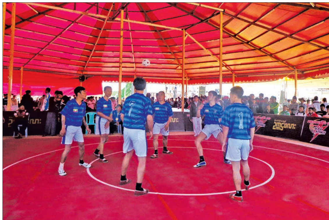
A team compete in Chinlon competition at Wayrasana Jade Pagoda in Mandalay.

THE Myanmar Chinlon Federation organised a Chinlon competition at the Wayrasana Jade Pagoda in Amarapura Township, Mandalay on 16 January.