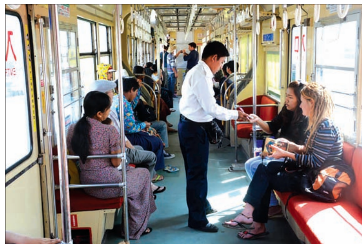
Passengers on board a tramcar.

The team of the three-carriage electric train vehicle