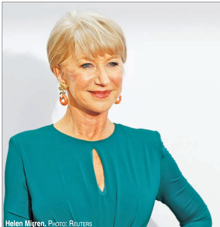
Helen Mirren.

LONDON — Veteran actress Helen Mirren has revealed she never wanted to be a Hollywood star.