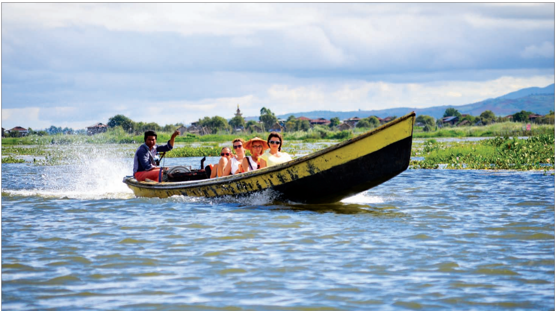
Tourists take a boat trip in Inle Lake , one of tourist attractions of Myanmar.

T HE tourism industry in Myanmar shows good prospects for 2016, with increasing number of tourists expected to arrive throughout the year.