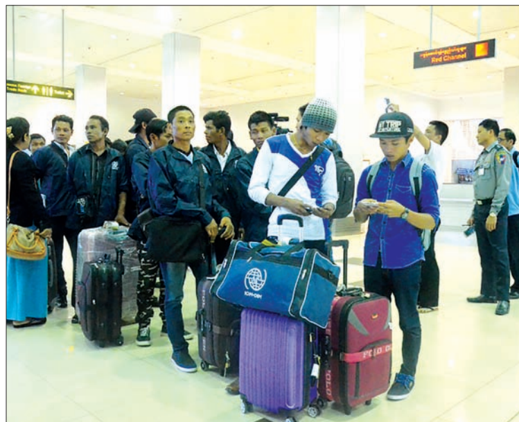
Myanmar fishermen are seen on arrival at Yangon International Airport.

those two days, the tram provided its service to 195 passengers on 11 January and 166 on the second day.— Maung Sein Lwin