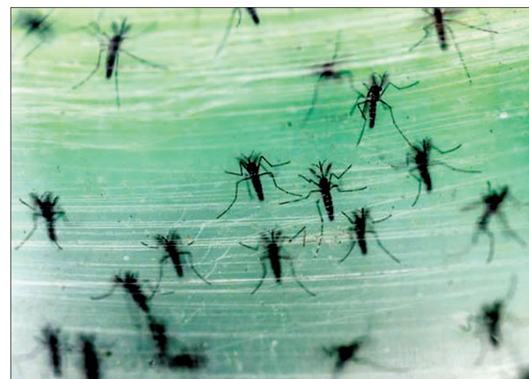
Male Aedes albopictus mosquitoes are seen in this picture. Zika virus is among the viruses spread by the species.

There is no preventive vaccine or treatment, according to the CDC. —Reuters