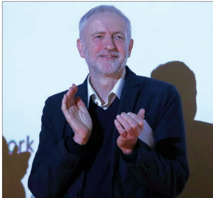
Britain's opposition Labour Party leader Jeremy Corbyn reacts after delivering the keynote speech at the Fabian Society new year conference in London, Britain on 16 January 2016.

The two sides seem further apart than ever, and despite Corbyn's attempts to tighten his control over the party, the Trident de-