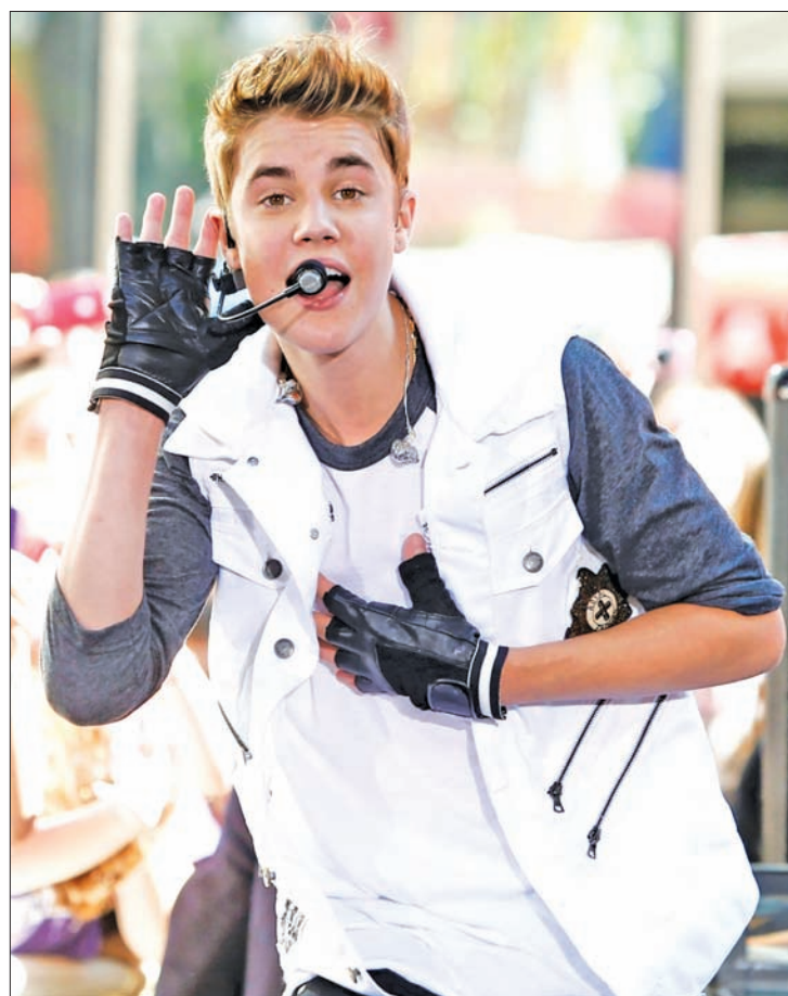
Justin Bieber.

LOS ANGELES — Pop star Justin Bieber debuted his version of the "mermaid hair" trend with purple ombre style.