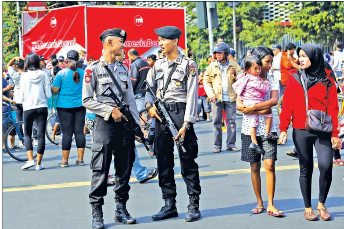
Indonesian police guard during a "car free" period at the site of this week's militant attack in central Jakarta, Indonesia, on 17 January 2016.