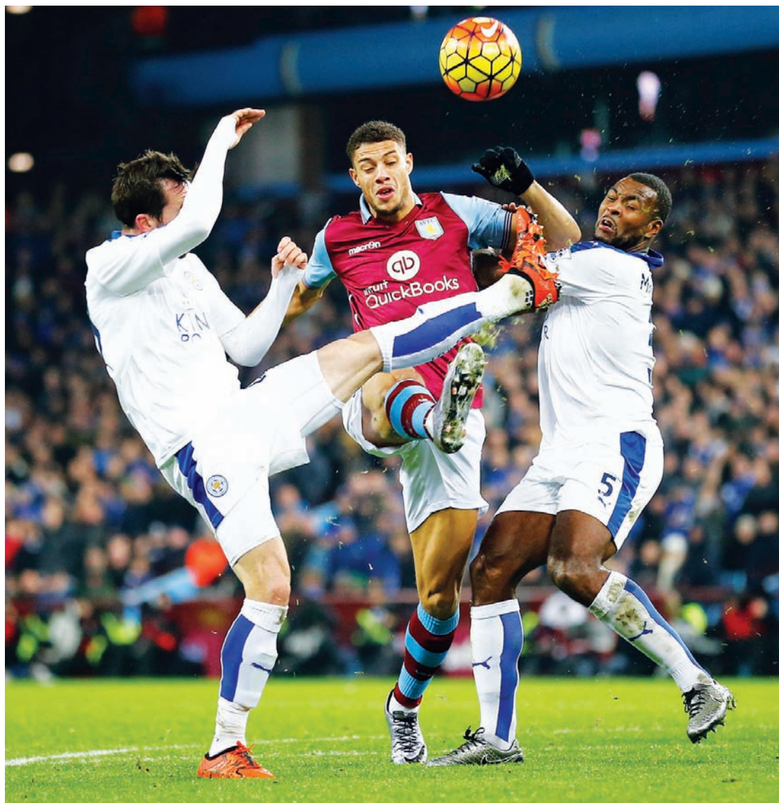
Aston Villa's Rudy Gestede in action with Leicester's Christian Fuchs and Wes Morgan during Barclays Premier League at Villa Park on 16 January 2016.