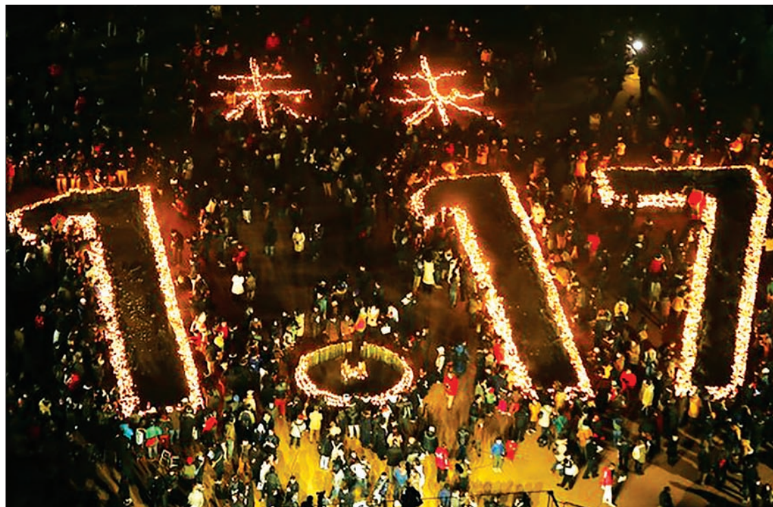
Candles in thousands of bamboo lanterns are placed to form “1.17” and “mirai” (future) in kanji characters at a park in Kobe, western Japan, on 17 January 2016, the 21 st anniversary of the 1995 Great Hanshin Earthquake. The quake devastated the port city and its vicinity, claiming the lives of 6,434 people.

The early morning quake hit when much of the city was still