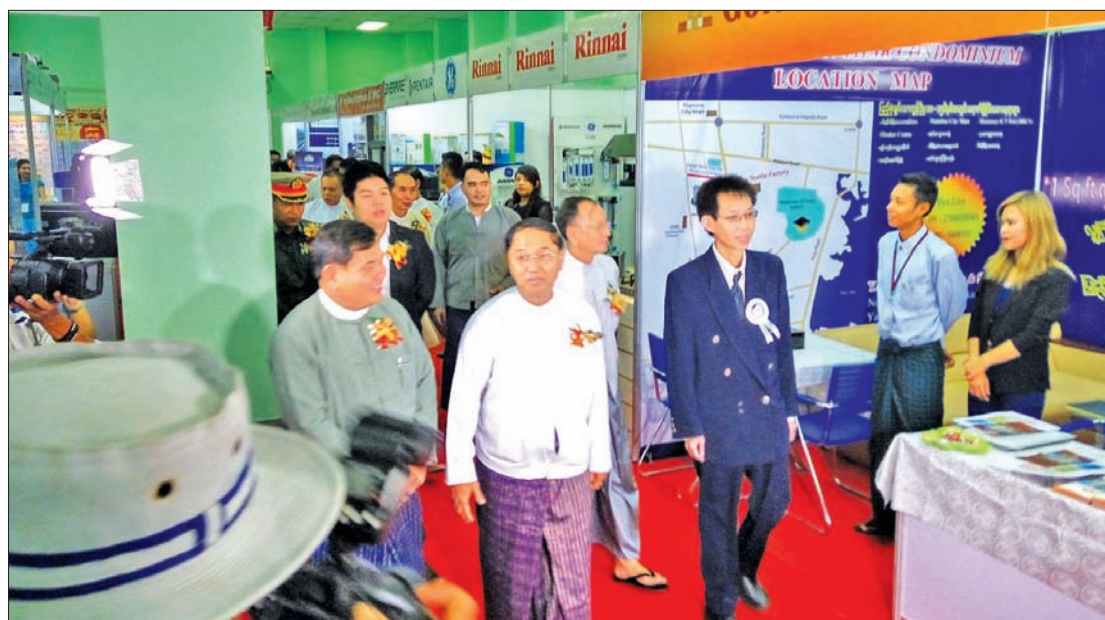
Yangon Region Chief Minister U Myint Swe visits 4 th Housing and Living 2016 Expo at the opening ceremony of the expo.

"THE 4 th Housing and Living 2016" expo ended yesterday at the Tatmadaw Hall on U Wisara Road, Dagon Township.