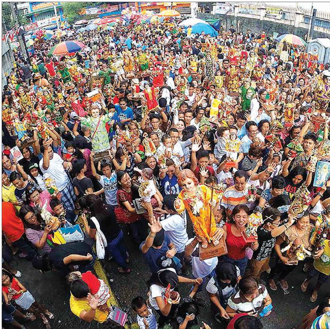
People hold statues of the Santo Nino during the Feast of the Santo Nino in Manila, the Philippines, on 17 January 2016. The Philippines held weekend celebrations to mark the feast day of the Santo Nino, honoring what devotees believe is the miraculous statue of the Holy Child Jesus.