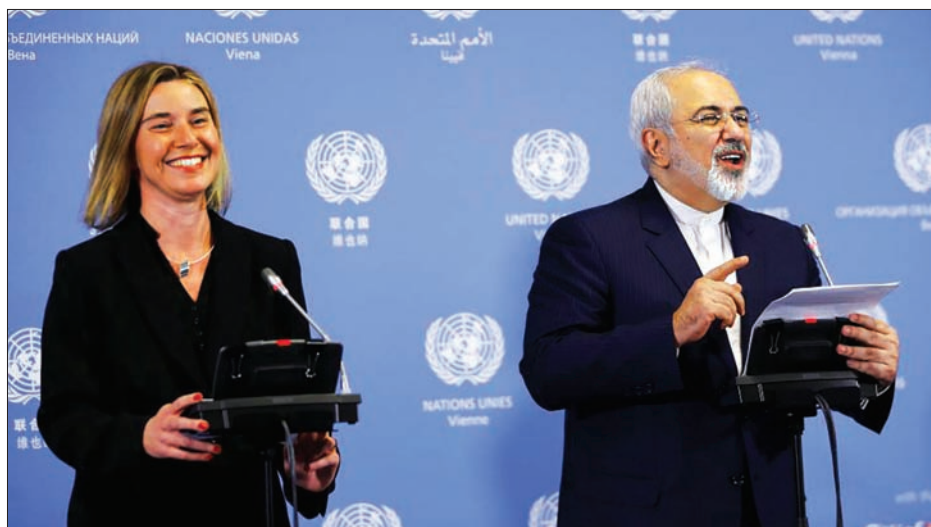
Iranian Foreign Minister Javad Zarif and the High Representative of the European Union for Foreign Affairs and Security Policy Federica Mogherini address a news conference at the United Nations building in Vienna, Austria, on 16 January 2016.

"Iran has carried out all measures required under the (July deal) to enable Implementation Day (of the deal) to occur," the Vienna-based International