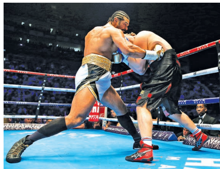
David Haye and Mark de Mori in action at The O2 Arena, London on 16 January 2016.

LONDON — Former world heavyweight champion David Haye, returning after a three-and-a-half year retirement from the ring, knocked out Australian Mark de Mori in the first round of their non-title bout at the O2 Arena on Saturday.