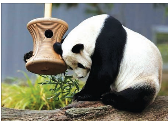
Giant Panda Tian Tian plays with a feeder at the Smithsonian National Zoo in Washington on 16 December 2015. Tian Tian is the father of panda cub Bei Bei.