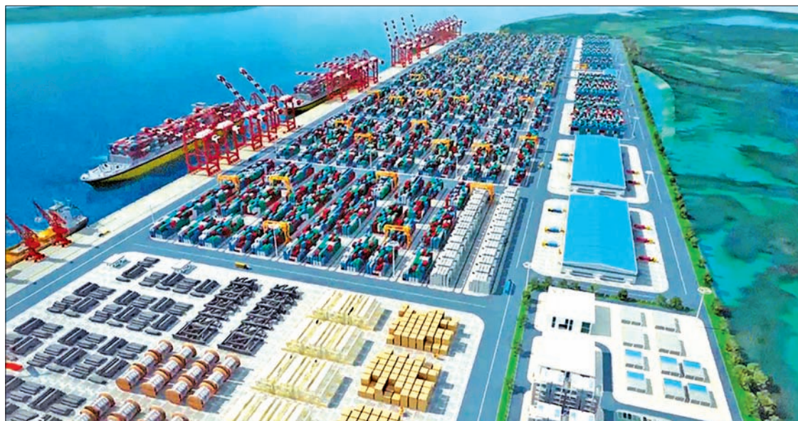
A small-scale model of Kyaukphyu Special Economic Zone.

For social development, the consortium will analyze the projects' social impact, provide training opportunities to local people as well as anti-disaster and emergency rescue service, and set up