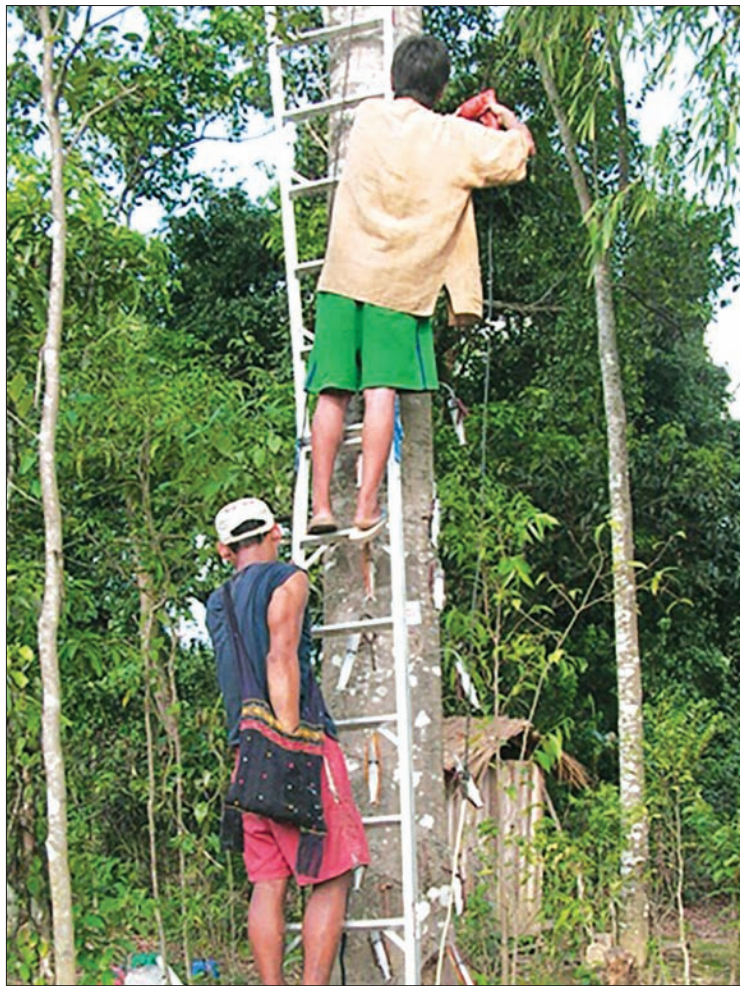
Workers artificially inoculate the tree to produce Agarwood in Myanmar with the use of "Allergic Stress Strain(Ass)".

After the press conference, the department will stage a Music Showcase performed by the Orchestra of the National University of Arts and Culture, while dancers will demonstrate the dances in groups.— Myanmar News Agency