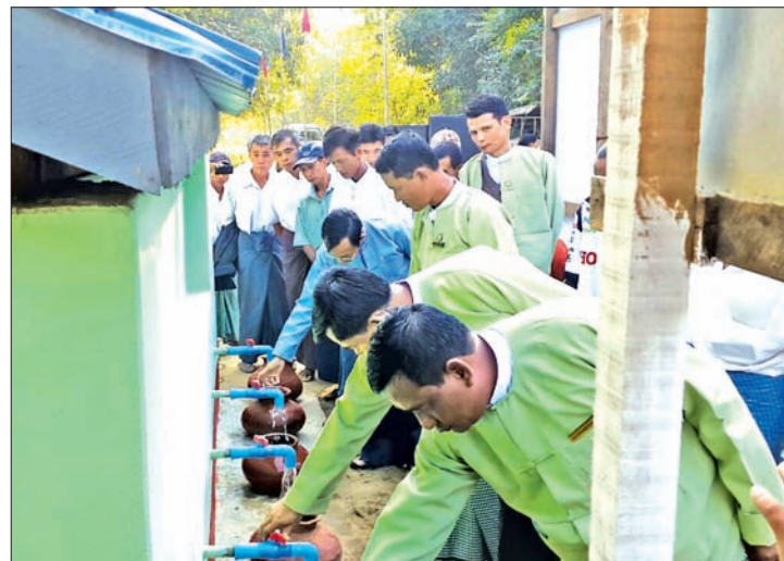
Officials test the water supply facility connected with a tube well at Magyibin village, Chauk Township.

TO mark the 68 th anniversary Independent Day which falls on 4 th January, a tube well commissioned into service at Magyibin village, Chauk Township, Magway Region on 2 January.