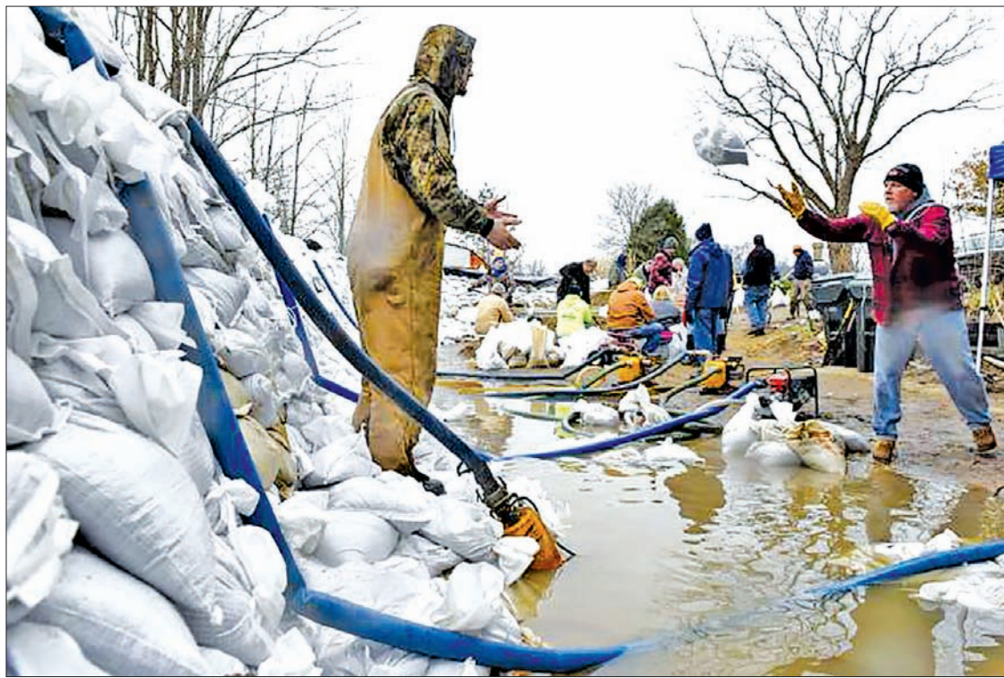
Volunteers set up a wall of sandbags and series of pumps to create a barricade preventing the rising water from flooding a home after several days of heavy rain in Arnold, Missouri, on 30 December 2015.

Workers in southwestern Tennessee prepared sandbags in hopes of limiting damage from the Mississippi when it crests at Memphis next week, state emergency management officials said.—Reuters