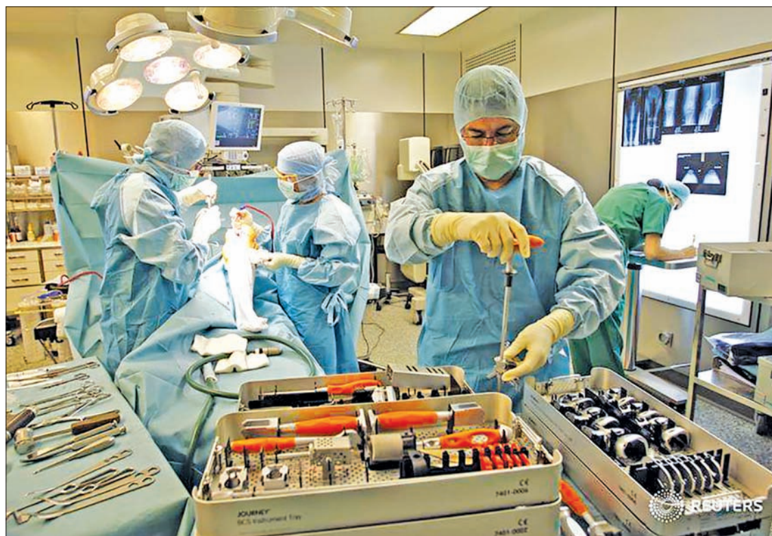
Surgeons perform an operation at a hospital in France in 2008.

Patients who will be awake during surgery may want to use headphones so they can listen to their preferred music to reduce anxiety, not the music chosen by the healthcare team members, Chlan said. —Reuters