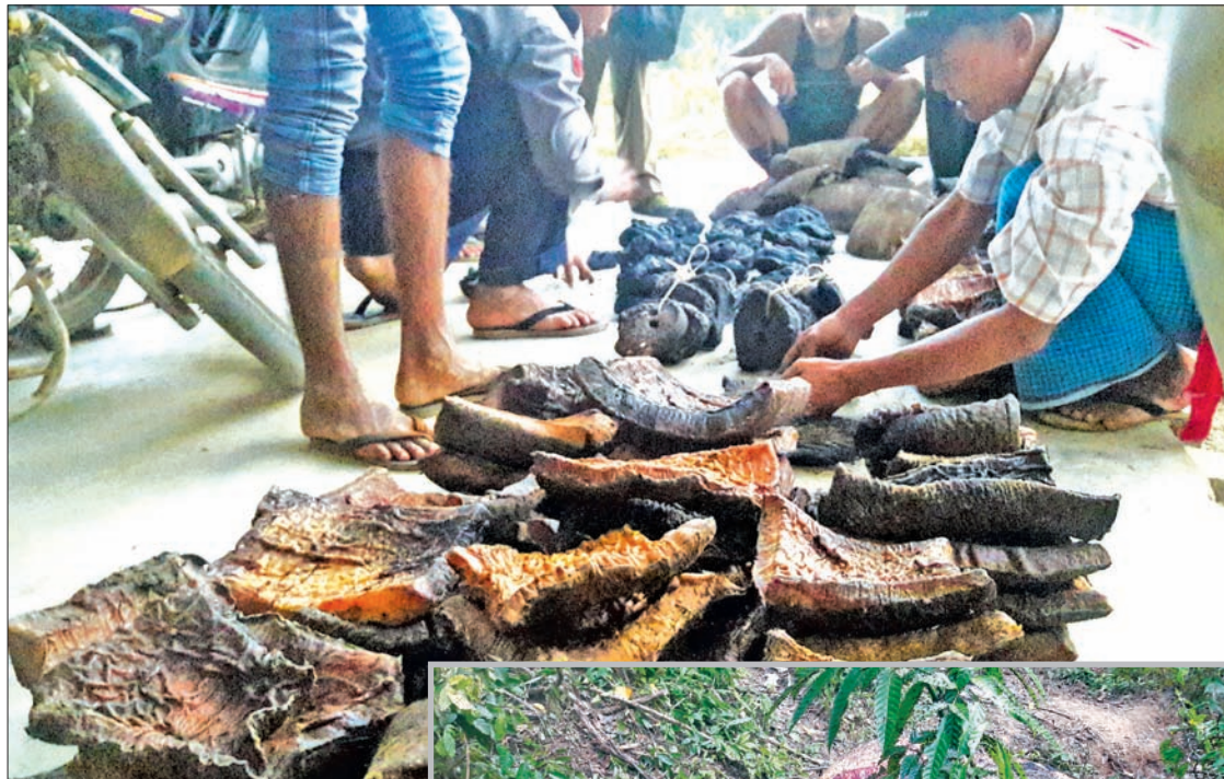
Police evaluates parts of an elephant seized from poachers in Chaungtha Forest Reserve in Patheingyi on 1st January, 2016.

POLICE arrested two people on suspicion of poaching an elephant in the Chaungtha Forest Reserve in Patheingyi on 1 January.