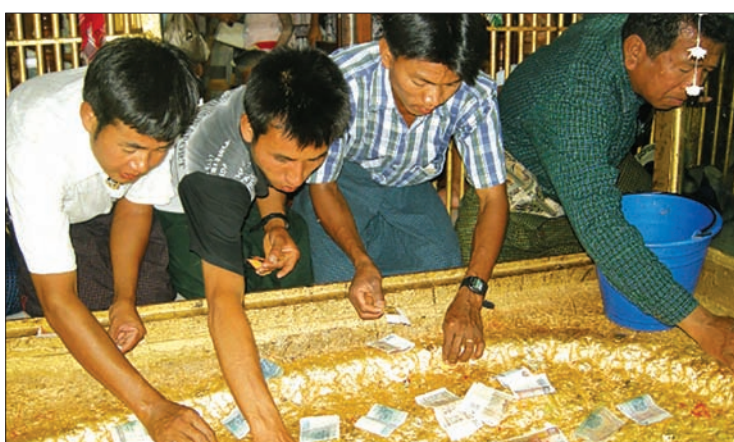
Pilgrims put gold foils on the Buddha's foot print.

Visitors are also welcome at the site of Beikthano, another ancient Pyu city-state, located in Taungdwingyi Township, 40 miles from Magway.— Kay Khaing