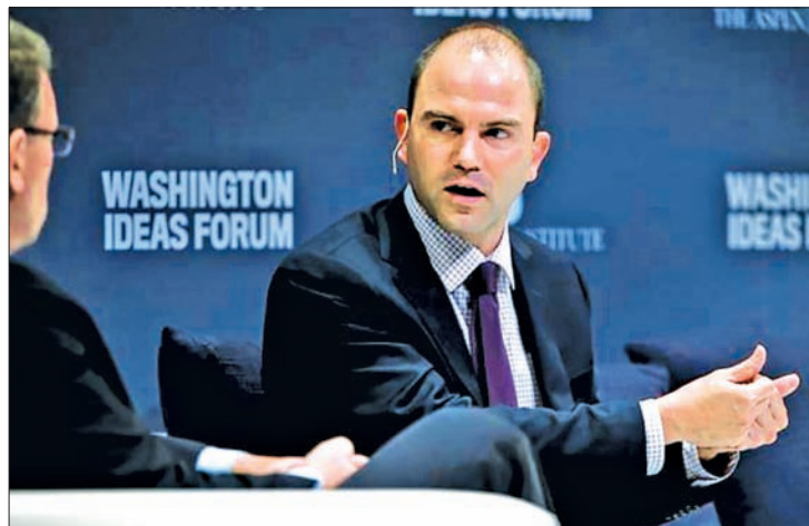
Deputy US National Security Advisor Ben Rhodes participates in the Washington Ideas Forum in Washington, on 30 September 2015.