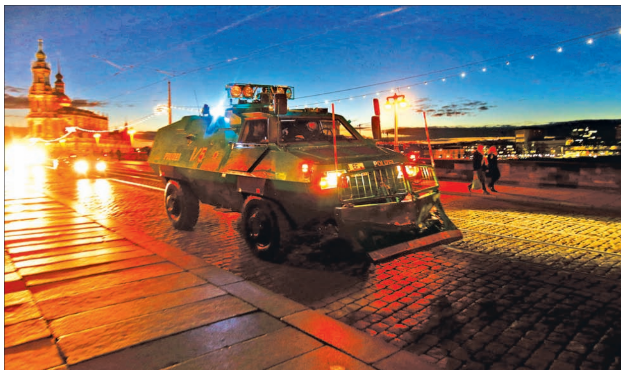
A car of riot police drives over Augustus Bridge ahead of expected demonstration by the supporters of the anti-immigration right-wing movement PEGIDA (Patriotic Europeans Against the Islamisation of the West) in Dresden, Germany, on 21 December 2015.

It could be fatal for Merkel, officials in Berlin acknowledge in private, if