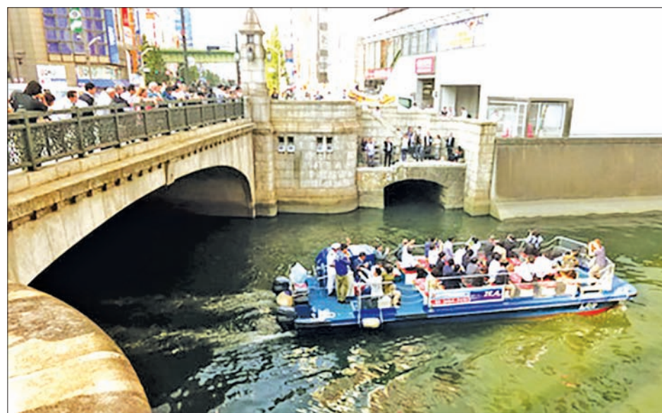
A ferry service between Tokyo's Haneda airport and the Akihabara electronics district for tourists from abroad and other areas of Japan, conducted by the land ministry on a trial basis in September 2015.

The official said the regular ferry service to and from Haneda airport is expected to "benefit passengers arriving from abroad and other parts of Japan because it will increase their transportation choices.—Kyodo News