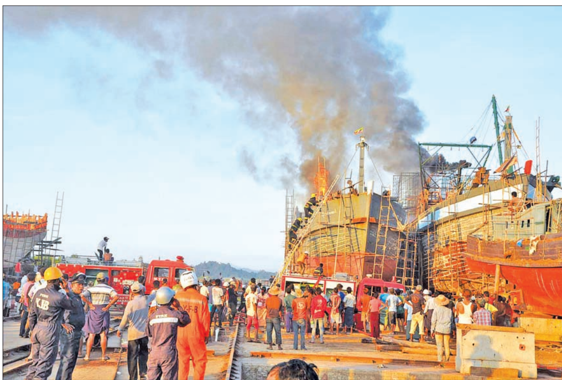
Flames have engulfed two fishing ships.

A fire started from the sparkle has destroyed two ships in Myeik town, Taninthayi Division, on 31 December.