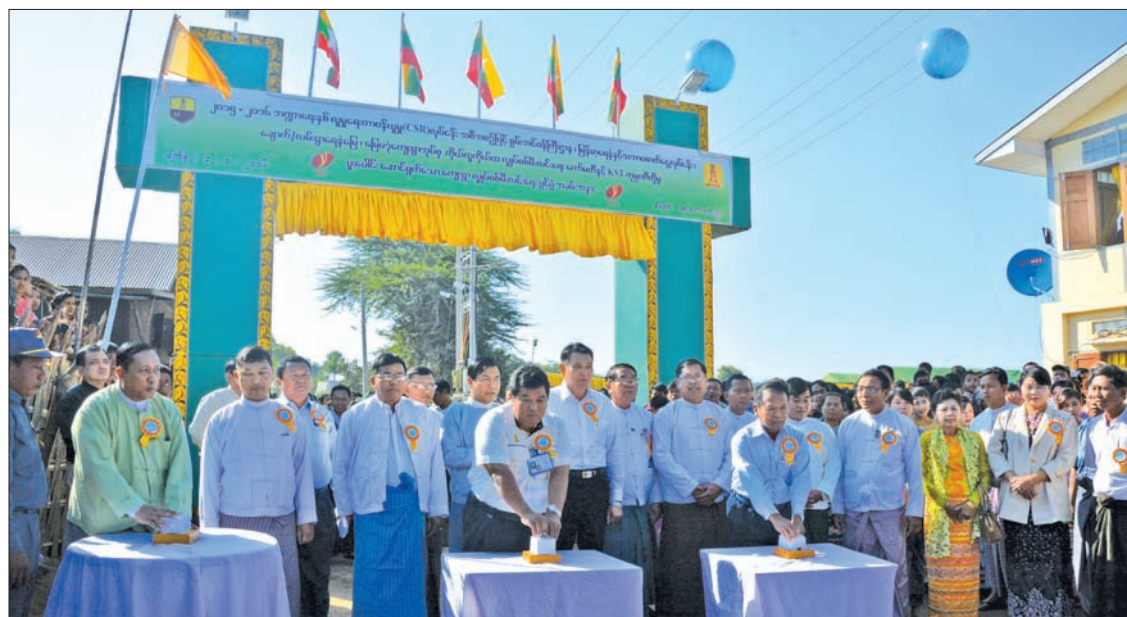
Officials formally launch power supply facility at Sudaw Village in Chauk Township.

Fire bridges across the country are on full alert ahead of the summer season which starts in March. According to records, the country see heavy fire outbreaks in the summer season.— U Sein Win (Dawei)