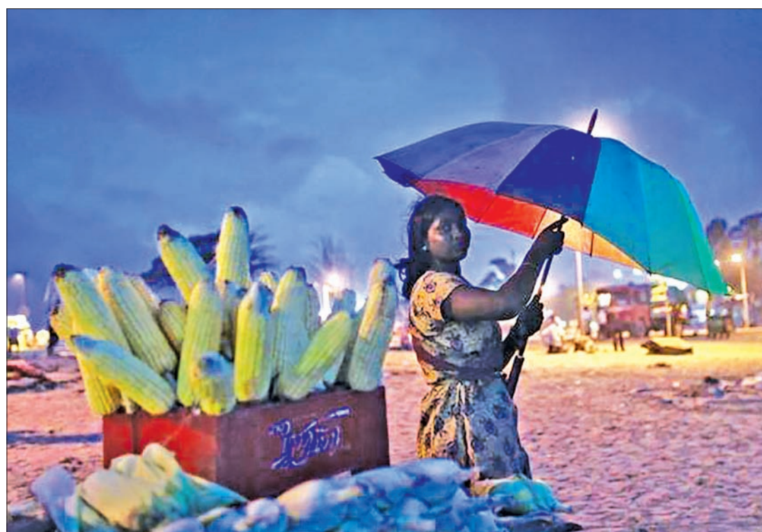
A woman selling grilled corn takes shelter under an umbrella as it rains on a beach in Mumbai in 2012.

The country's absence from the export market is already helping rivals grab Asian market share