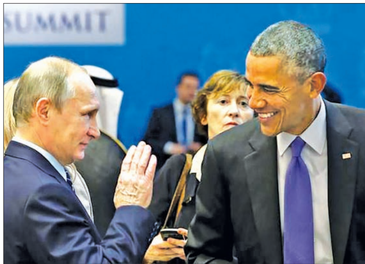
US President Barack Obama chats with Russia's President Vladimir Putin prior to a working session at the Group of 20 (G20) leaders summit in the Mediterranean resort city of Antalya, Turkey, on 16 November 2015.

Relations between Russia and the West reached a low after Russian forces annexed the