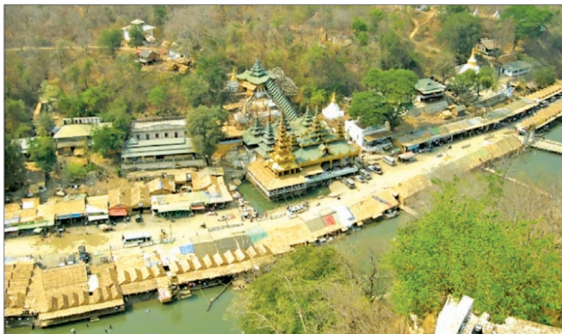
Make-shift tents are seen besides the Mann Creek during Shwe Set Taw Pagoda festival.