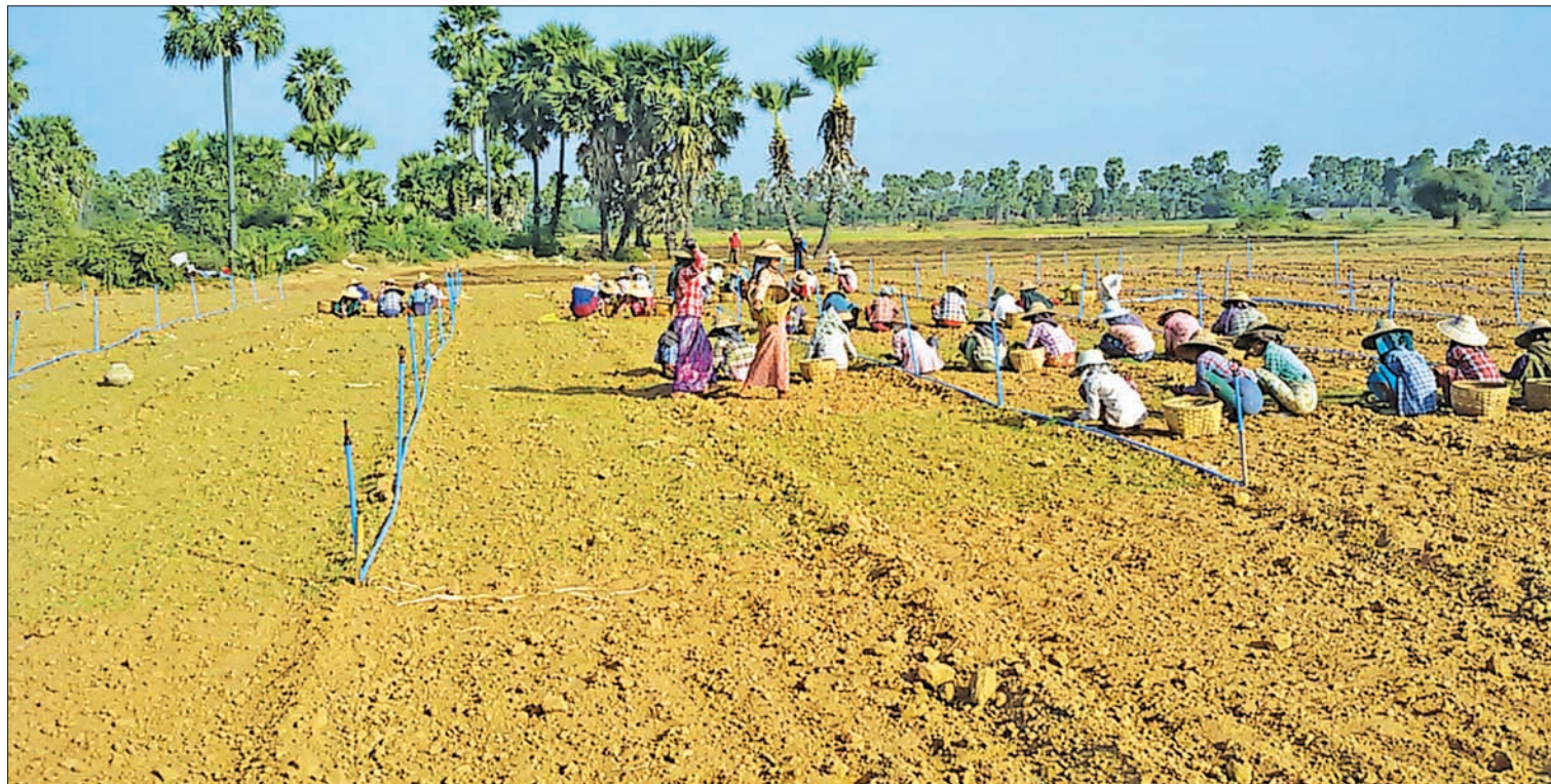
Onion growers in Taungtha work in the farmland.

ONION growers in Taungtha Township have begun using a modernised water spraying system using pipes in order to boost productivity.