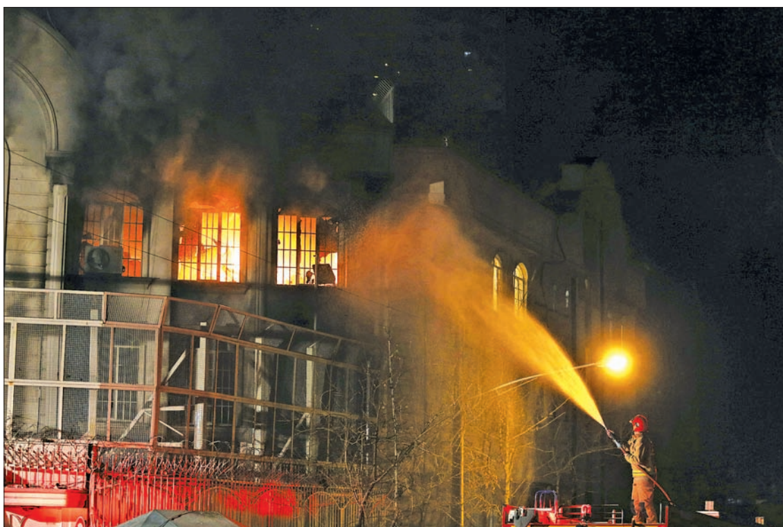
Flames rise from Saudi Arabia's embassy during a demonstration in Tehran on 2 January 2016.

Despite the regional focus on Nimr, the executions seemed most-