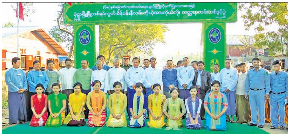
Dignitaries pose for photo session at a ceremony to open an asphalt road in Monywa.

Government and the Monywa Township Development Affairs Department also contributed tar and construction materials to the road upgrade projects. The two roads were opened in the presence of the Sagaing Region Chief Minister and members of the regional government and regional parliament.— Pho Chan