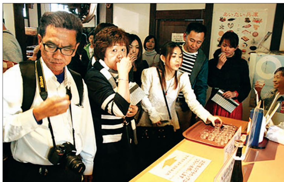
Foreign tourists tasting Japanese sake at the Hakutsuru Sake Brewery Museum, operated by Hakutsuru Sake Brewing Co. in Kobe.

KOBE — With demand for sake leveling off in Japan, brewers in the Nada area of Kobe, Hyogo Prefecture, are pinning their hopes on Asian tourists flocking to the major sake production district.