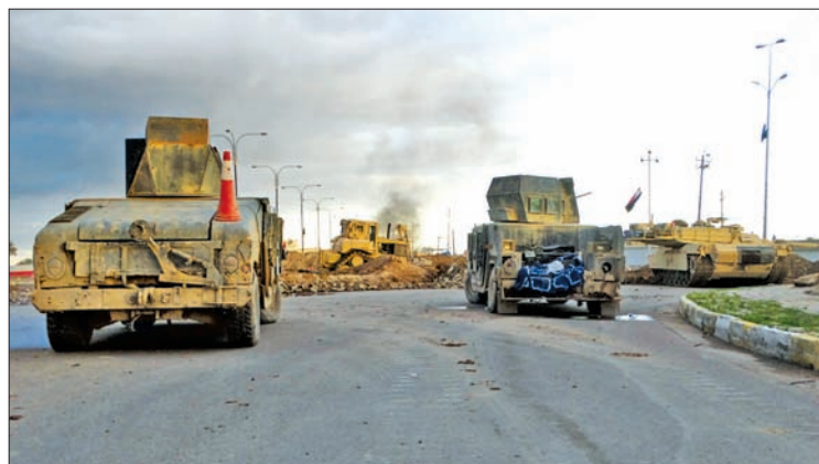
Iraqi security forces' vehicles are seen in the city of Ramadi, on 2 January 2016.

The military responded, killing at least 42 militants including the bombers, the ministry said.—Reuters